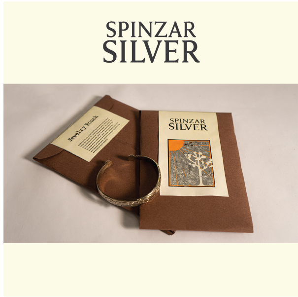
Figure 7: SPINZAR Silver Packaging