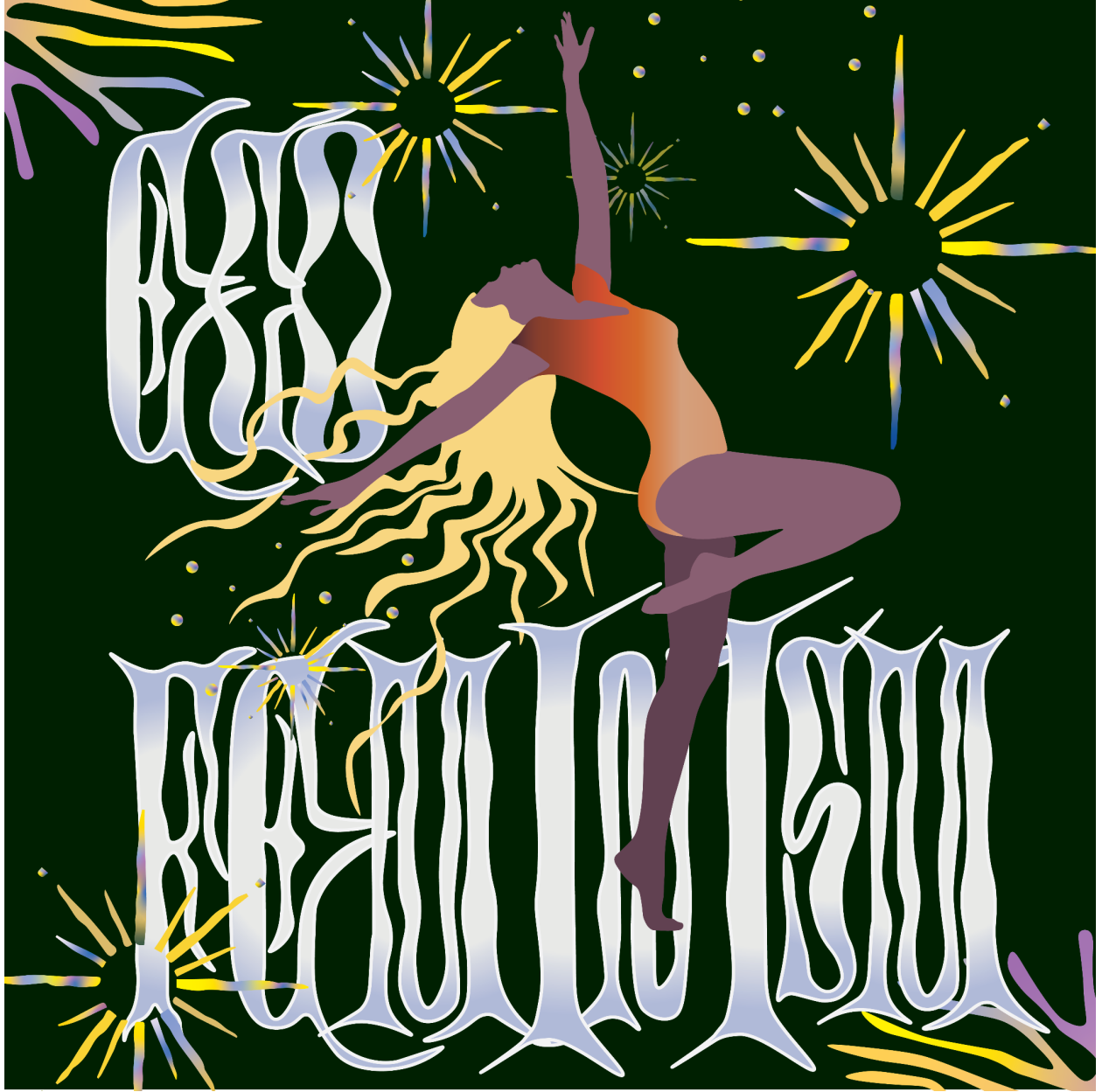
Figure 6: Eco Feminism