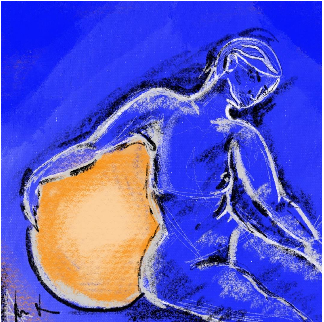
Figure 5: Woman in Blue