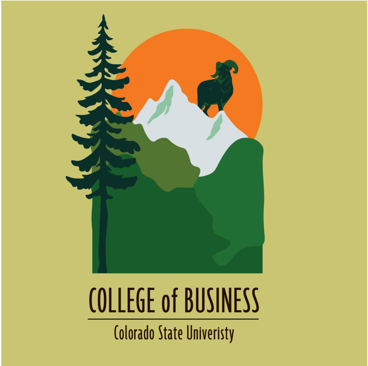
Figure 2: College of Business T-Shirt Design