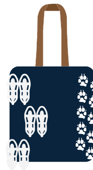
Figure 1: Yardsale x Save Our Snow