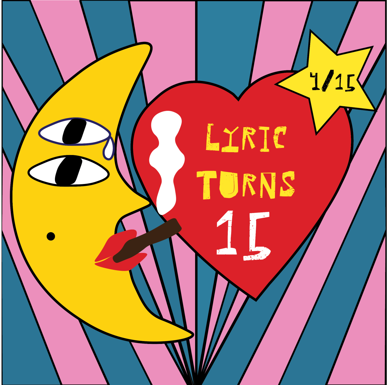
Figure 4: Lyric Turns 15