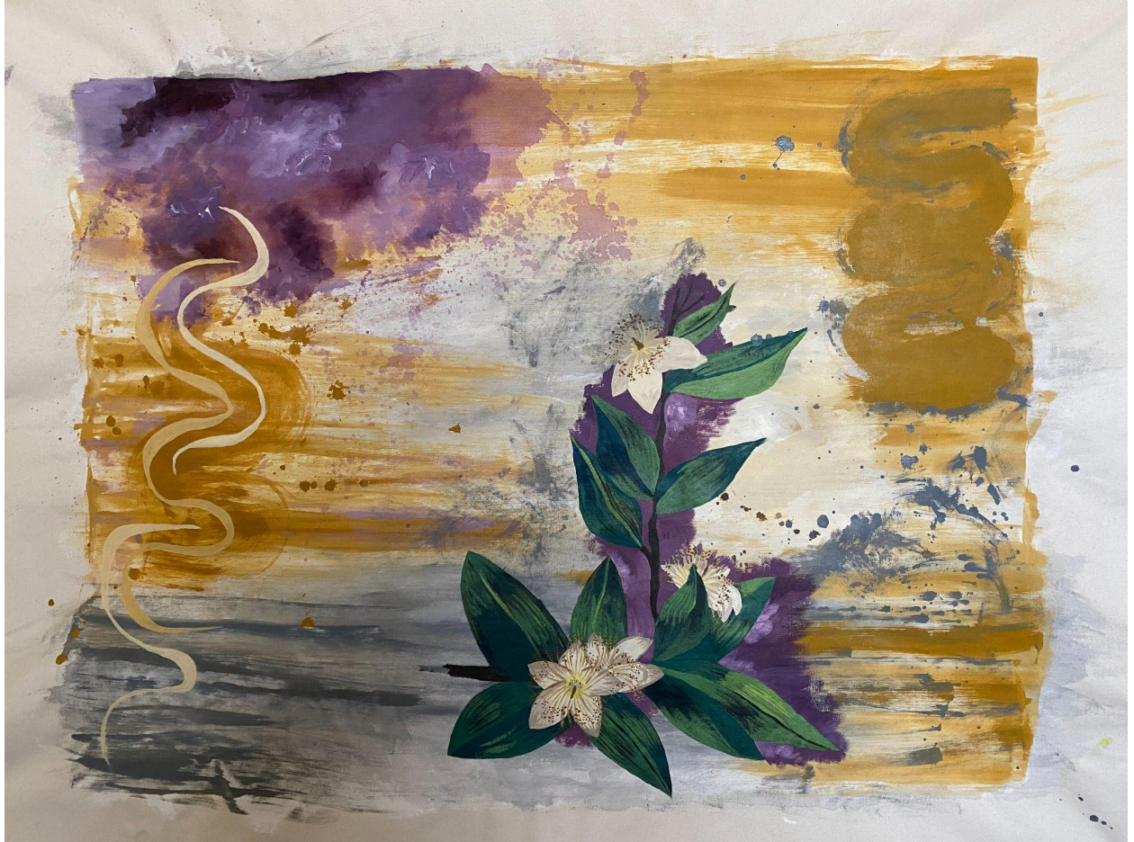
Figure 8: The Big Question