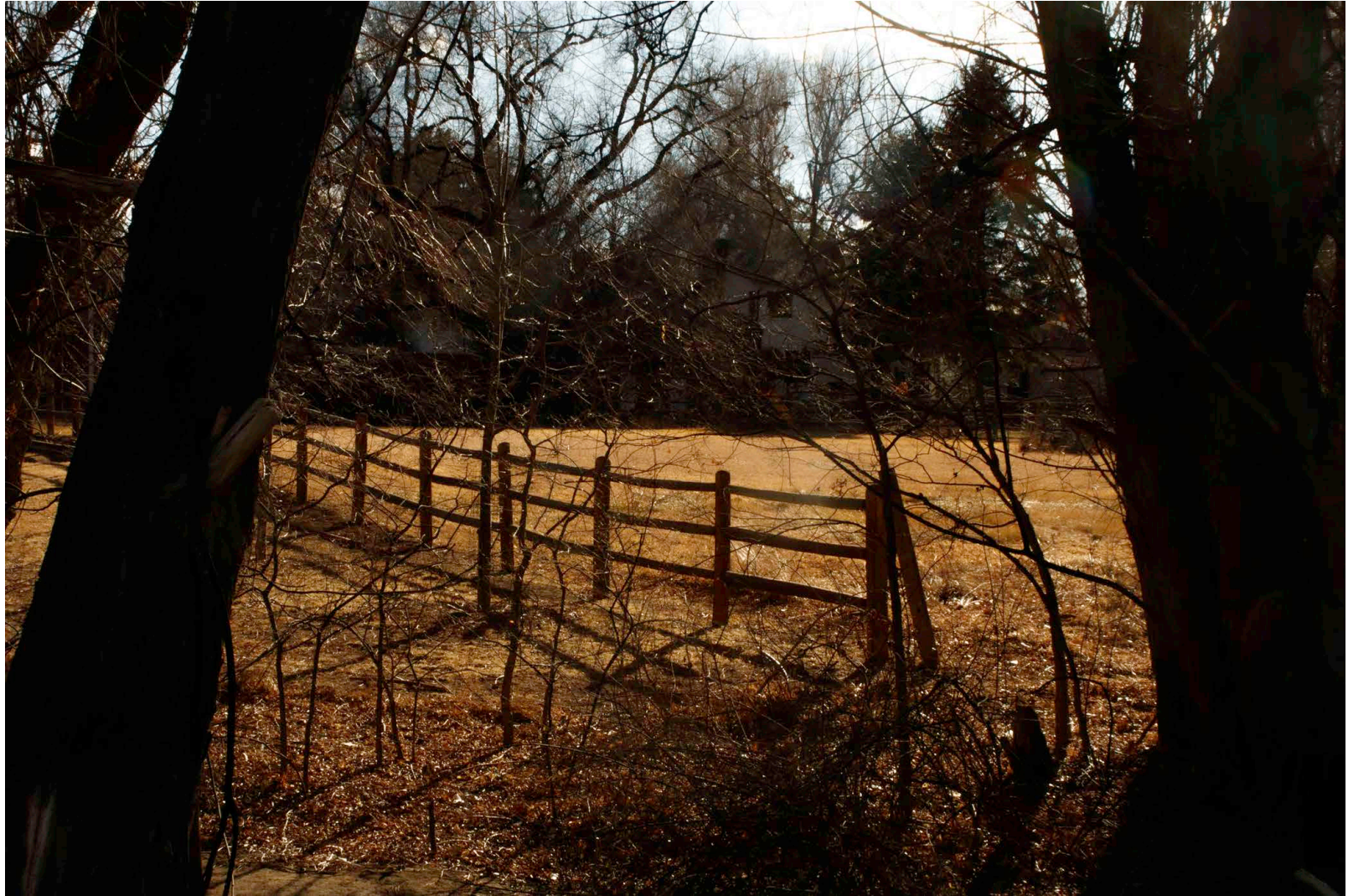
Figure 15: Spring Creek