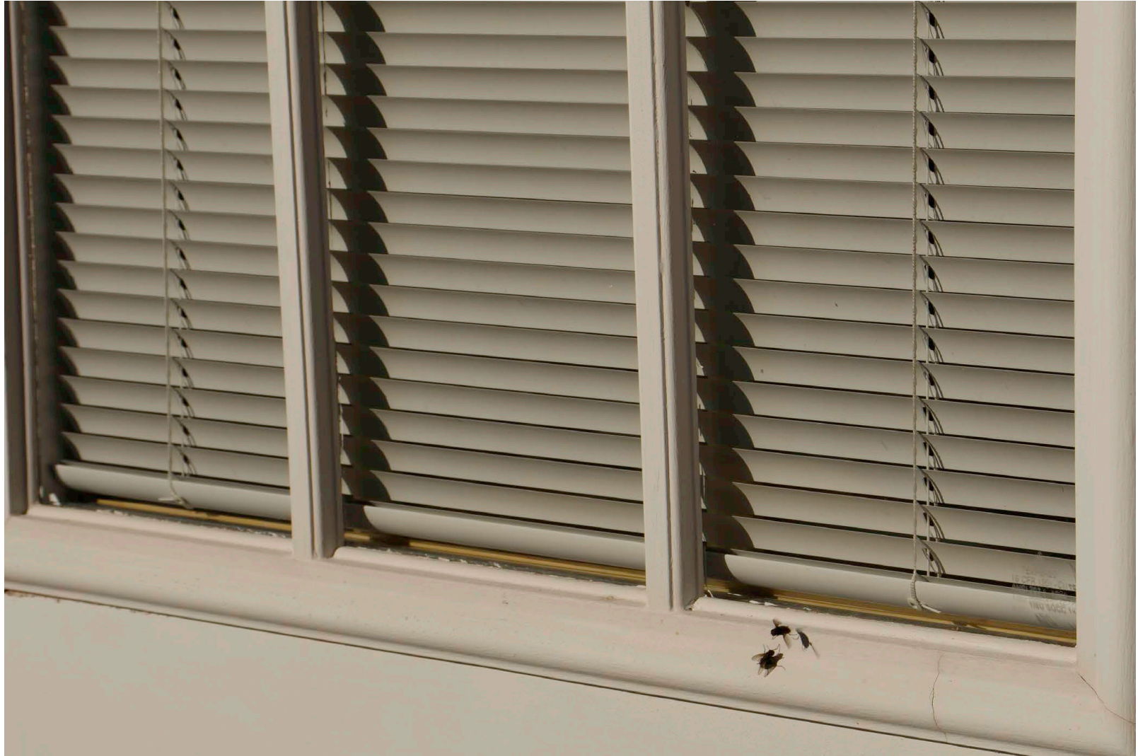
Figure 7: Flies