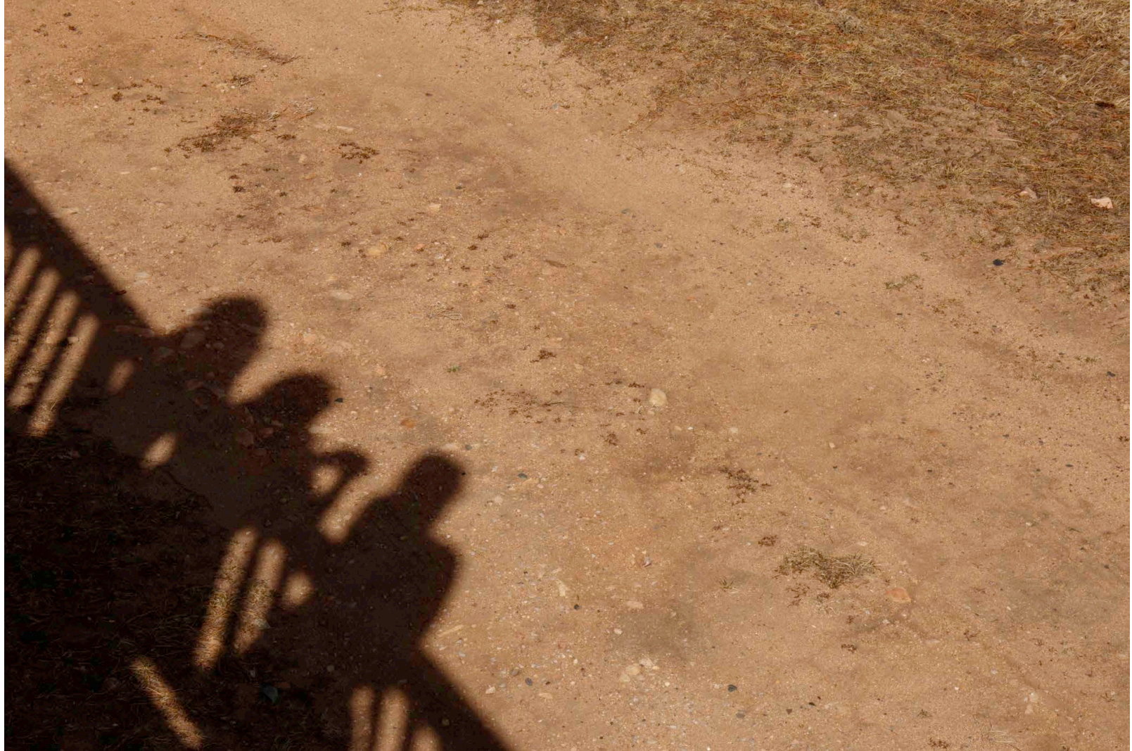
Figure 29: Saying Goodbye