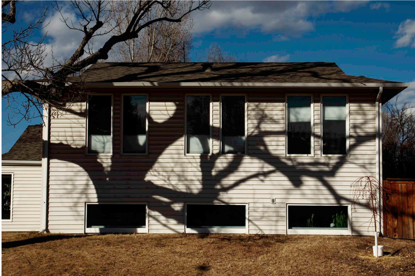
Figure 10: Crawl