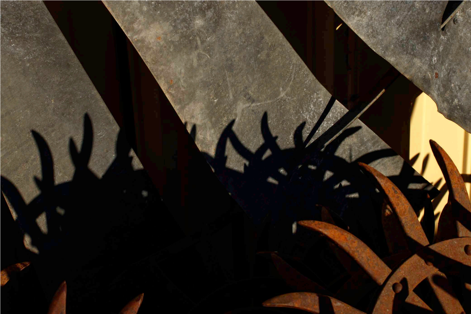
Figure 19: Tall Grass