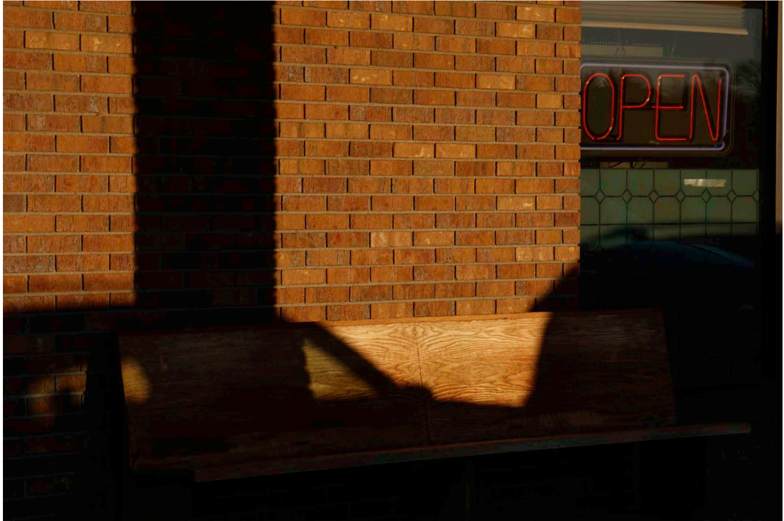
Figure 21: Open