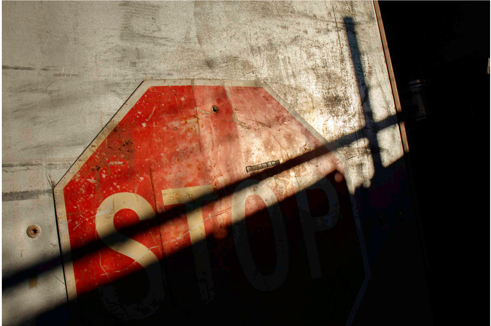
Figure 18: Stop