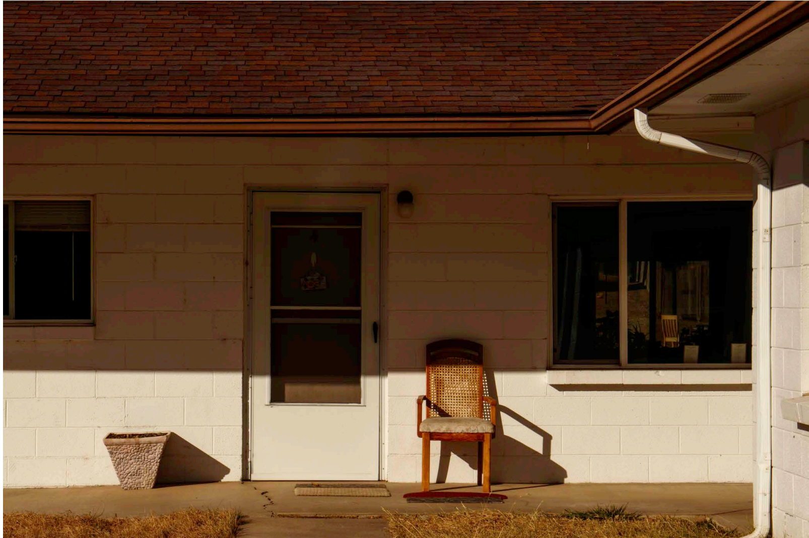
Figure 24: Half Full