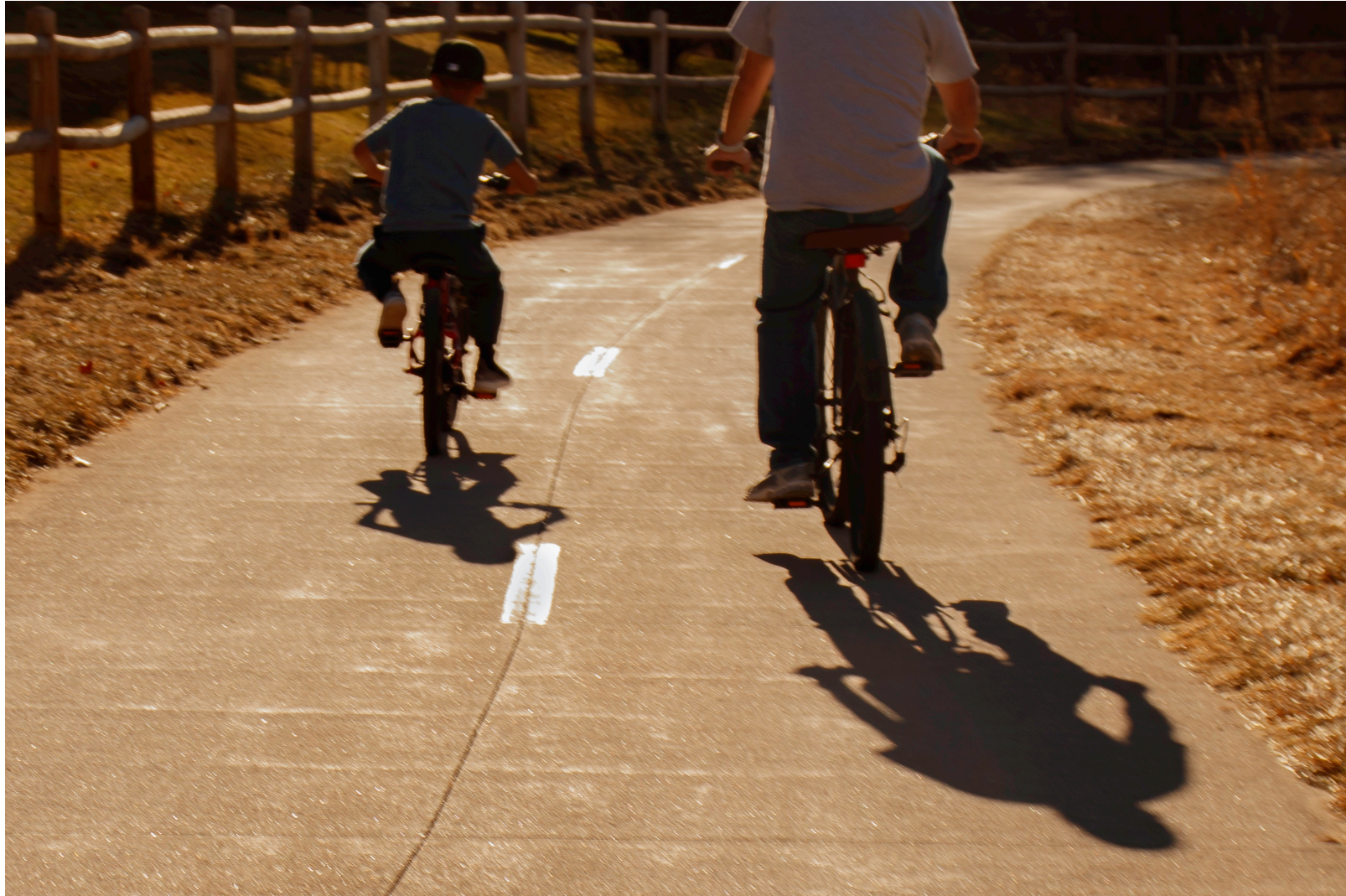
Figure 13: Bike Path