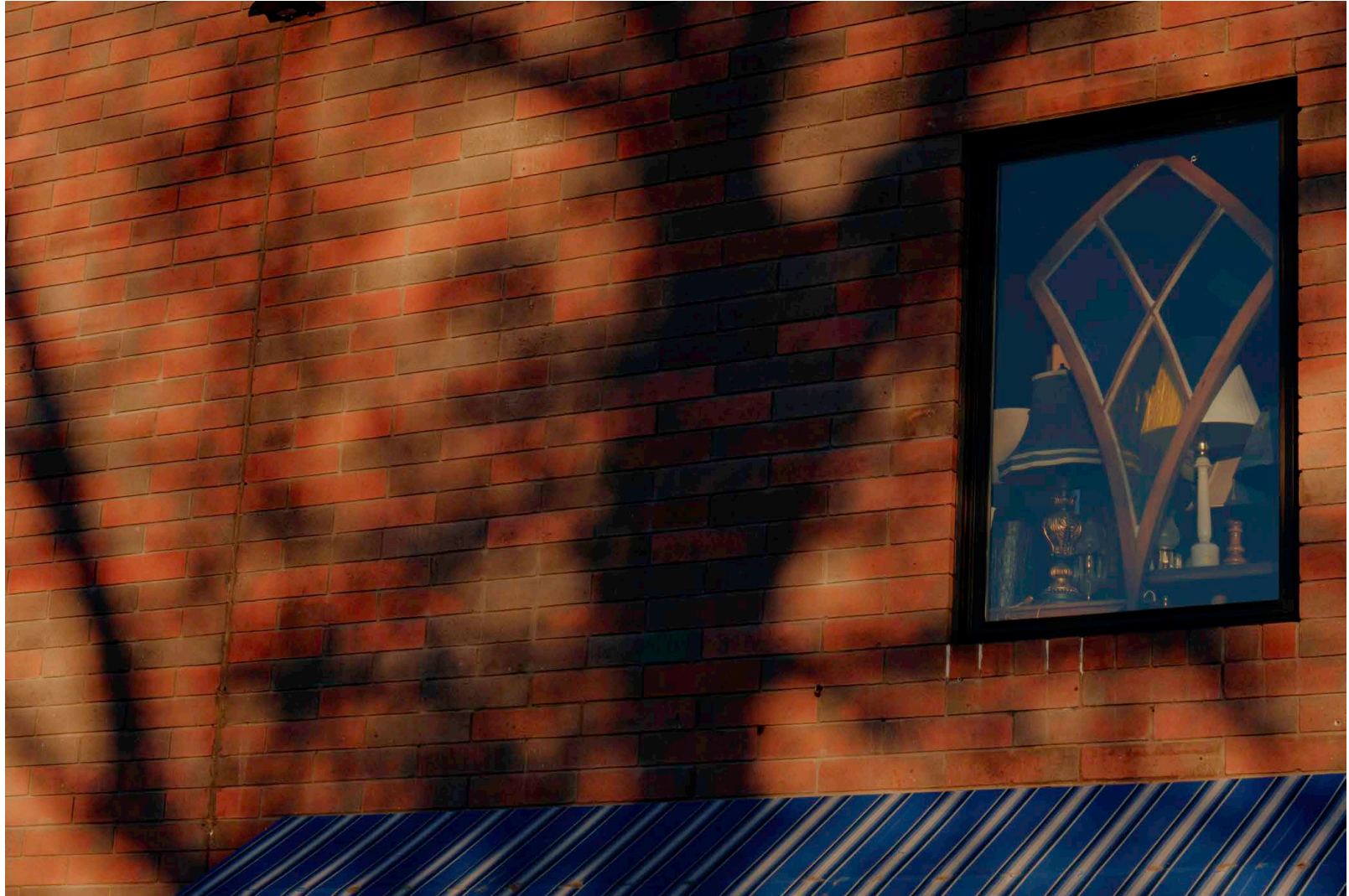
Figure 6: The Window