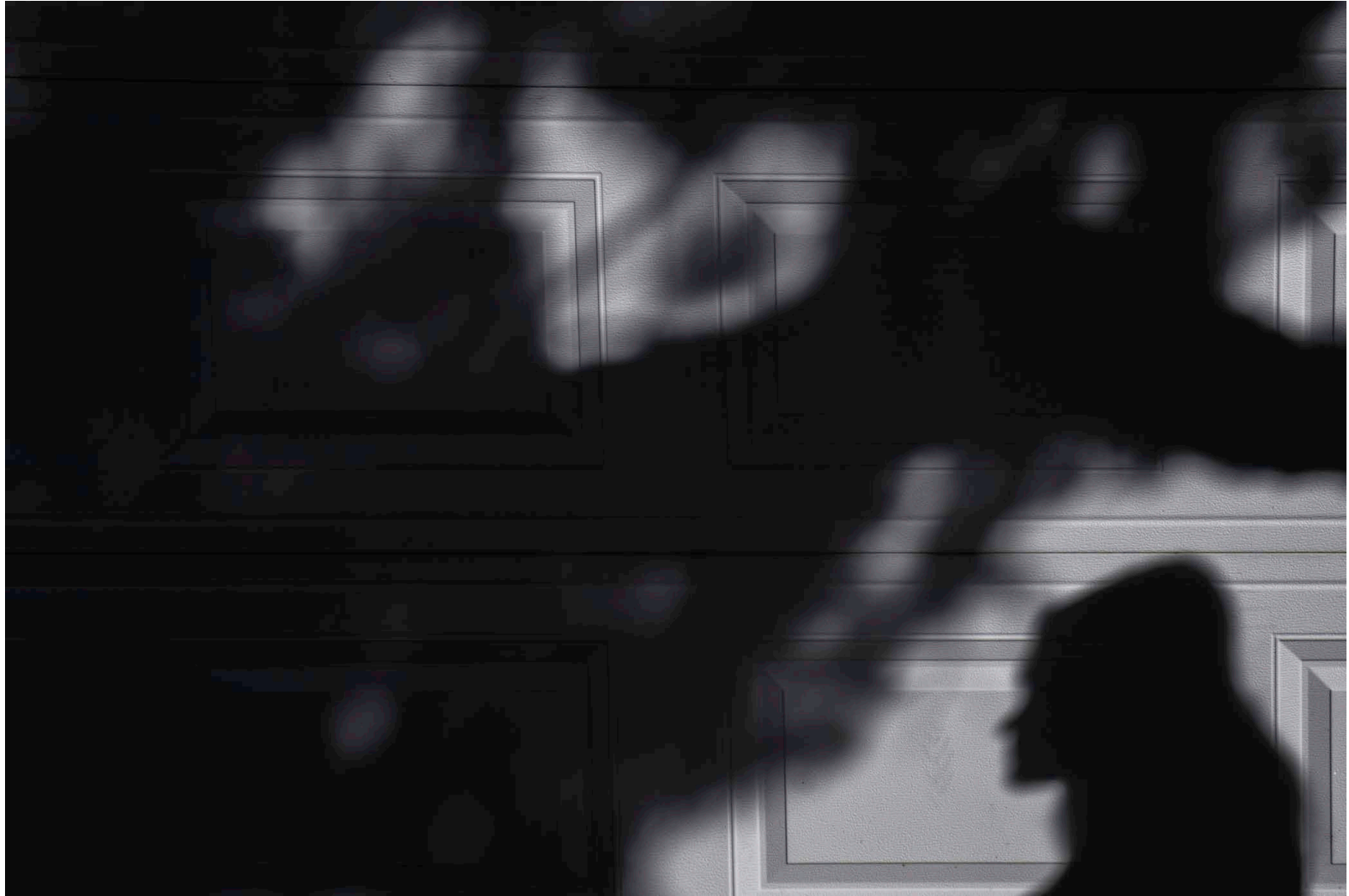
Figure 22: Ash