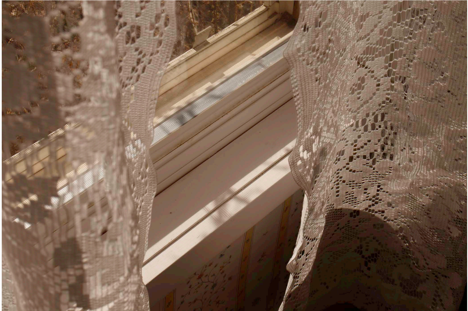
Figure 28: Curtains