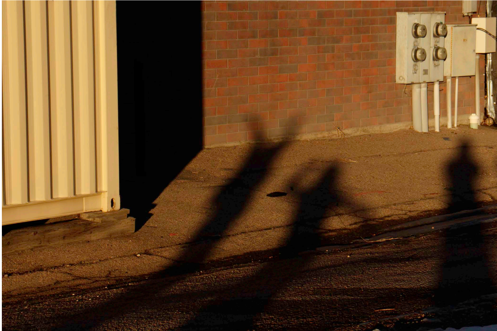
Figure 20: Saying Hello