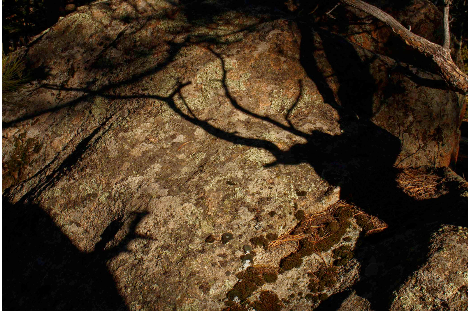
Figure 14: Branches