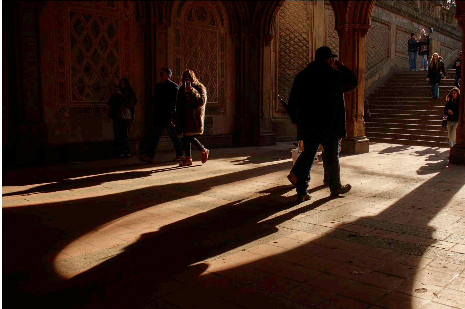
Figure 2: Central Park