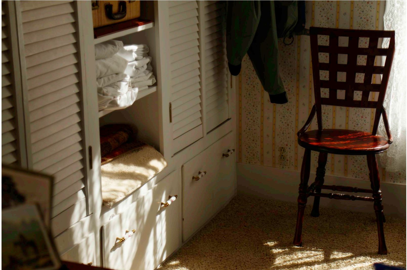
Figure 5: The Soft Place