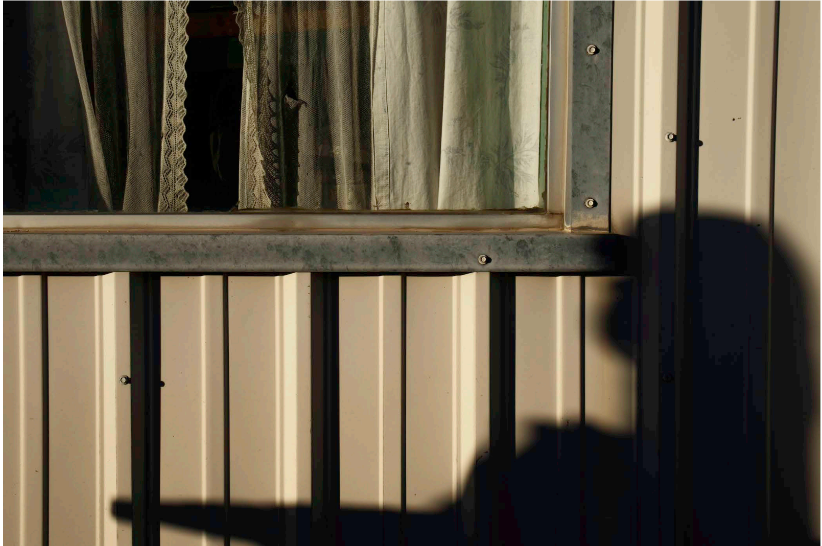
Figure 31: The Portch