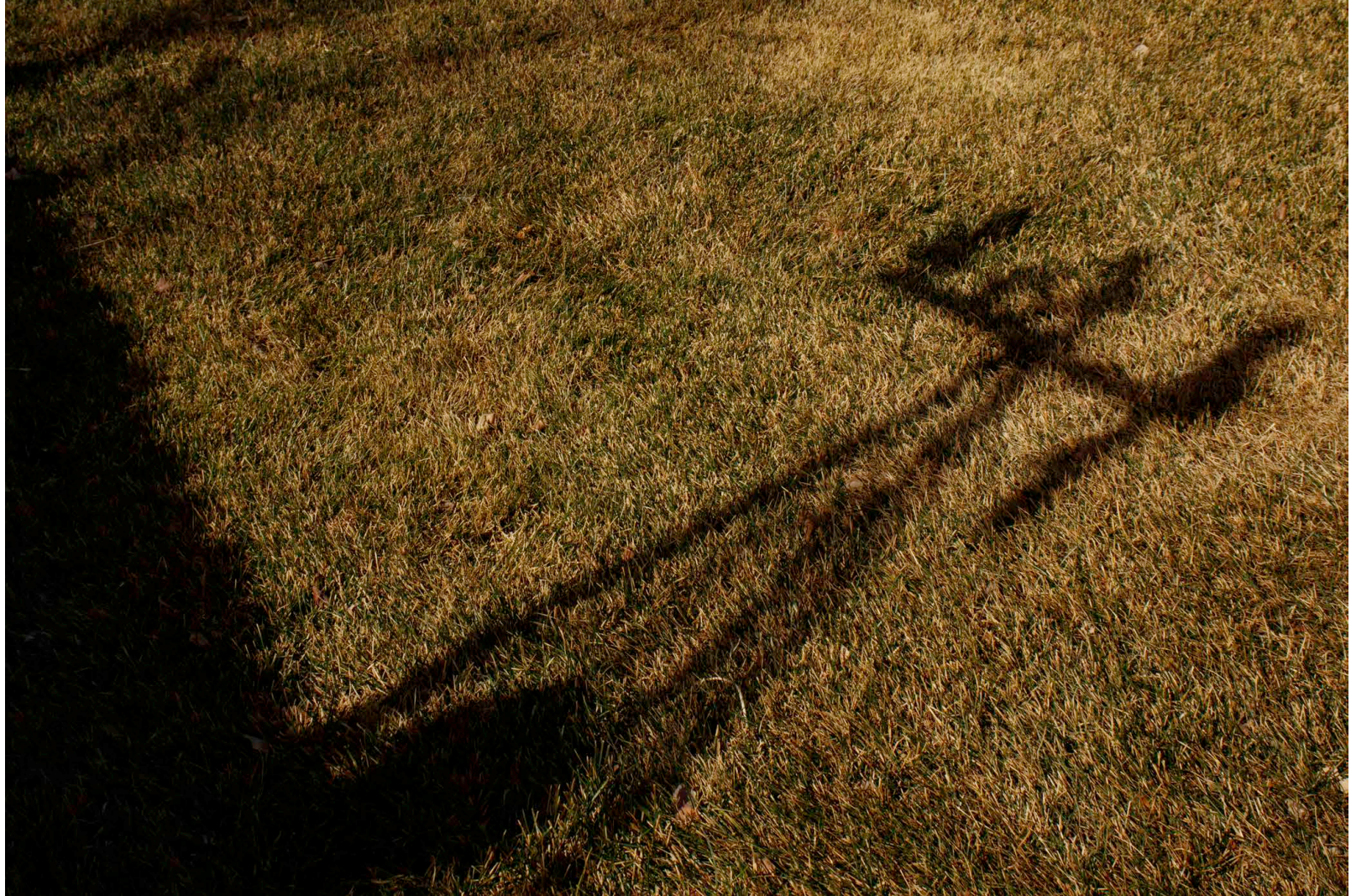
Figure 26: Windmill