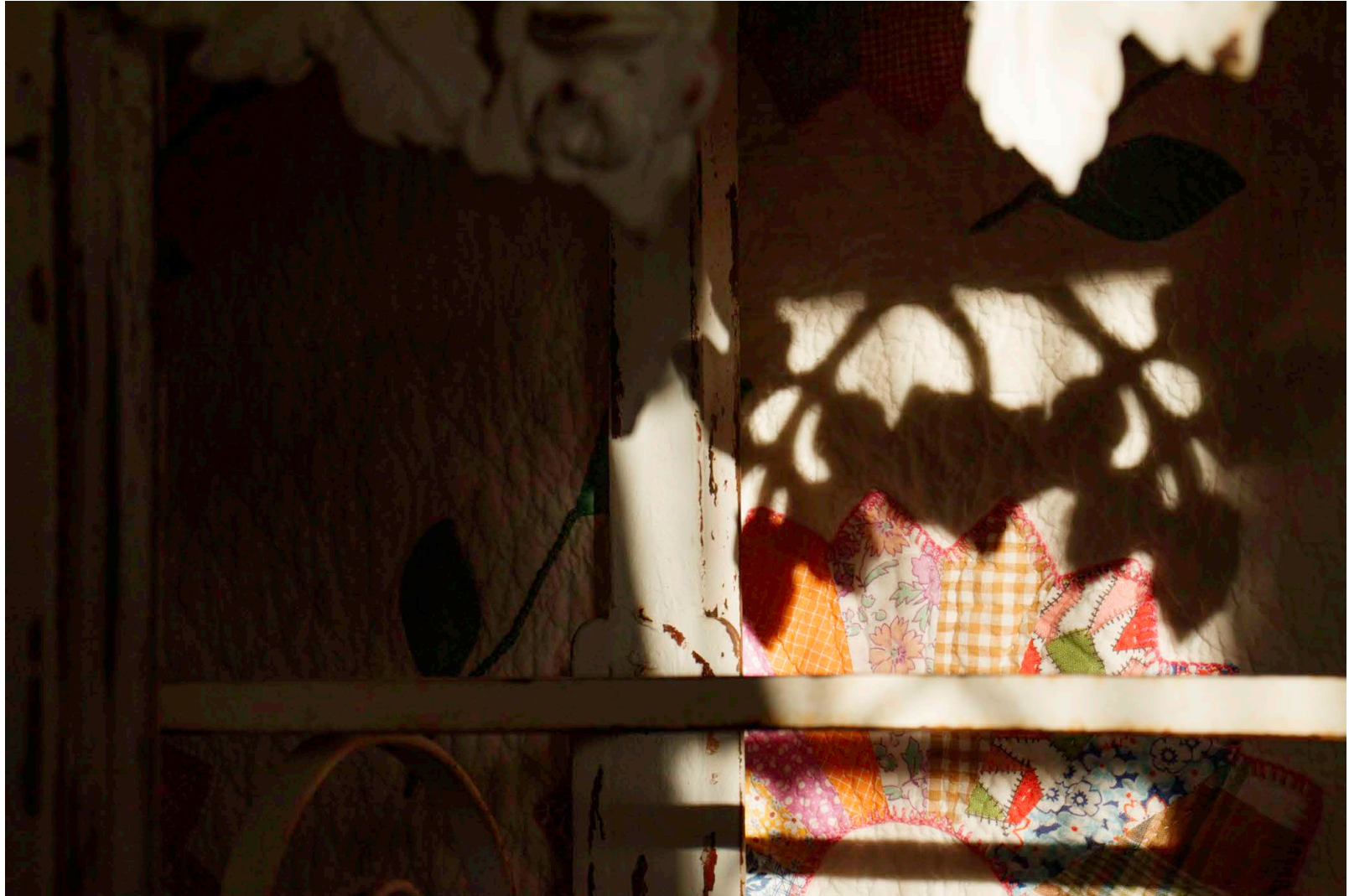
Figure 16: Quilted