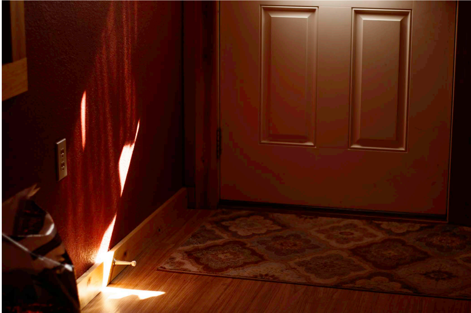
Figure 27: Next Door