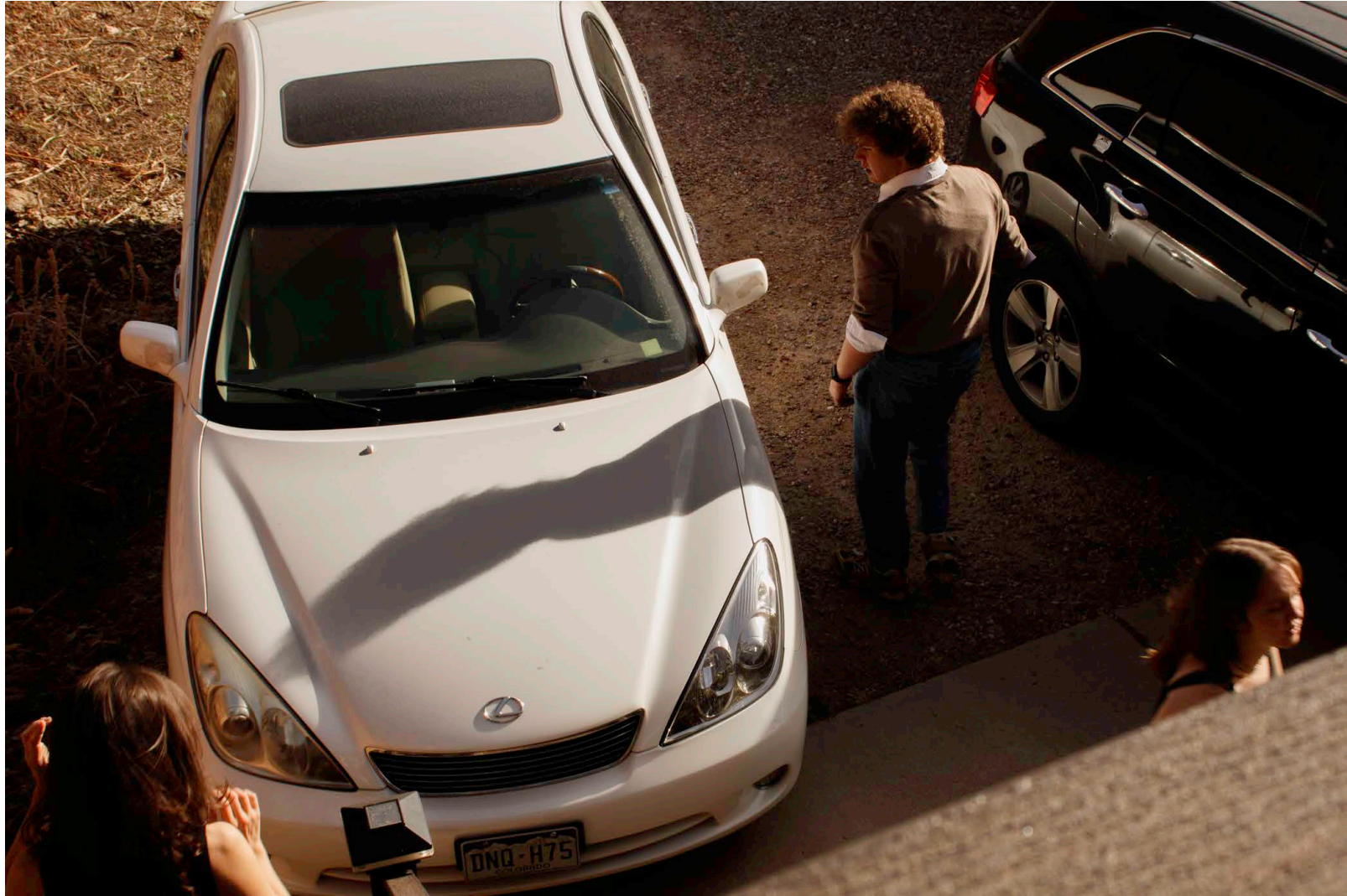
Figure 9: The Band