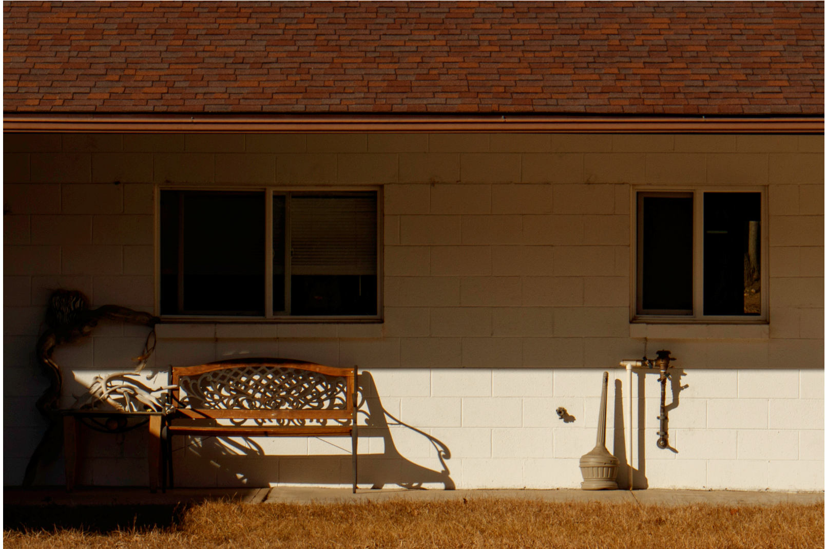
Figure 23: Half Empty