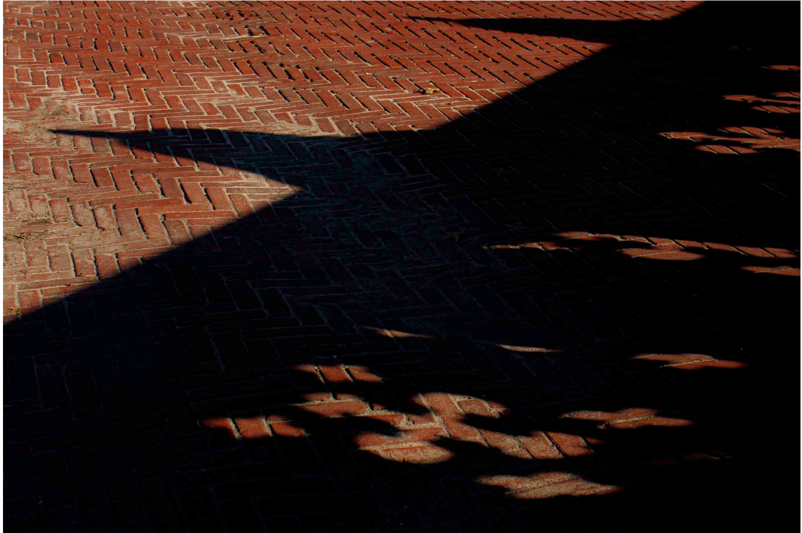
Figure 8: Manhattan