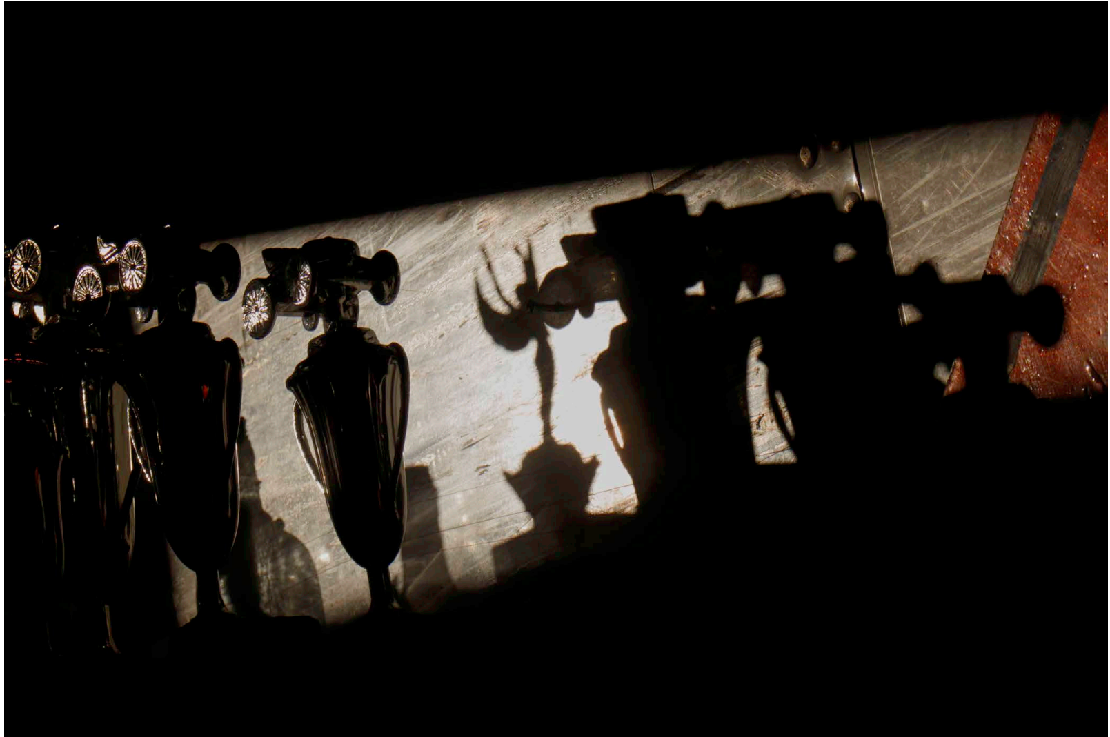
Figure 12: Gold Star