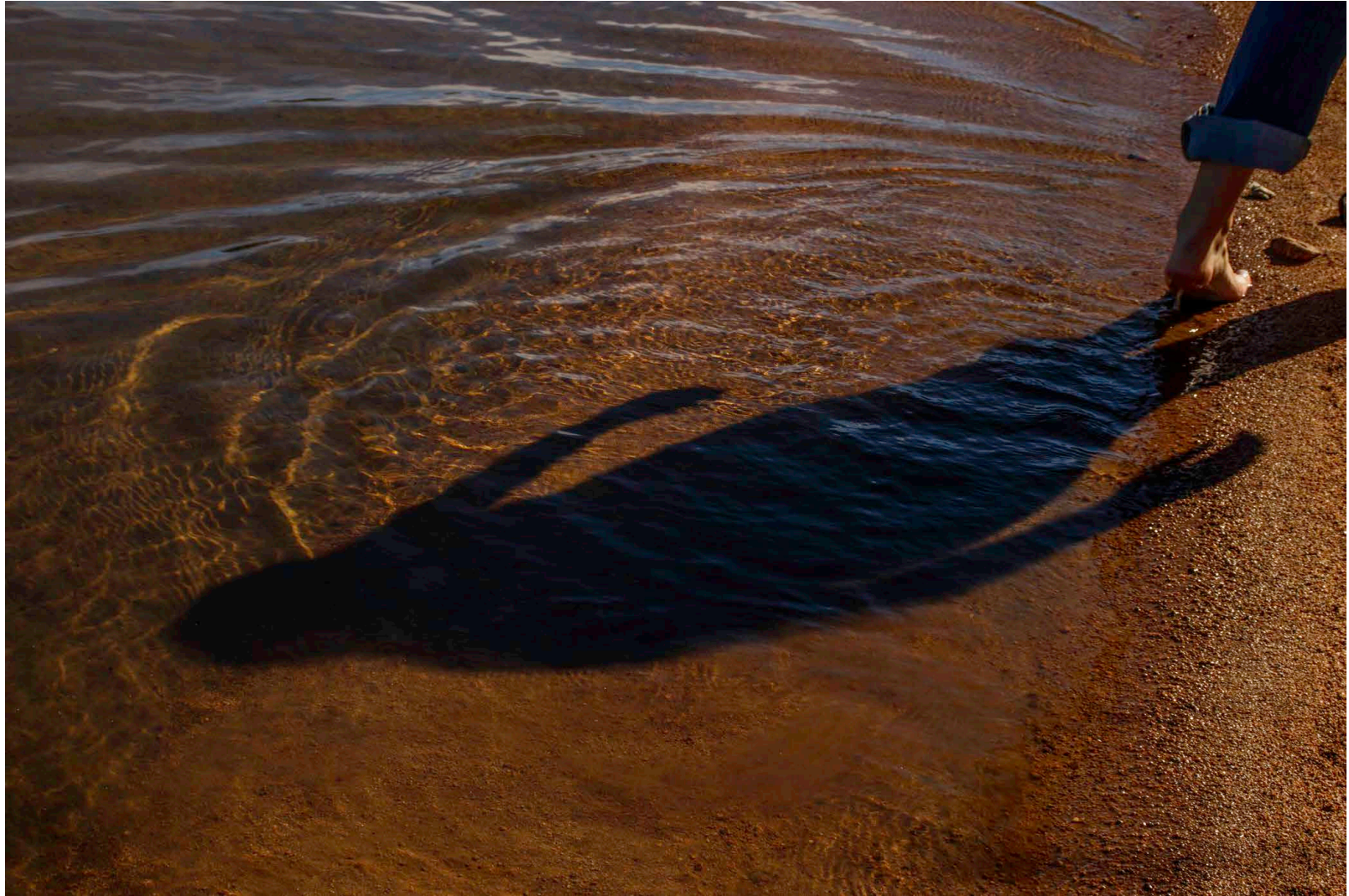
Figure 30: A Splash