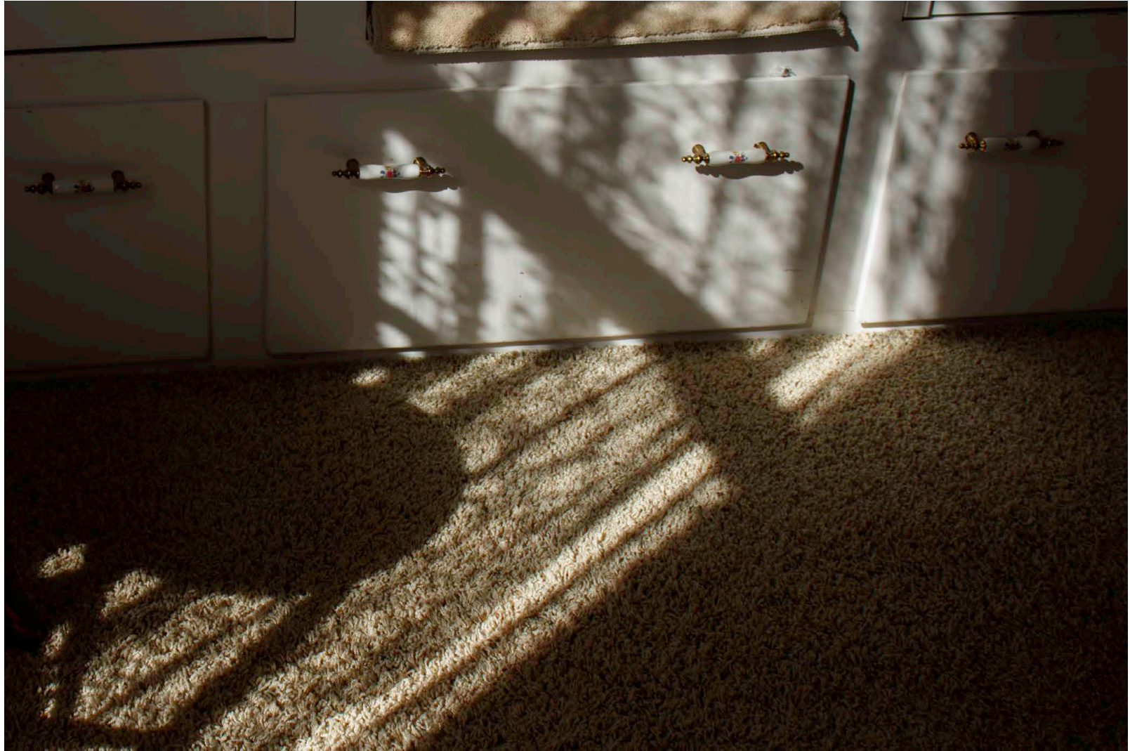
Figure 33: Lacy