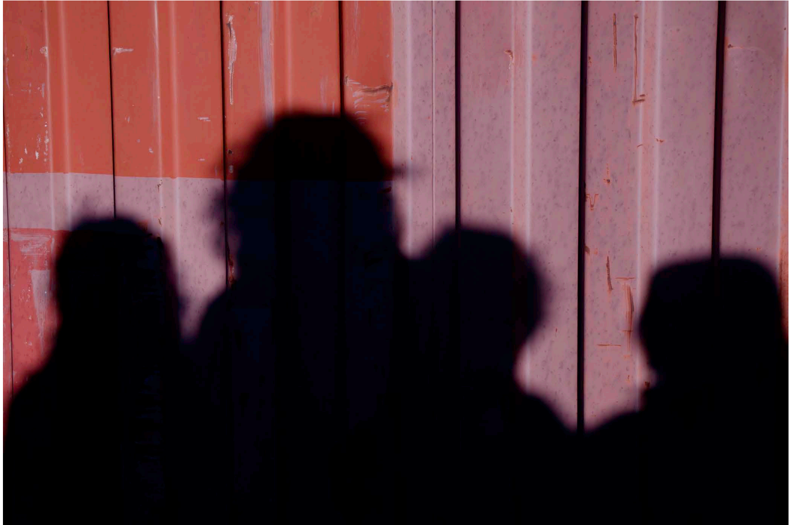
Figure 11: Storage