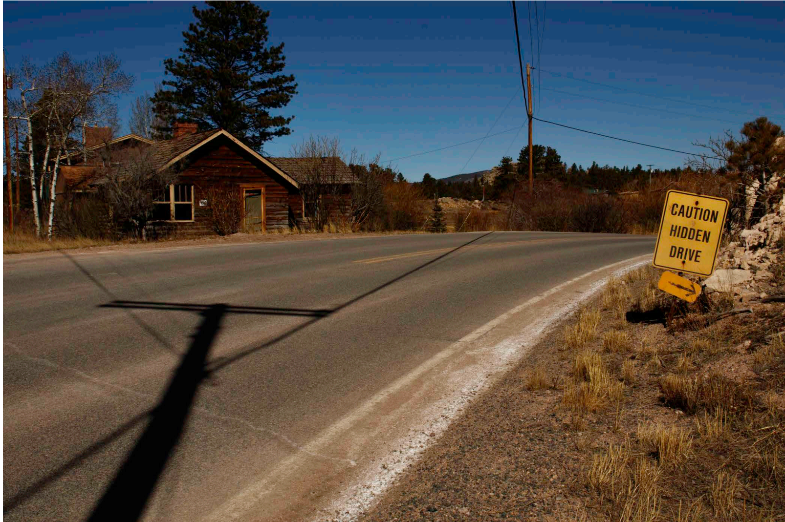
Figure 1: Hidden Drive