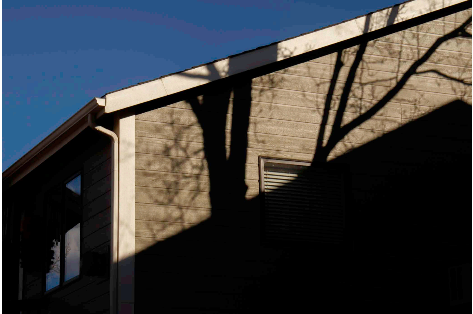
Figure 25: Suburbia