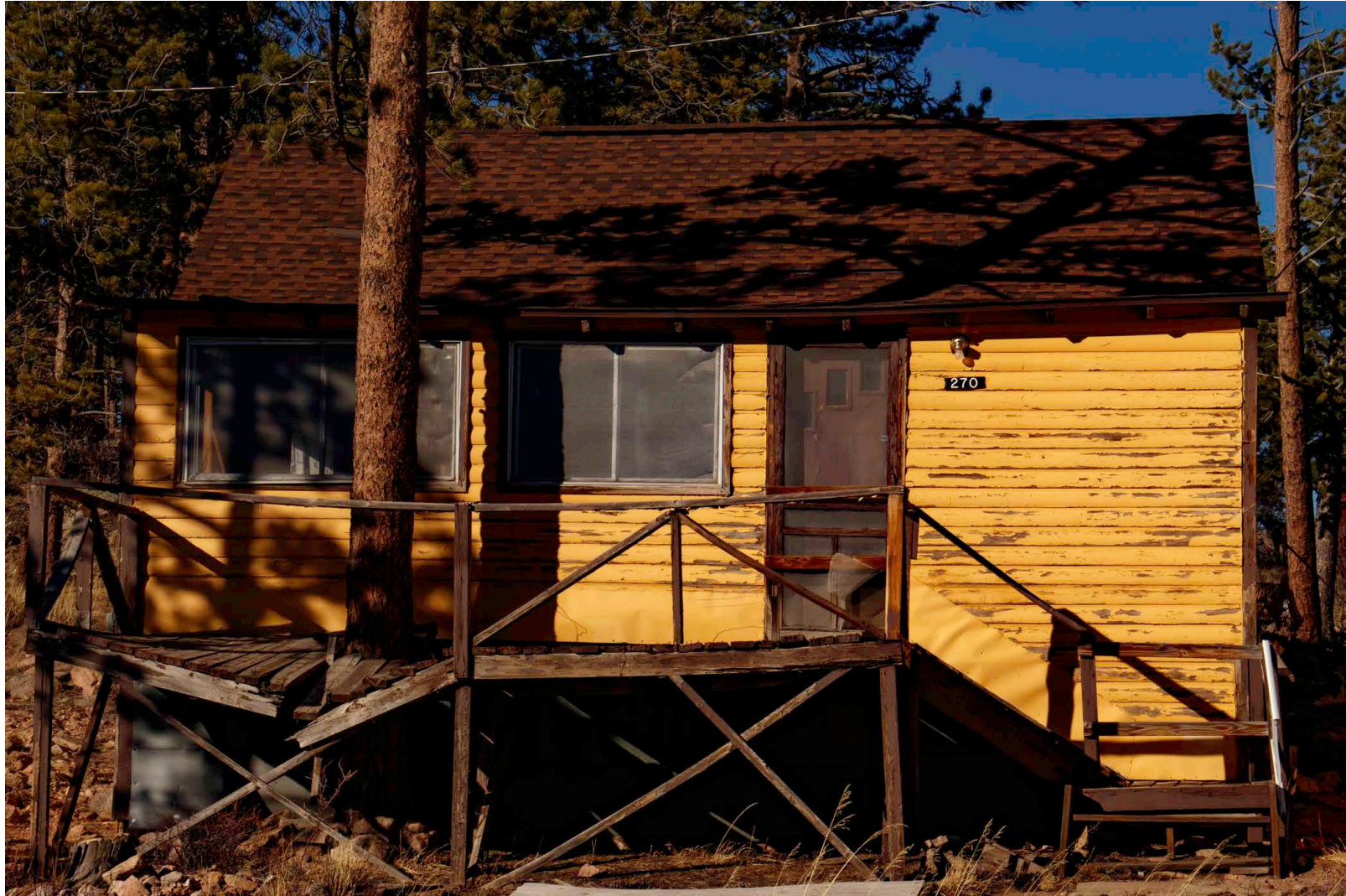
Figure 3: Broken Deck