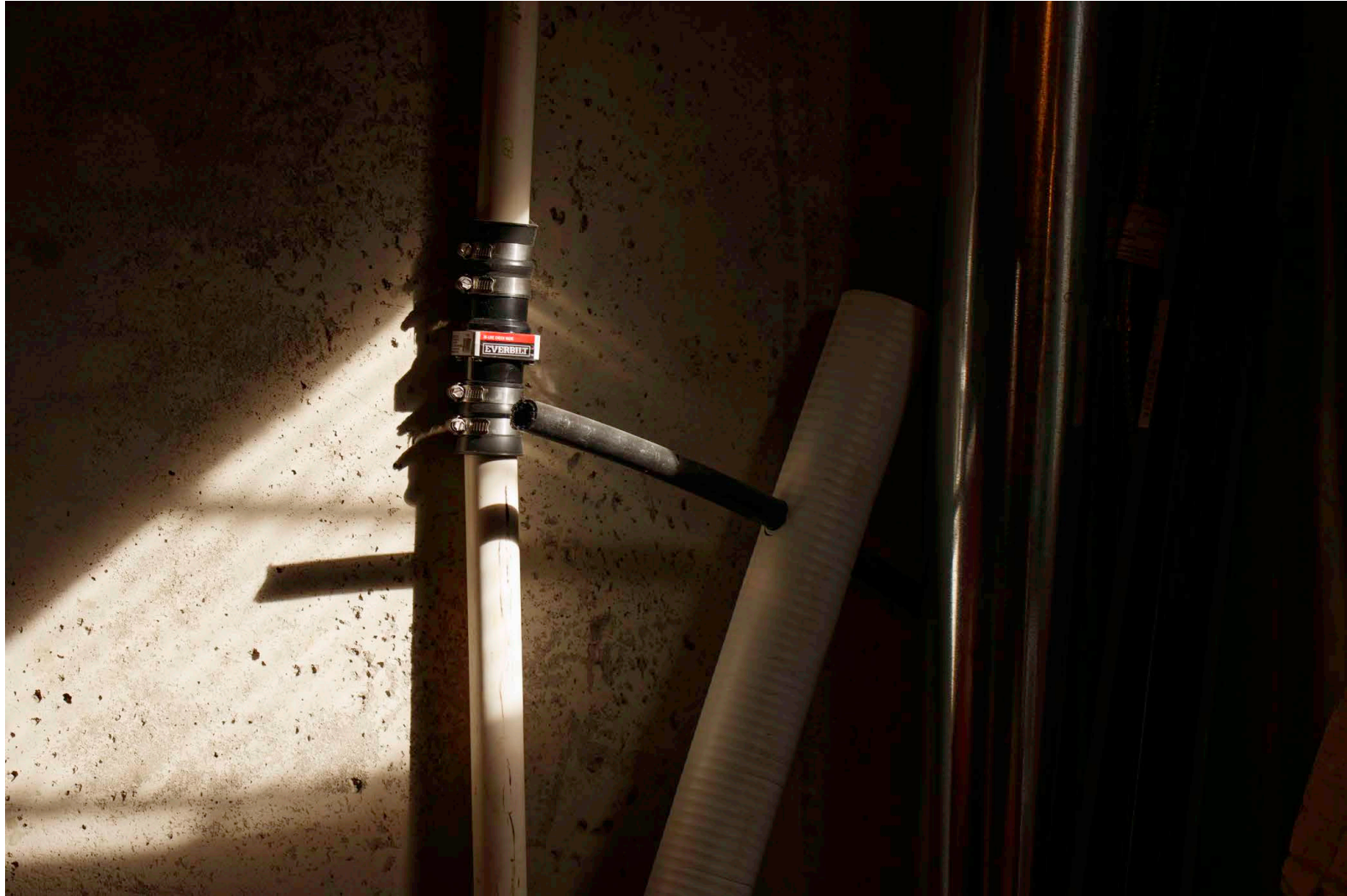
Figure 32: The Basement