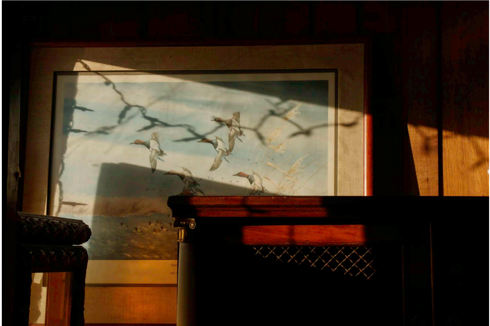
Figure 4: In Flight