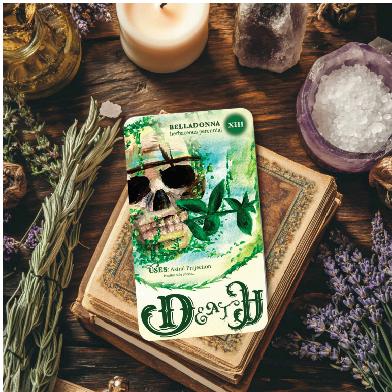
Figure 4: Tincture Tarot [Mockup]