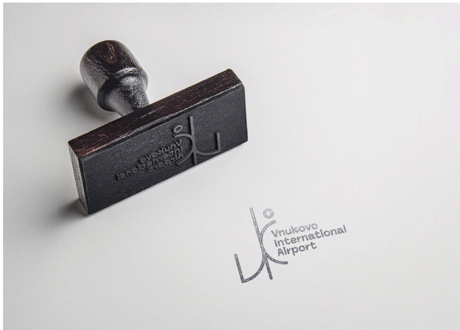
Figure 10: VKO Airport Logo [Mockup]