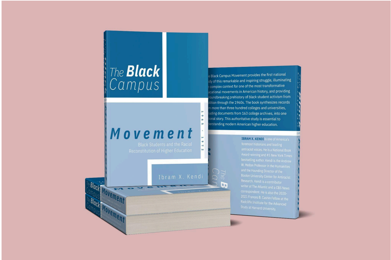
Figure 9: Black Campus Movement [Mockup]