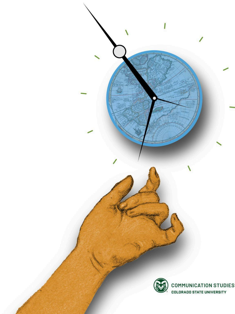
Figure 5: ACT Film Festival Poster (1)

10TH ANNUAL CELEBRATION APRIL 2 ND - 6 TH , 2025