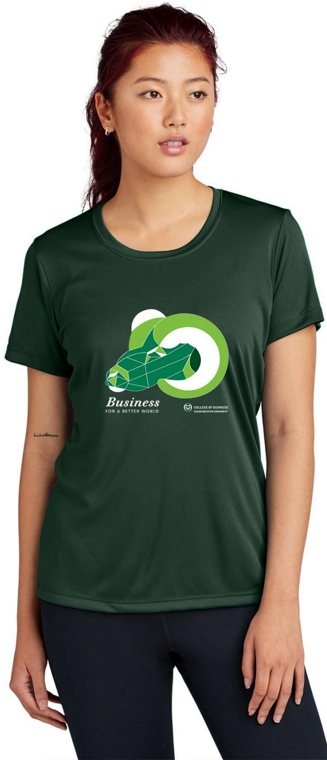
Figure 1: Ram Welcome T-Shirt [Mockup]