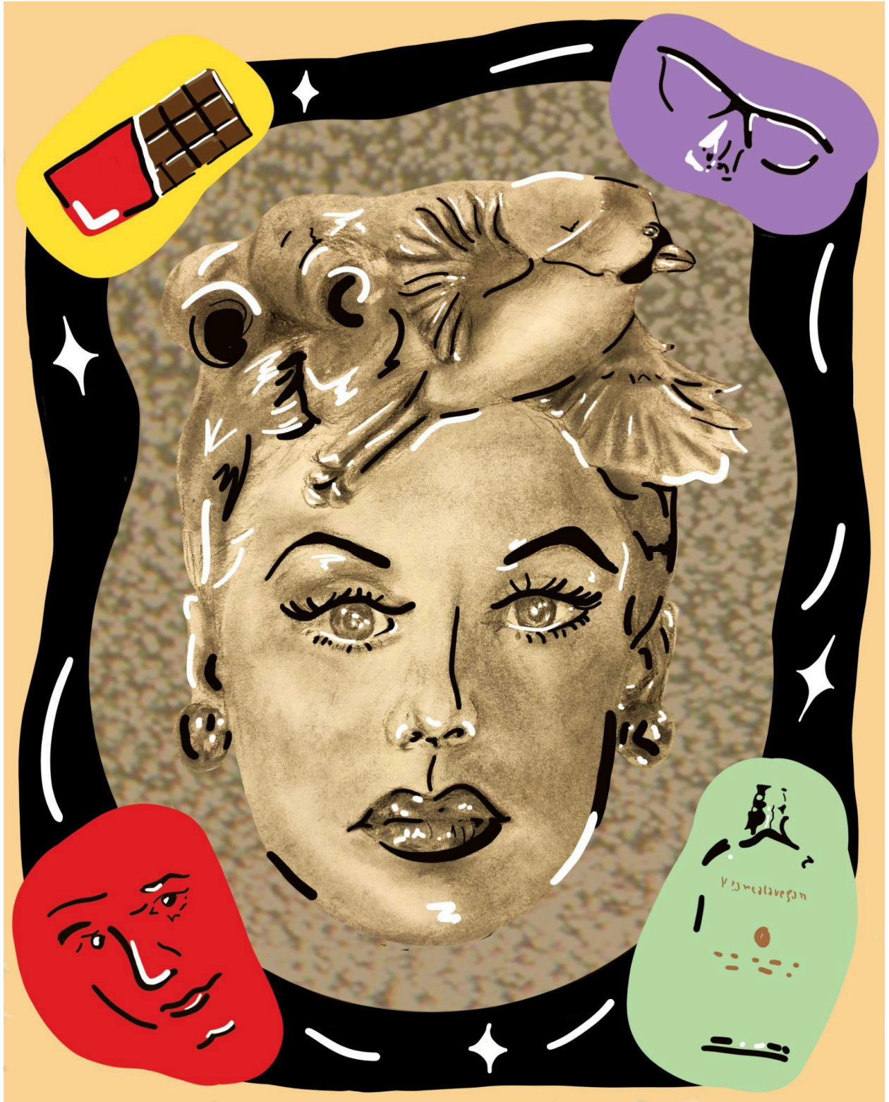
Figure 8: Lucille Ball Poster