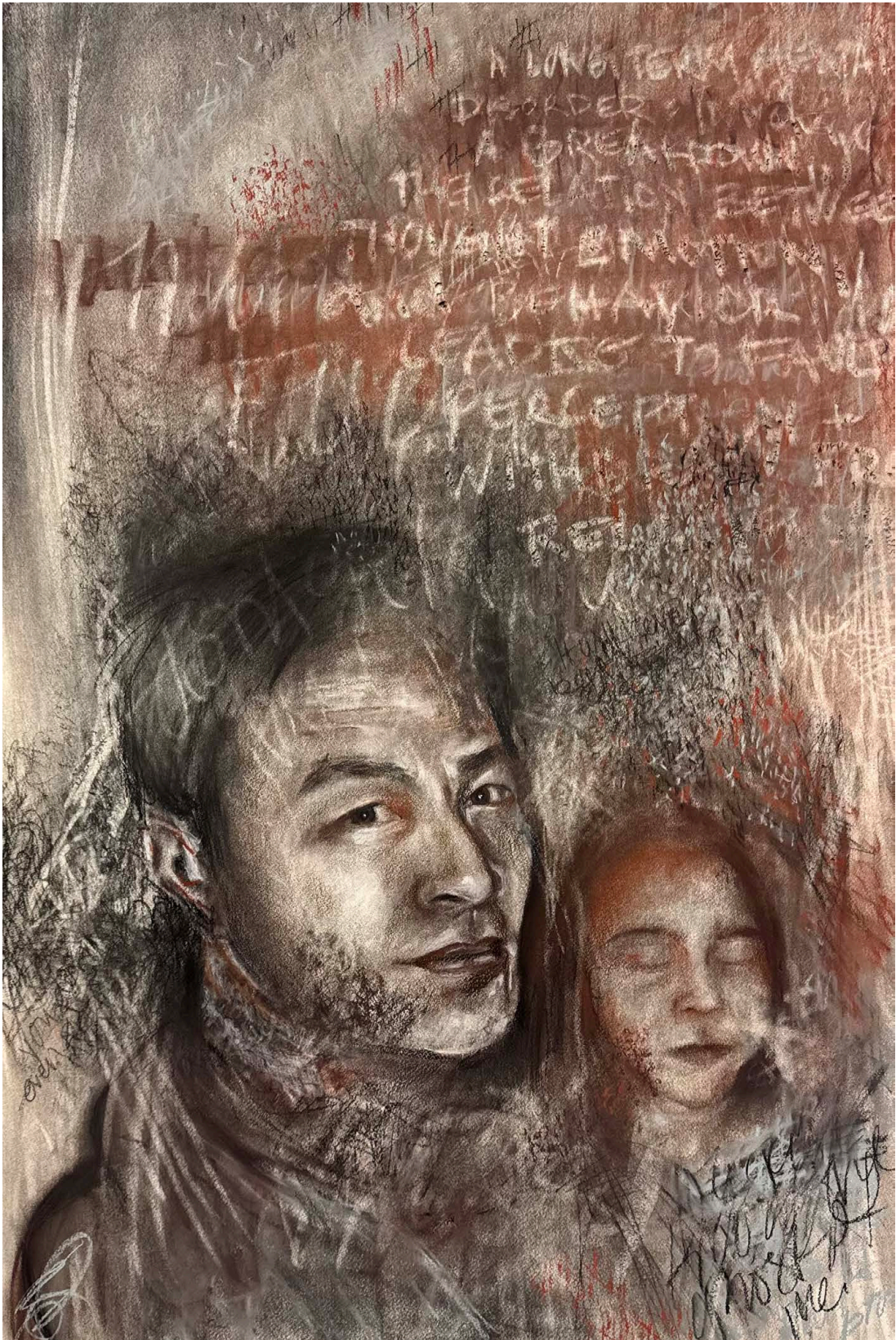
Figure 1: I didn't deserve this