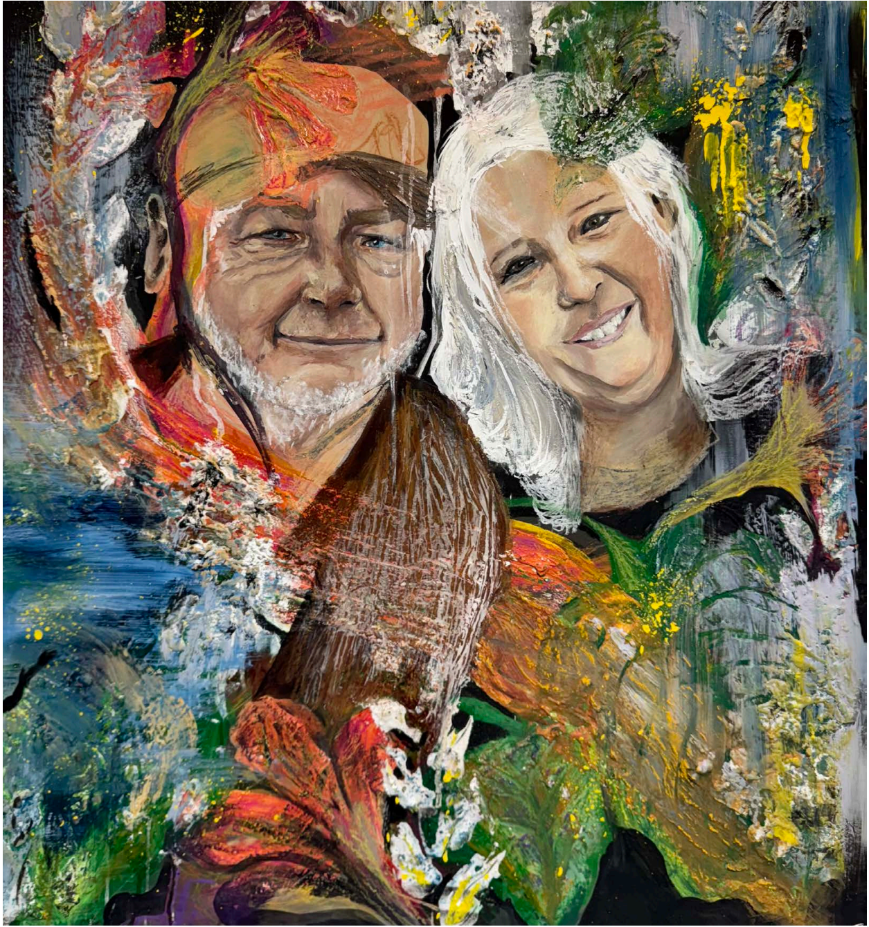
Figure 2: Blended Lives