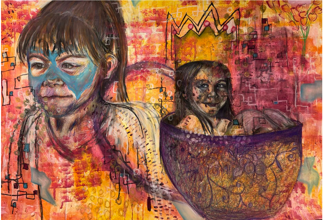
Figure 4: Childlike Wonder