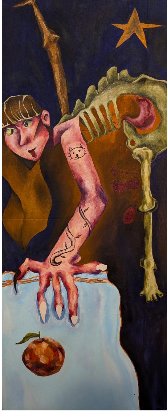
Figure 1: I Am Hungry so I Must Eat