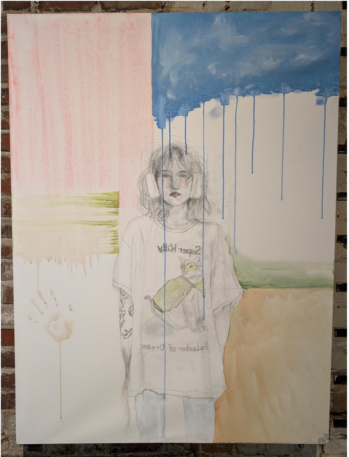
Figure 7: Clouds and Mist