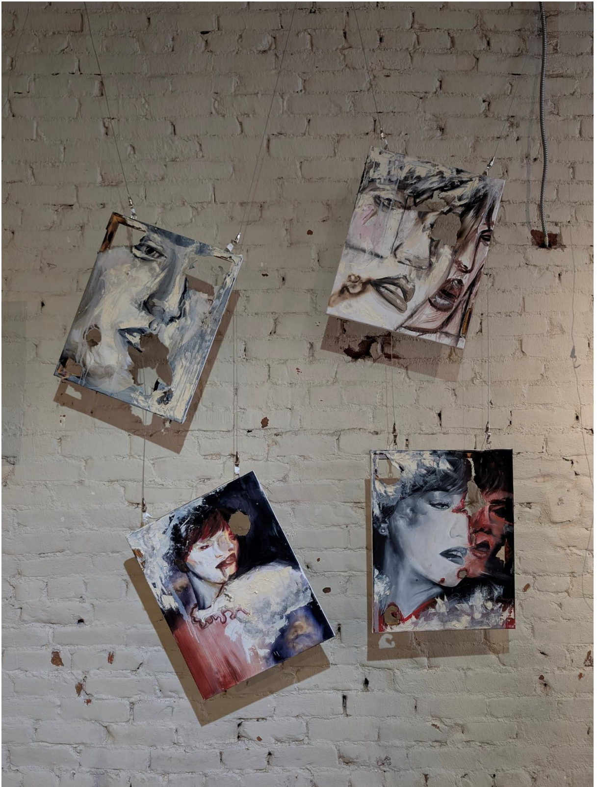
Figure 8: Untitled in Theory, A Speck of Dust