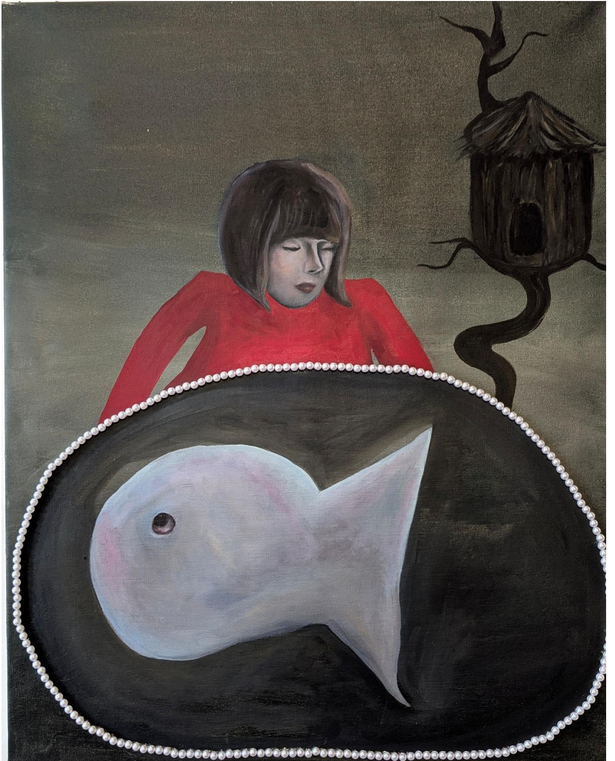
Figure 3: The Sister Fish