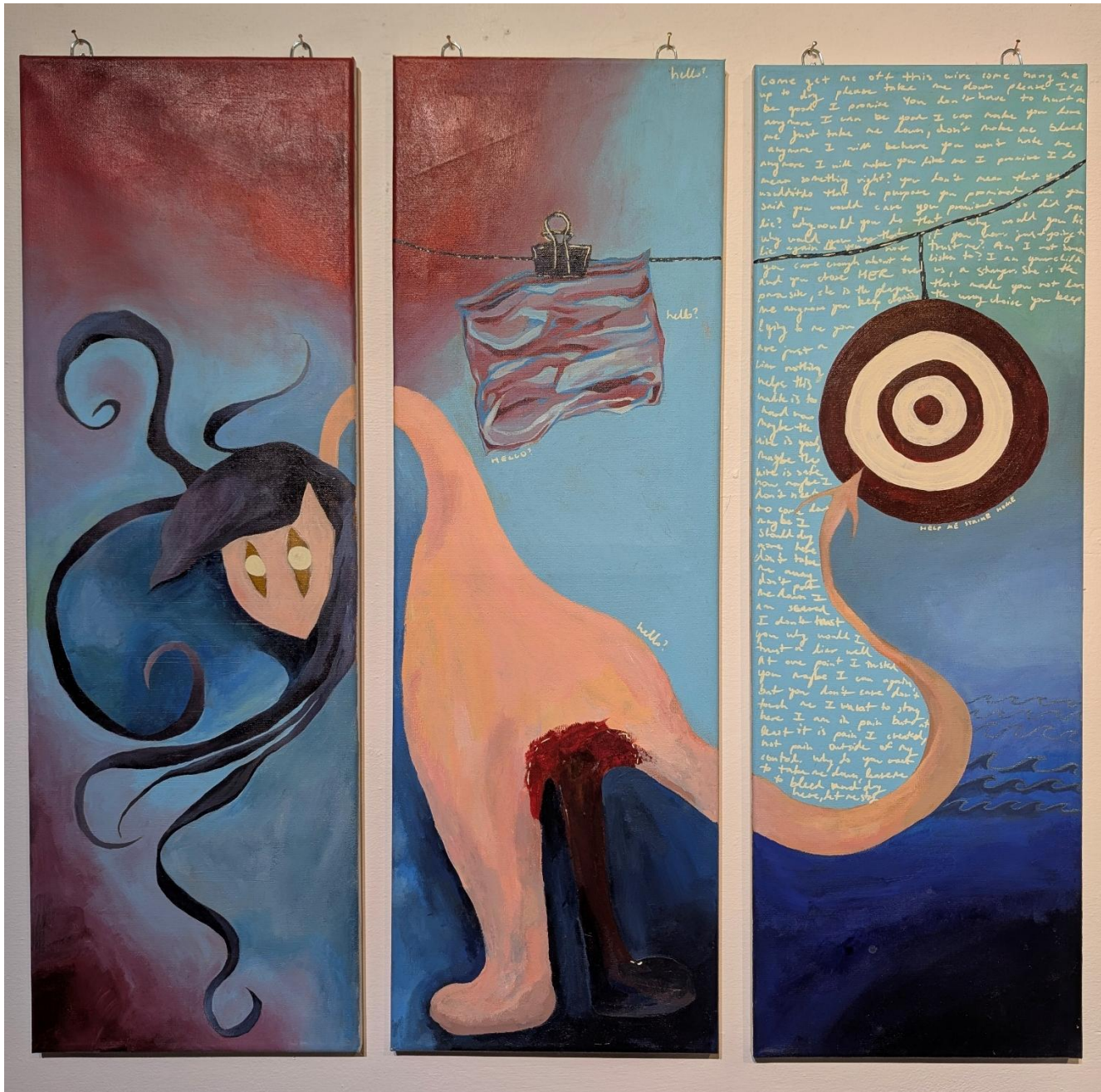
Figure 5: The Labyrinth: Myself