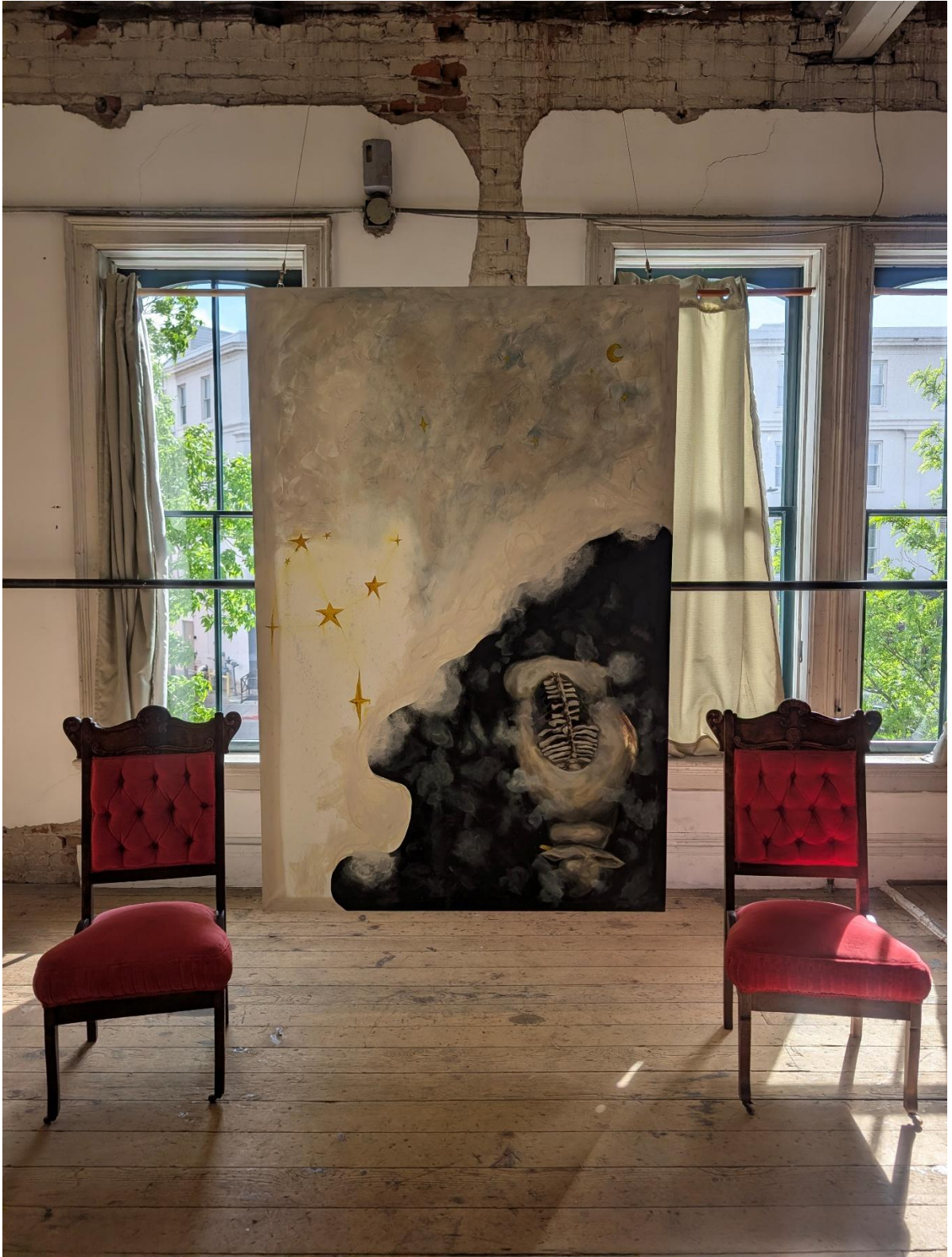
Figure 6: The Willing Sacrifice