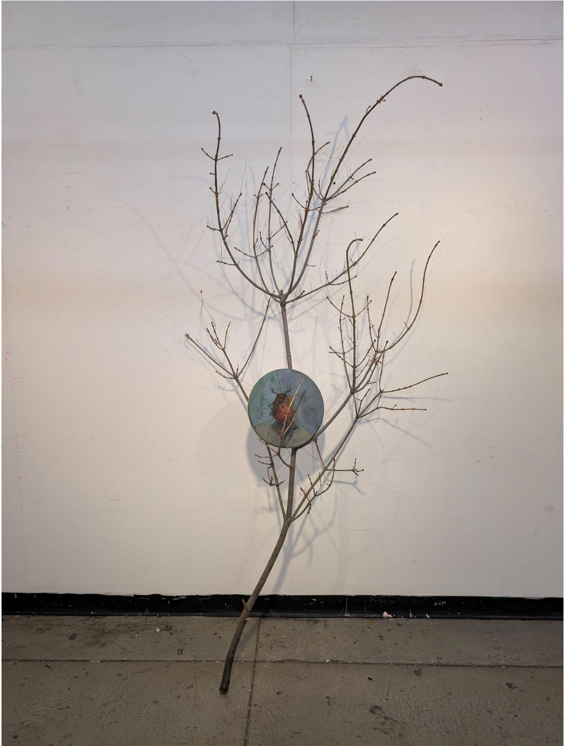
Figure 2: Please Can I Have Just This?