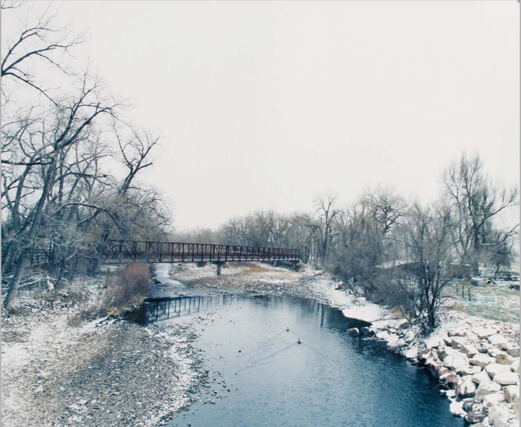
Figure 19: Poudre Trail 2.