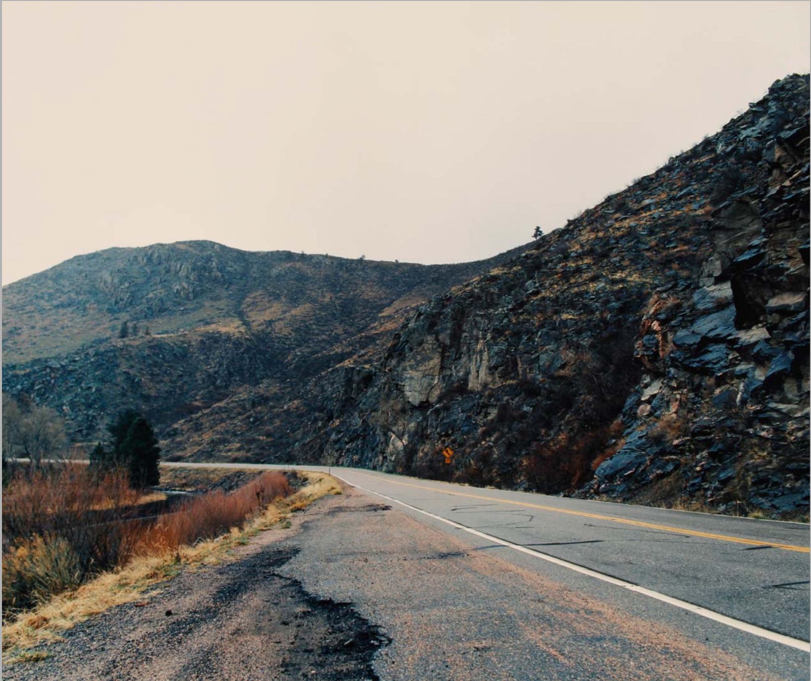
Figure 12: Hwy 14, 4.