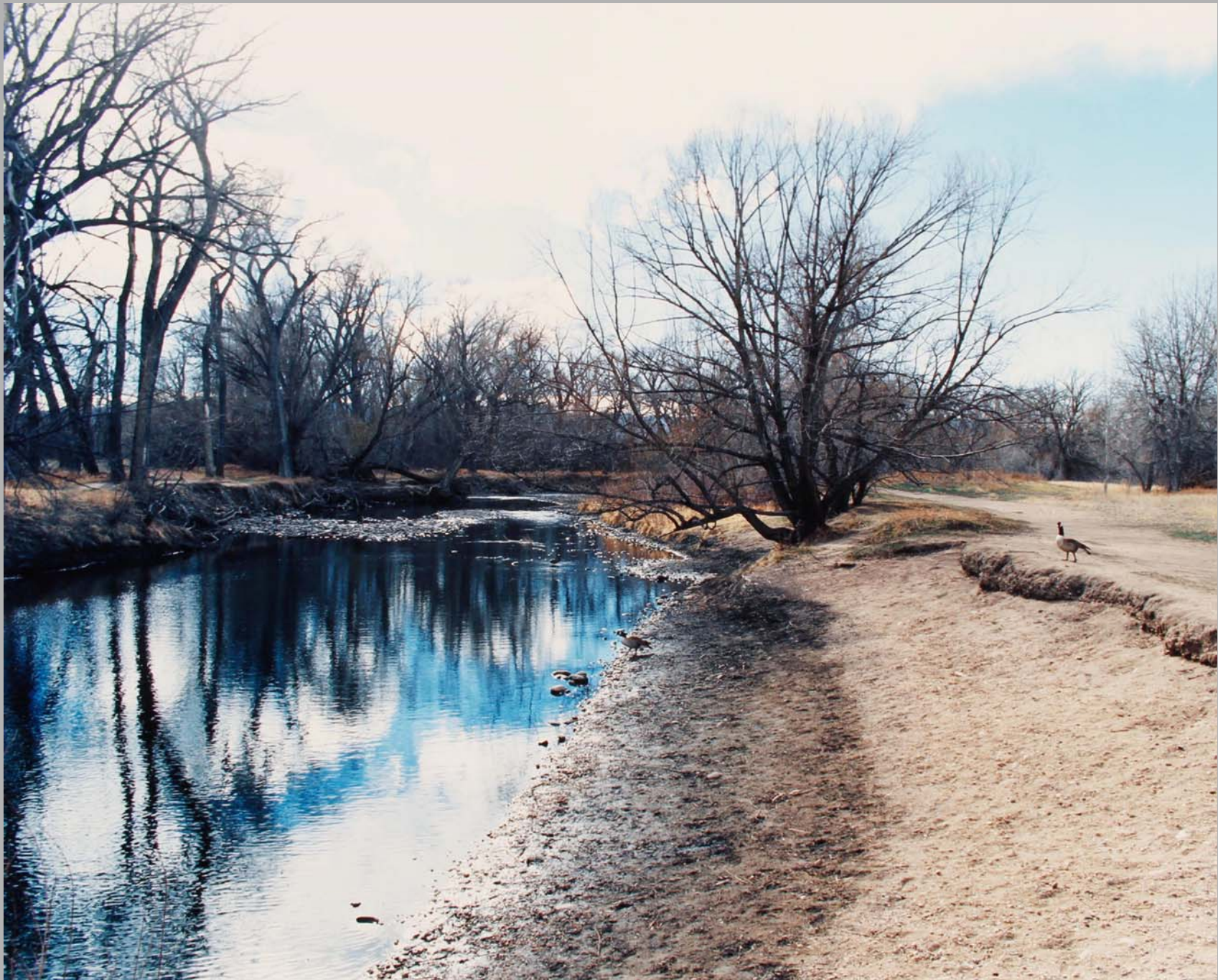
Figure 8: Rope Swing 4.