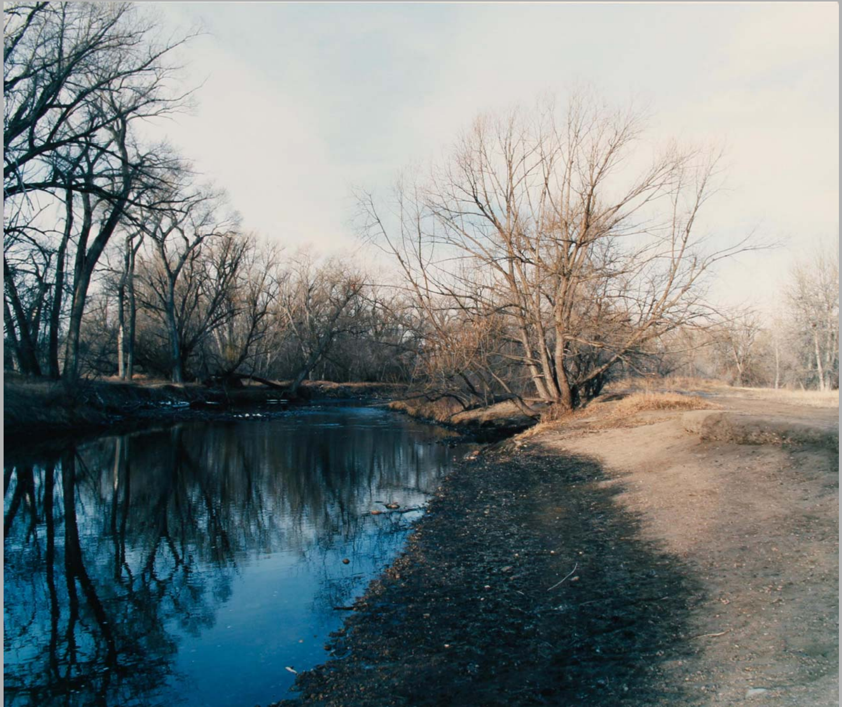
Figure 6: Rope Swing 2.