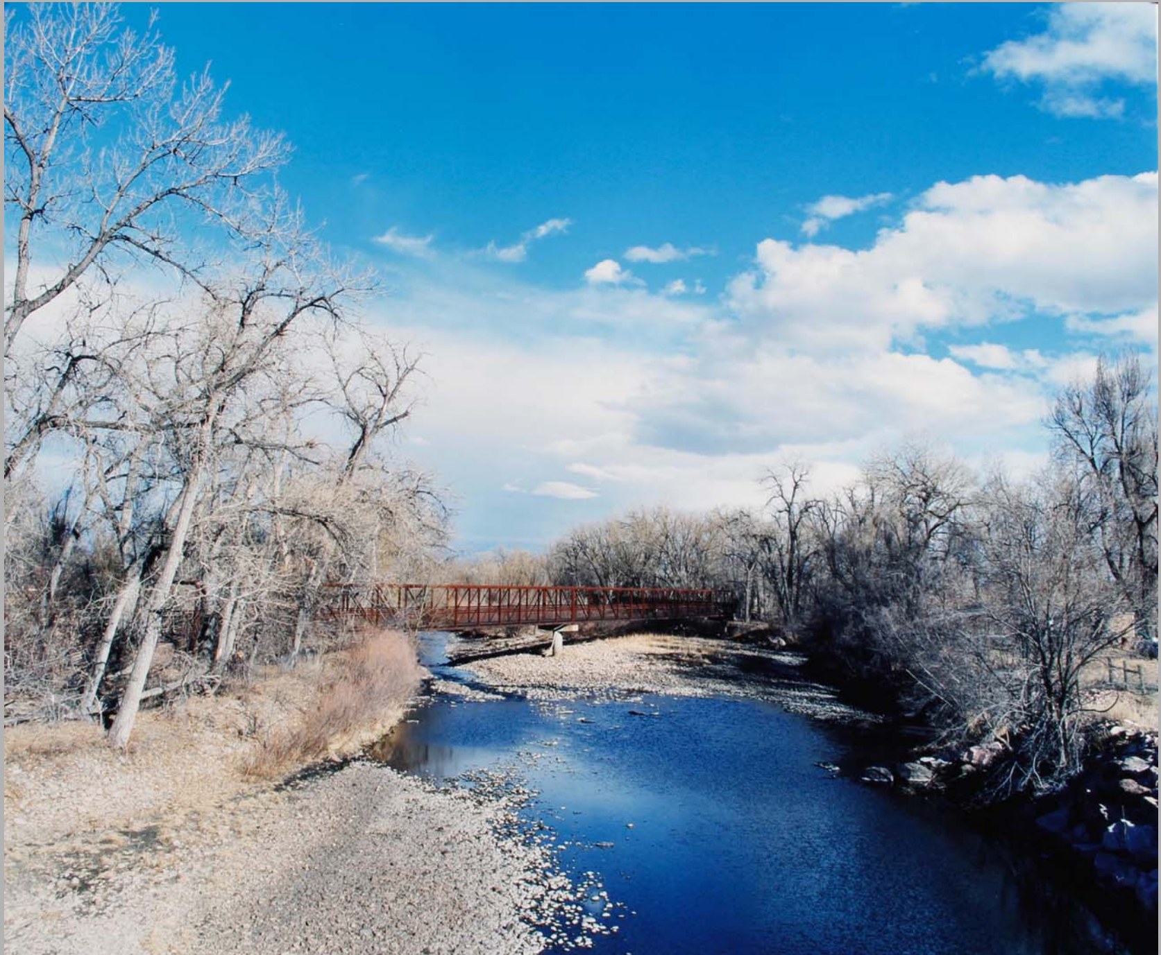
Figure 21: Poudre Trail 4.