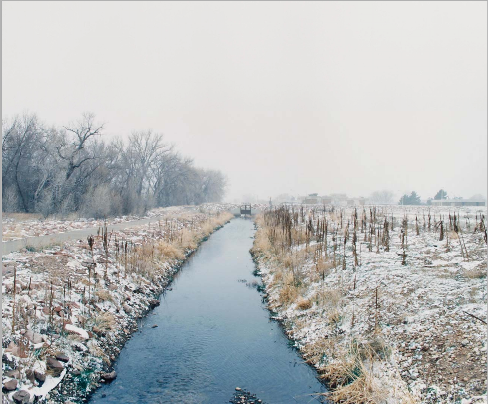
Figure 22: Water Treatment 1.