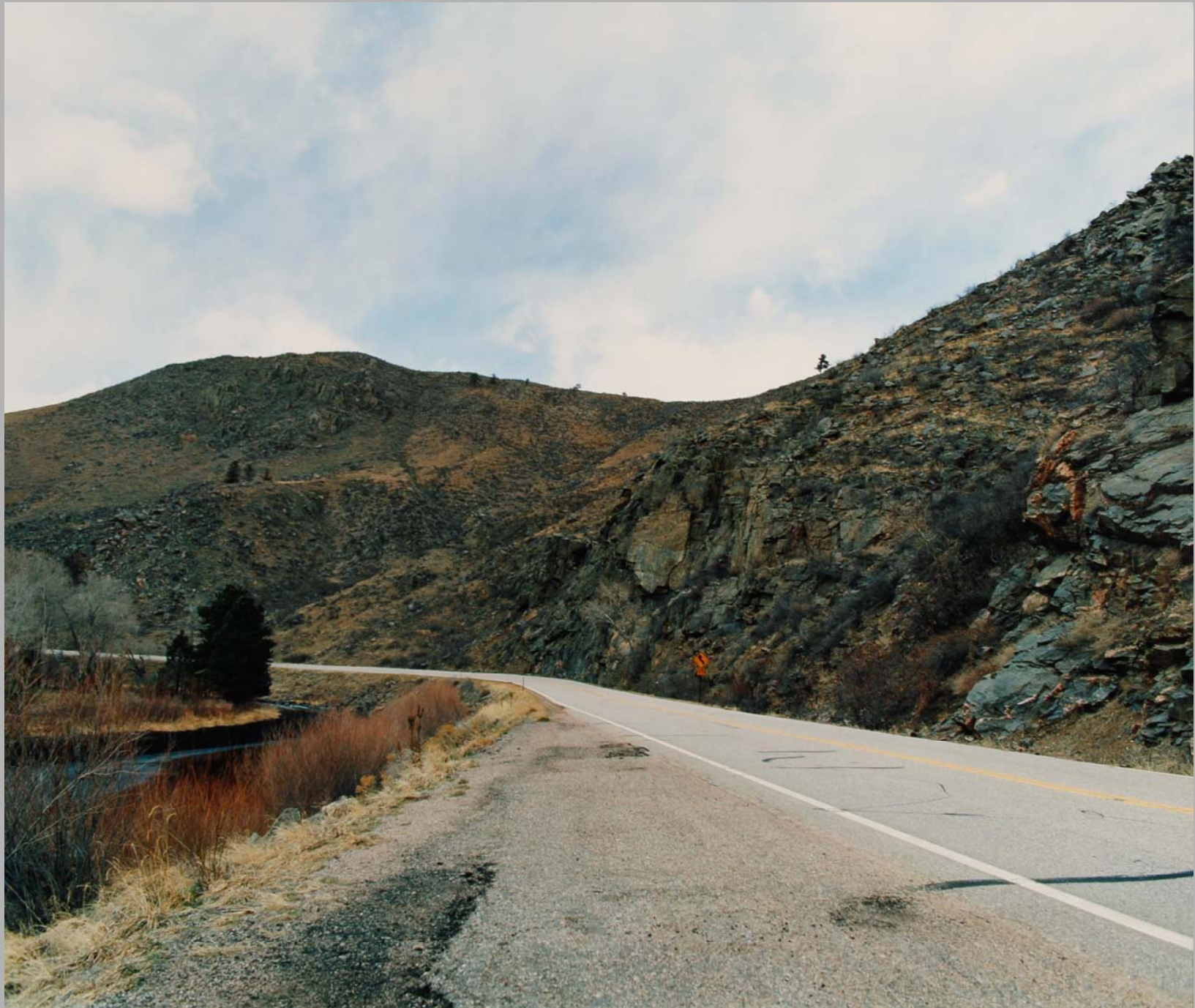
Figure 11: Hwy 14, 3.