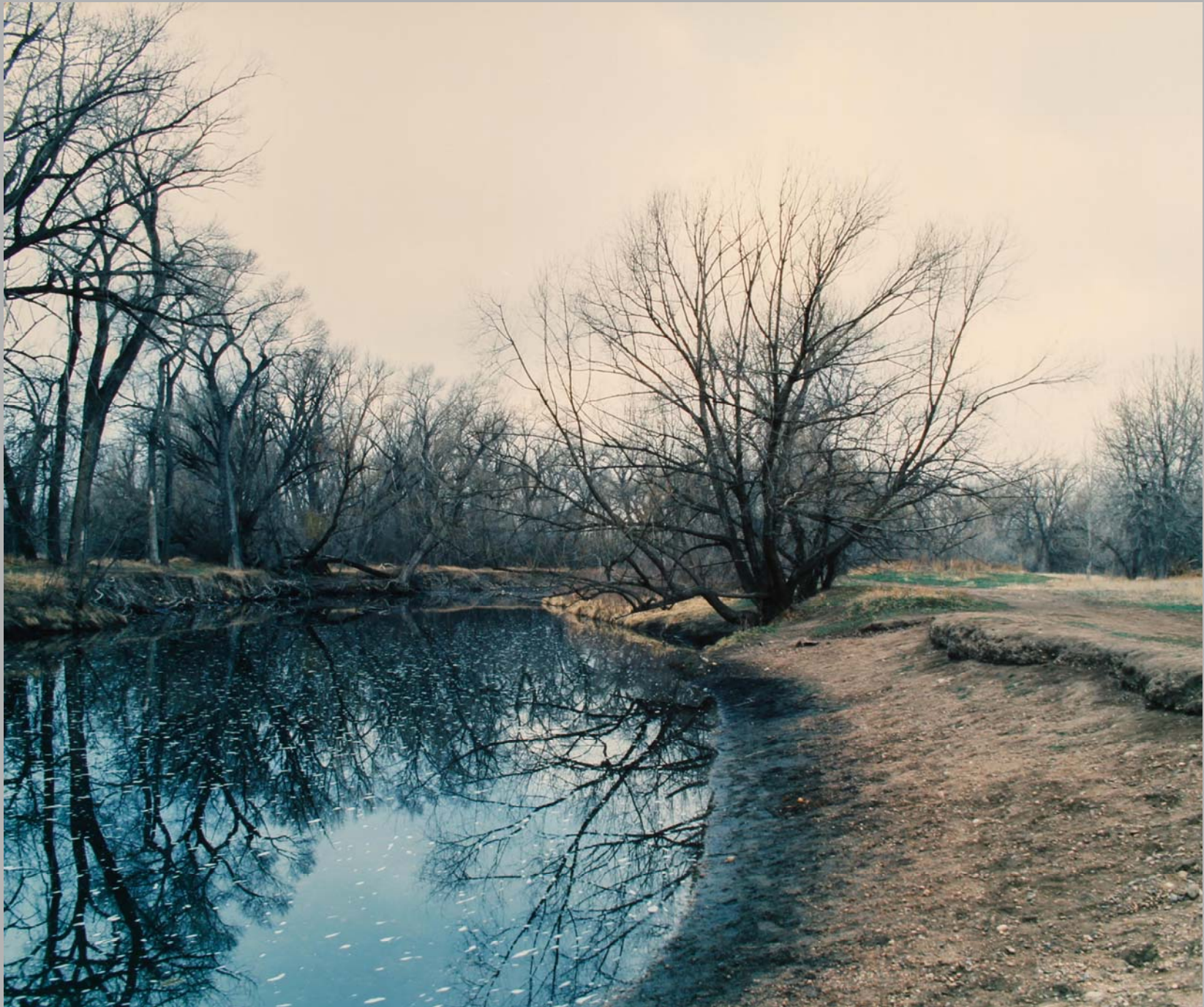
Figure 5: Rope Swing 1.