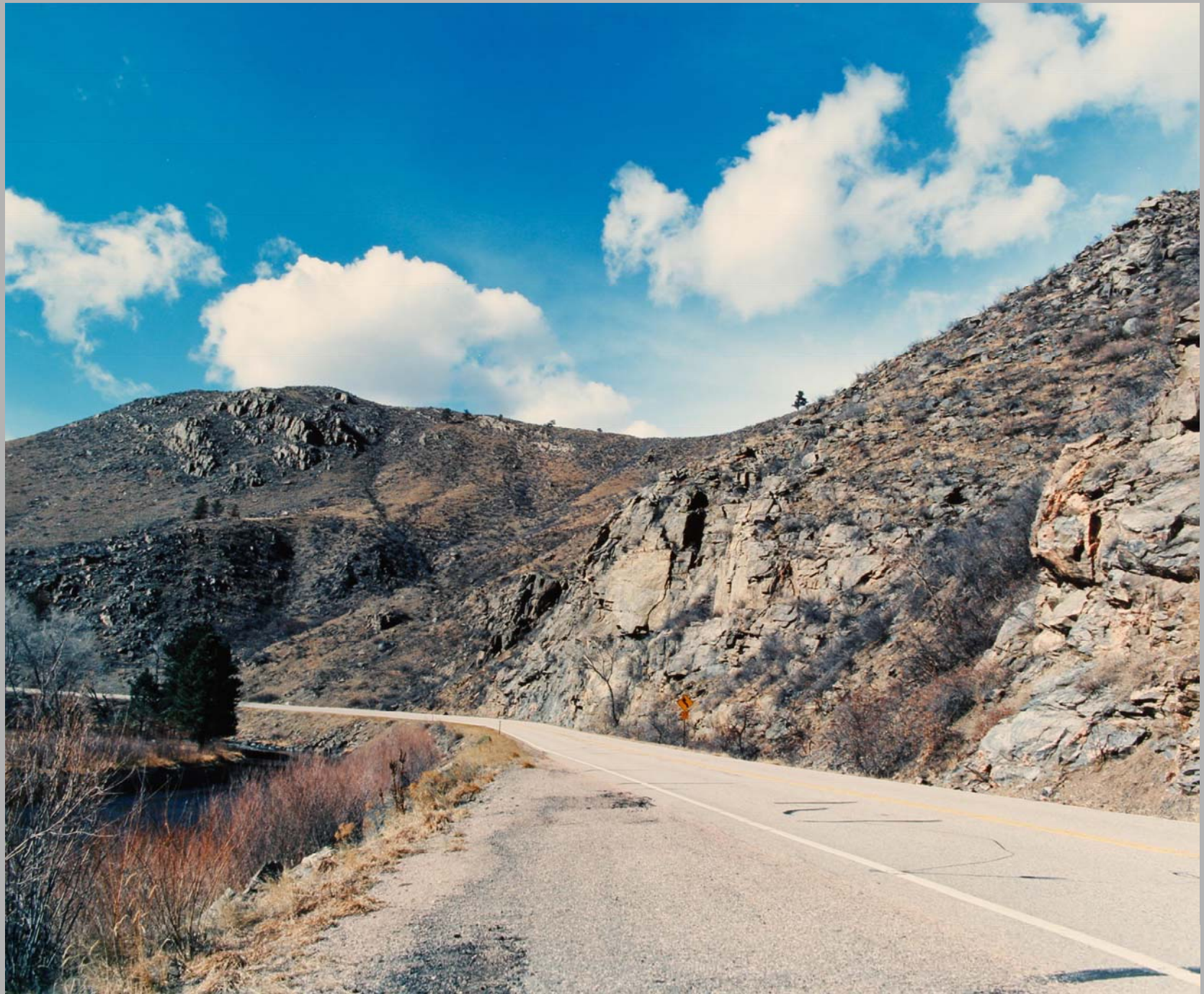
Figure 9: Hwy 14, 1.