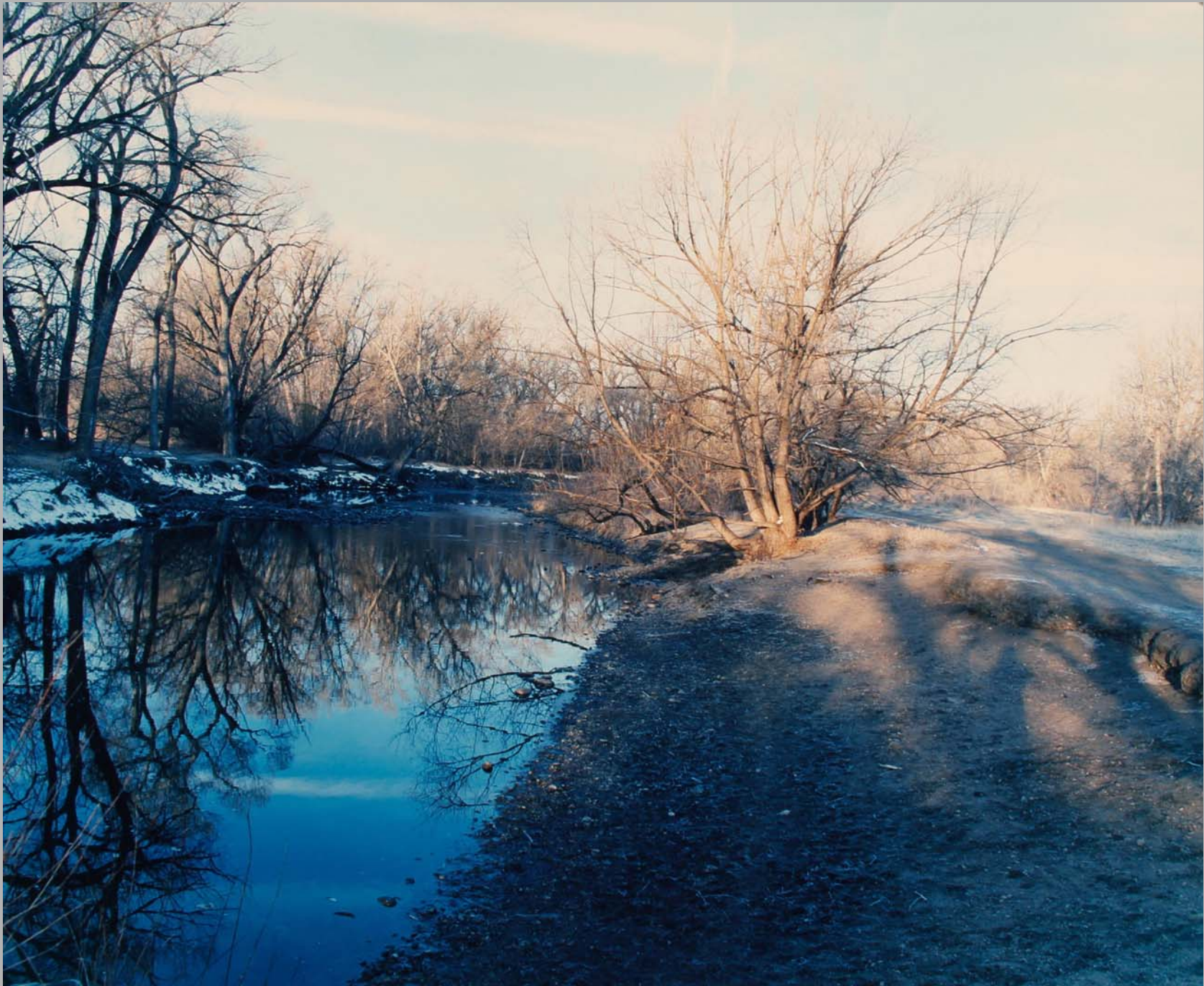
Figure 7: Rope Swing 3.