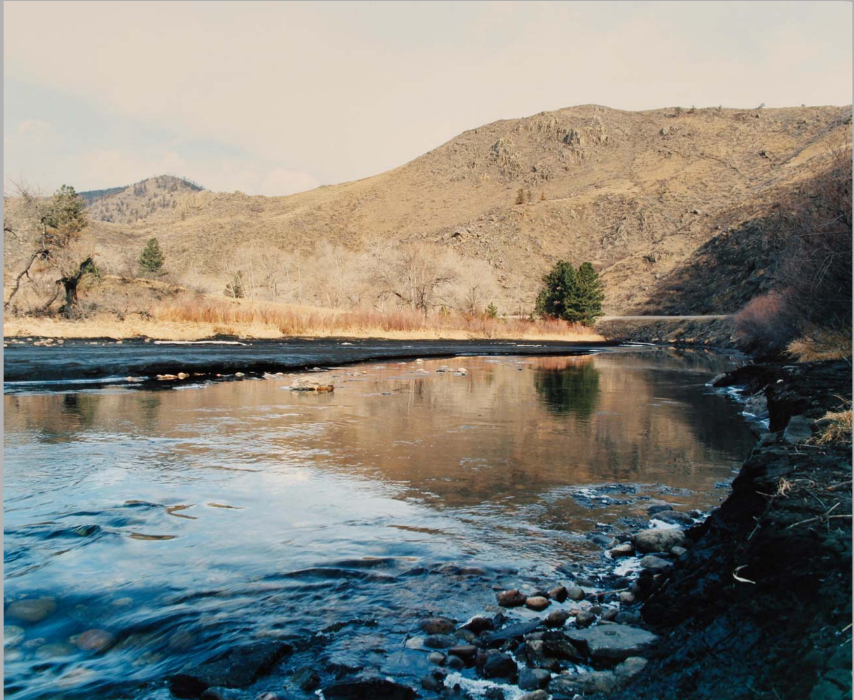
Figure 15: In the Bank 1.