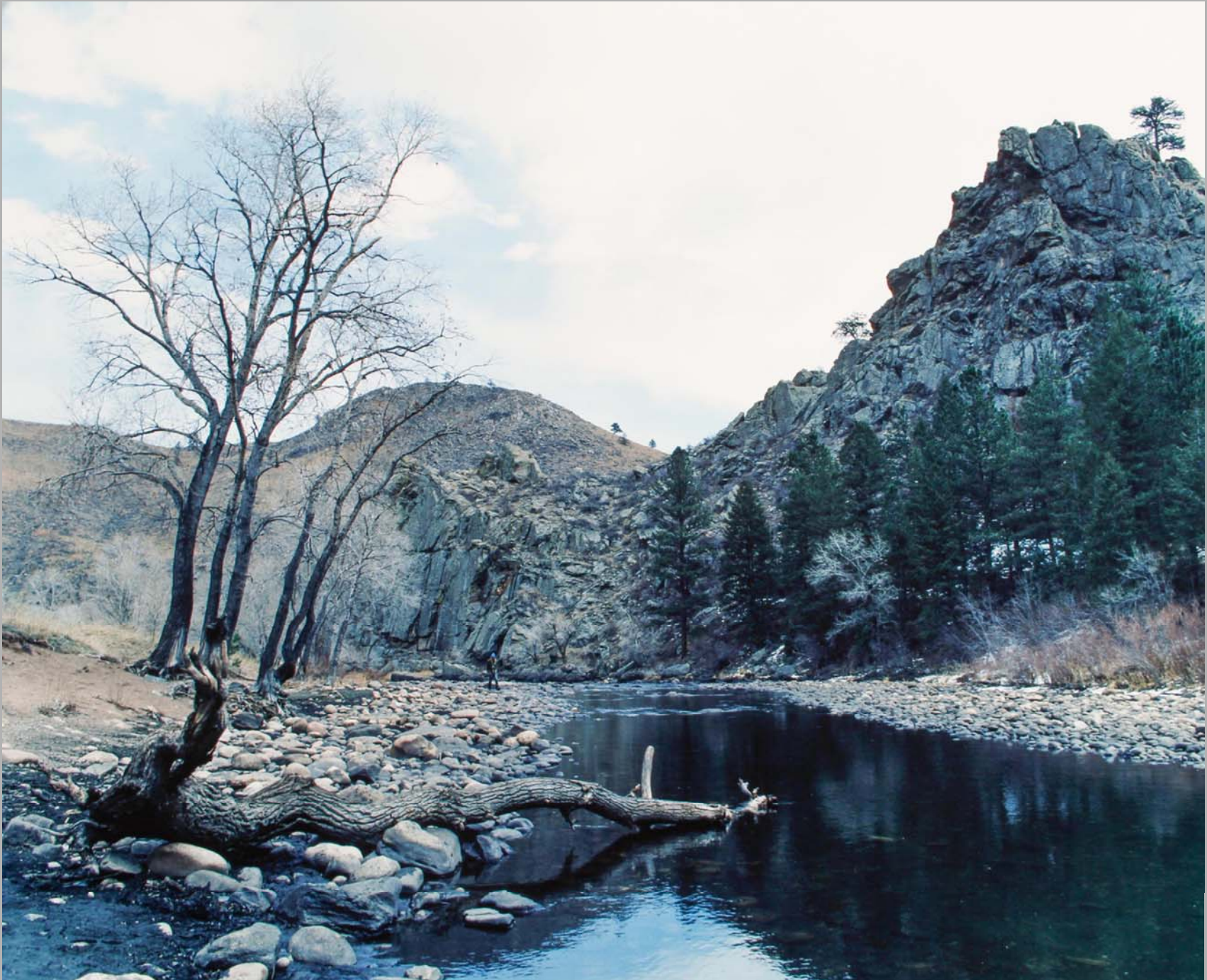
Figure 1: In the River 1.