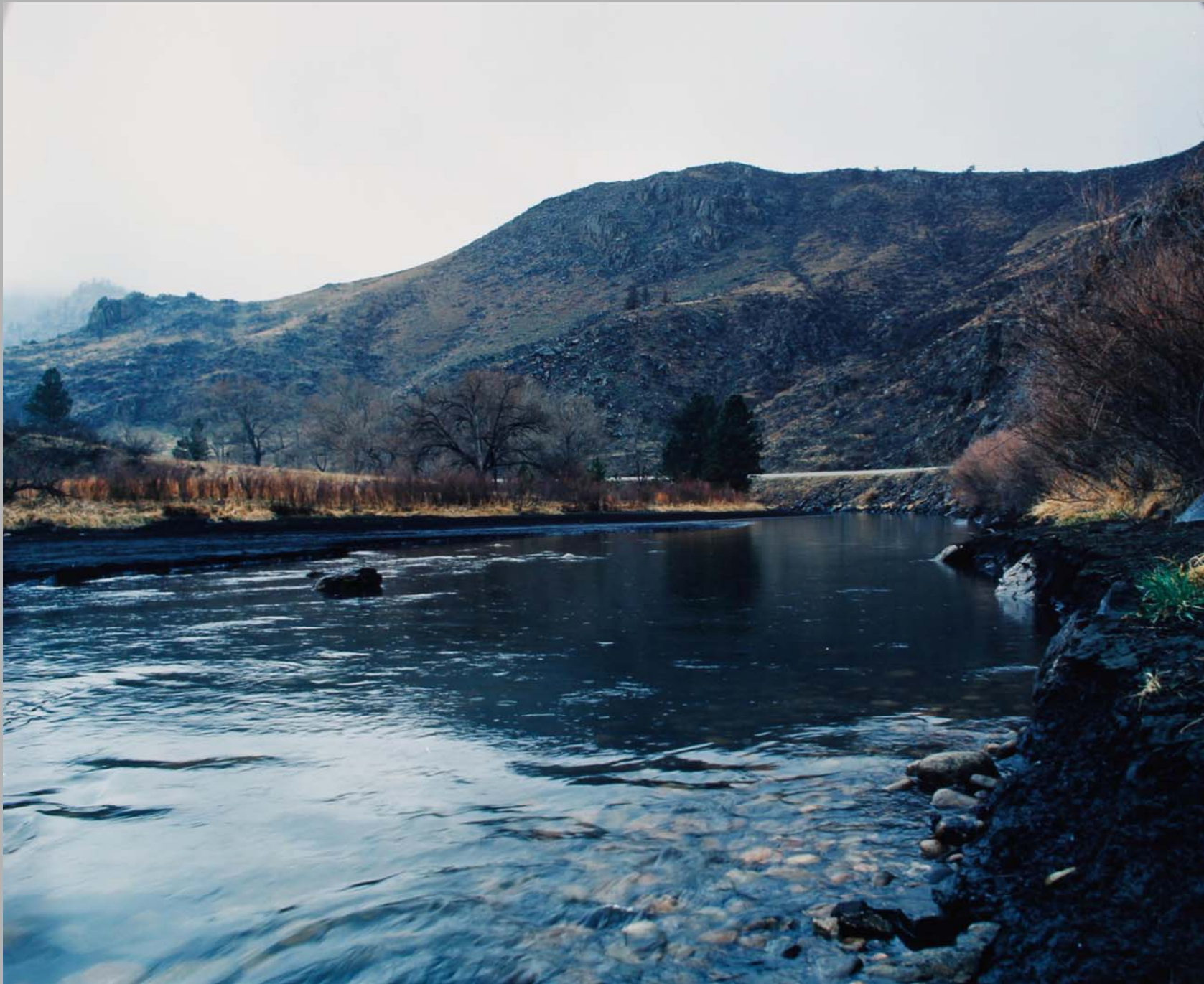
Figure 16: In the Bank 2.