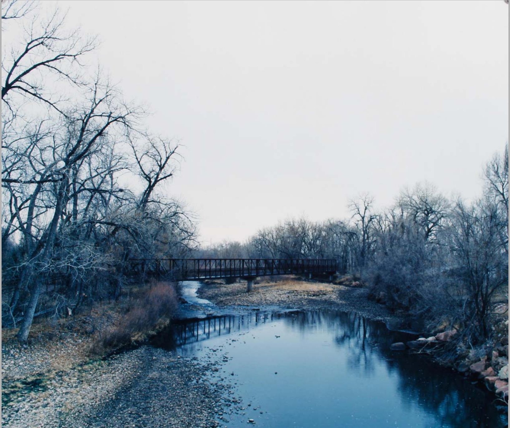
Figure 20: Poudre Trail 3.