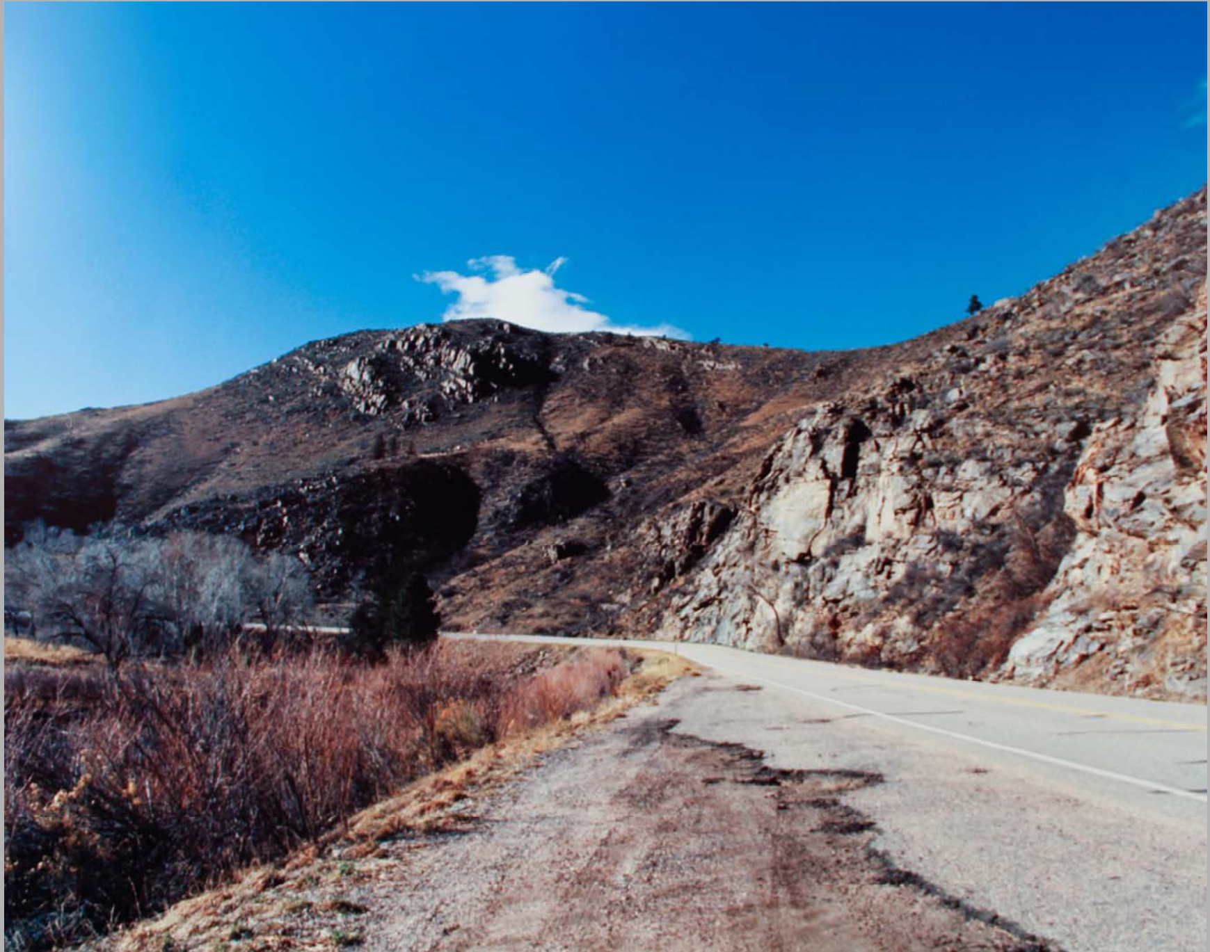
Figure 14: Hwy 14, 6.