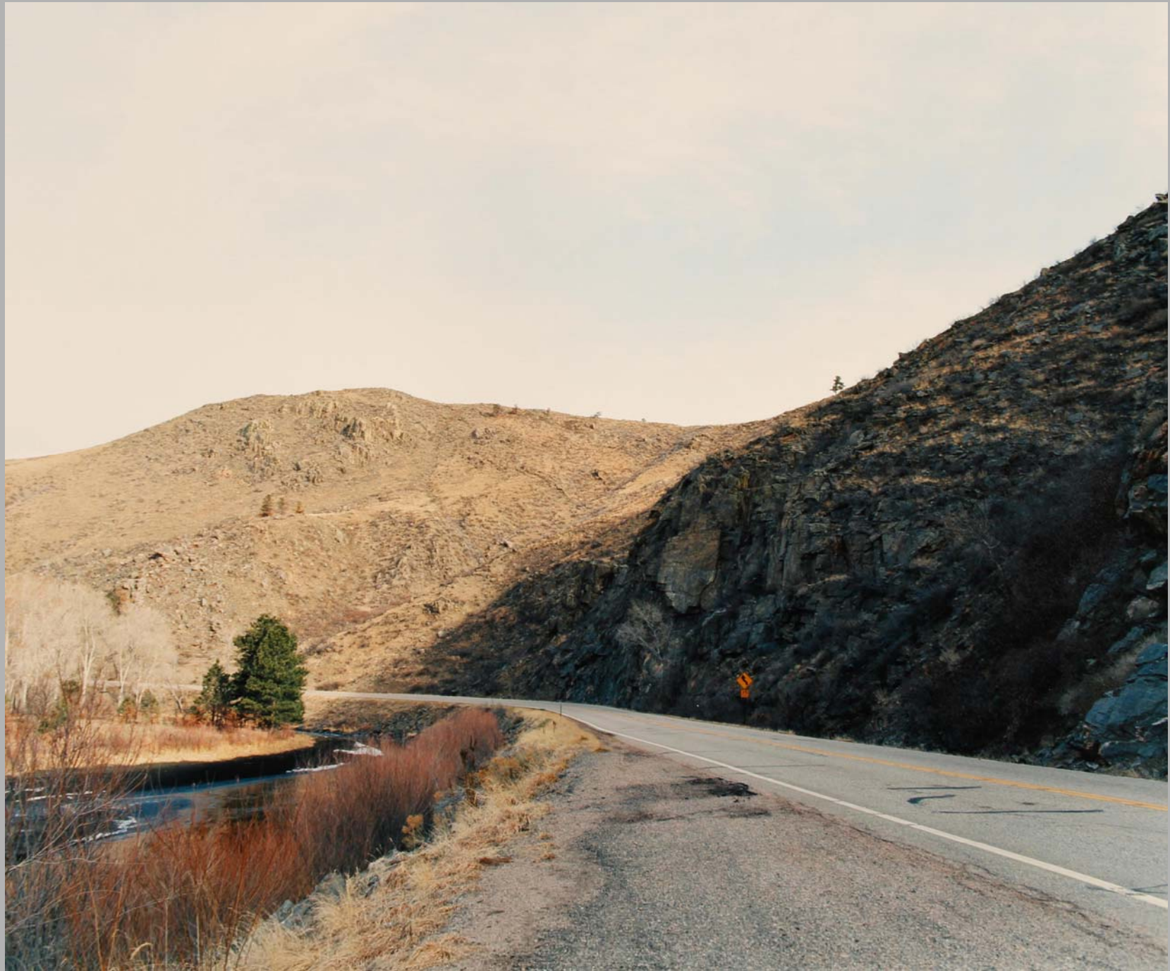
Figure 10: Hwy 14, 2.