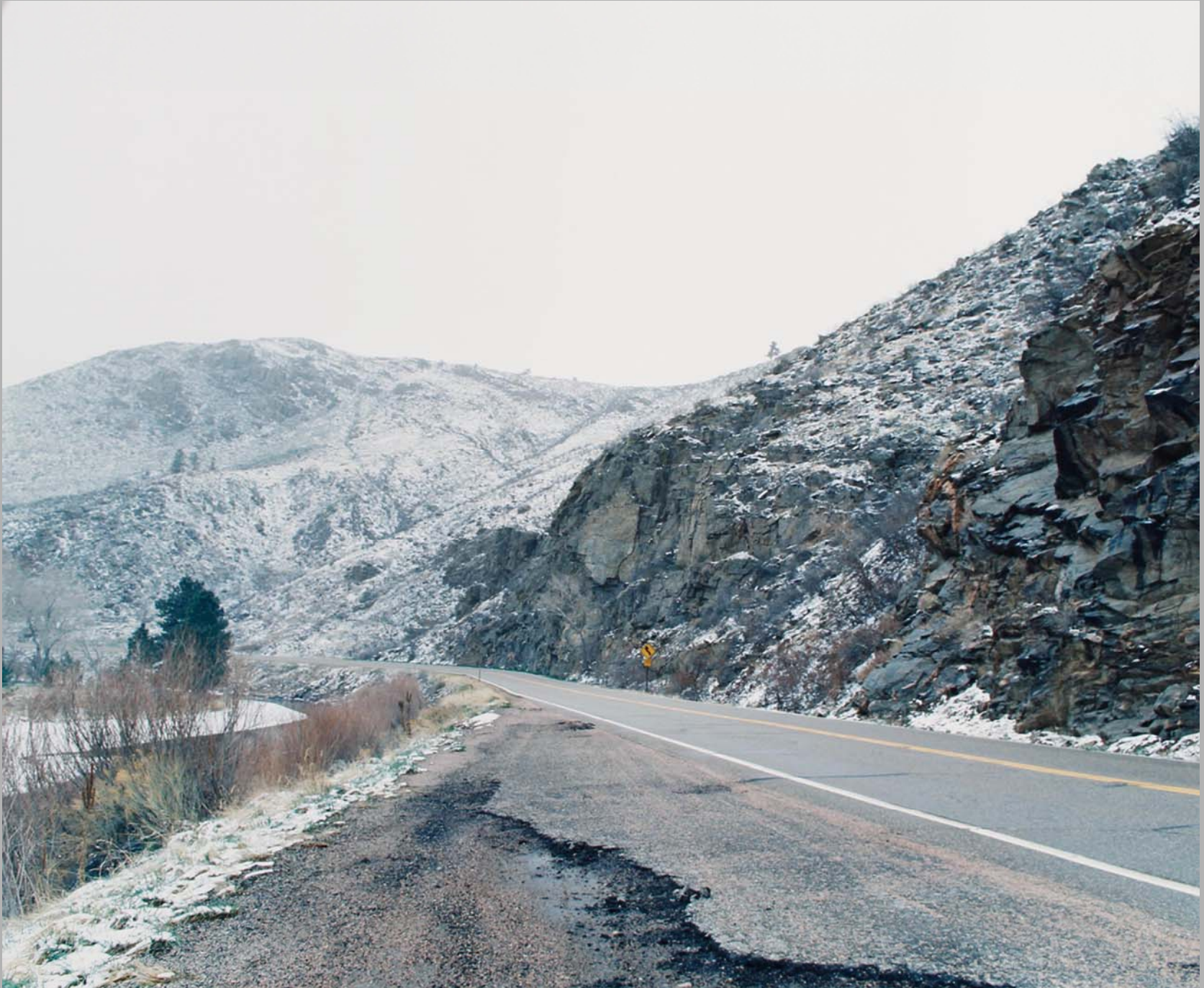
Figure 13: Hwy 14, 5.