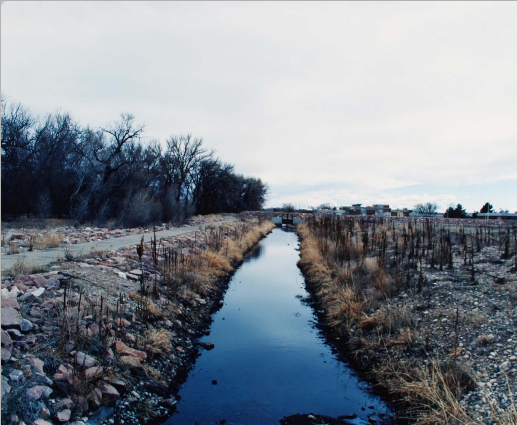
Figure 24: Water Treatment 3.