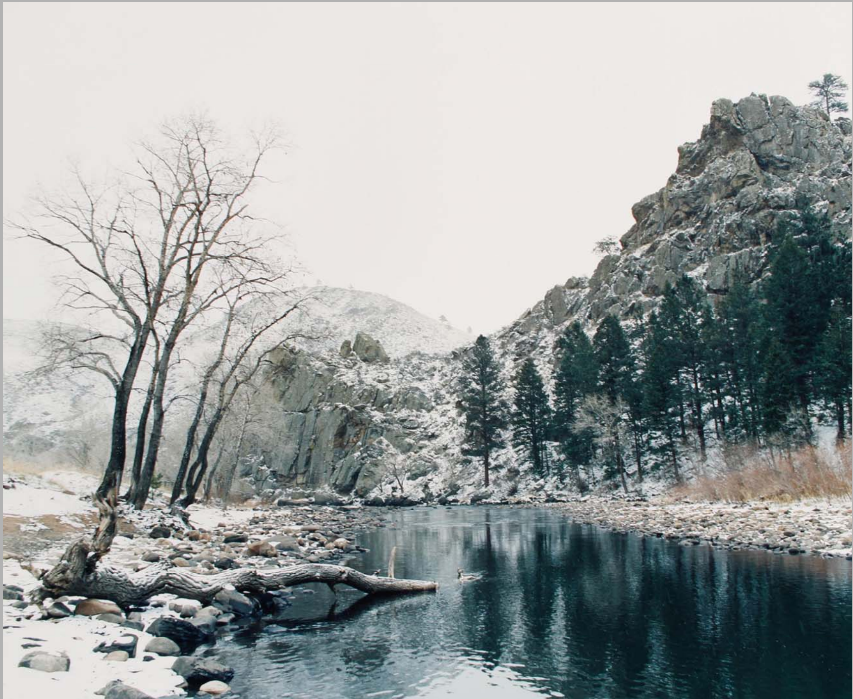
Figure 2: In the River 2.