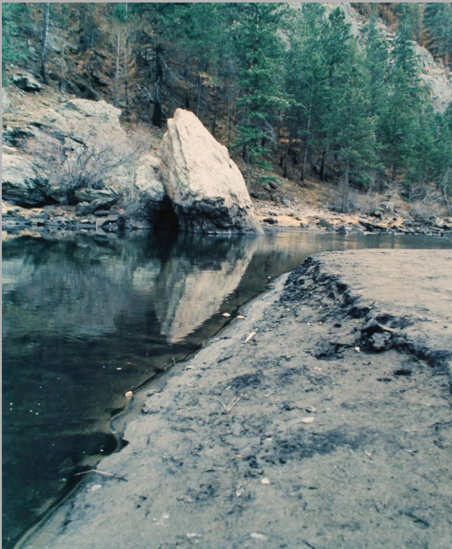
Figure 4: Picnic Rock 2.