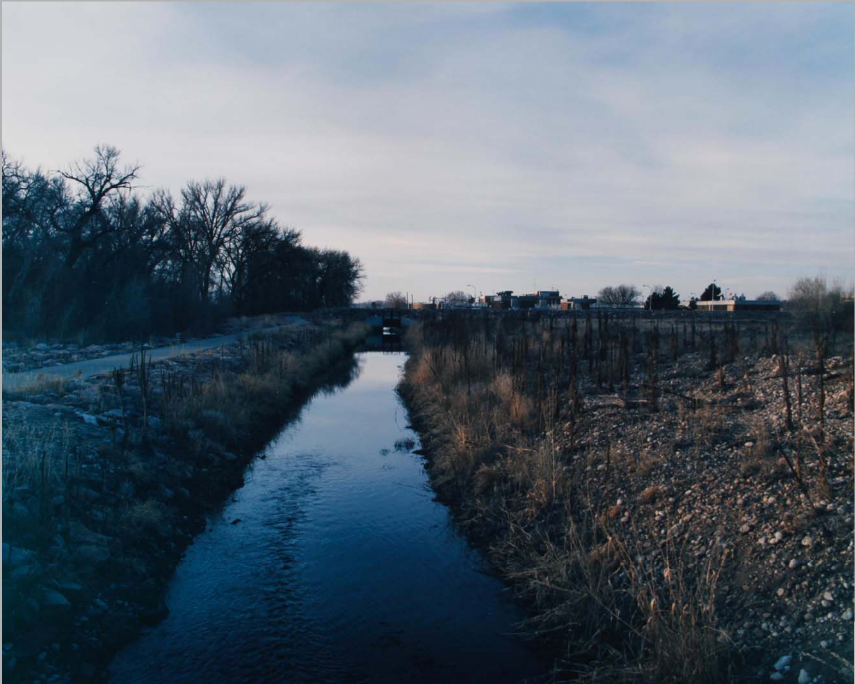
Figure 23: Water Treatment 2.