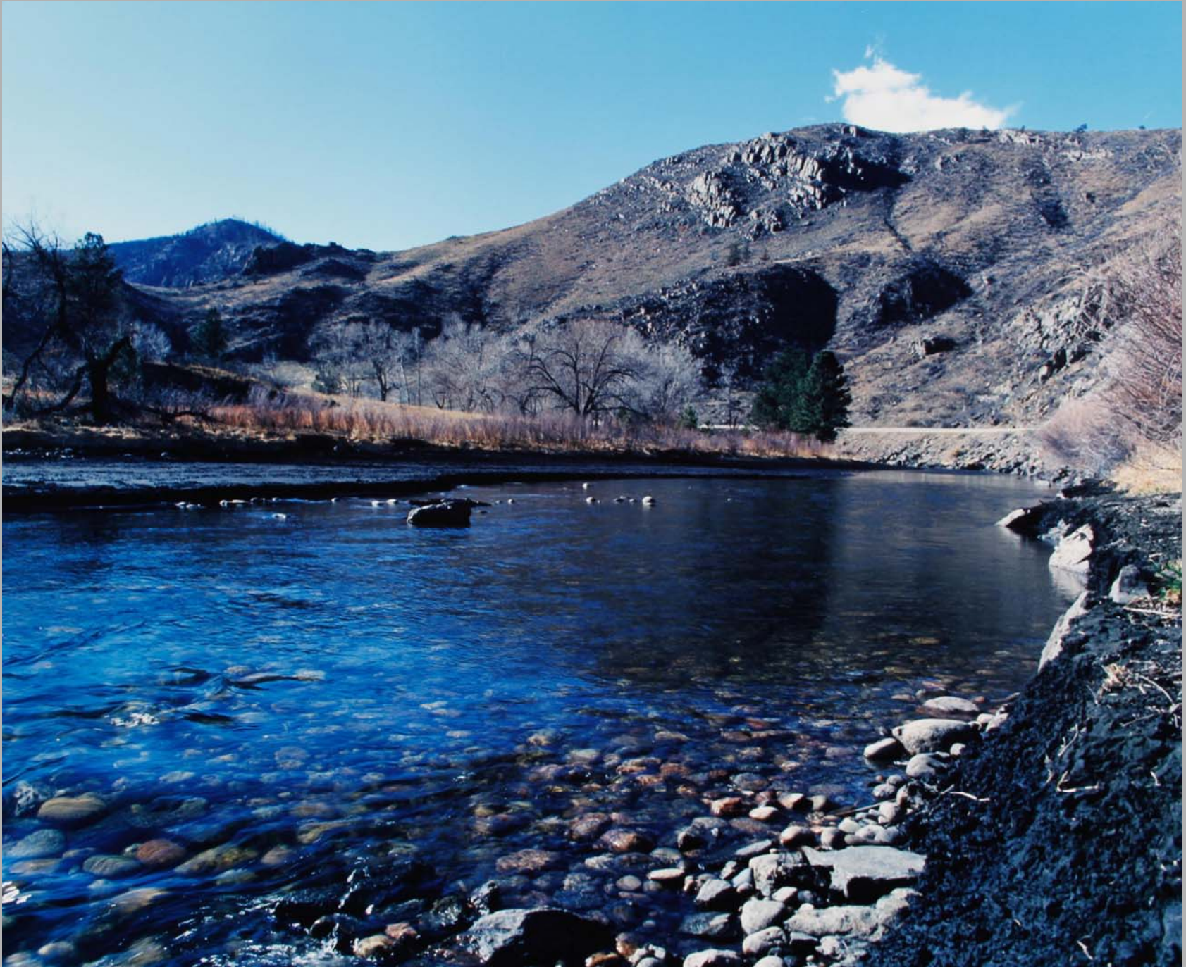
Figure 17: In the Bank 3.