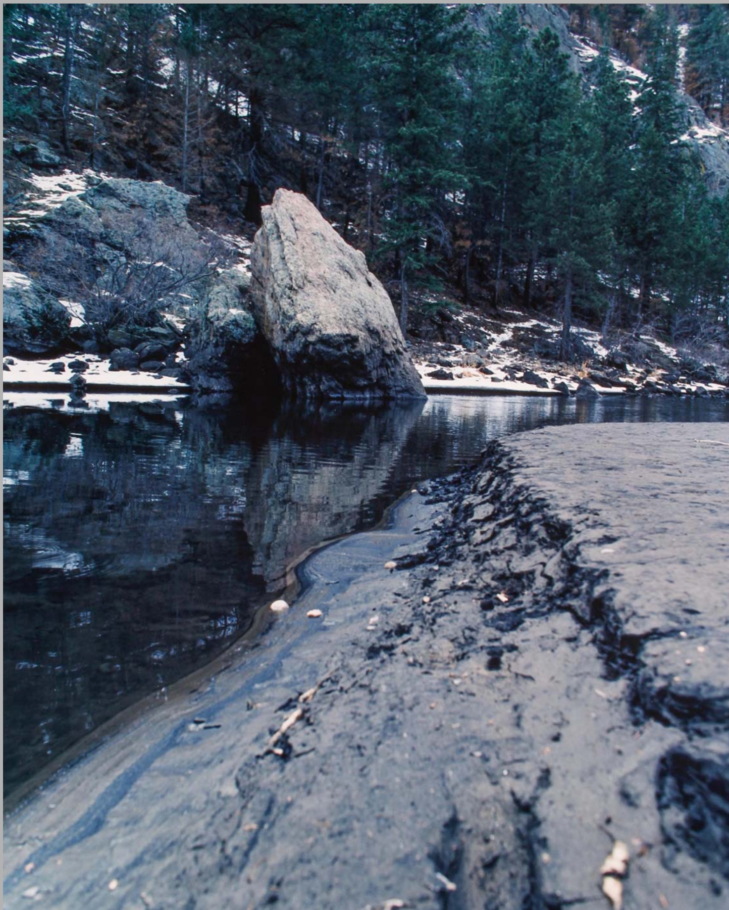
Figure 3: Picnic Rock 1.