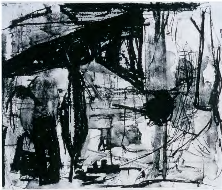
Figure 10. Story , 20"w x 16 1/2"h, Lithograph with Chine Colle, 1997