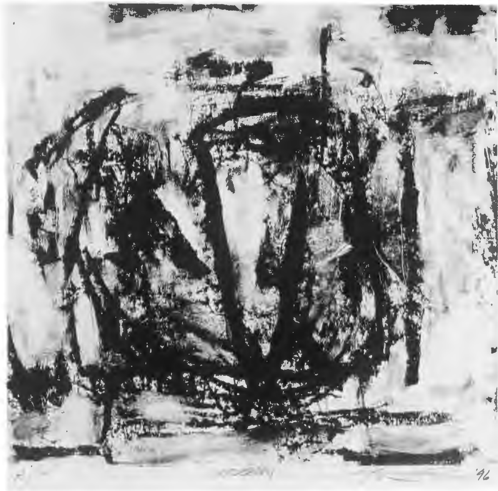
Figure 1. Woodberry , 11 5/8"w x 11"h, Lithograph, 1996