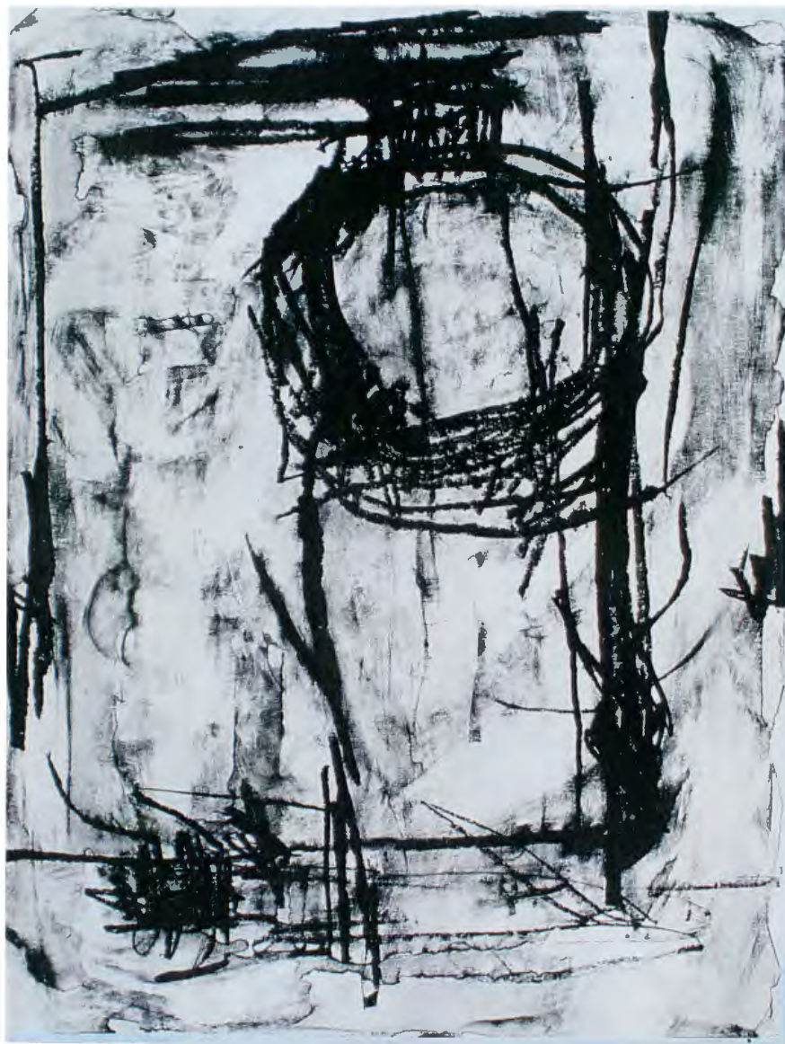
Figure 13. Untitled , 18"w x 23 1/2"h, Lithograph with Chine Colle, 1997