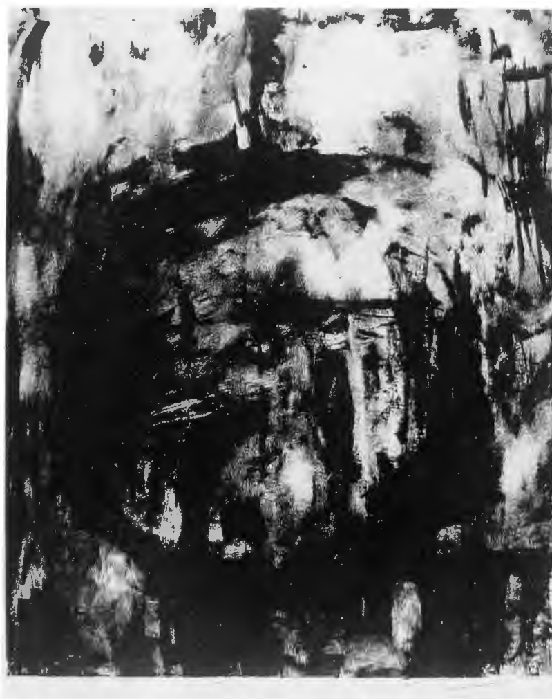
Figure 5. Extension , 10"w x 12"h, Lithograph with Chine Colle, 1997