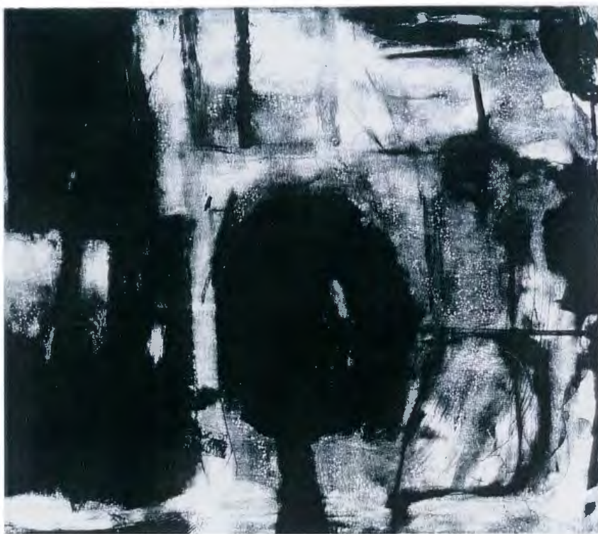
Figure 9. Formal Introduction , 16"w x 14"h, Lithograph with Chine Colle, 1997