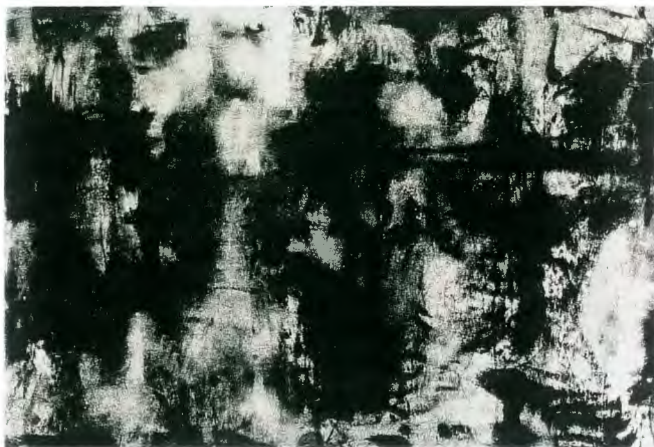
Figure 3. Currently , 11 1/2w x 8"h, Lithograph with Chine Colle, 1996 6