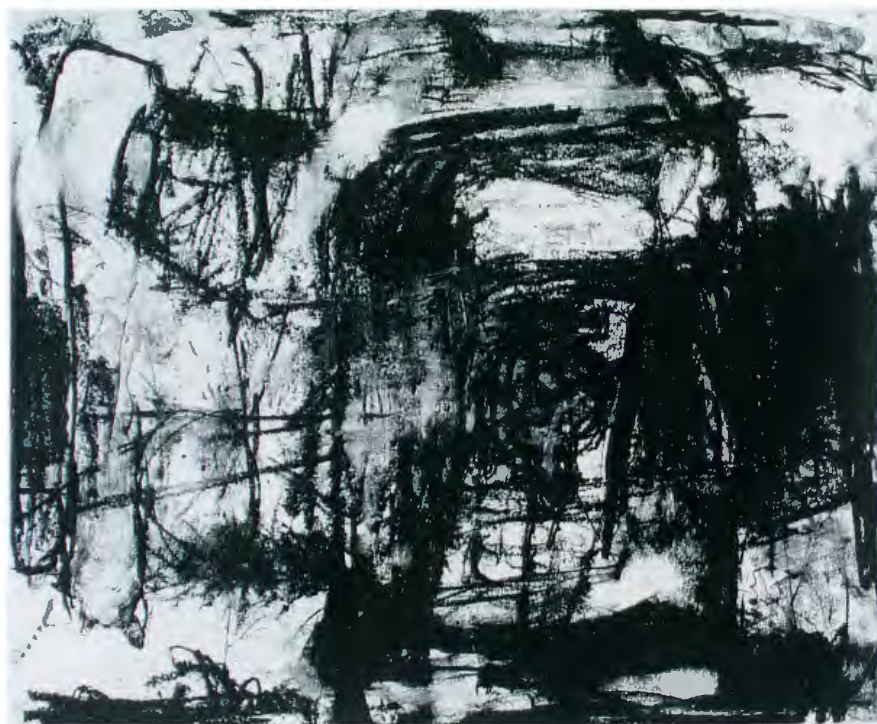
Figure 11. Television , 23 1/2"w x 19 1/2"h, Lithograph with Chine Colle, 1997