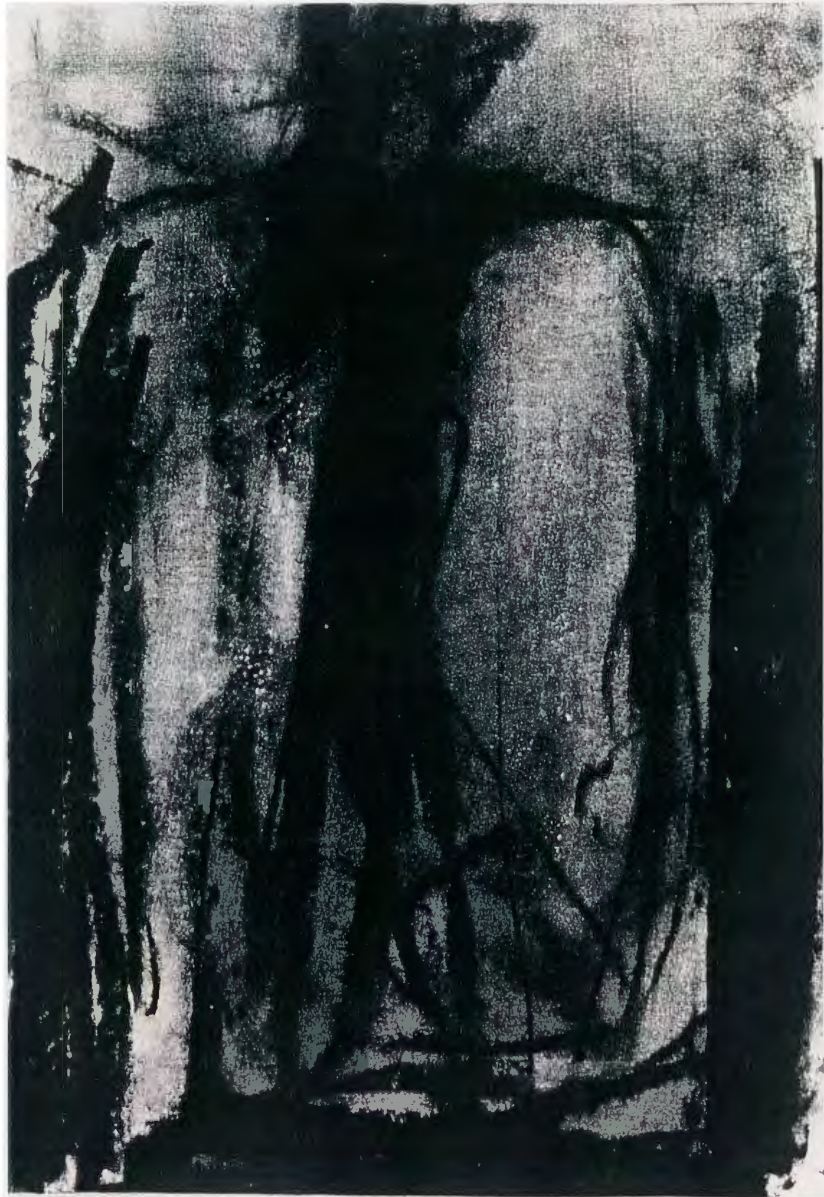
Figure 15. Vessels , 6 5/8"w x 9 1/2"h, Lithograph with Chine Colle, 1997