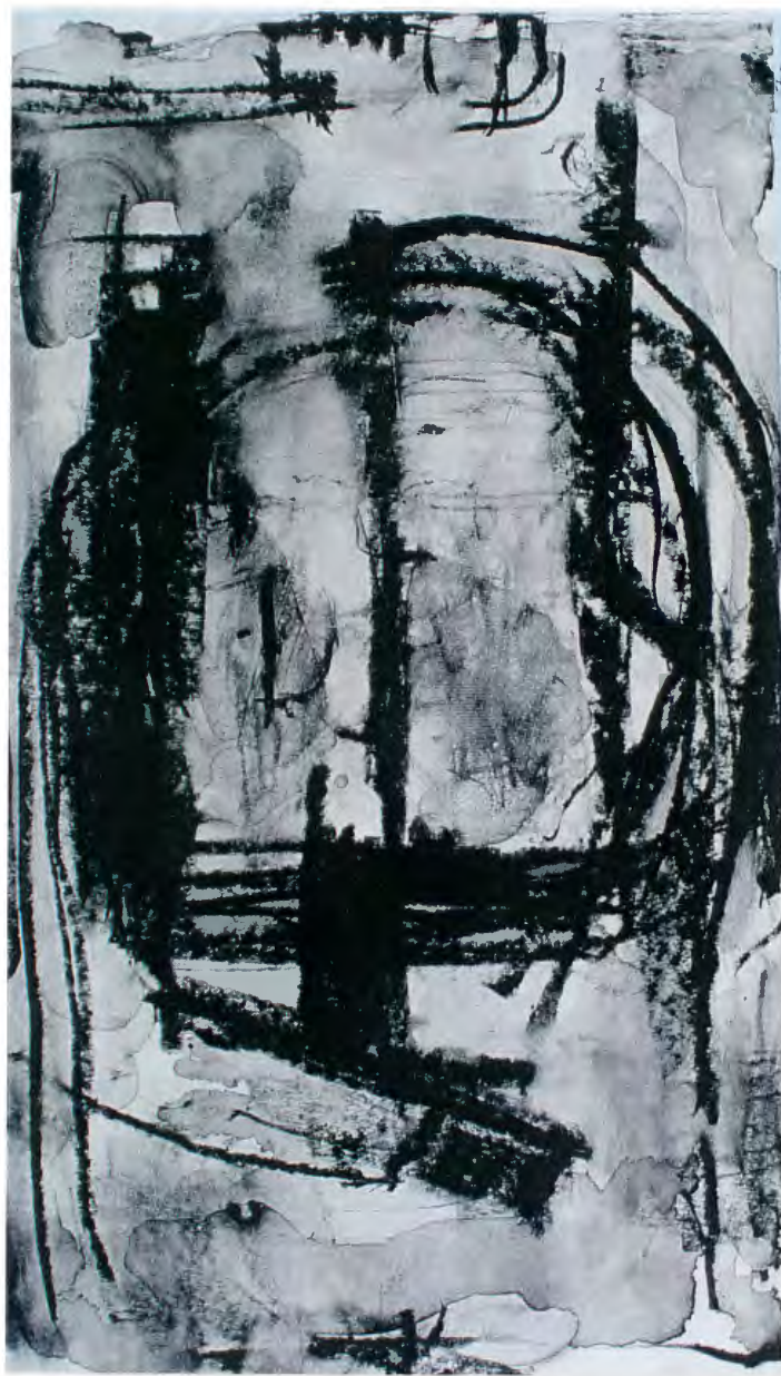
Figure 12. Untitled , 13 1/2"w x 23 1/2"h, Lithograph with Chine Colle, 1997