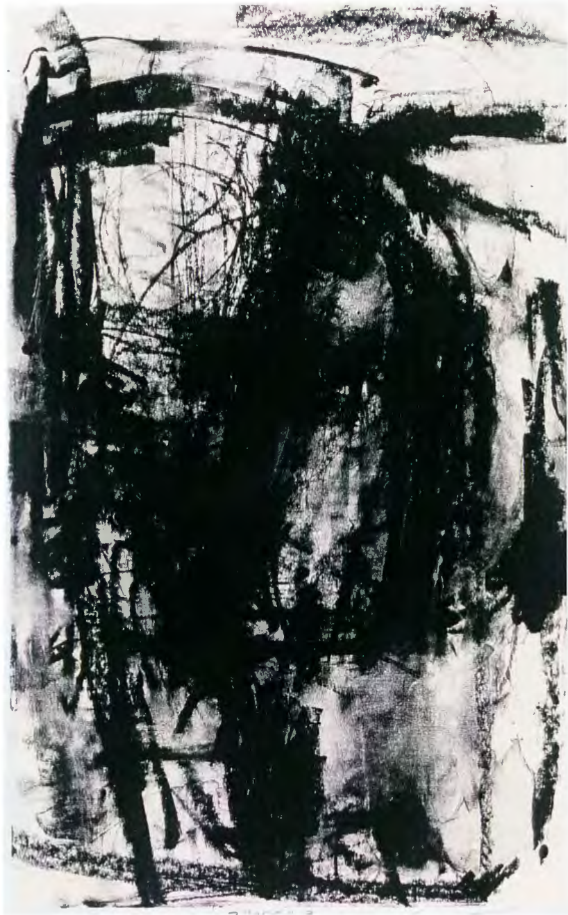
Figure 14. Broken 3 , 10 1/2"w x 17"h, Lithograph with Chine Colle, 1997