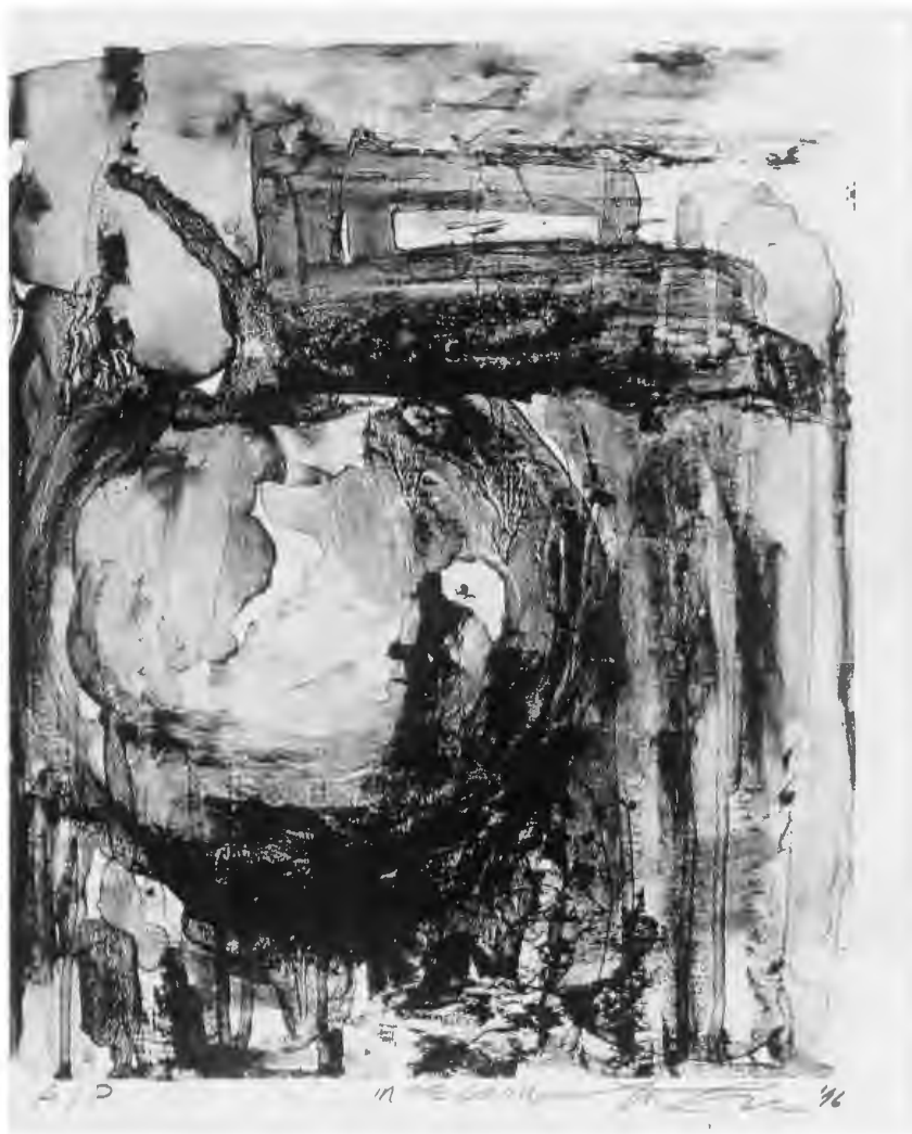
Figure 2. In the Game , 10"w x 12"h, Lithograph, 1996