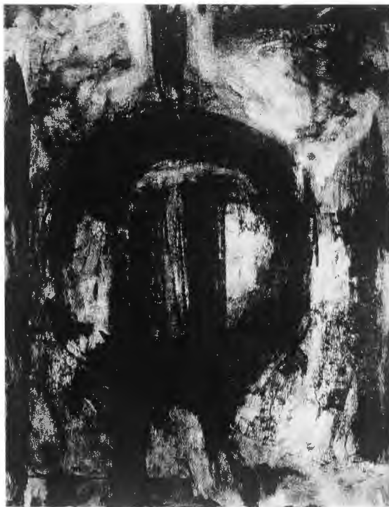
Figure 7. Unyielding , 11 1/2w x 15"h, Lithograph with Chine Colle, 1997