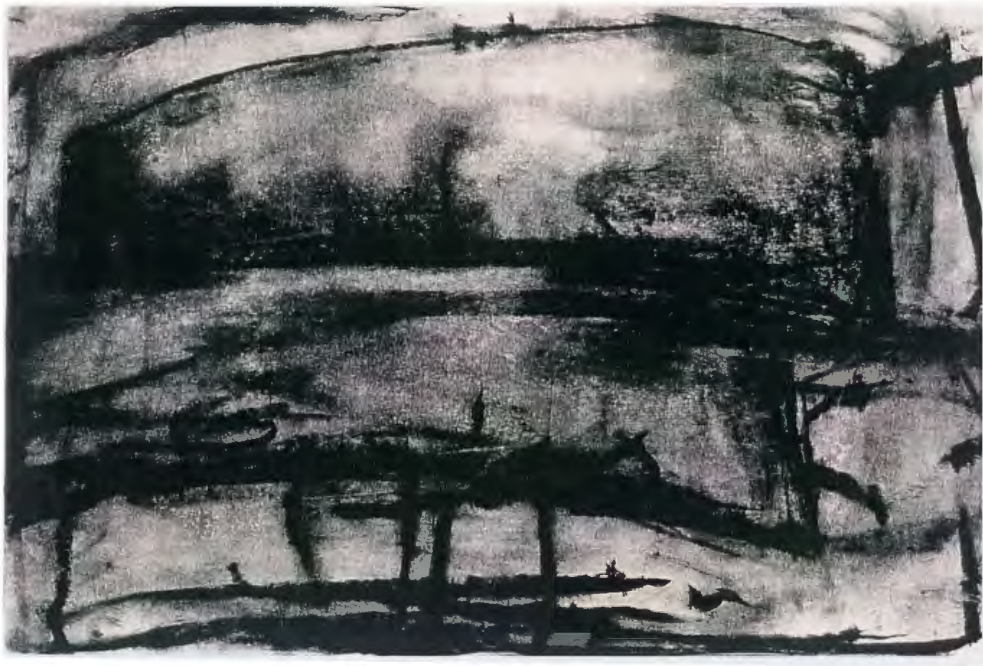
Figure 16. Adjustment , 15"w x 10"h, Lithograph with Chine Colle, 1997