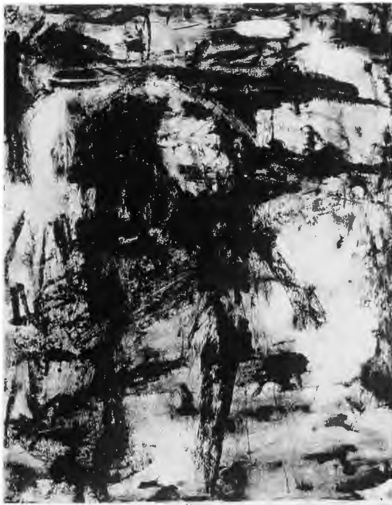
Figure 4. Foundation , 12"w x 14"h, Lithograph with Chine Colle, 1997