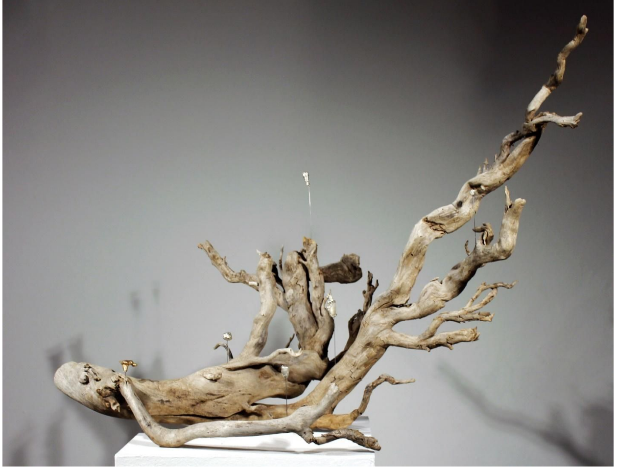
Figure 14: Dug in, Dug out