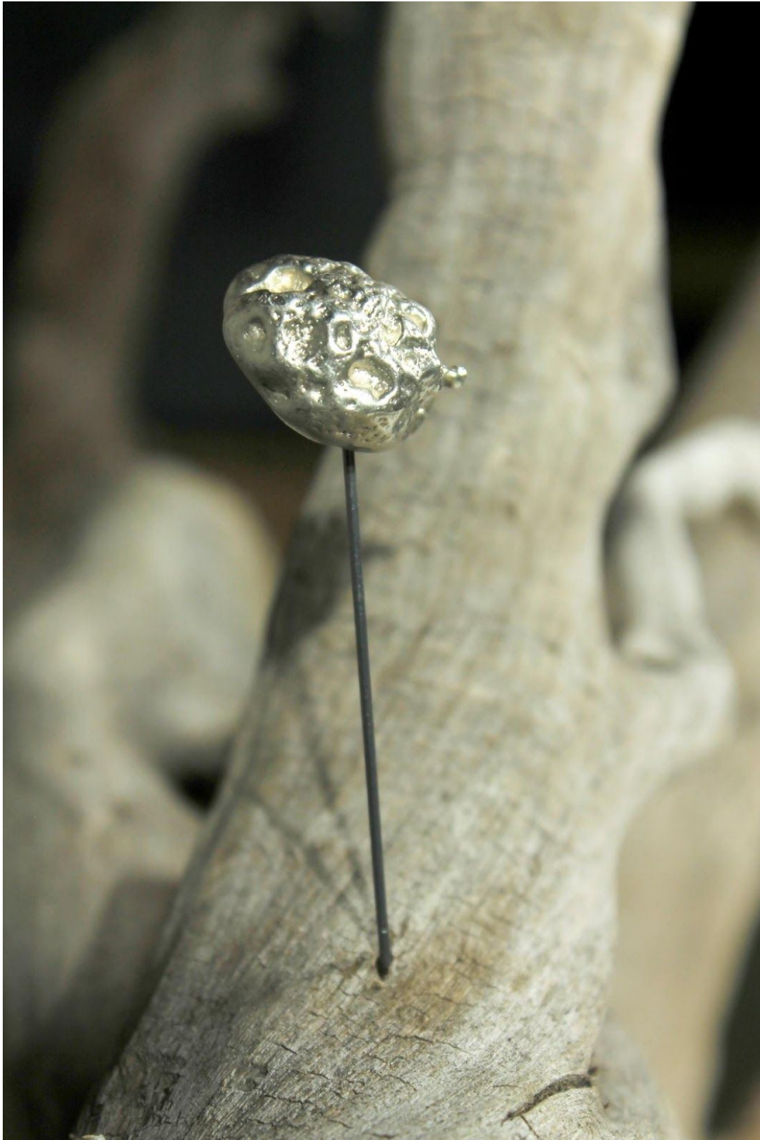
Figure 16: Dug in, Dug out, detail