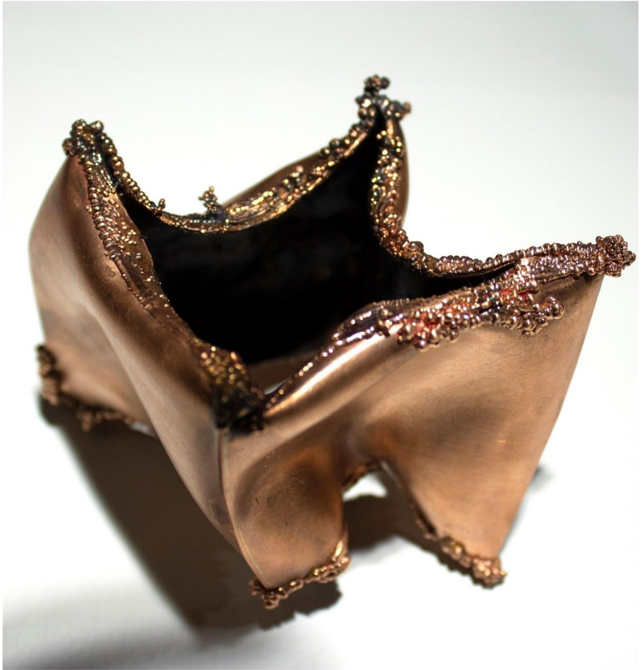
Figure 12: Nothing to Hold VII