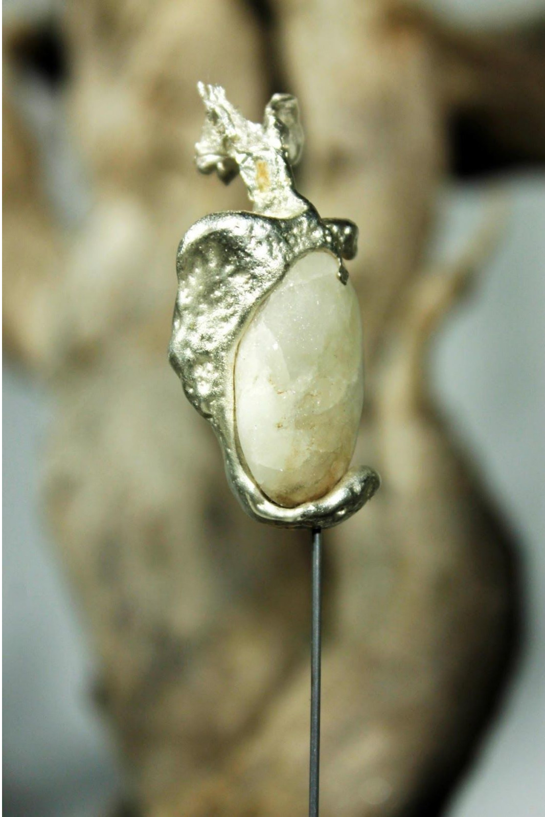
Figure 15: Dug in, Dug out, detail