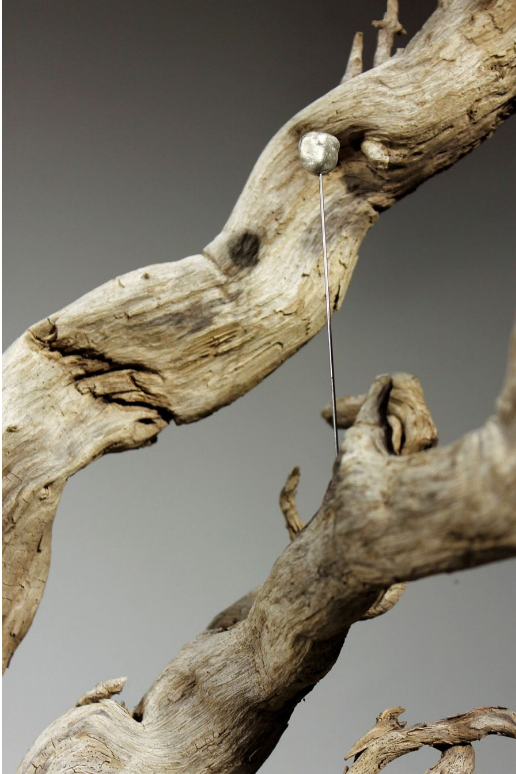
Figure 18: Dug in, Dug out, detail