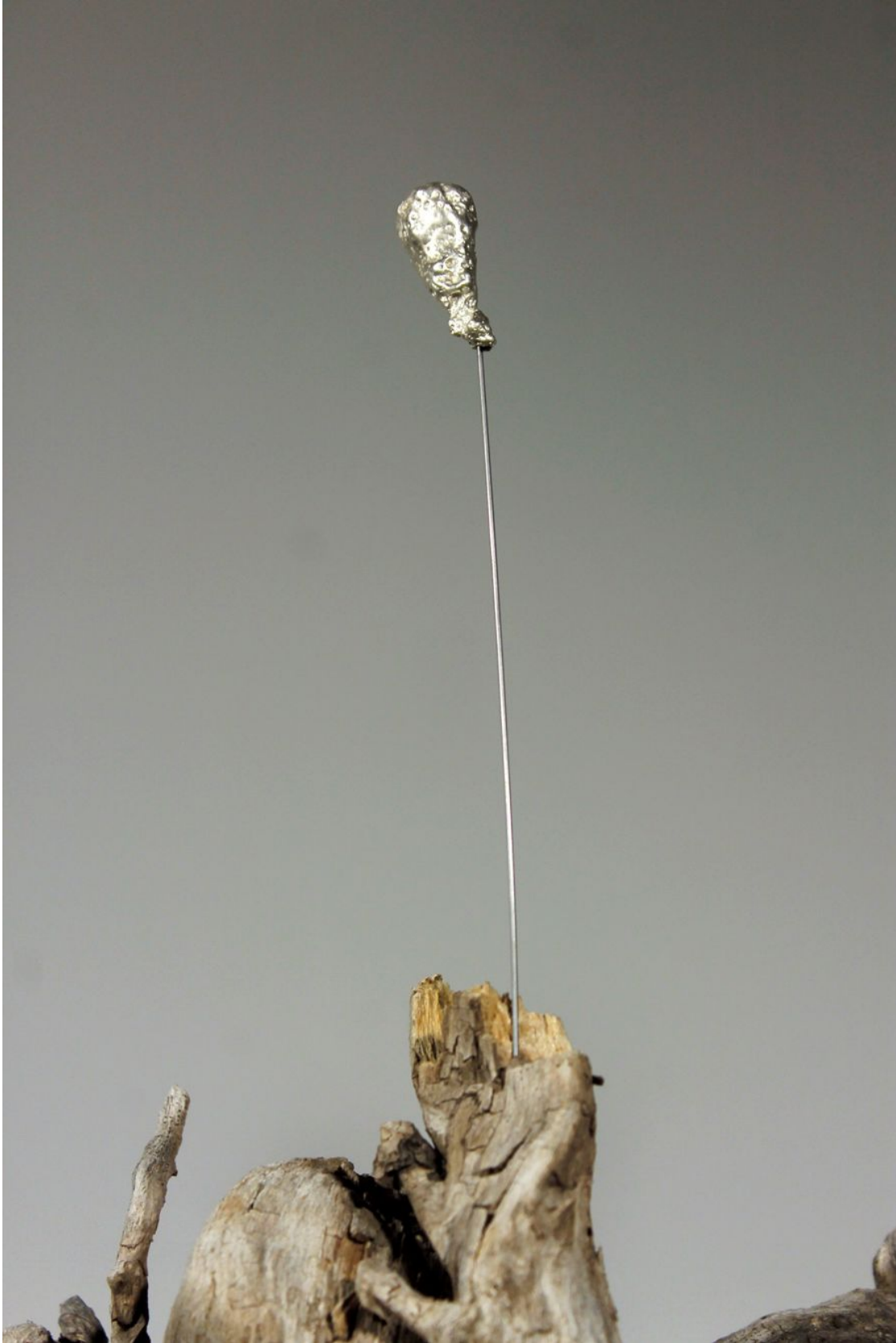
Figure 17: Dug in, Dug out, detail