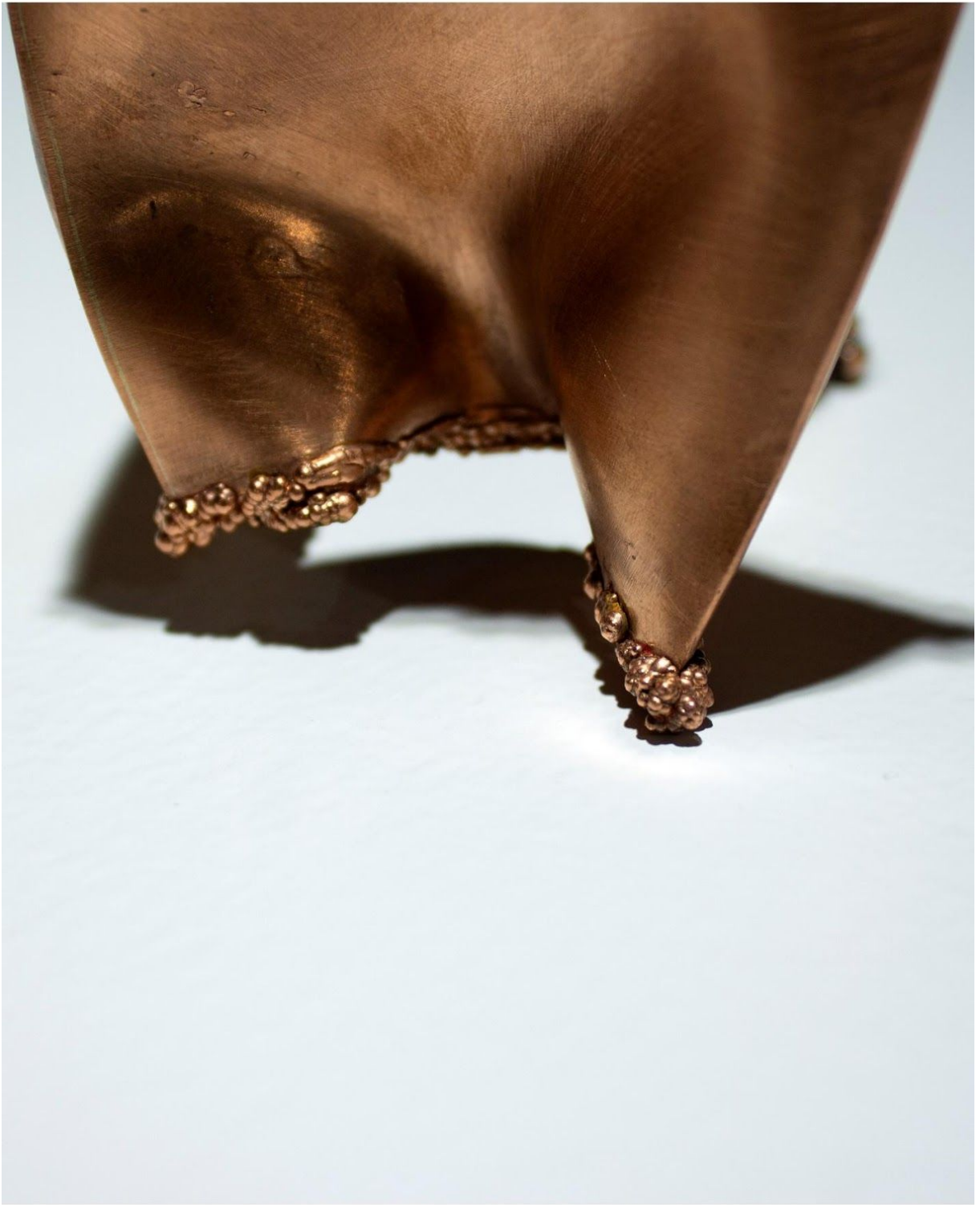
Figure 13: Nothing to Hold VII, detail