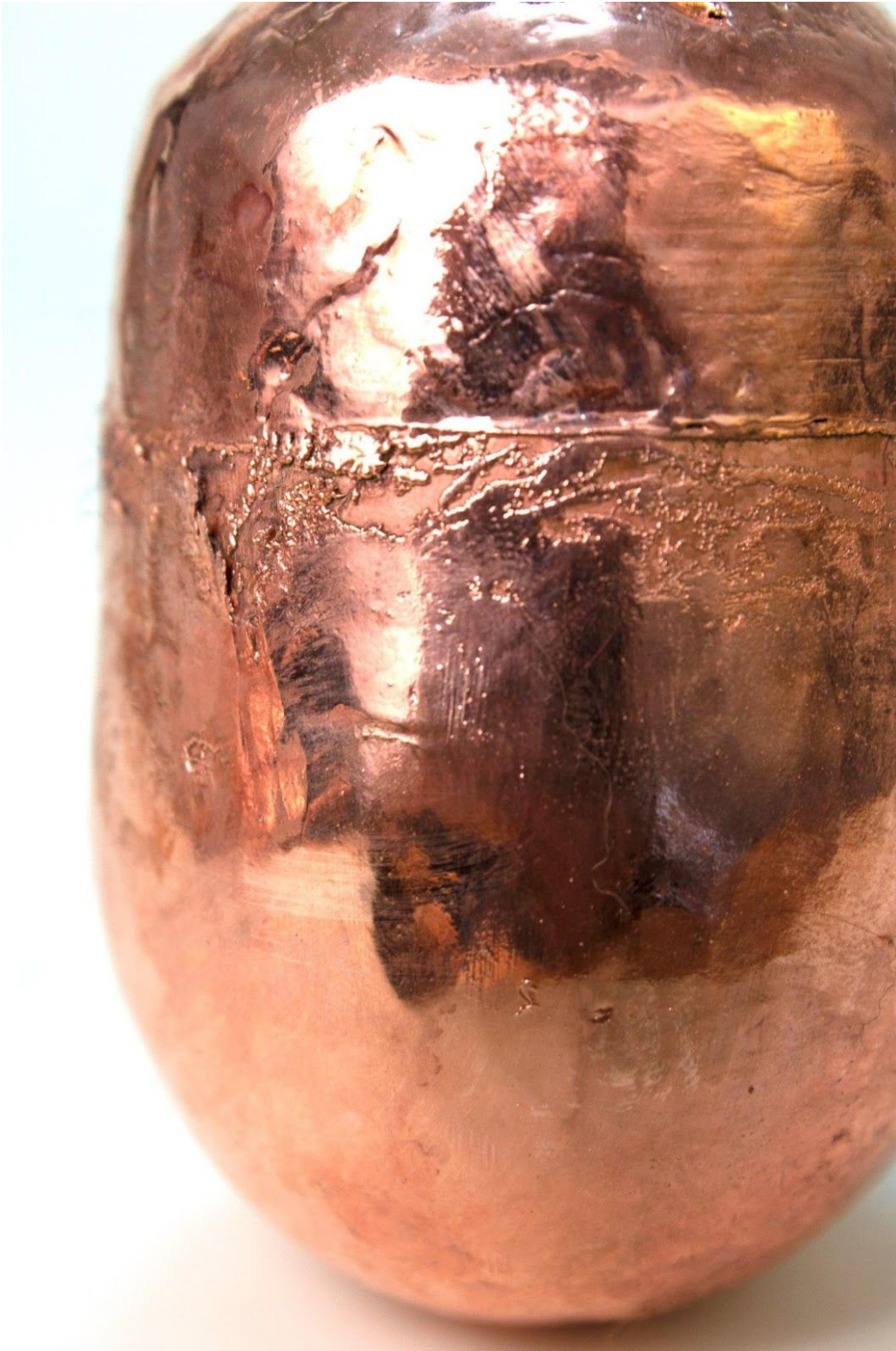
Figure 11: Nothing to Hold VI, detail