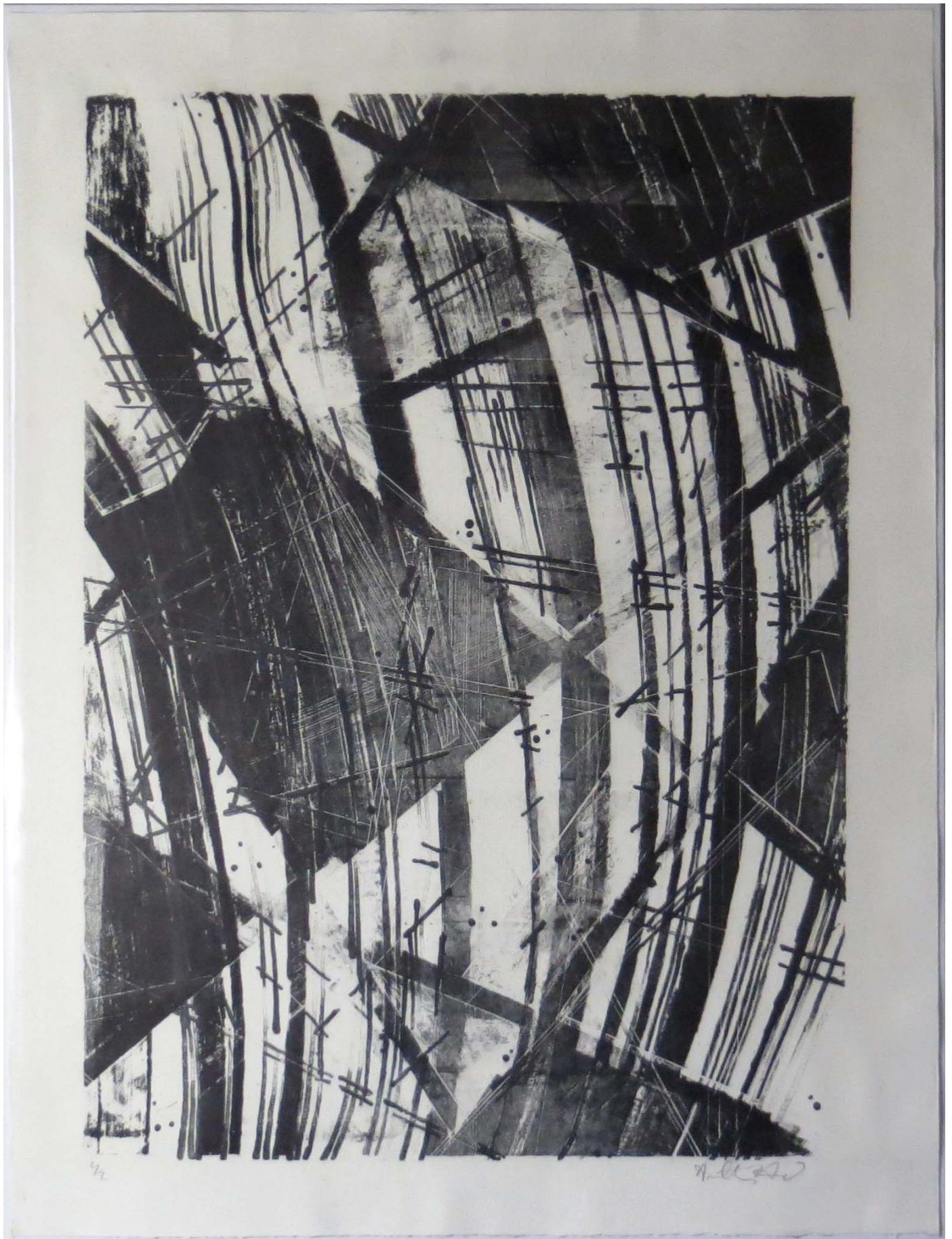
Figure 7: Veins, Natural in Lithography Stone.