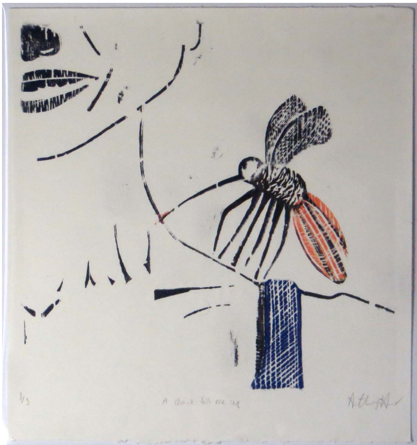
Figure 6: A Quick Fill me Up.