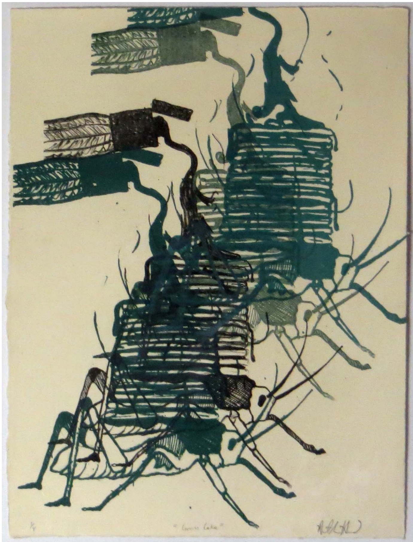
Figure 3: Grass Cakes.