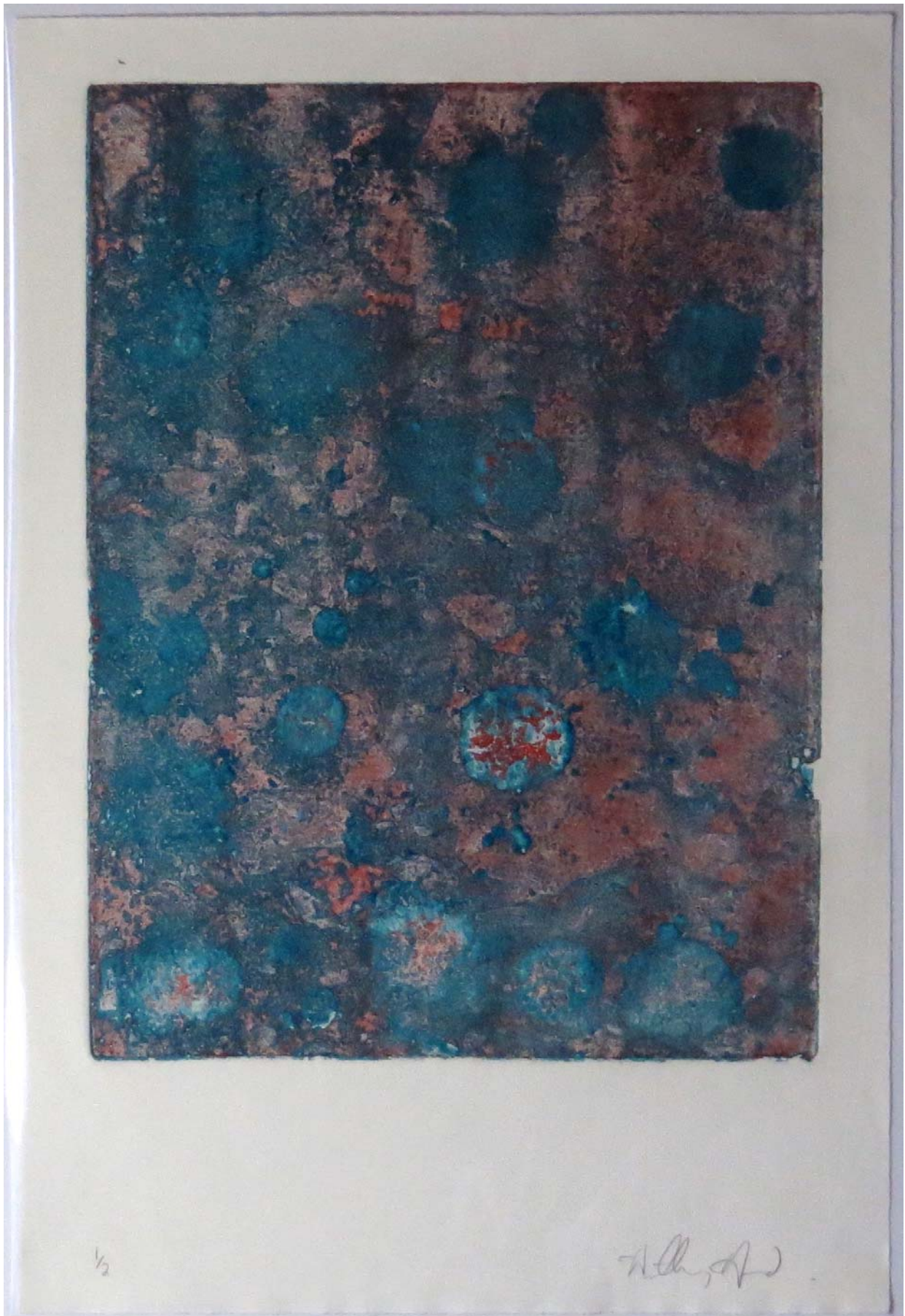
Figure 9: Viscosity Study.