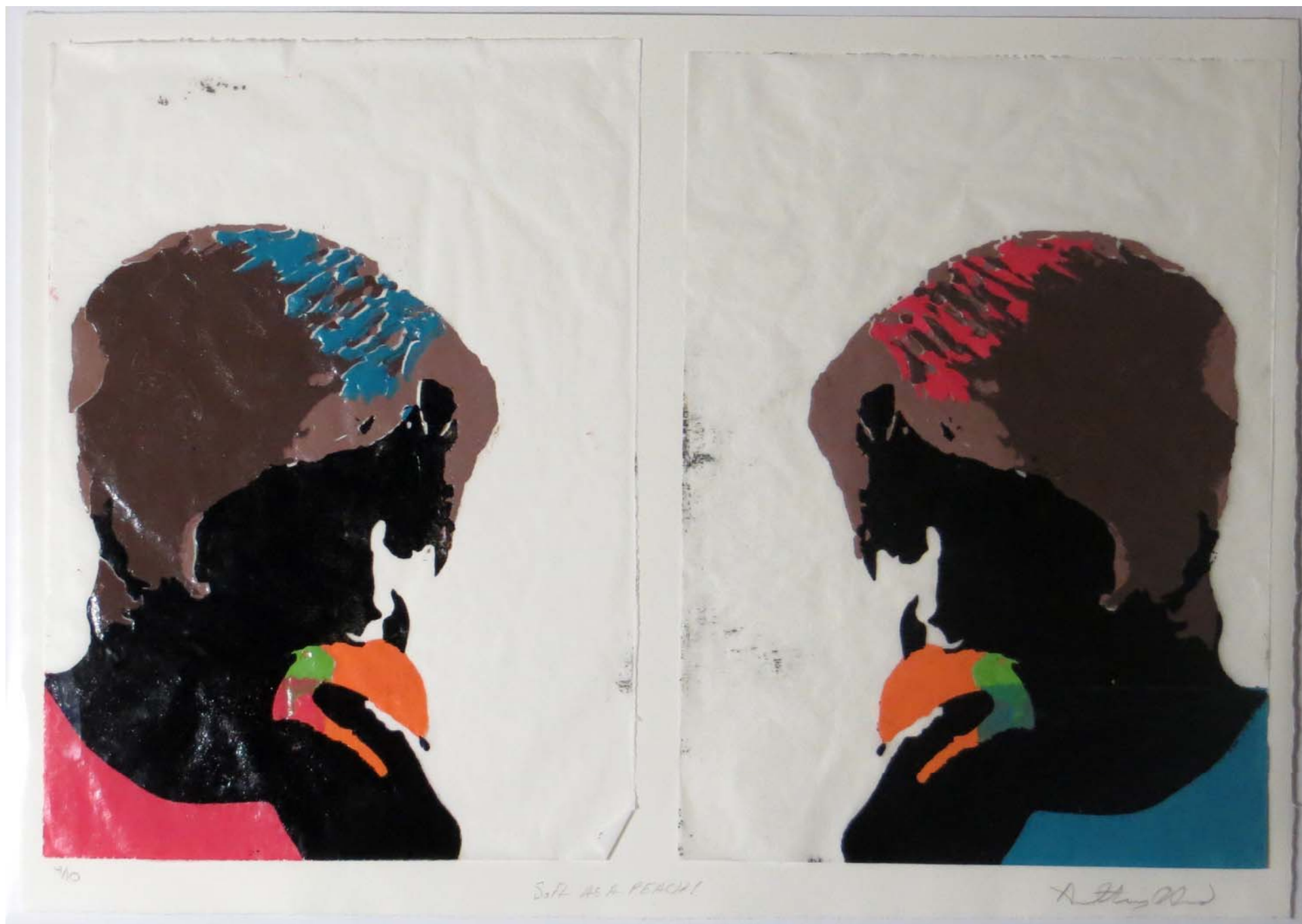
Figure 10: Soft as a Peach Study.