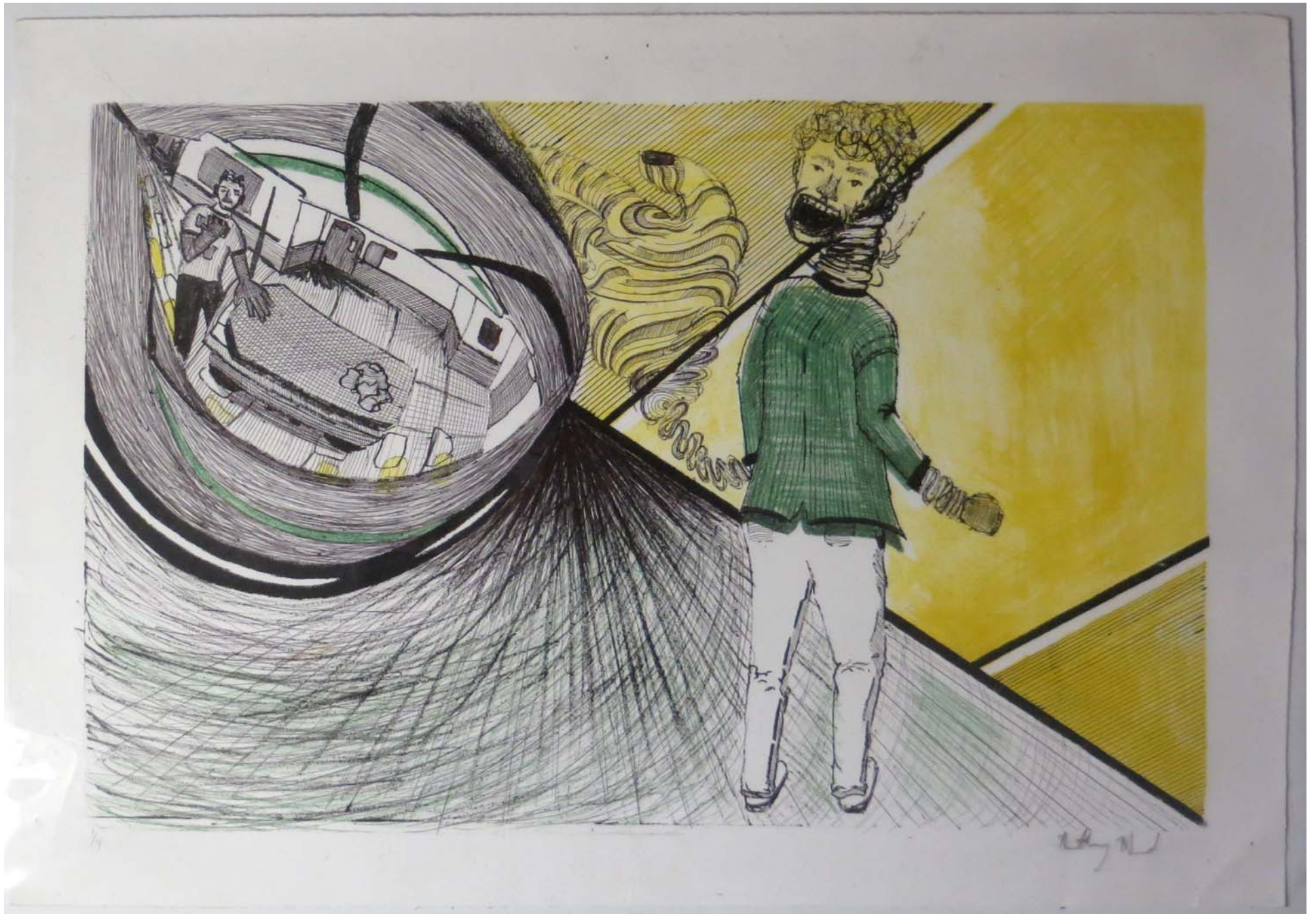
Figure 4: Psychosis.