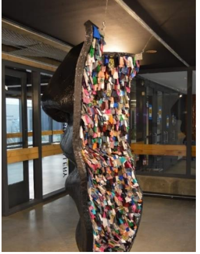
Figure 10, Patrick Price, Fragment , Glass Box Gallery CSU, 2020

dramatically in the process of making. This sculpture takes the form of a partial human face, a kind of mask. The exterior hard and impenetrable. The interior is soft, colorful, and invites haptic interaction. The exterior represents the image of the self that is presented to the world around us. The interior of this mask represents the way individuals see themselves. {Figure 10}