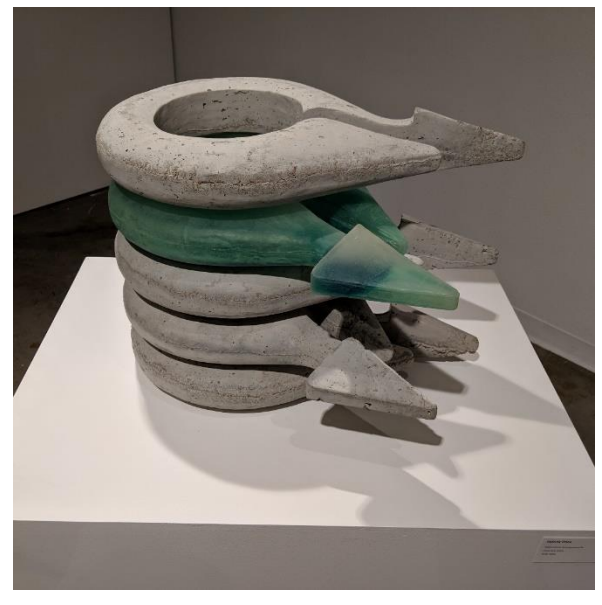
Figure 2, Patrick Price, Speculative Arrangement IX, 2018

My interest in semiotics and ancient history converged in the series of objects, installations, and images I have come to refer collectively as portals. I'm fascinated by ancient ruins and artifacts of forgotten civilizations. Archeologists postulate the date and culture of any particular object through the application of logic and science by associating it with previously discovered and studied precedents. Objects in the Portals series present the viewer with a similar problem; of objects removed from the culture that made them. {Figure 2}