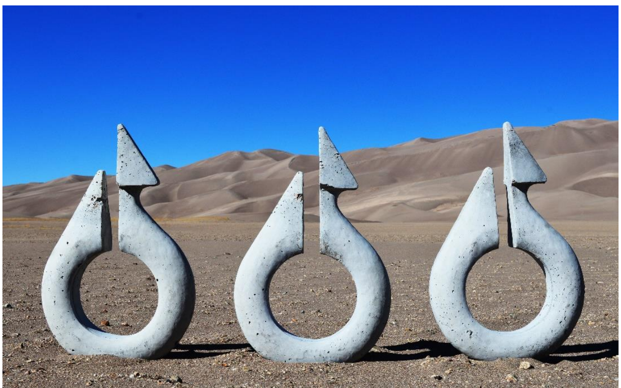
Figure 3, Patrick Price, Portals, 2018

Later I would create small Diorama-like environments for this form that were meant to stand-in for spaces outside in nature. The variable effectiveness of this method led me to what I consider to be the most successful recontextualizations of this form; a series of photographs which places the object or objects into Colorado landscapes. {Figure 3}