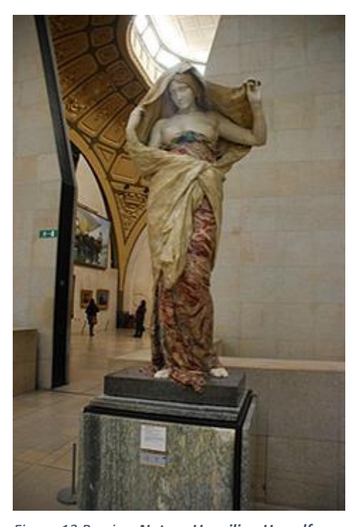
Figure 12 Barrias, Nature Unveiling Herself before Science, 1899.

Historian Pierre Hadot states, "With the rise of science and the improvement of scientific instruments, people of the 17th and 18th centuries considered that the human mind could penetrate the secrets of nature and therefore raise the veil of Isis."7 Barrias' sculpture, Nature Unveiling Herself to Science, {Figure 12}, reflects this new sensibility, that human