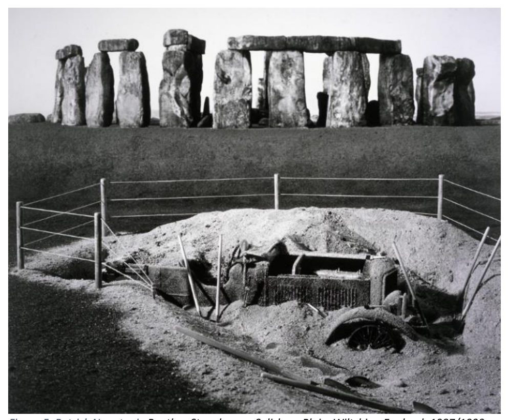
Figure 5, Patrick Nagatani, Bentley, Stonehenge, Salisbury Plain, Wiltshire, England, 1987/1999

The photographer Patrick Nagatani creates photographs by building elaborate miniature sets and by staging them in a way that connects them to other sites and landscapes, inventing fictional histories of mysterious lost cultures. {Figure 5}