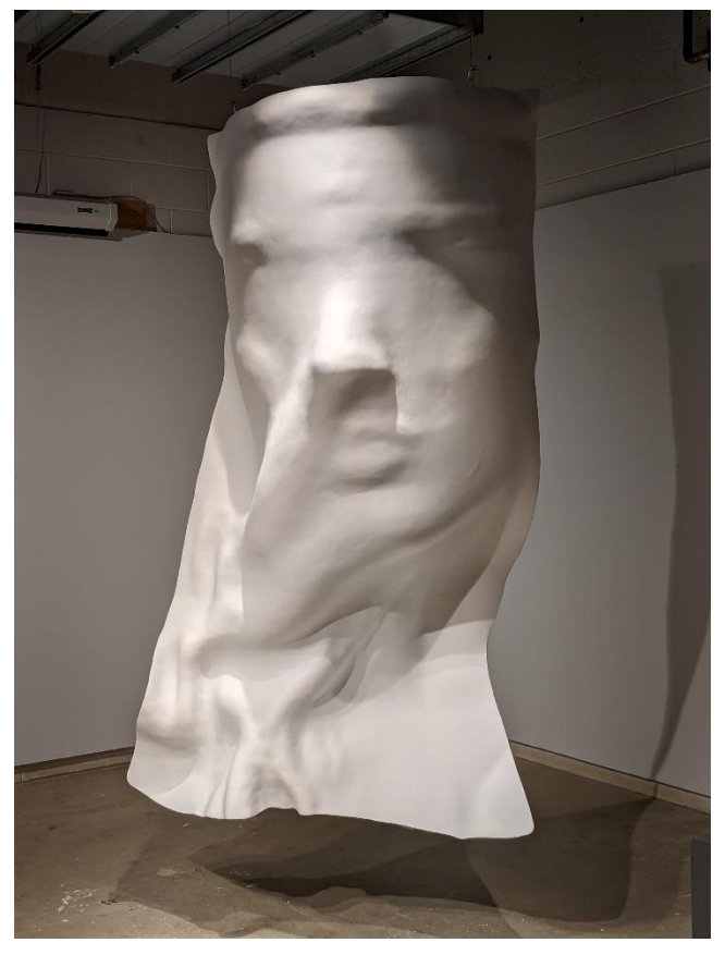
Figure 13, Patrick Price, The Veil of Isis, 2021

The Veil of Isis is many things at once; a multi-valent metaphor. The Veil appears to be fabric, draped across and partially defining the face and neck of a woman as it presses against them by the force of a breeze. {Figure 13} This seven-foot-tall object appears to hover, hanging