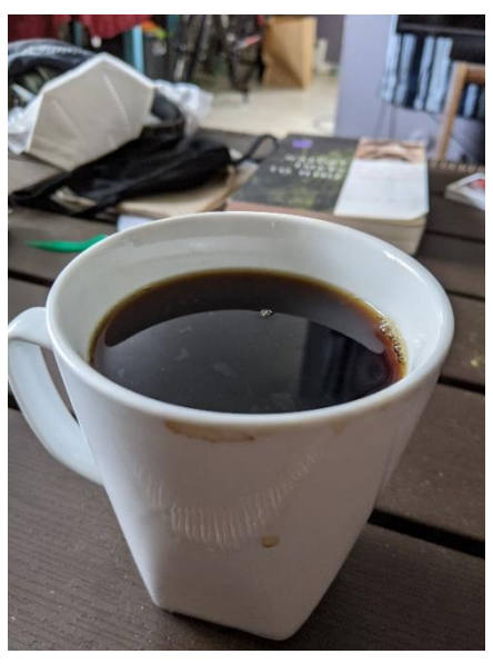
Figure 1, a coffee cup

beginning of a model that creates the abstract notion of a self that inhabits this world. But there is more to the nature of reality than what the senses can tell. Is a coffee cup real? While reading the description of the coffee cup, you created a picture in your mind, incorporating the minute details I shared about it. If you were to compare it to a photograph of the same cup, how much would your mental image of the cup align with the photograph? {Figure 1}