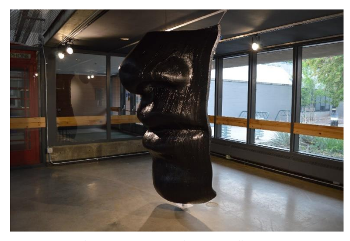
Figure 6, Patrick Price, Fragment , Glass Box Gallery CSU, 2020

Fragment is a sculpture about identity and the conflict between the internal and external ideas pf self. {Figure 9} Like the self, the form and meaning of this work changed