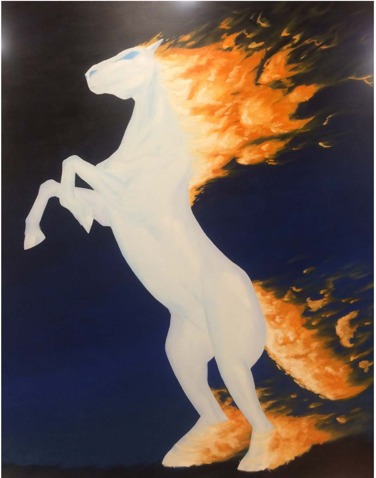
Figure 2: Colorado Horse.