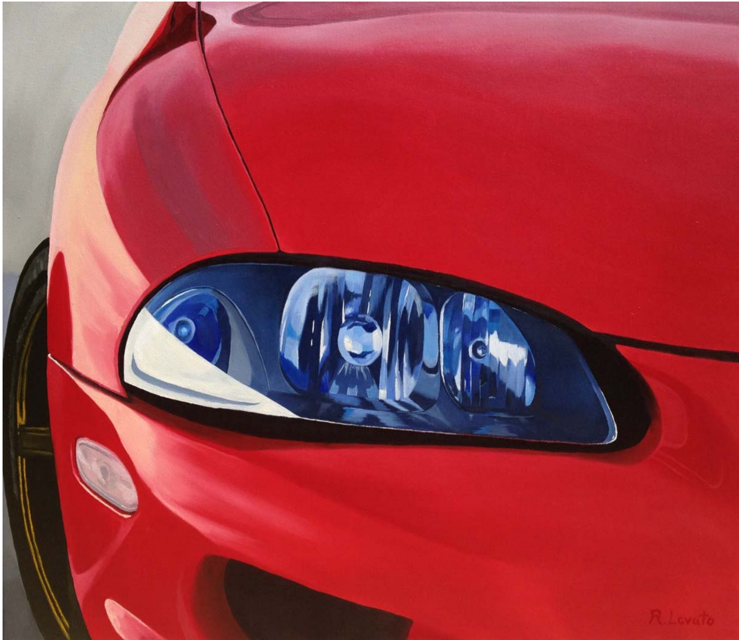
Figure 5: Headlight.