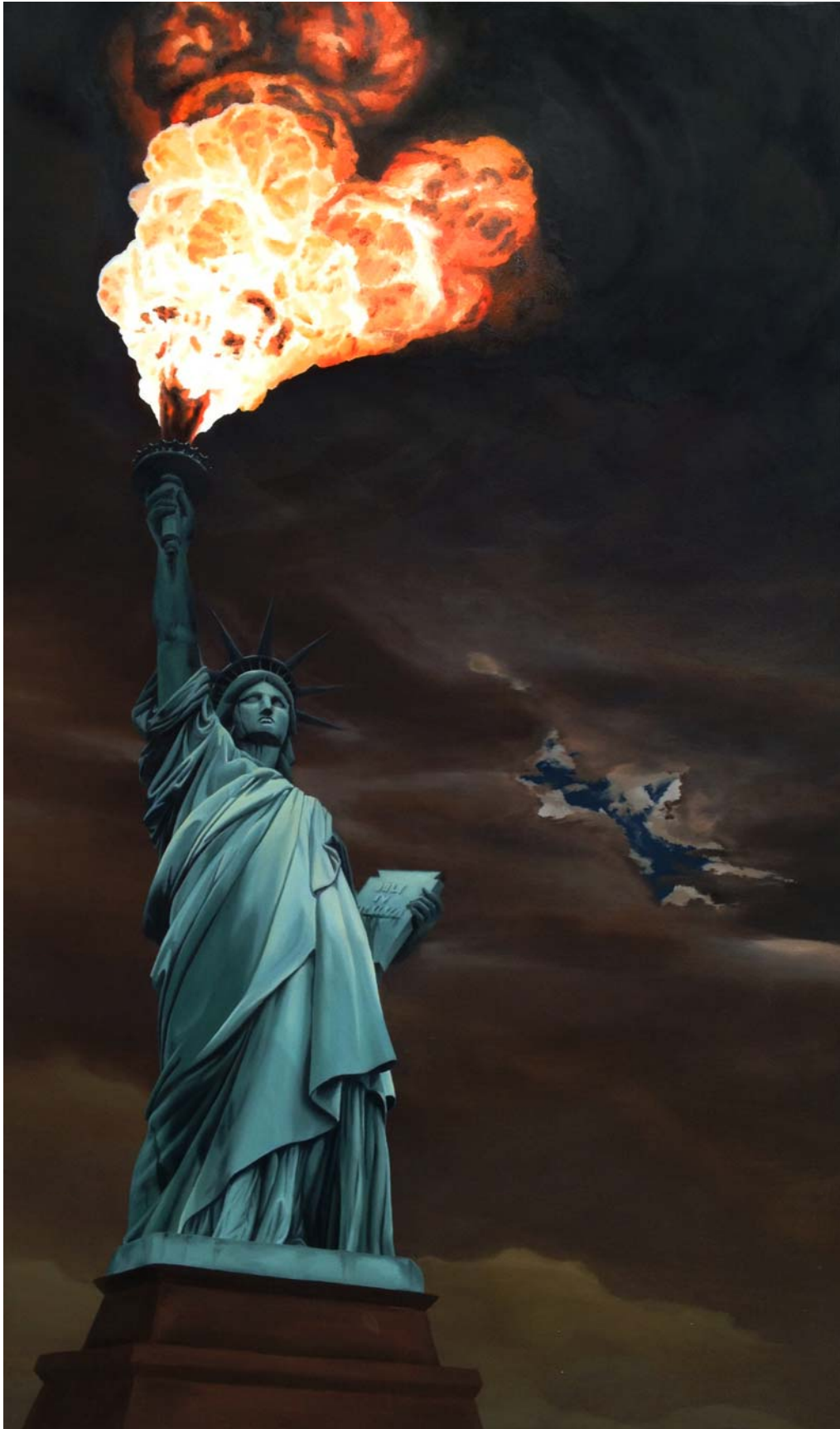
Figure 3: Consumption.