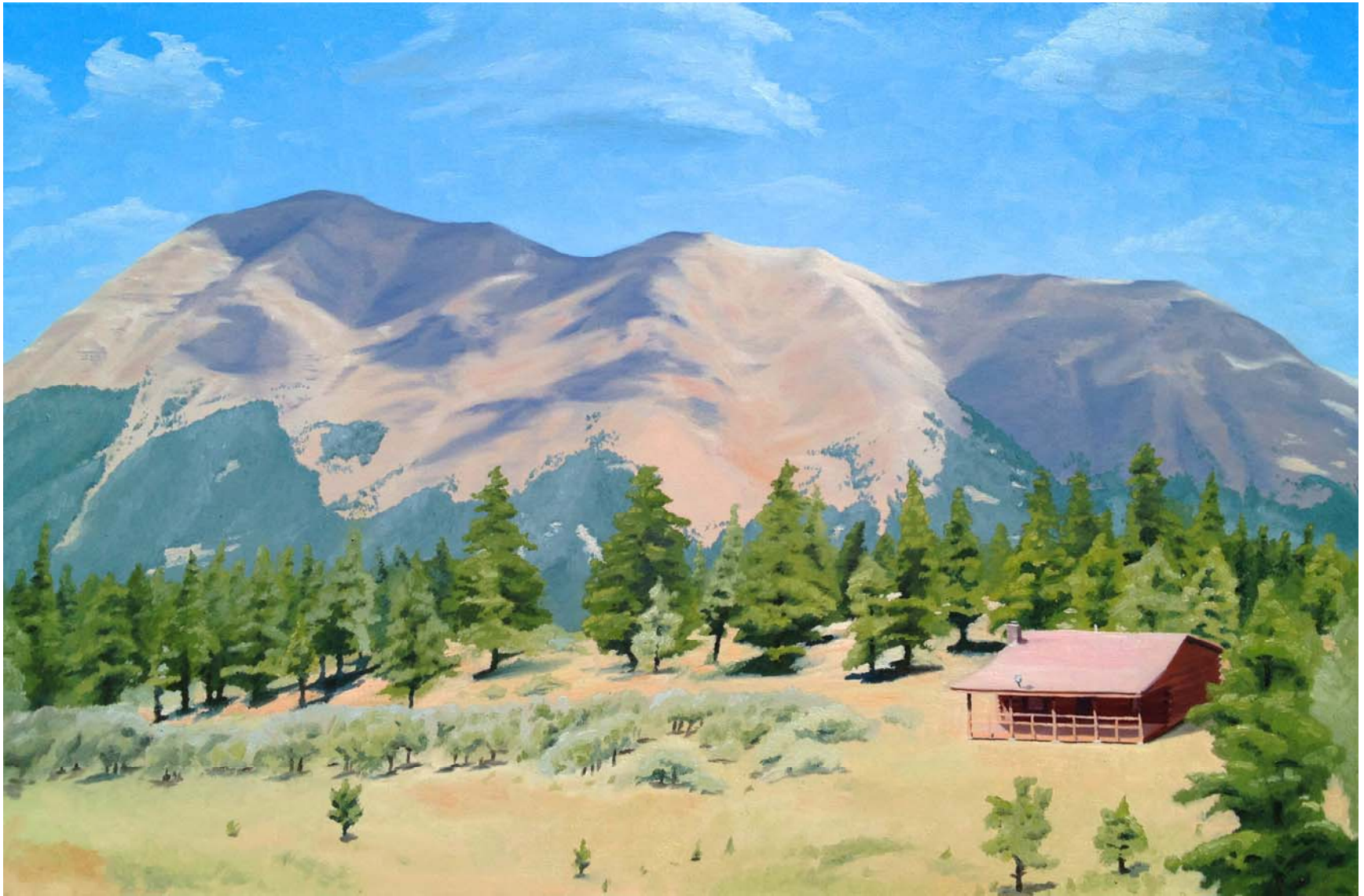
Figure 1: Cabin.