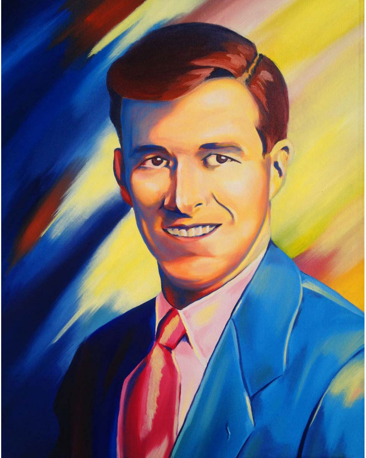
Figure 4: Grandpa.