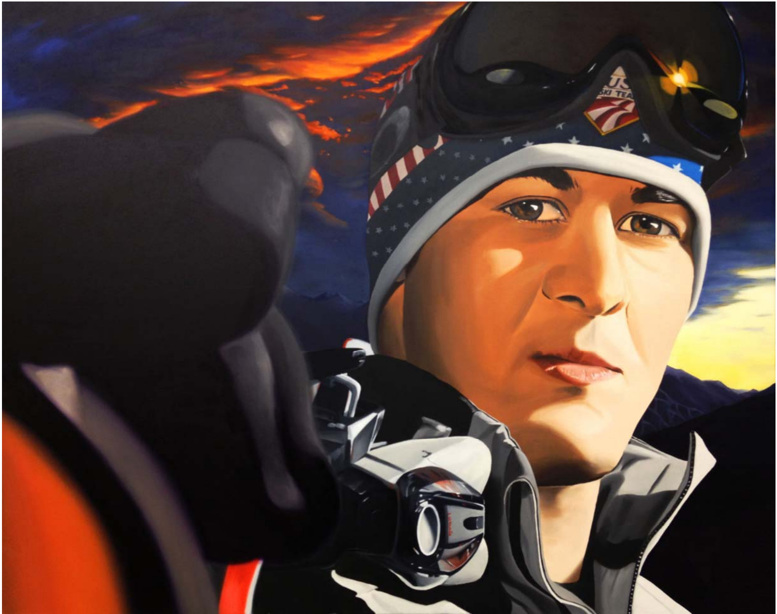
Figure 7: Self Portrait.