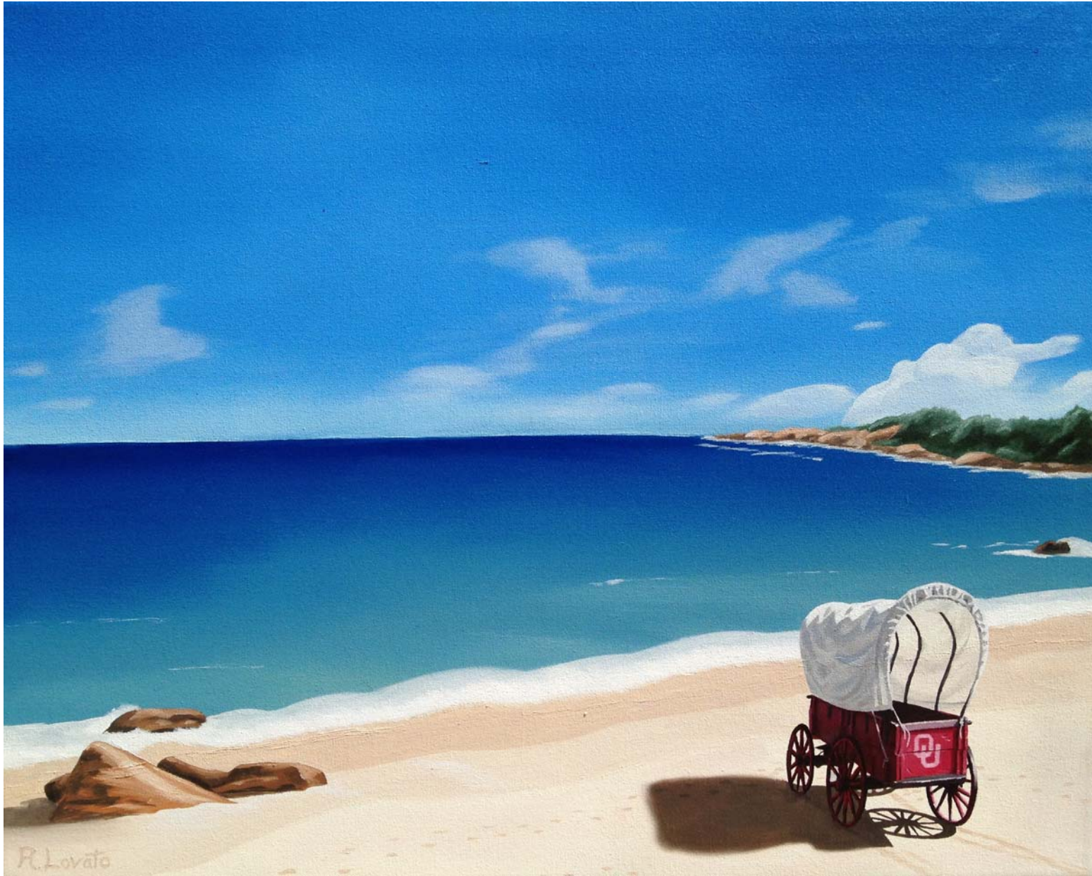
Figure 10: Sooner Vacation.