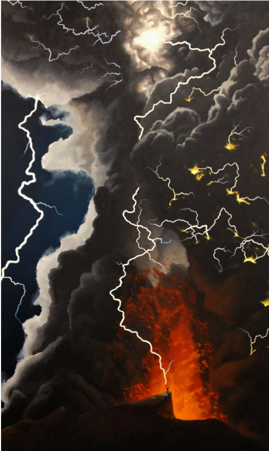
Figure 8: Shaman.