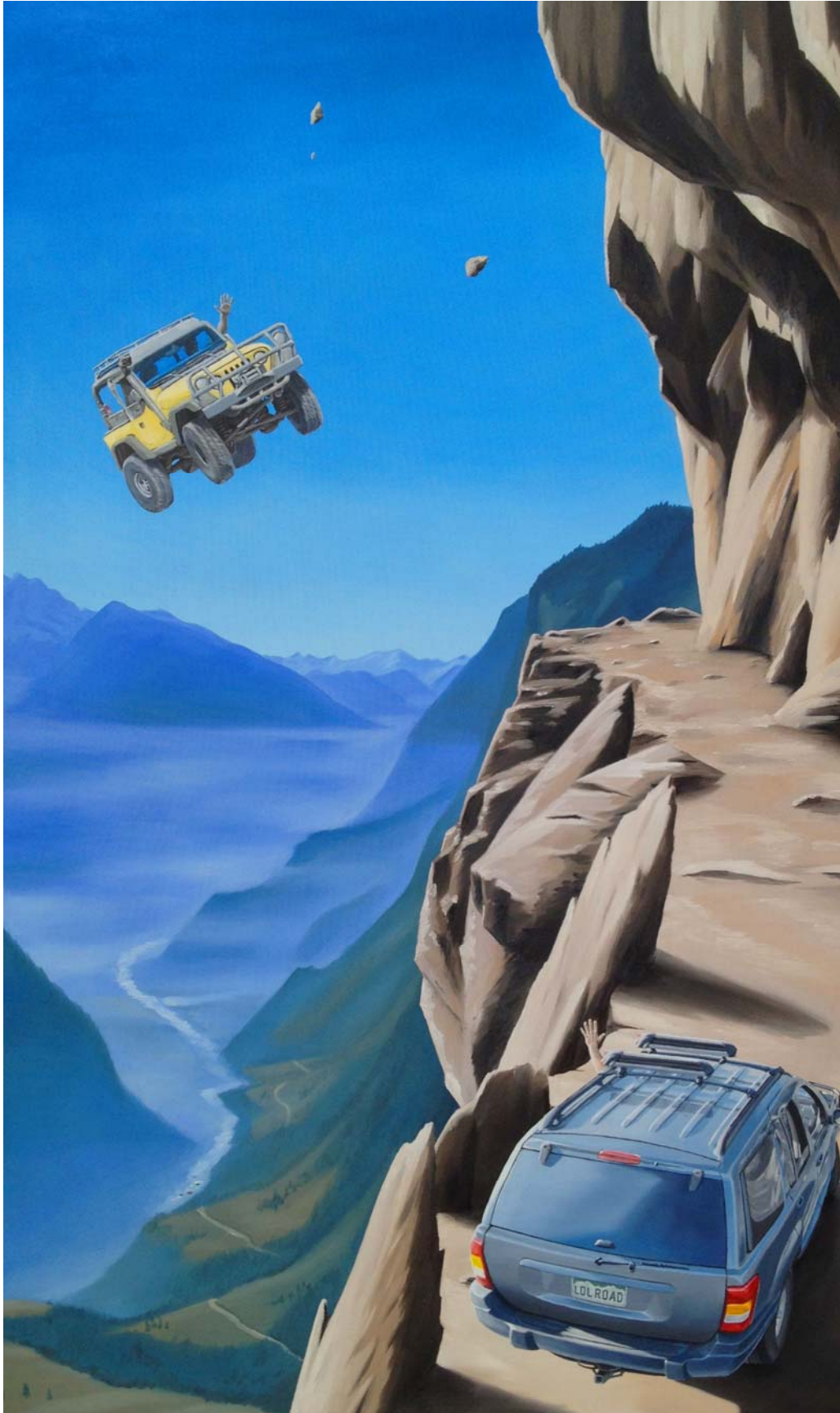
Figure 6: Jeep Wave.