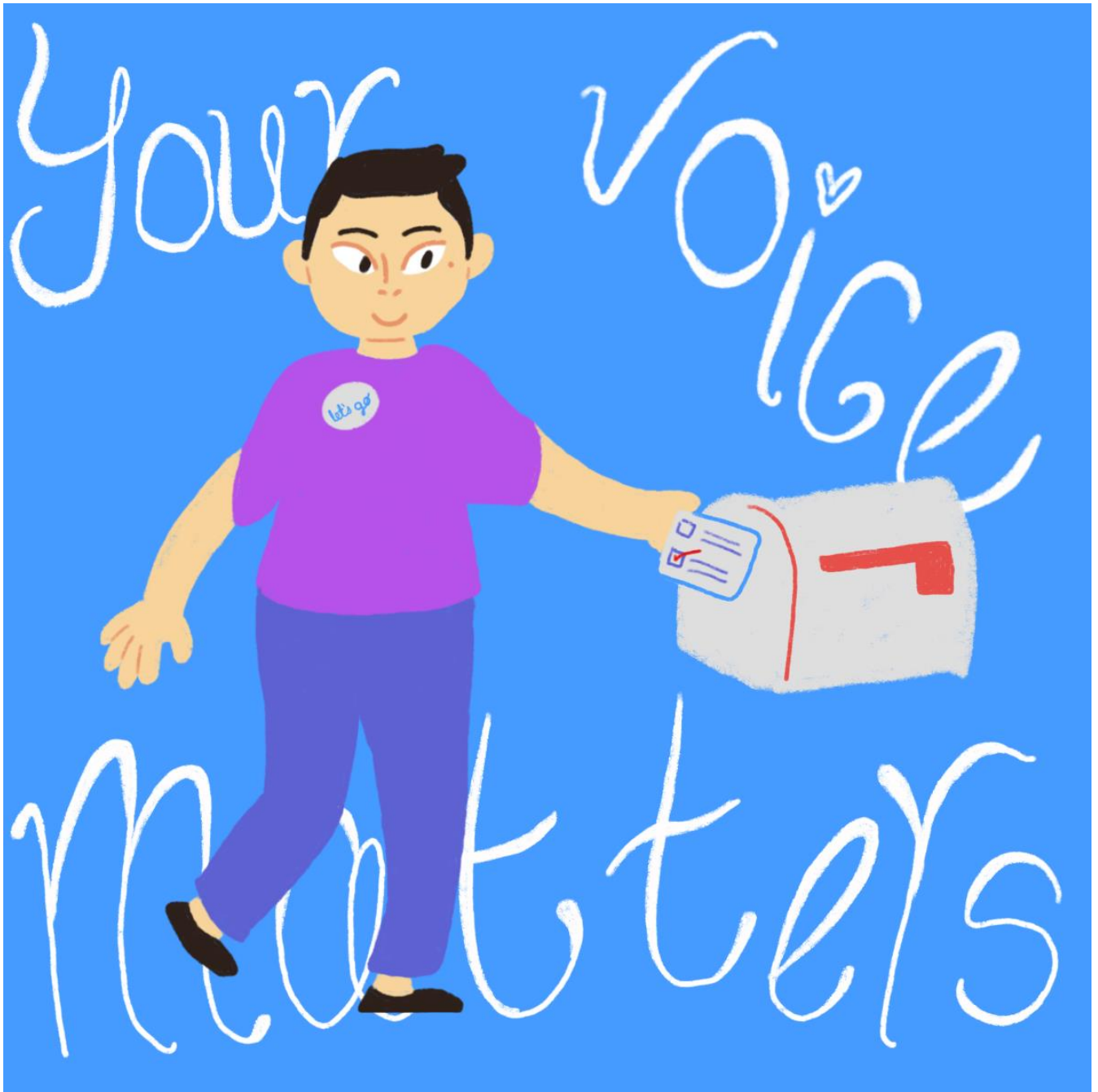
Figure 7: Let's Go Vote Illustration 2