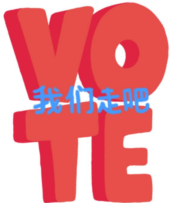
Figure 5: Let's Go Vote Logo