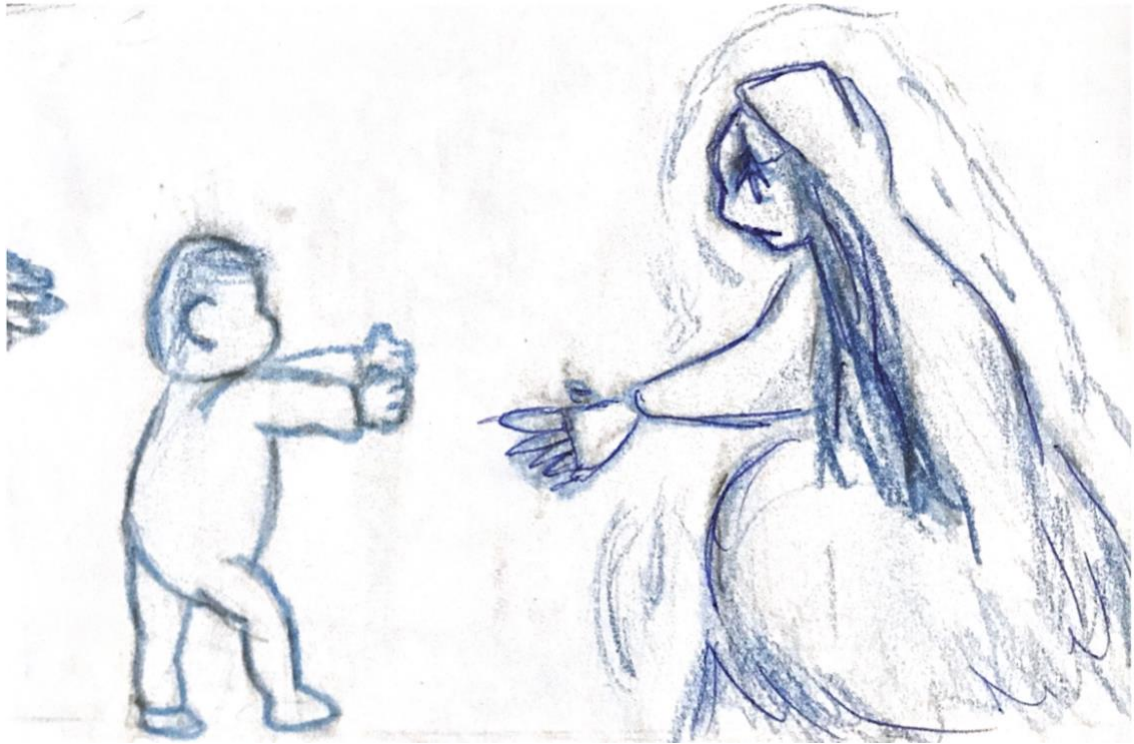
Figure 2: La Llorona Figure