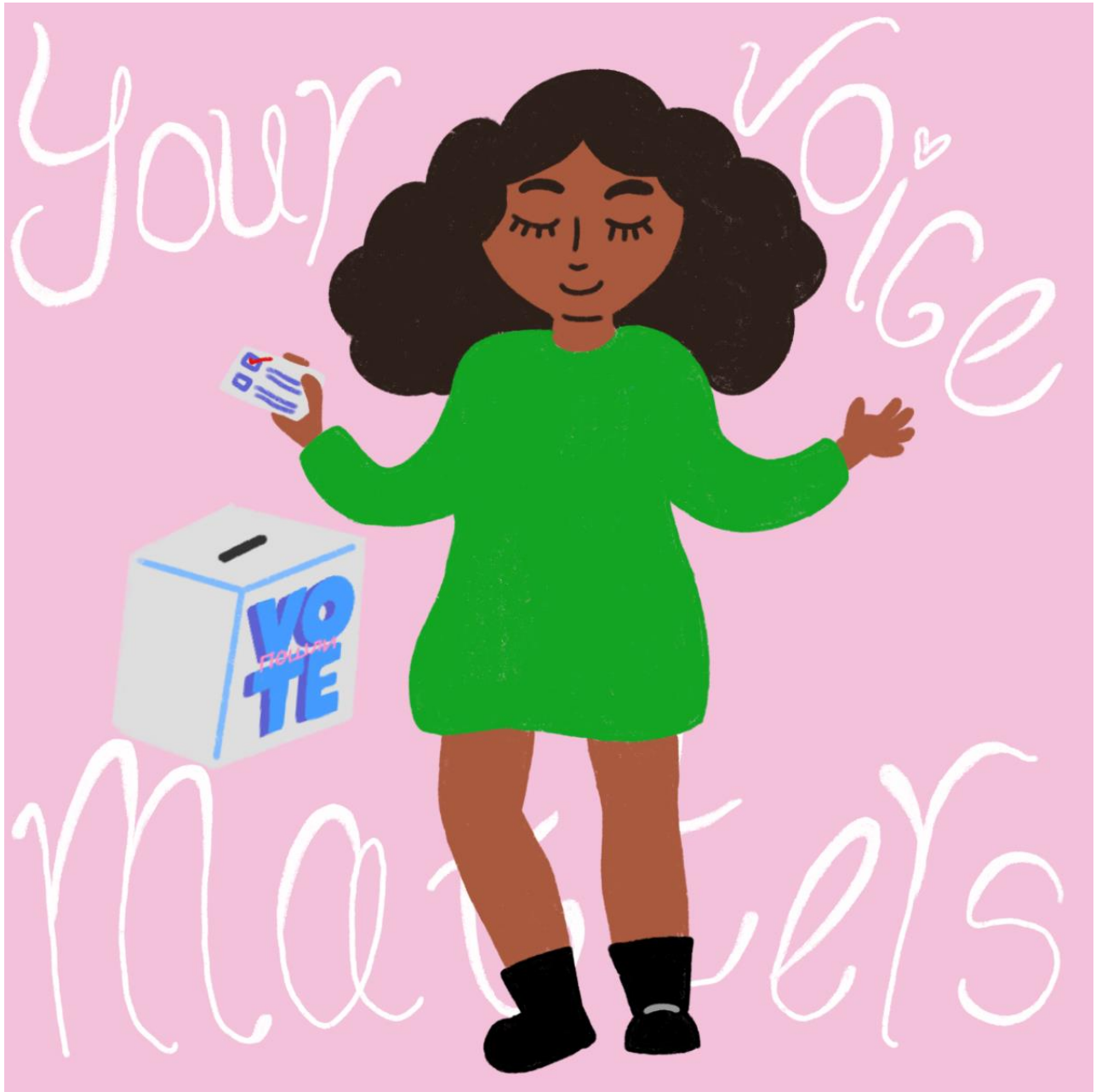
Figure 6: Let's Go Vote Illustration 1