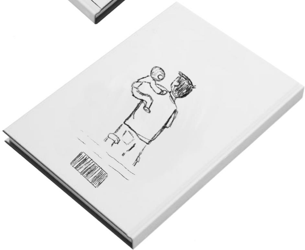
Figure 4: La Llorona Book Covers