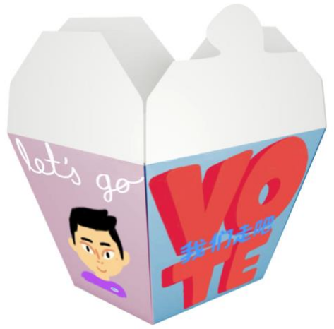
Figure 8: Let's Go Vote Promotional Material