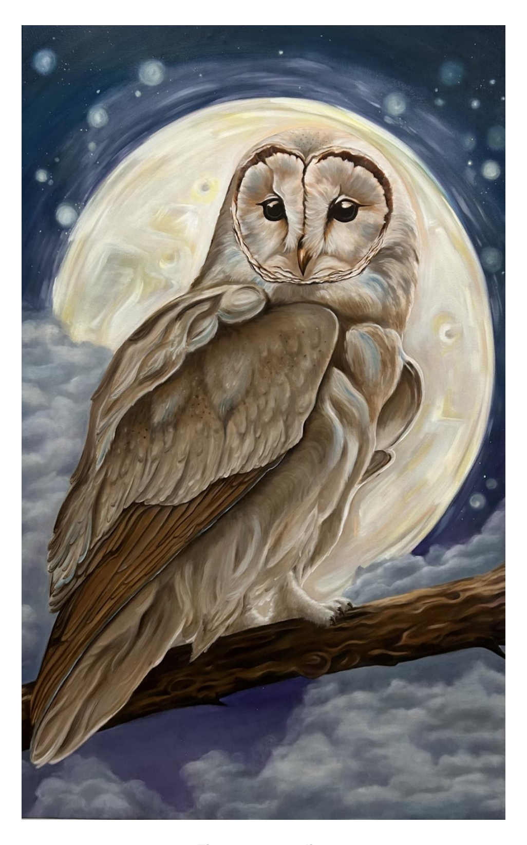
Figure 1: Guardian