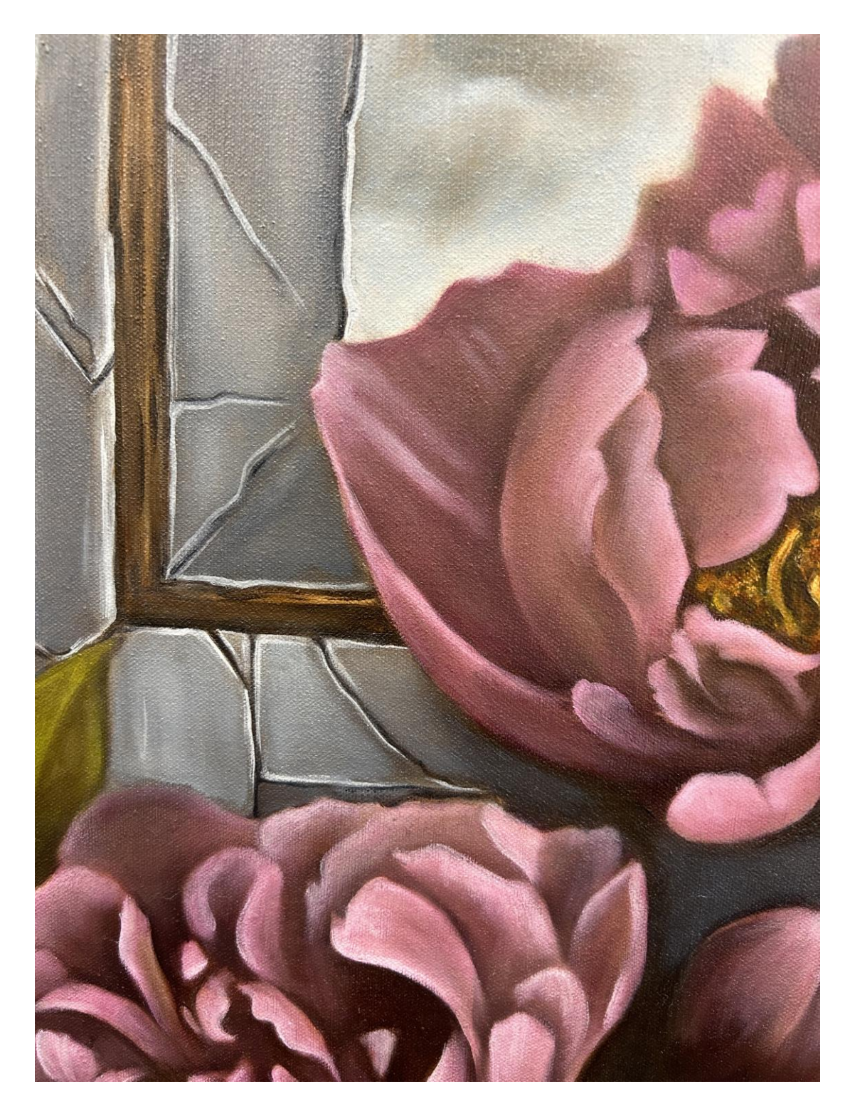
Figure 7: Reflections 1, detail