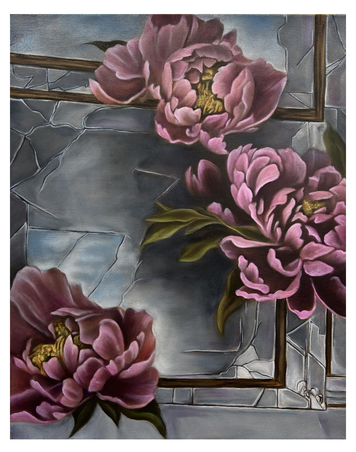
Figure 8: Reflections 2