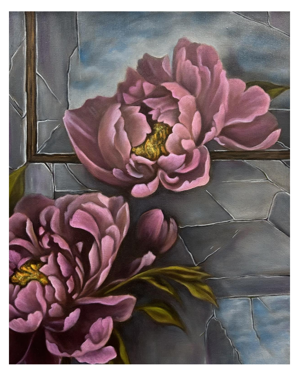
Figure 6: Reflections 1