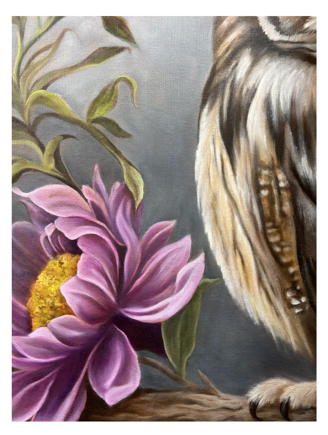
Figure 5: The Watcher, detail