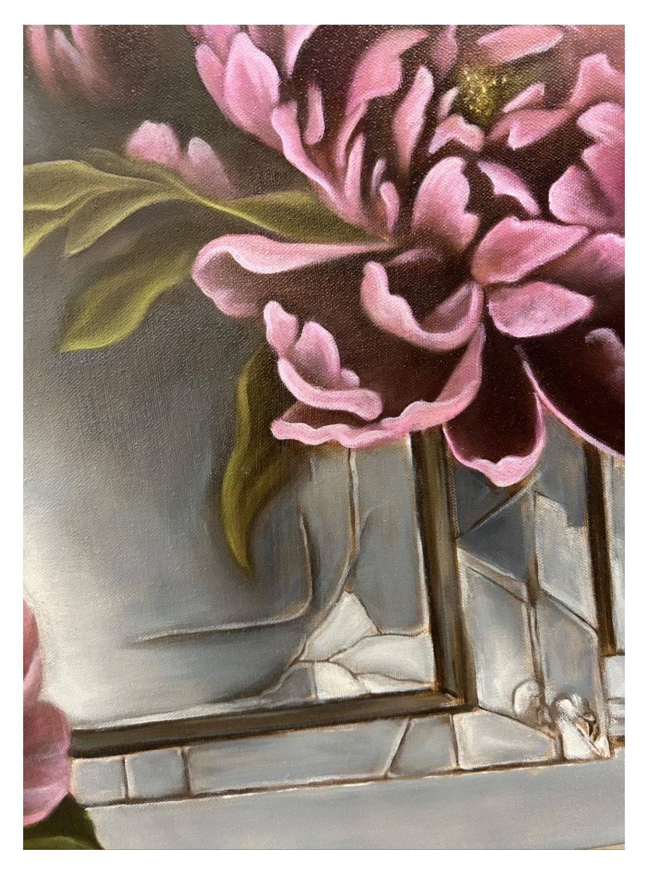
Figure 9: Reflections 2, detail