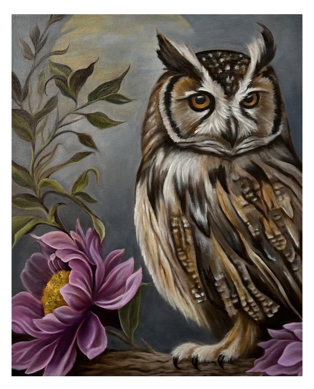
Figure 4: The Watcher