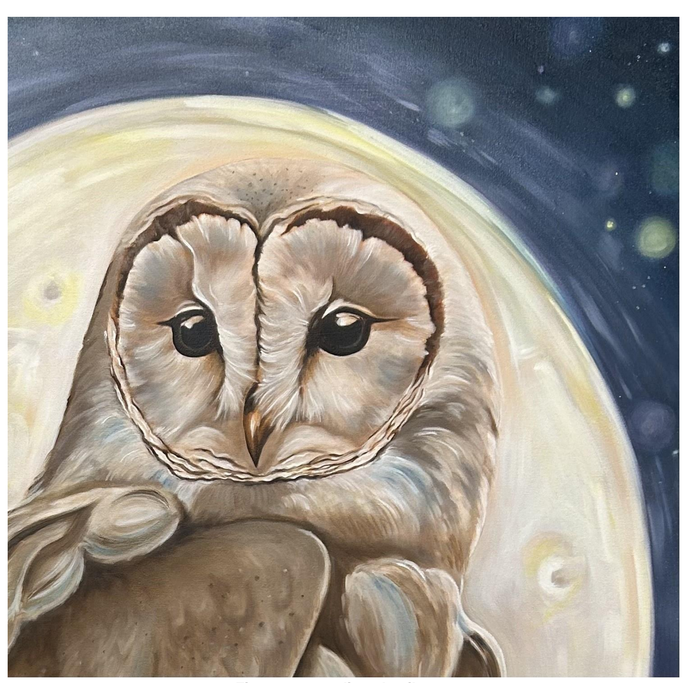
Figure 2: Guardian, detail