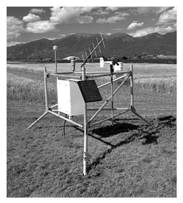
Figure 2. Typical AgriMet Weather Station

The data logger at the site monitors each of the sensors once every second. These readings are used to derive the final data parameters for subsequent transmission, such as 15 minute air temperature observations, total hourly precipitation, etc. These parameters are transmitted from the weather stations via the GOES satellite