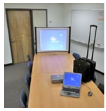
Portable Presentation Kit

and the space has been reconfigured to create two rooms for groups to work on presentations. A small instruction lab has also been added. These improvements showcase the successful collaboration between the Library and the students.