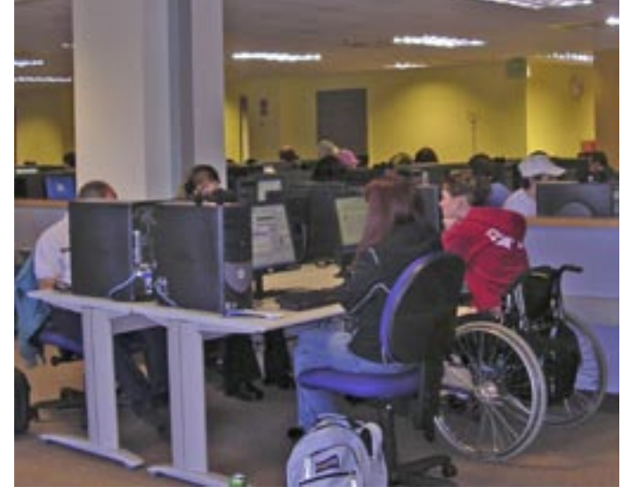
Expanded Electronic Information Center (EIC).

ing more than two hundred public workstations, these funds have expanded the number of wireless laptops