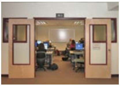
Electronic Information Center (EIC) Mini-Lab