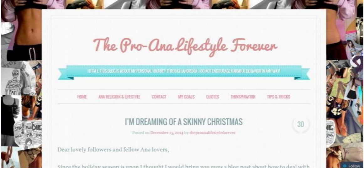
Figure 3: Example of pro-anorexia blog, The Pro-Ana Lifestyle Forever.

Pro-anorexia and pro-bulimia blogs are widely accessible and easy to locate and are growing at an alarming rate. In 2015, a Google search for "pro ana blog" revealed 10,300,000 results. A Google search for the term "pro mia blog" revealed 8,990,000 results. It should be noted that not all these results were pro ana/mia blogs and support sites; in some cases, these results included pro ana/mia recovery sites, recovery or treatment centers, and information on eating disorders or cited pro/ana mia blogs and eating disorders.