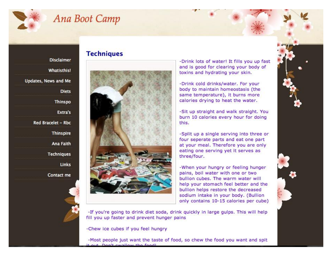
Figure 1: Example of pro-ana website, Ana Boot Camp, Techniques page.

are for people trying to recover from an eating disorder. In fact, a pro-anorexia or pro-bulimia website is typically a blog hosted and found on the Internet that promotes, supports, and provides information about eating disorders such as anorexia or bulimia (Peebles, Wilson, Hardy, Lock, Mann, Borzekowski, 2012). The blogs may include photos, videos, crash diets, diet tips, anorexia and bulimia tips, how to induce vomiting, how to hide eating disorders, comment boards or boxes, competitions, support, personal stories, size, weights and goal weights from the users, and external links to other pro anorexia and bulimia blogs or websites (see Figures 1, 2 and 3).