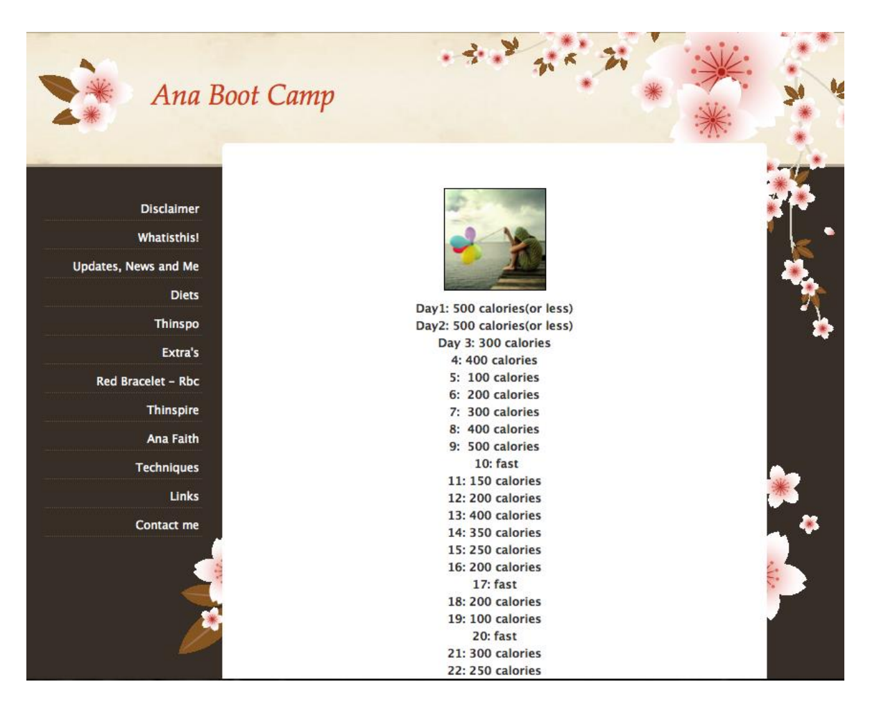
Figure 2: Example of pro-ana website, Ana Boot Camp, Diet Page.

Borzekowski (2010) describes these blogs and websites as a way to inform, encourage and motivate participation in disordered eating habits and routines to achieve "successfully" low body weight, and typically contain information on how men and women can starve their bodies and how to binge and purge. These websites facilitate these disorders by validating unhealthy behavior. Not only can the users find information on the support and maintenance of an eating disorder, but also, these websites offer a cyber-community where young women and men can connect with others from all over the world who suffer from an eating disorder.