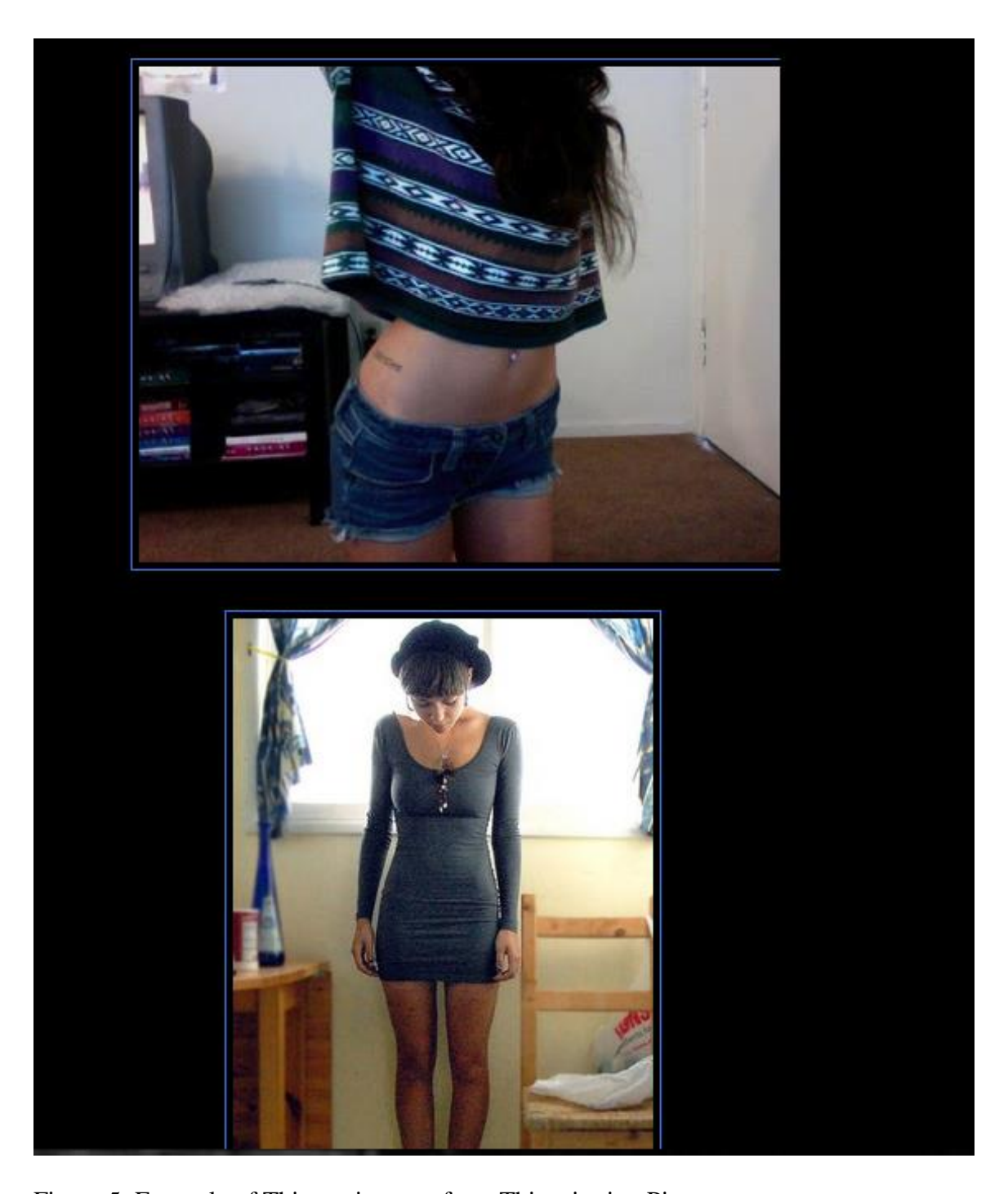
Figure 5: Example of Thinspo images, from Thinspiration Pictures.