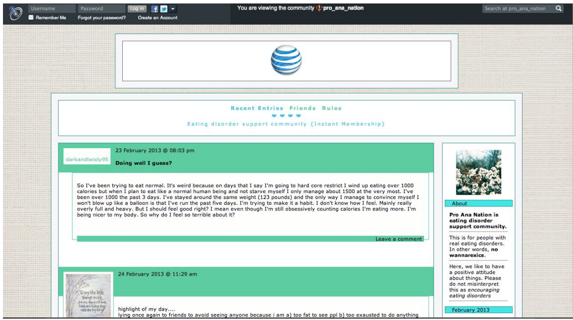
Figure 7: Home page of Pro-Ana Nation

Pro-Ana Nation was the first website to appear in a Google search for "pro-ana websites, 2013." In February 23, 2013, Pro-Ana Nation had 2,934 members and is being watched by 2,413 people. This blog was selected for analysis in 2013.