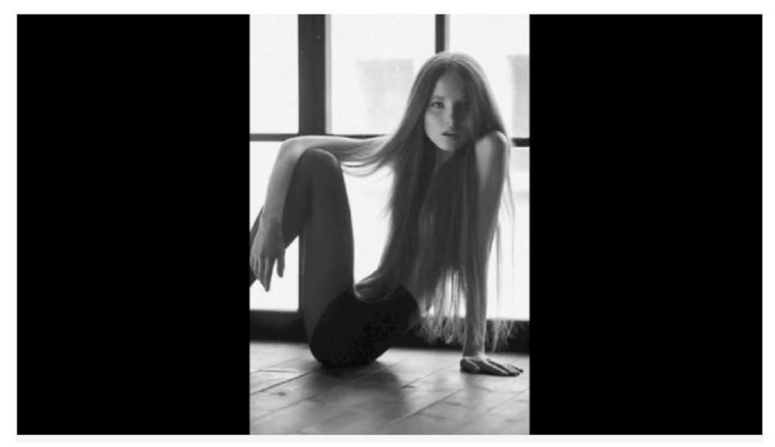
Figure 4: Screen shot of image from Thinspirational video from Vimeo, titled, My body is a Cage .

2010 content analysis, 84 percent of pro-ana sites feature thinspo images or videos (Borzekowski, 2010, p.1534). Generally, thinspiration videos are found on YouTube or Vimeo and are often posted to several of the pro-ana/mia blogs. As of March 10, 2015, a Google search for "thinspiration videos" resulted in 545,000 available videos on the Internet. Thinspiration videos are highly popular, easily accessible, easy to create and motivational for those suffering from an eating disorder (O'Brien, 2013). Many of the videos resemble a dark ominous theme where in addition to showing several images of thin women, they also display quotes and words, to guilt and shame the viewer into restricting, dieting, and losing weight (see Figure 6).