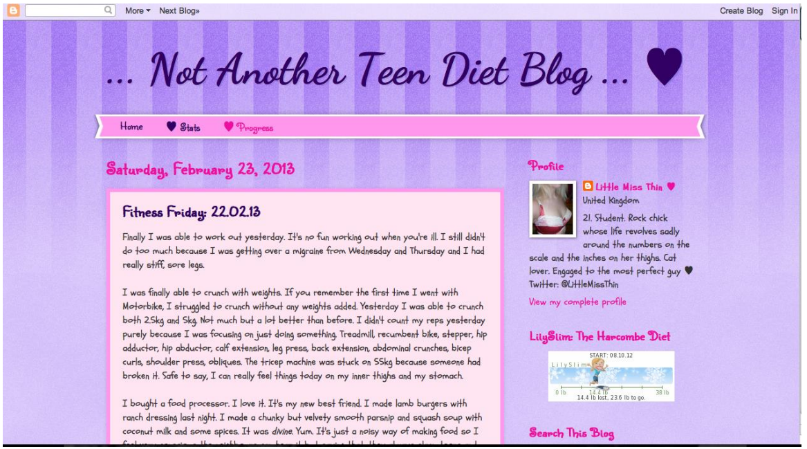
Figure 9: Home page of Not Another Teen Diet Blog

As of February 23, 2013, Not Another Teen Diet Blog had 285 members and a total of 86,701 page views. This blog has a section titled, "labels" which contain topics on: