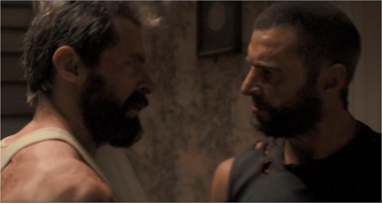
Figure 7: Logan and X-24, Jackman and Davenport<sup>234</sup>

erased under a digital mask."<sup>233</sup> The digitally doubled character who kills its original becomes something nefarious when considered as a narrative element. It represents the extreme stunt invisibility and lack of credit that dominated the old star system. Stunt performers were little more than hidden springboards for studio-minted heroic actors. CGI techniques like this are the reason stunt work has not experienced a modern revolution in visibility to surpass 1970s advances like crediting and paratextual interviews. Although current studio trends demand authentically brutal and physical stunts rather than wholly-CGI dummies clacking around a created space, this push does not unfailingly lead to greater recognition of stunt people within diegesis or in the world of paratexts.