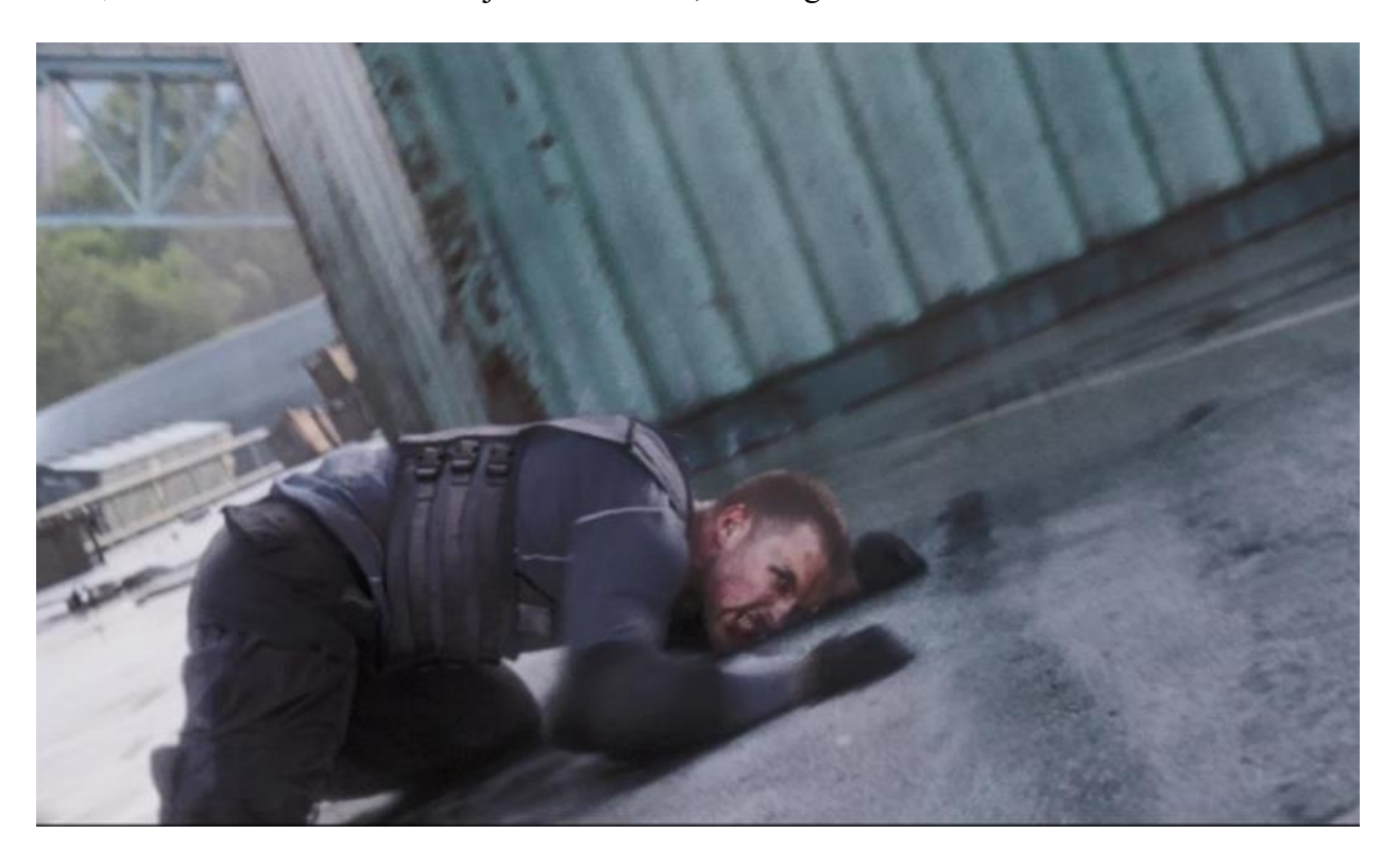
Figure 5: Ajax, a team effort. 144

otherwise. As with any explosive, visceral fight sequence, stunt work builds Deadpool's ultimate death match. Shots where the characters clash swords and axes together are often taken from a slightly greater distance than the majority of the fight scene, and Ajax's face is tellingly blurred by movement and what Plantinga calls manifested spatial distance<sup>143</sup> in these instances of bodily danger. The villain's back faces the spectator as Deadpool kicks him through the air and into a pile of boxes, suggesting that this shot may be Jeffrey C. Robinson (actor Ed Skrein / Ajax's stunt double). Ajax the character's face is visible, so spatial manifestations serve to mask the character's stunt performer. However, these are not flawless, and there is at least one (albeit barely noticeable) shot where Robinson's face has fully replaced Skrein. The shot ends so quickly that it cannot be said to rupture the narrative or the fight sequence. Rather, it stands as a fleeting moment in which the actively discerning eye can capture the guts of Skrein's character. Here, the stunt aficionado sees Ajax's other face, ducking in and out of each shot.