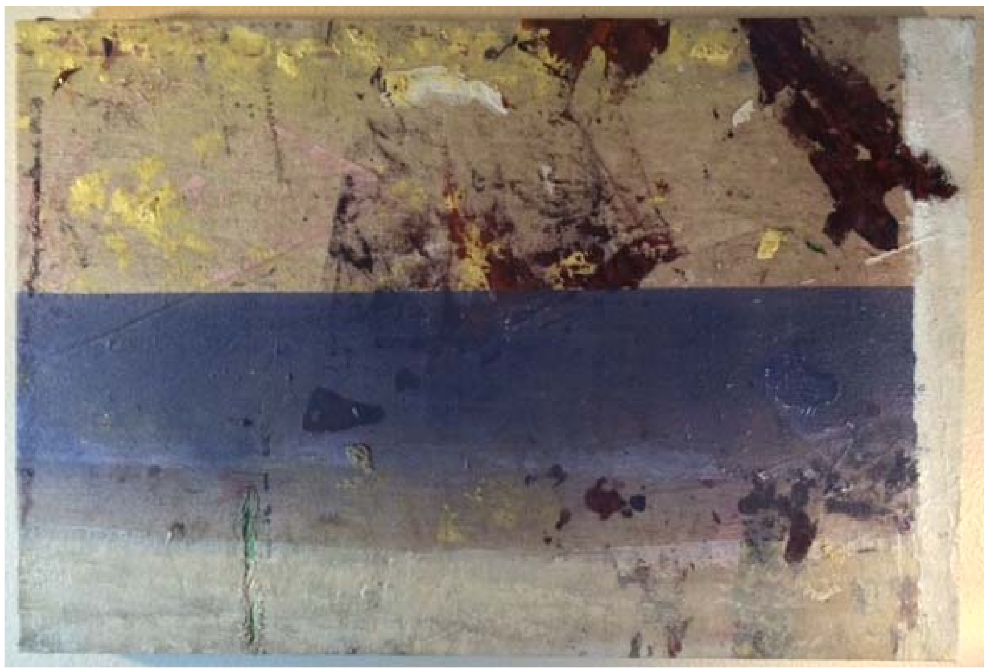
Figure 6: Untitled.