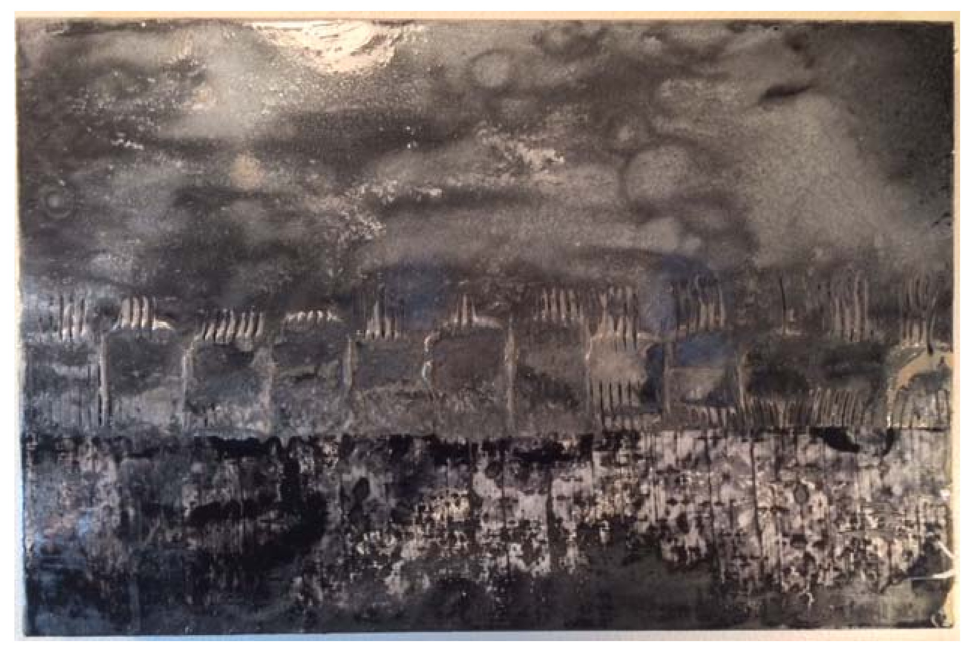
Figure 4: Untitled.