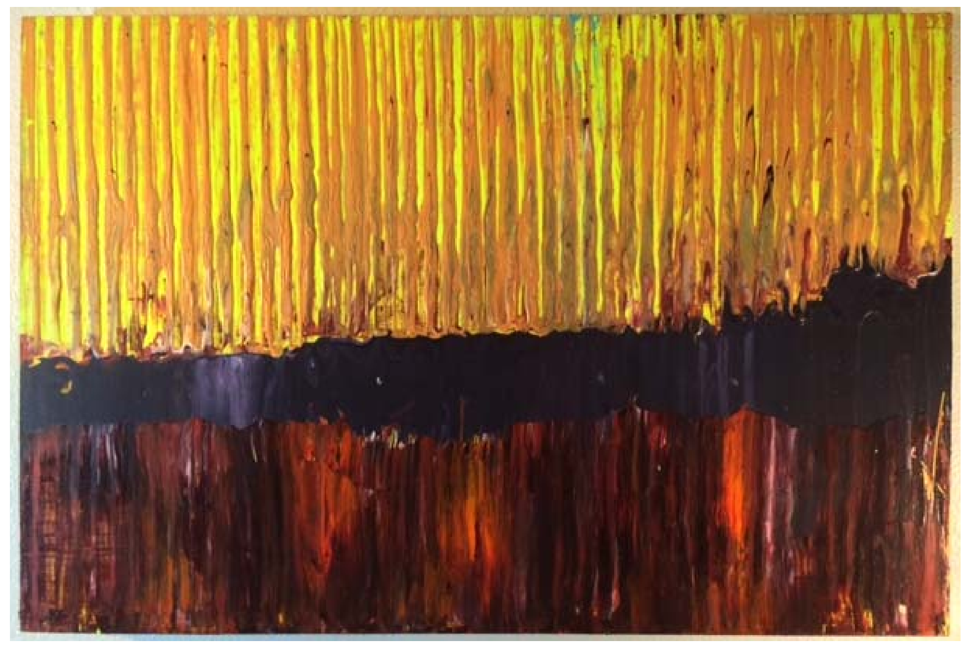
Figure 5: Untitled.