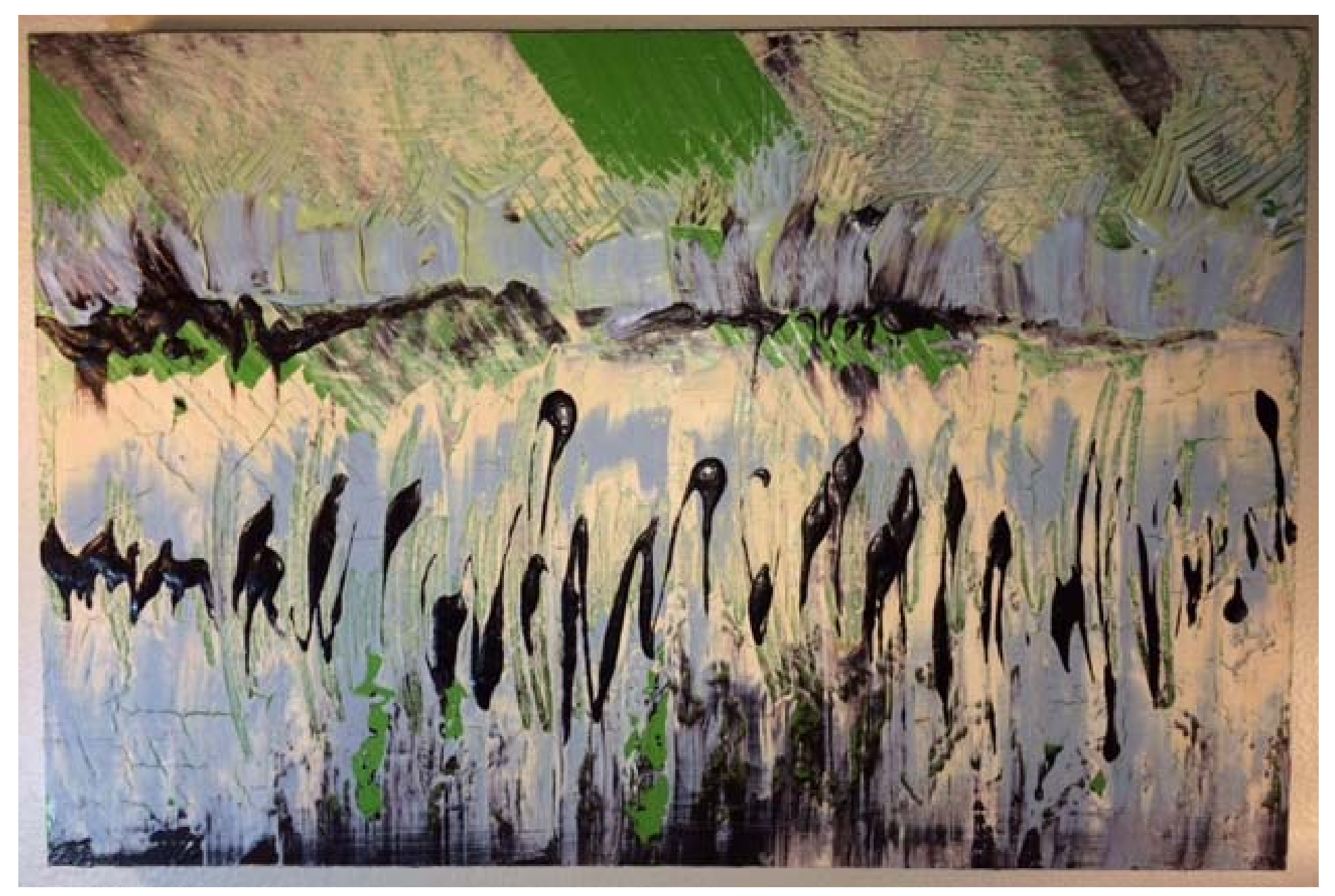
Figure 1: Untitled.