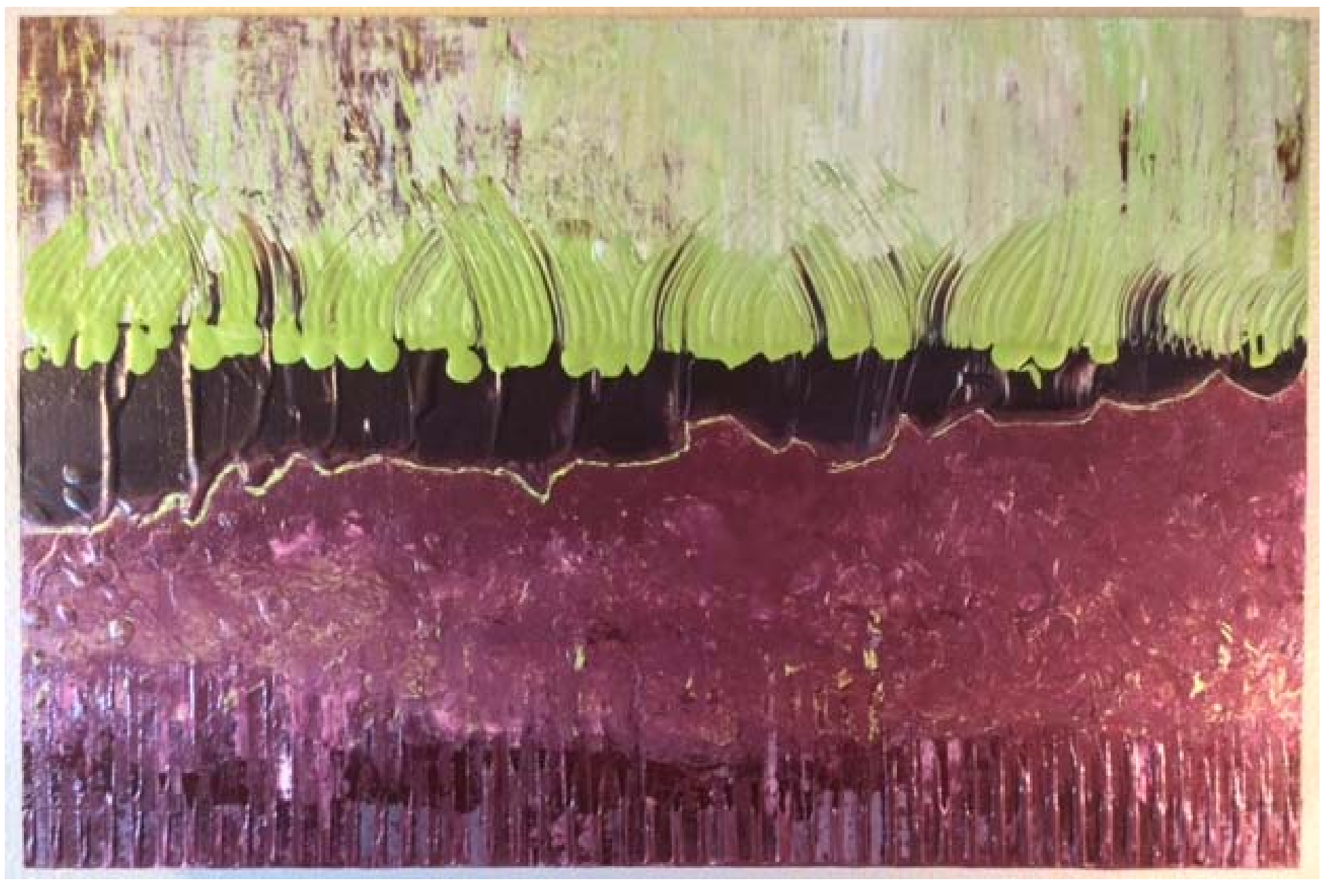
Figure 7: Untitled.