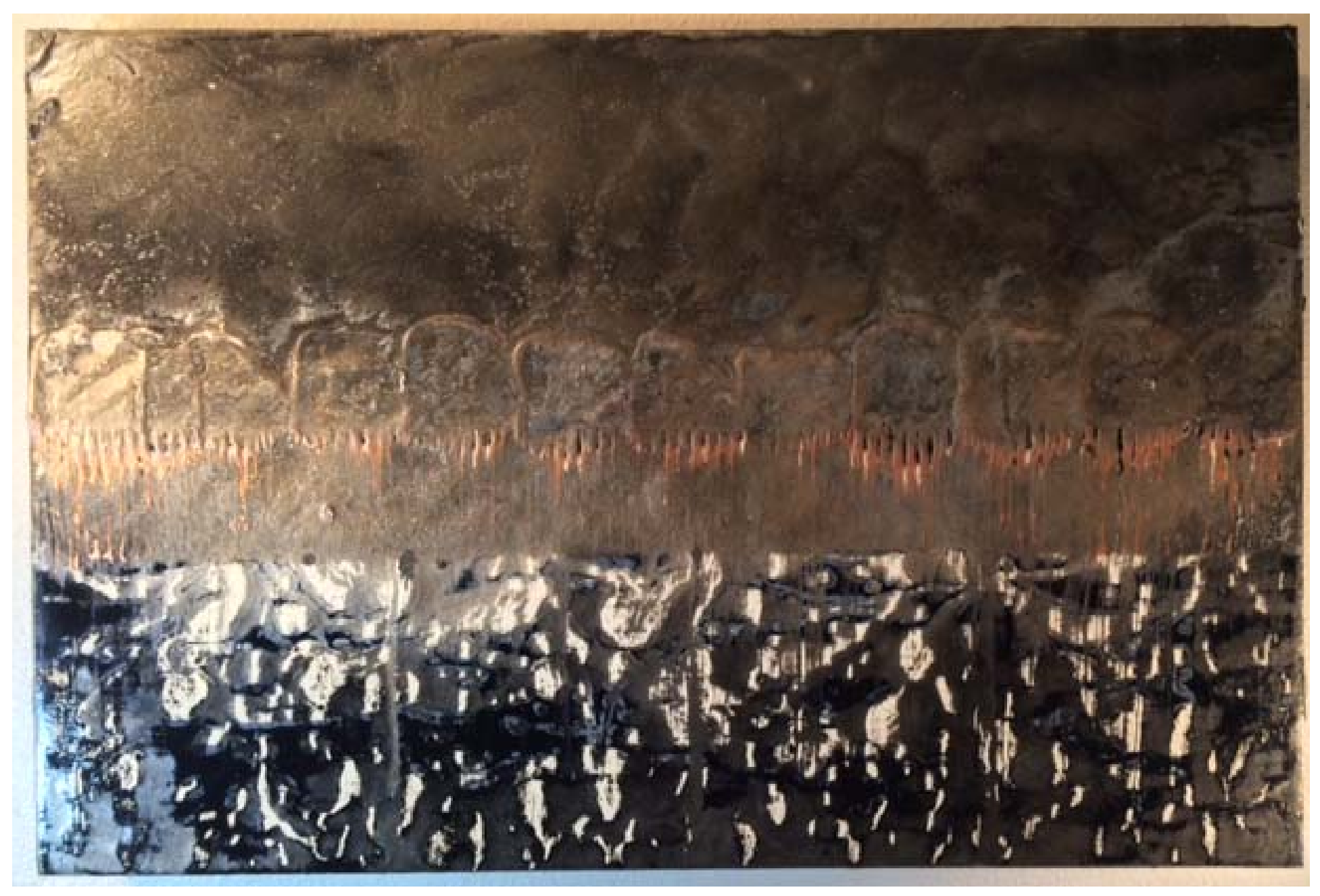
Figure 2: Untitled.