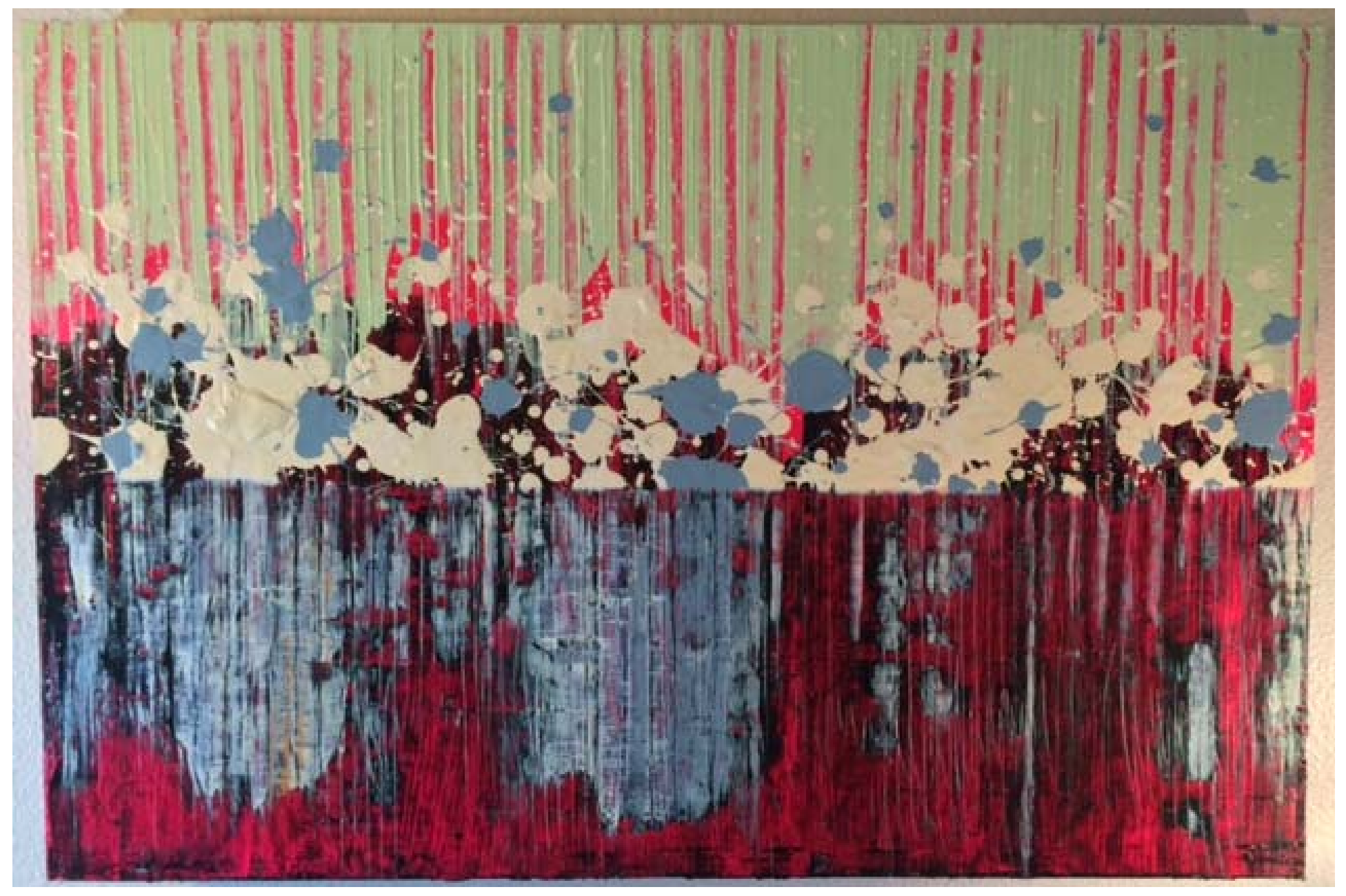
Figure 10: Untitled.