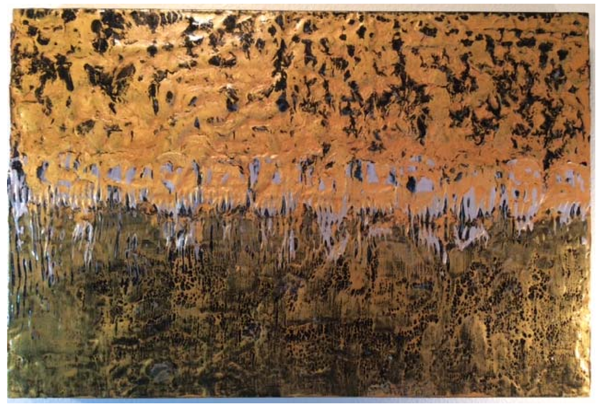
Figure 3: Untitled.