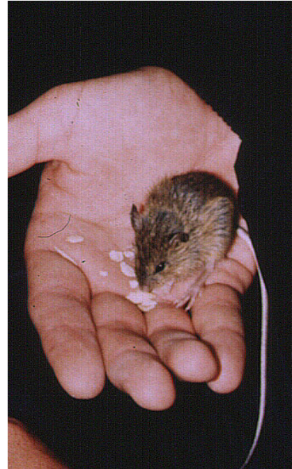
Zapus hudsonius preblei

Although the meadow jumping mouse ( Z. hudsonius ) is common and widespread across North America, the Preble's meadow jumping mouse subspecies ( Z. h. preblei ) currently occurs only in a few watersheds along Colorado's Front Range and in southeastern Wyoming. The historic abundance of PMJM is unclear. However, trapping surveys indicate that a number of historic PMJM sites are apparently no longer occupied. These sites have been disturbed and/or isolated as a result of changing land use (Ryon 1996). Evidence also suggests that the Denver metropolitan area has formed a barrier between the northern and southern extents of the PMJM range (Shenk 1998). In Colorado, PMJM is currently documented from seven counties (Weld, Larimer, Boulder, Jefferson, Douglas, Elbert, and El Paso). The largest and most stable populations documented across the range of the sub-species occur in East and West Plum Creeks in Douglas County, and in Monument Creek on the USAFA in El Paso County.