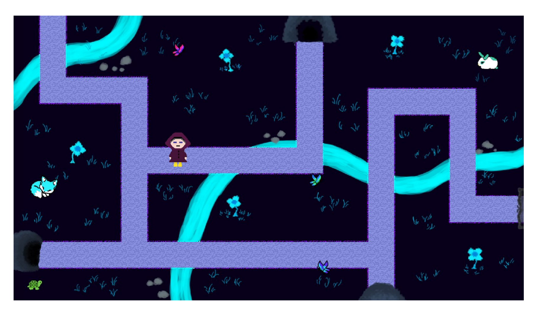
Figure 5: Dotoku