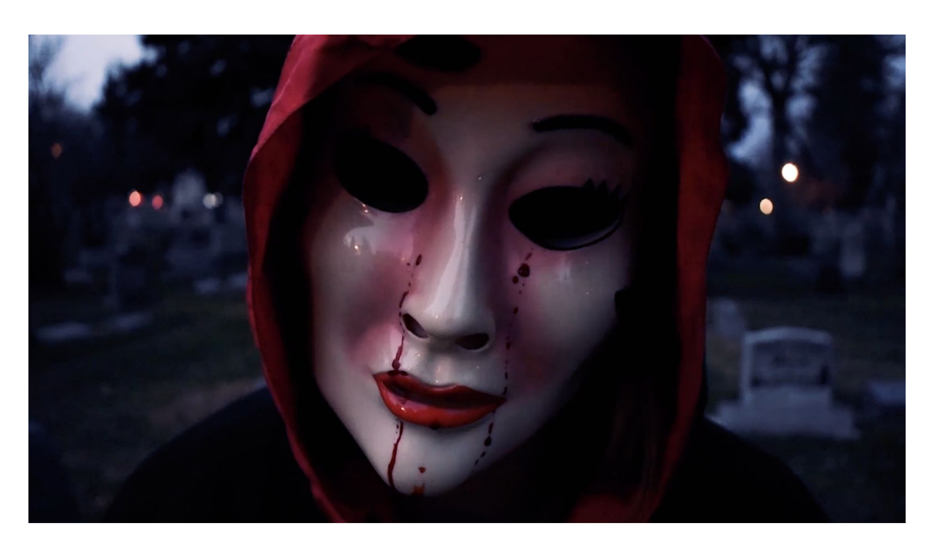
Figure 3: Daemonium