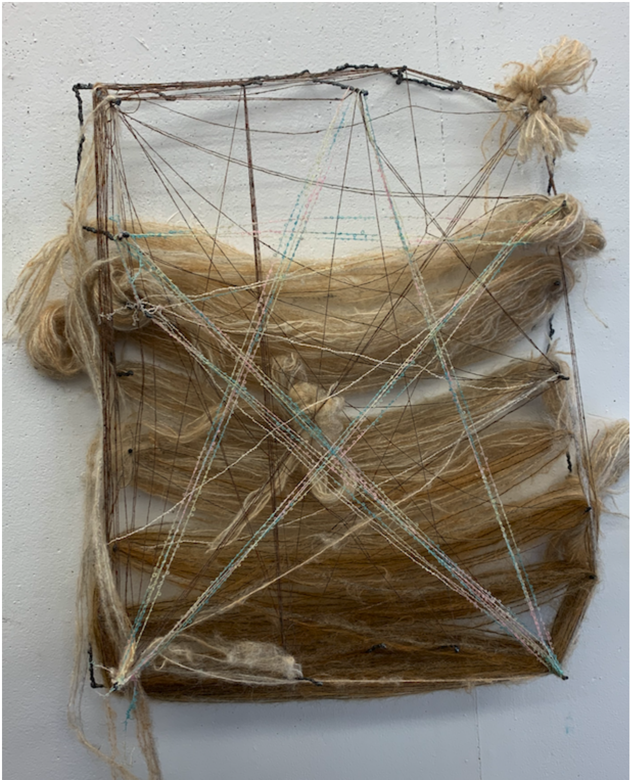
Figure 3: Warp Board