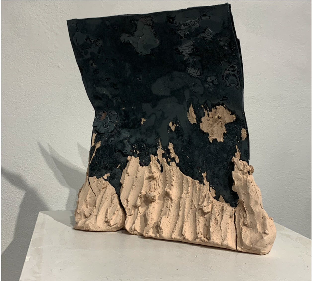
Figure 9: Screen