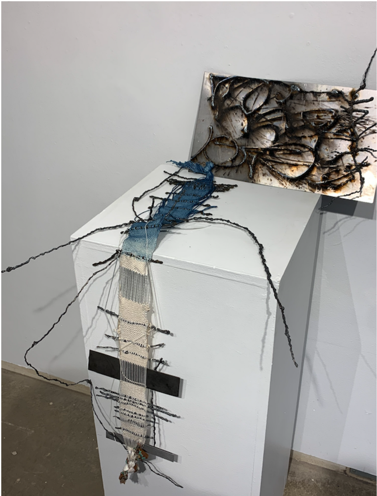
Figure 7: Loom Weaving and Heat Drawing