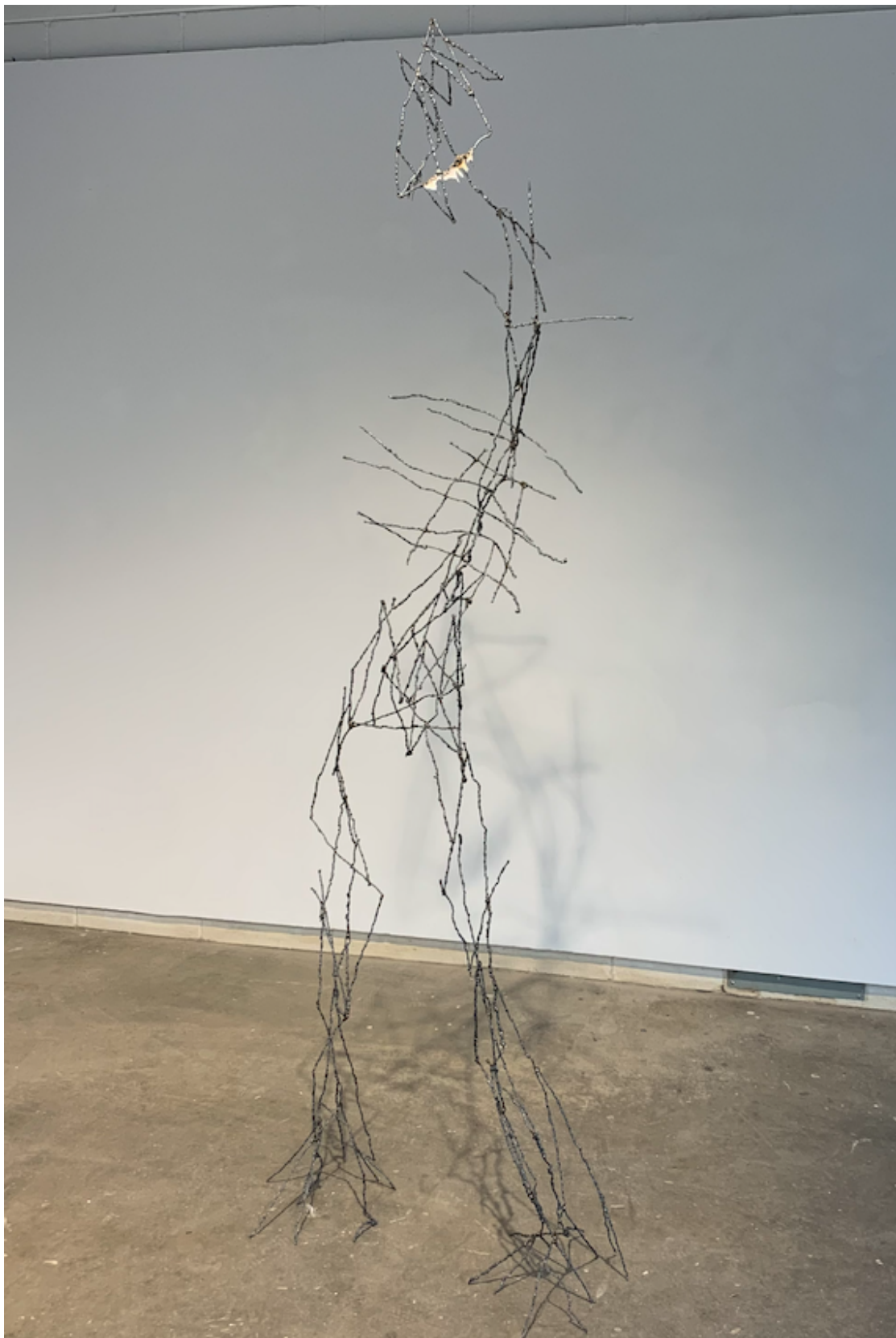
Figure 1: I Killed the man in my dreams