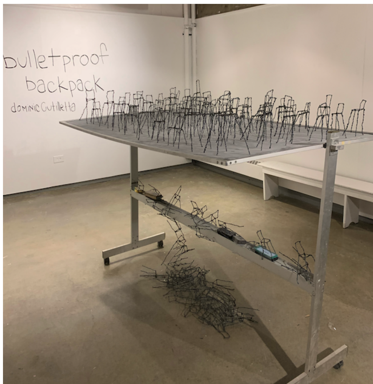
Figure 5: Bulletproof Backpack