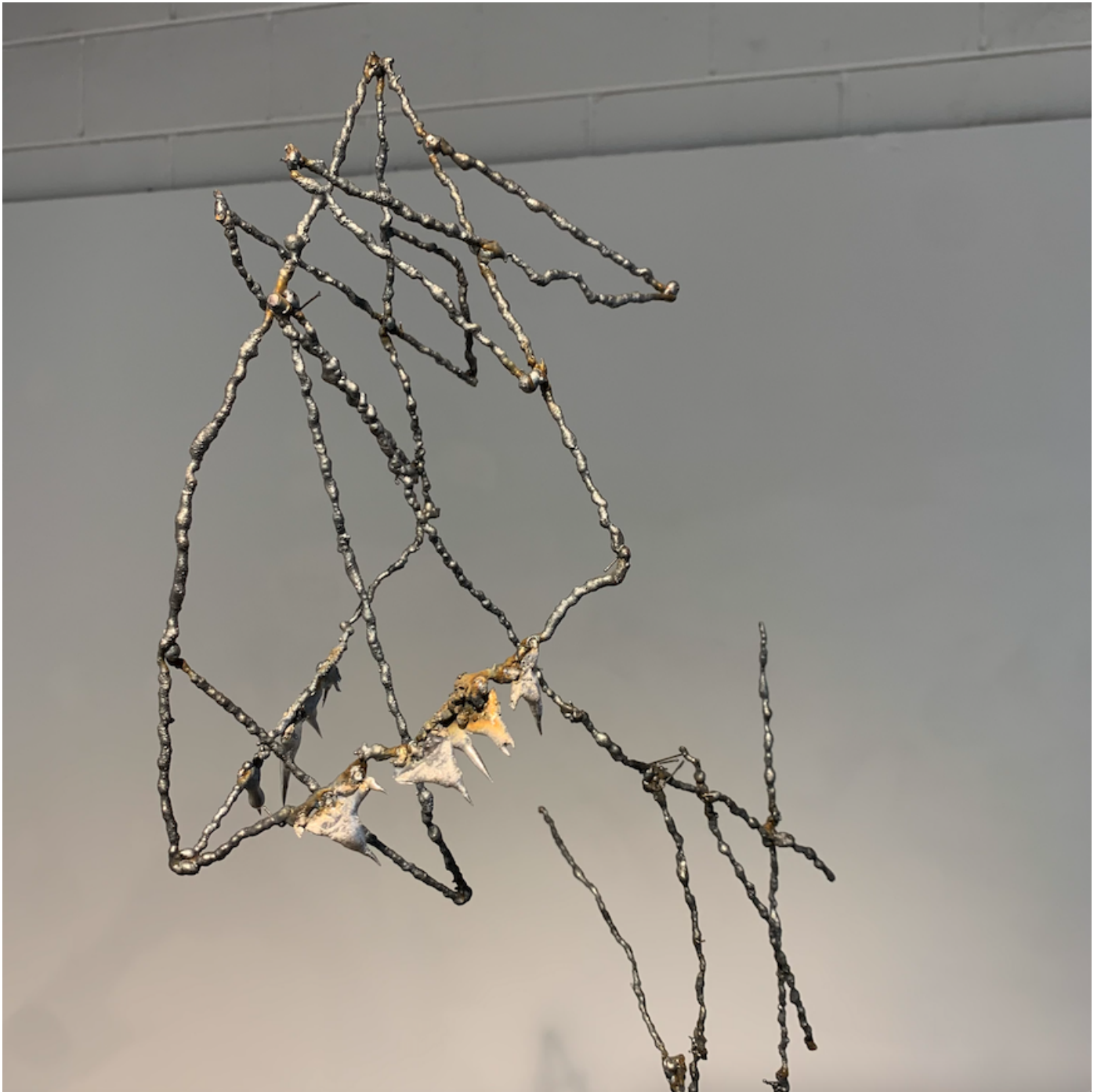
Figure 2: I killed the man in my dreams (Detail)