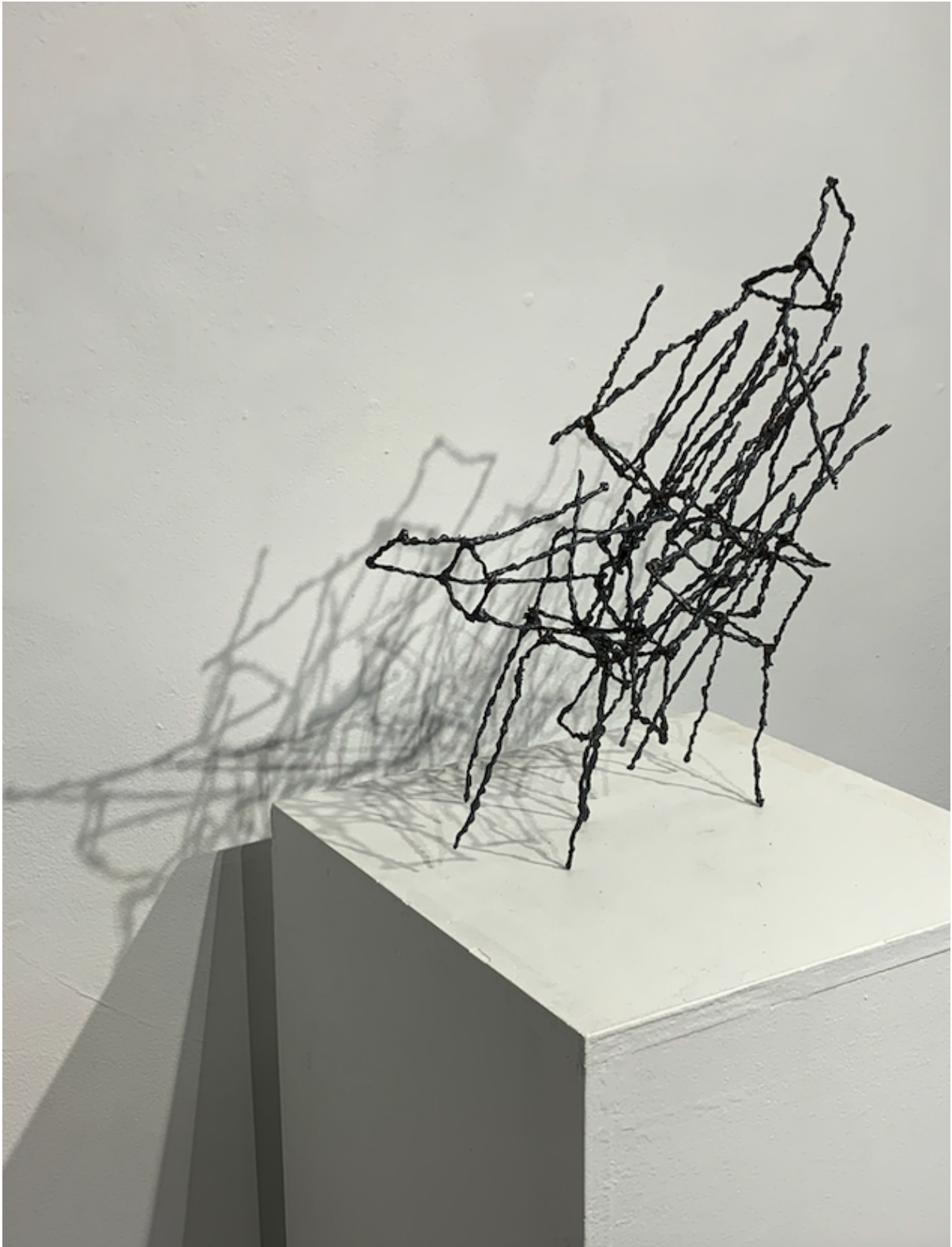
Figure 8: Chair Bundle