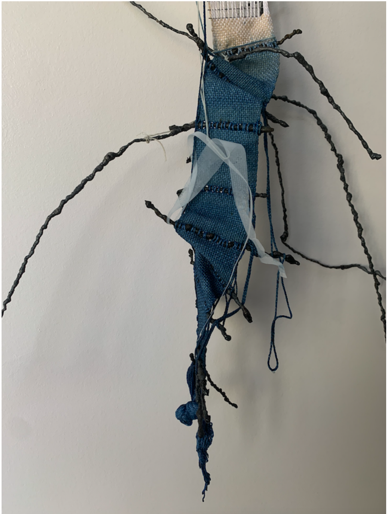
Figure 10: Loom Weaving (Detail)