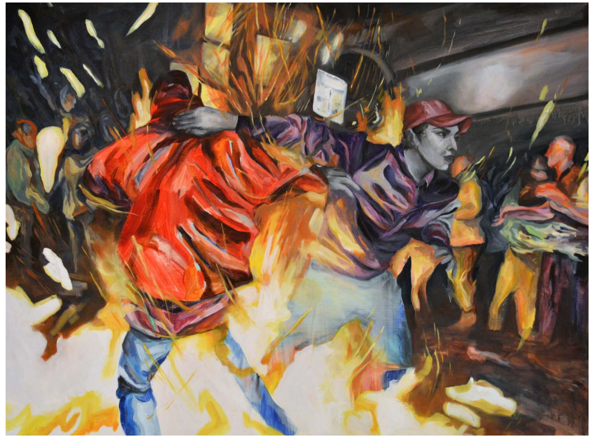
Figure 3: Denver (sports riot).