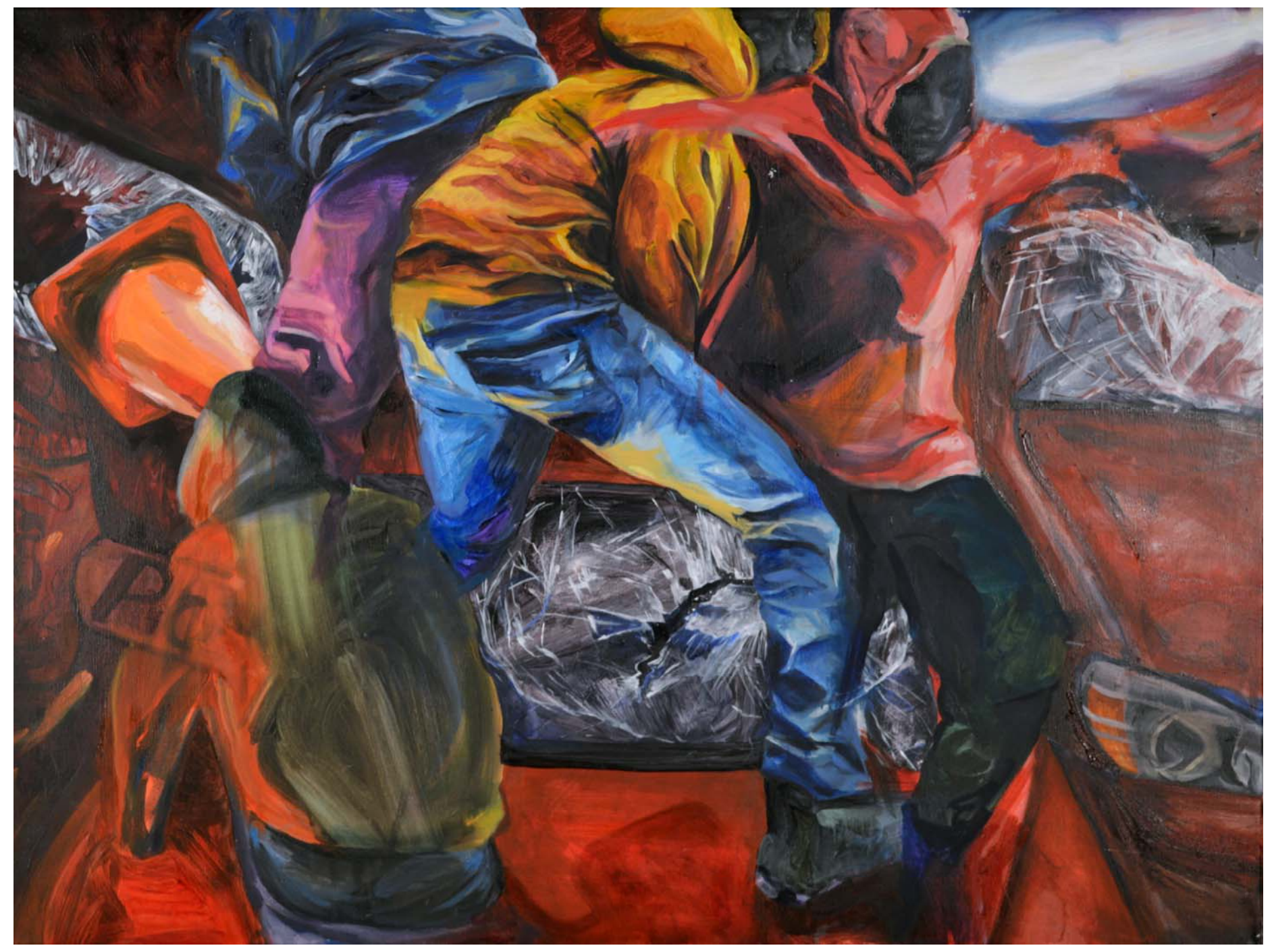
Figure 5: Baltimore (Grey protests).