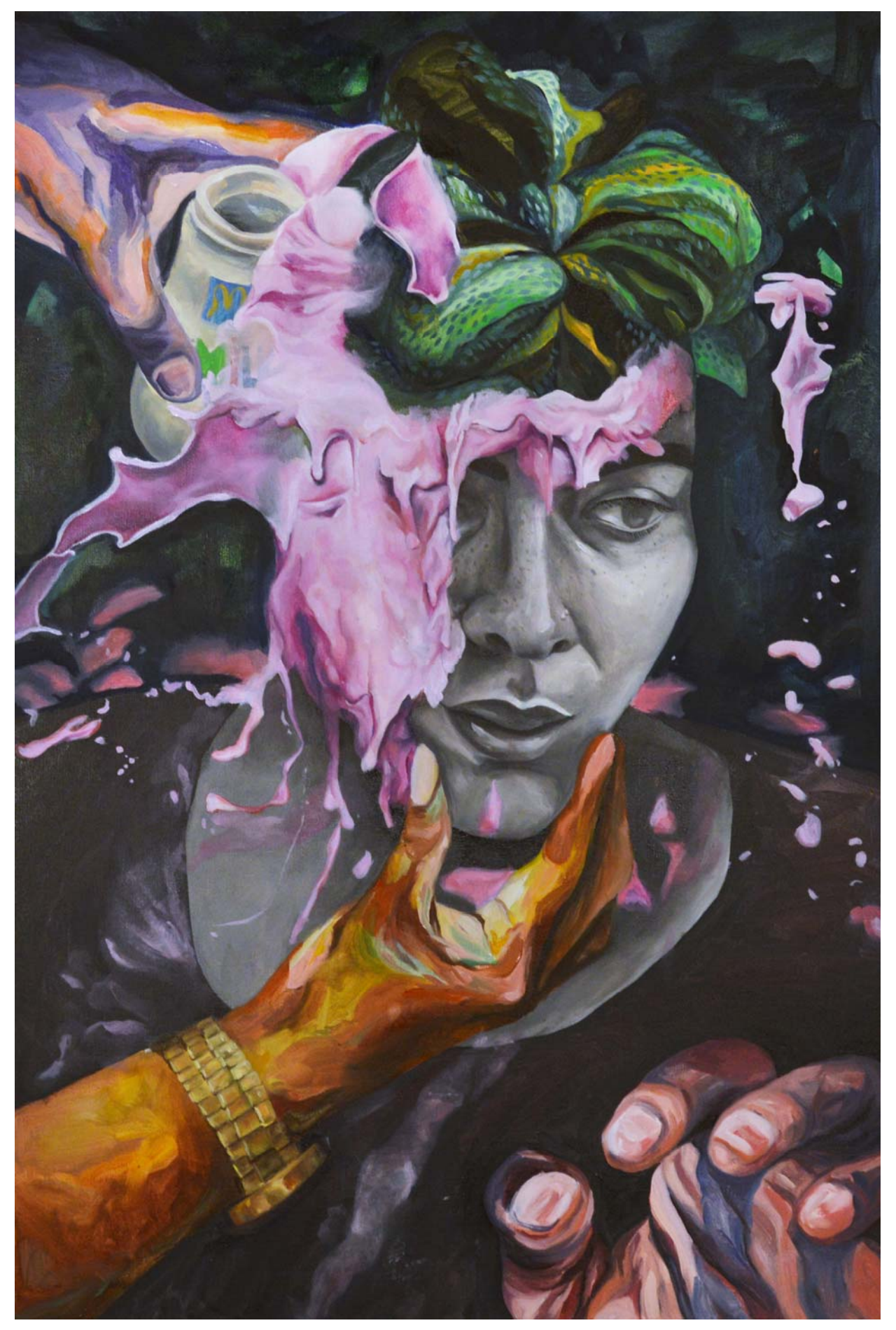
Figure 1: Ferguson.