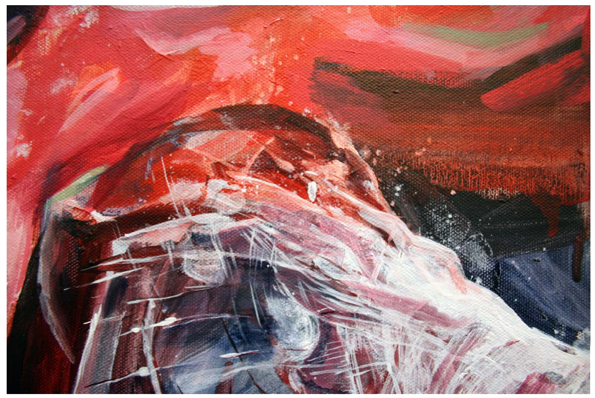
Figure 6: Baltimore (Grey protests) Detail 1.