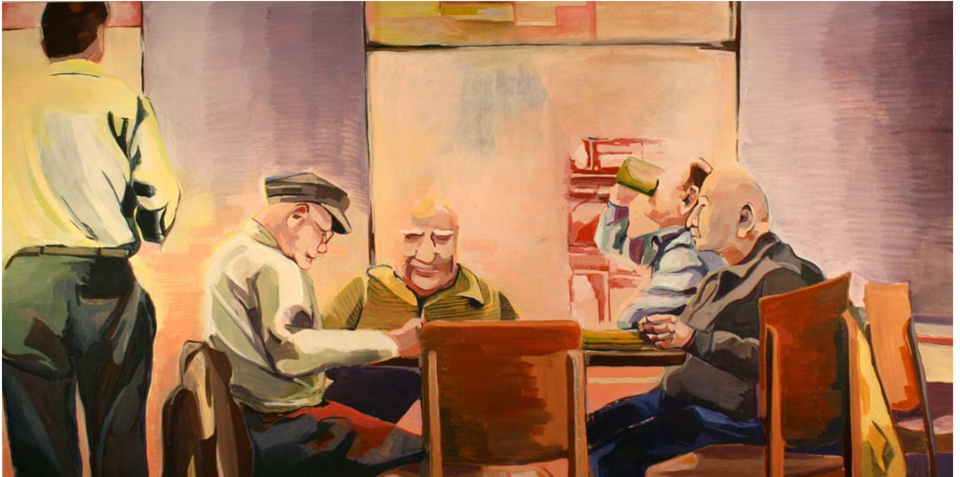
Figure 4: Conversation so Good that his Coffee got Cold.