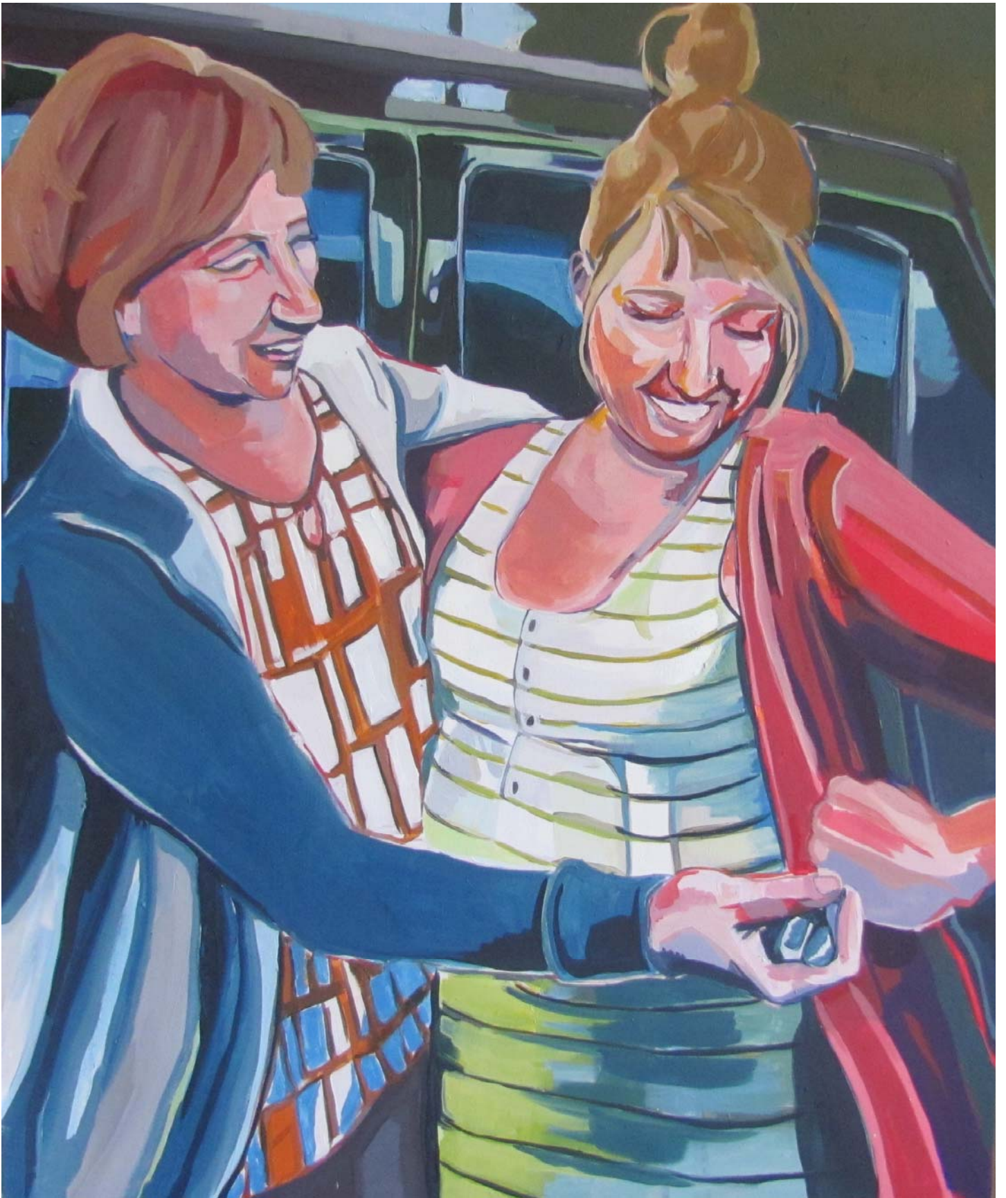
Figure 2: Parking Lot Play.