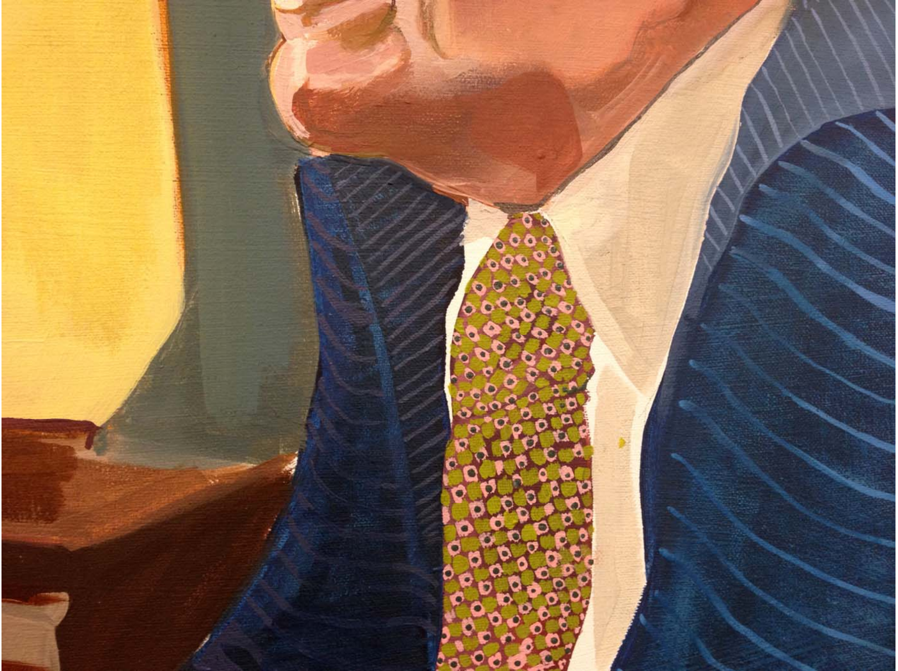
Figure 7: Two Intent Listeners Detail.