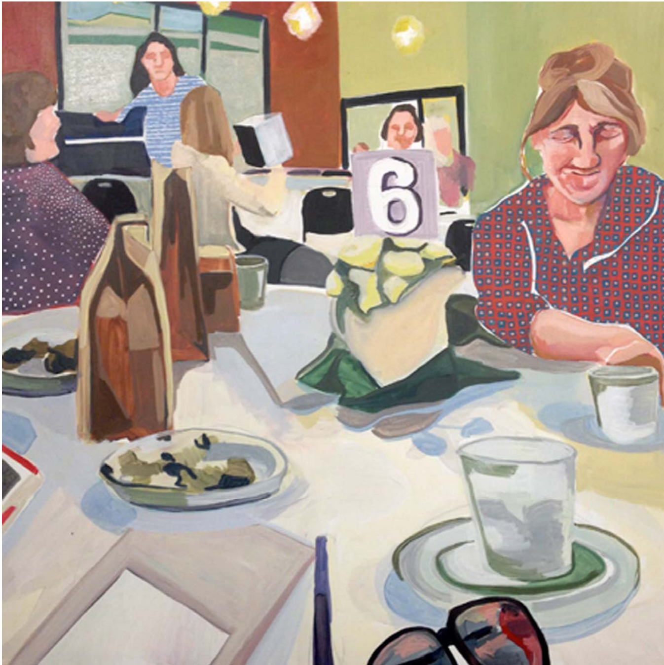
Figure 8: Polka Dots at Table Six.