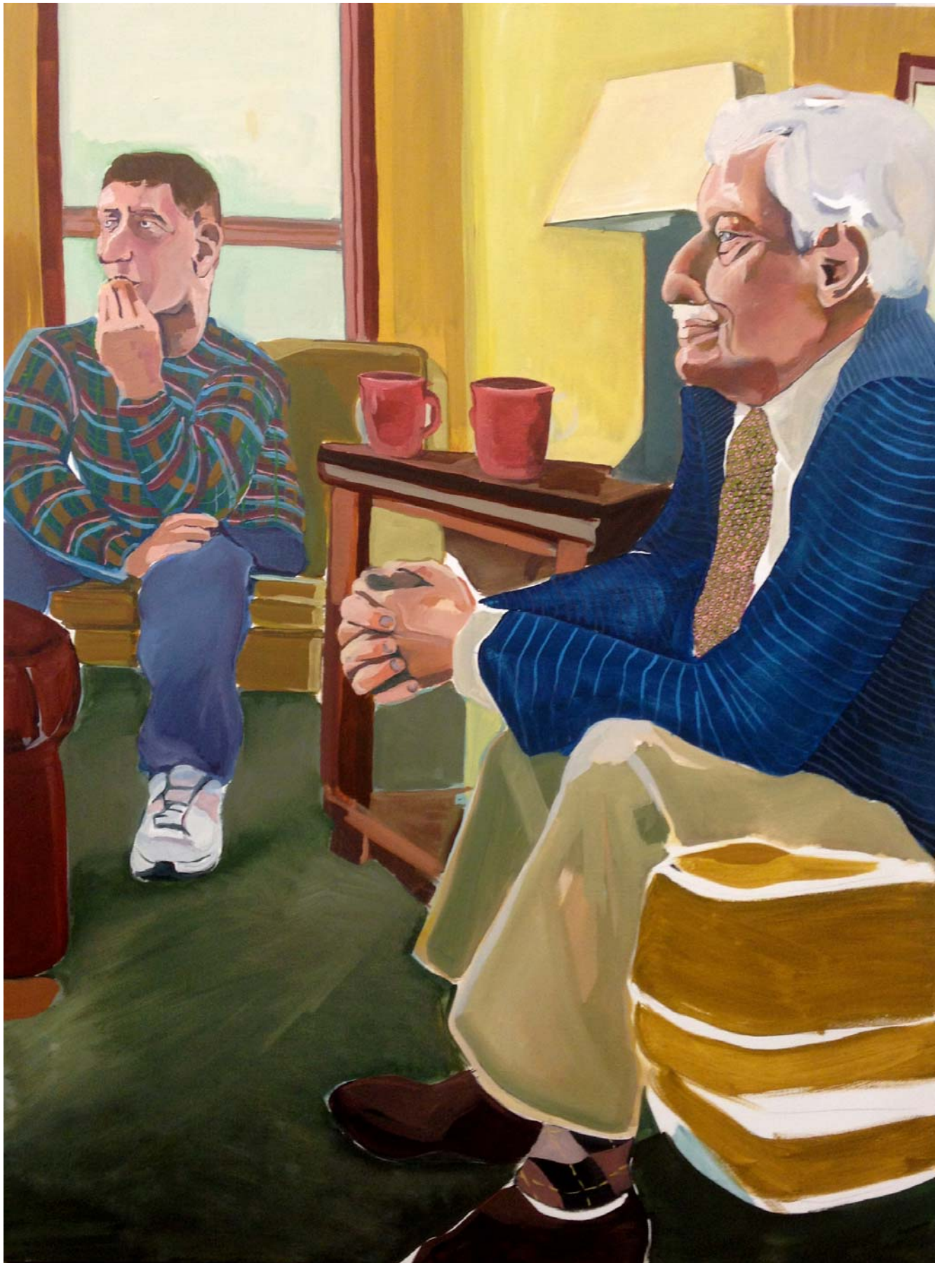
Figure 6: Two Intent Listeners.