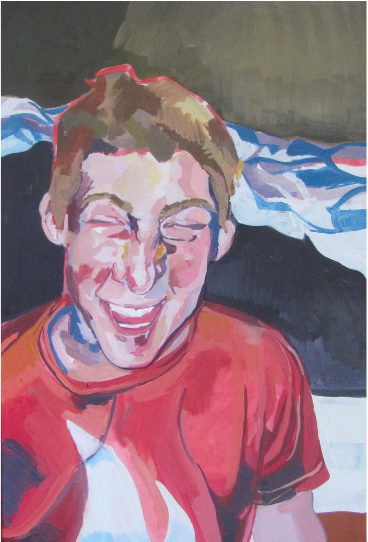
Figure 1: Made You laugh.