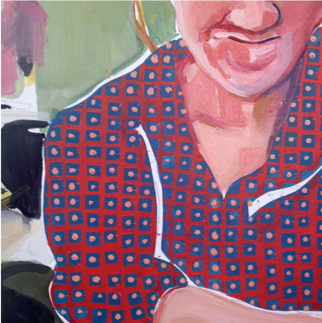
Figure 9: Polka Dots at Table Six Detail.