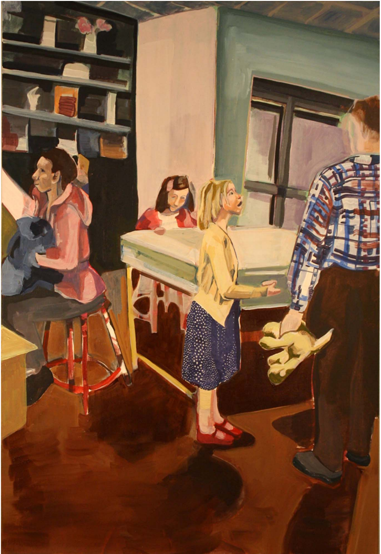
Figure 5: Desperation and a Stuffed Dog.