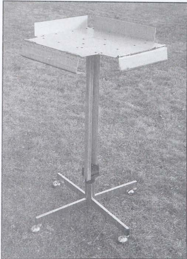
ROTATING ASSEMBLY TABLE (the two lowered sides swing up to leverage wood sides into place, the whole top turns on the base, and the base has four castors)