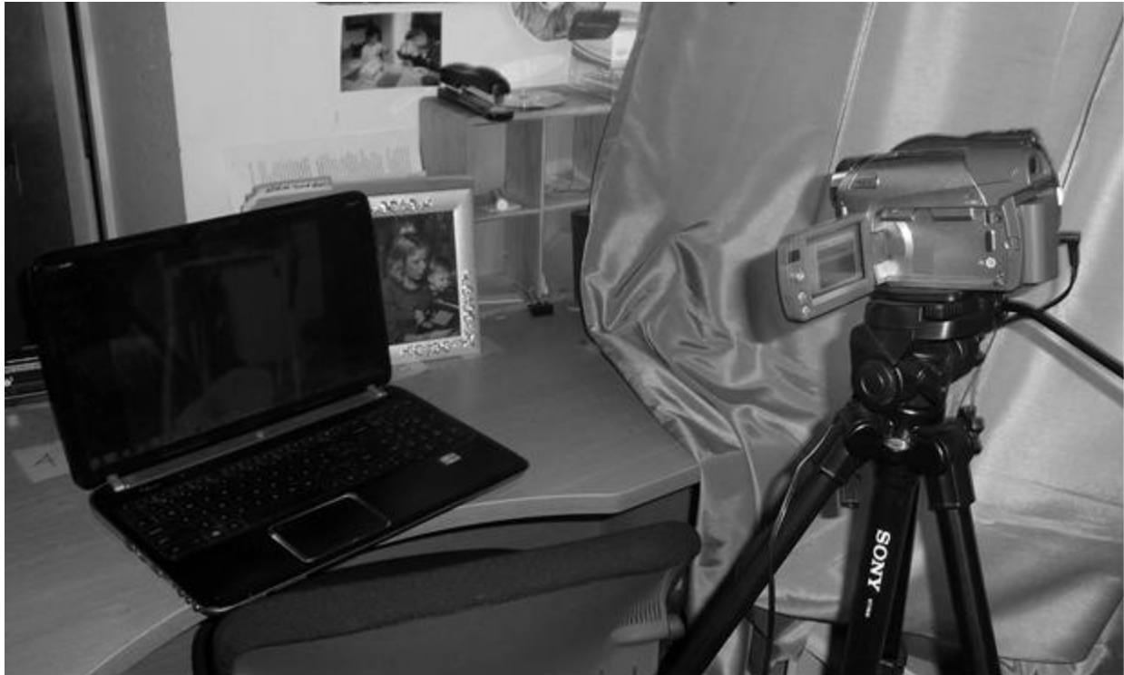
Figure 3. Example of the process of videotaping parent-child interactions through Skype VC system using a video camera pointed at the computer screen while parents are interacting in real-time.