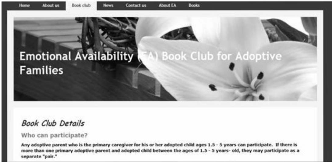
Figure 5. Illustrative example of the use of a website for recruitment purposes.