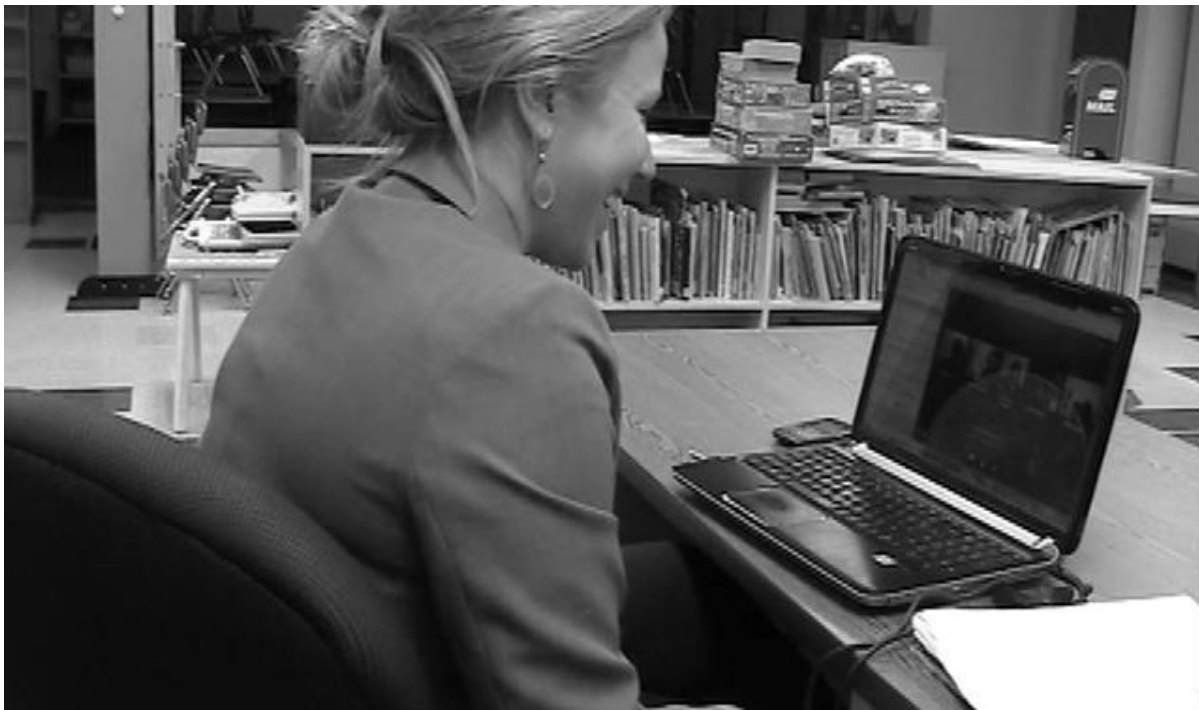
Figure 2. Illustrative example of the intervention facilitator conducting EA Intervention session three for the IG using Skype video conferencing for group/conference video calls. Up to 10 participants can be viewed at one time.