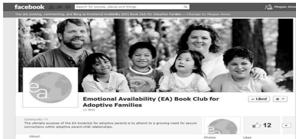
Figure 4. Example of the use of social media (Facebook) for recruitment of participants.