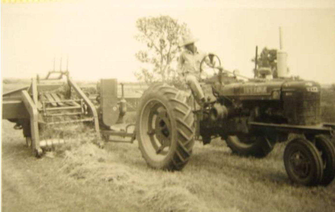
Figure 7. Irvin, a tractor, and a square-baler, 1952. The tractor pulled a square baler along the windrows, creating bales of hay that were easy to transport to various pastures.

For the family and their hired hands, the square baler not only sped up production when combined with the windrower, it also altered the labor involved in the final steps of haymaking and subsequent months of feeding. As we saw with Irvin's horse-driven feeding routine, haystacks on the ranch necessitated Irvin or Geraldine to drive out to whichever pasture contained the mound of hay they wanted to feed, shovel it by hand using a pitchfork onto the horse-drawn hay rack, then shovel the mound back out onto the ground in the next pasture of cattle. This process took most of the morning, if not the entire day in winter storms, and required a great deal of human and animal muscle power.