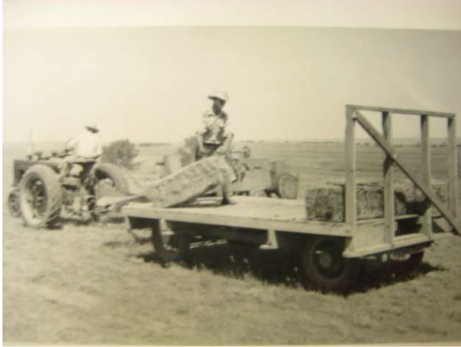
Figure 8. Feeding cattle with a square bale, ca. 1952. Fossil-fuels powered the tractor, enabling the Evanses to haul their square bales to different pastures. However, once inside the gates, Irvin still had to use his muscle power to lift the bales and empty them onto the ground.

With the petroleum-powered technologies of the tractor in haymaking, the final steps of haymaking still required a great deal of muscle power, but in a different way. Whereas the horse-drawn stacker tipped the hay into a mound, which remained in that spot in the pasture until they loaded it up to feed, the tractor-led square baler left a field spotted with more transportable hay bales. When stacking the bales, Irvin and the hired hands had to use muscle power to throw the bales up to a person standing on the stack, who then alternated them like bricks to create an approximately fifteen-foot-tall stack (see Figure 2). During the subsequent winter of haying, the size and versatility of these bales enabled Geraldine to join Irvin in feeding the cattle. With the aid of a curved metal hook that she and Irvin grasped with their hands, they could more easily lift the bale, push the hay through its wire confines, and feed the cattle. Geraldine explained “I