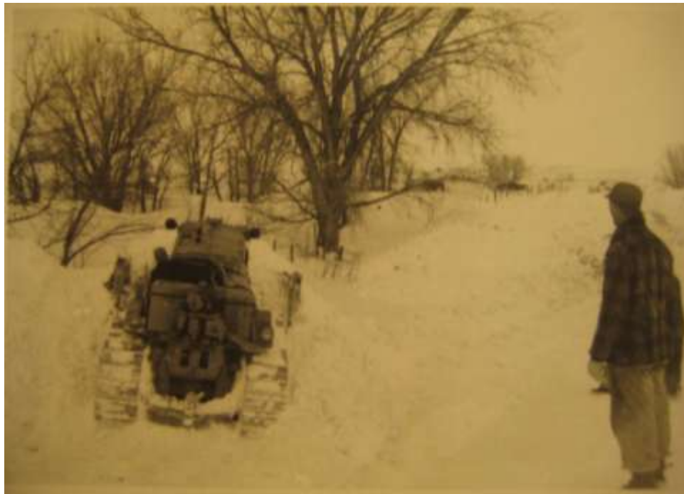
Figure 1. The Evanses’ Tractor in the 1949 Blizzard, 1949, in author’s possession.

neighbors who wanted them. 8 As Geraldine knew, cattle and blizzards had never blended well, but in 1949, some losses were mitigated by Irvin driving his gasoline-powered truck through the fields, distributing hay stored from the previous summer, and at the Lintz place, a rubber hose borrowed from Lincoln Borglum, the son of Mount Rushmore’s sculptor Gutzom Borglum, helped the family pump a tank of water into pastures for the cattle. 9