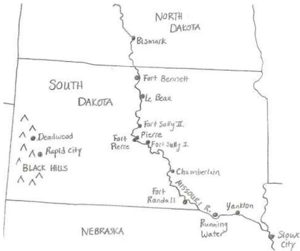
Figure 2. Missouri River Forts and the Black Hills. 77