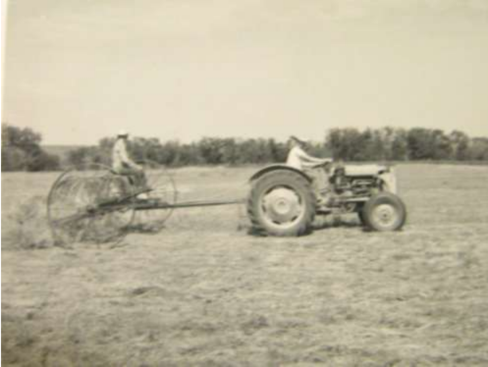
Figure 6. Self-propelled tractor and muscle-powered side-delivery rake, ca. 1950. Windrowing the hay involved power from solar- and fossil-fuel age energy sources for much of the Evans Ranch's existence.

The gasoline-powered tractor added several other machinery appendages to the process of haying that changed the length and productivity, and thus labor, of haymaking. The windrower, which attached to the tractor, cut the alfalfa and windrowed all in one operation, readying the alfalfa for the sweep to come around and collect it to create a stack. Compared to the length of the mower's sickles, which cut a six-foot swath of alfalfa at a time, this twelve-foot-wide windrower could process the field in much less time. In 1952 the Evanses purchased a 'square baler' which, combined with the tractor, made significant contributions to the speed and efficiency of haying on the ranch (see Figure 1). This piece of machinery attached to the tractor and processed the alfalfa into bales tied with wire, depositing them back on the field as it went. Although these were rectangular rather than cubic, at two feet wide and approximately three feet long, these bales provided versatility for feeding, placement, and transportation.