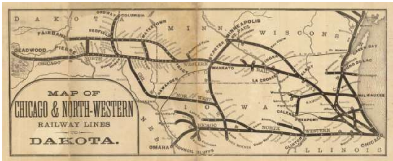
Figure 3. “Map of Chicago & North-Western Railway Lines to Dakota,” 1880. The Chicago and North Western Railroad was one of several railroads that would create new “paths” between important markets in Chicago and the Black Hills. 114

The limits of solar-age transportation showed themselves not only in the east-west routes between the hills and Missouri river, but also in the stagecoaches and freighters that ran in the north-south direction. The completion of the Union Pacific Railroad through Cheyenne, Wyoming and Sidney, Nebraska opened the door to another combination of rail-overland transport to the Hills, especially during the first few years after the 1875 gold rush when placer mining took place primarily in the southern parts of the hills 115 A local history of Battle Creek Valley, located south of Rapid City and adjacent to the Hesnards’ future ranch, recalls the many “horse drawn conveyances” and “bull trains” that traversed through as settlers and miners continued on the Sidney Trail using solar-age energy sources. 116 On March 16, 1878, the Black Hills Weekly Journal reported that the “Pratt & Ferris mule train of eighteen wagons, arrived from the south Thursday afternoon. They were 24 days out of Sidney [Nebraska].” 117 The