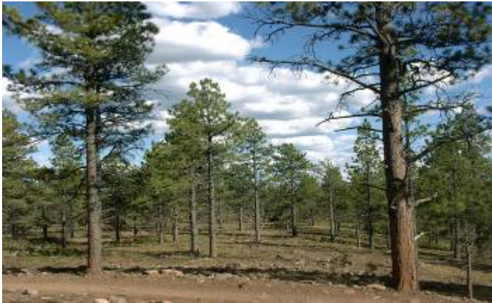
Forest Restoration Thinning