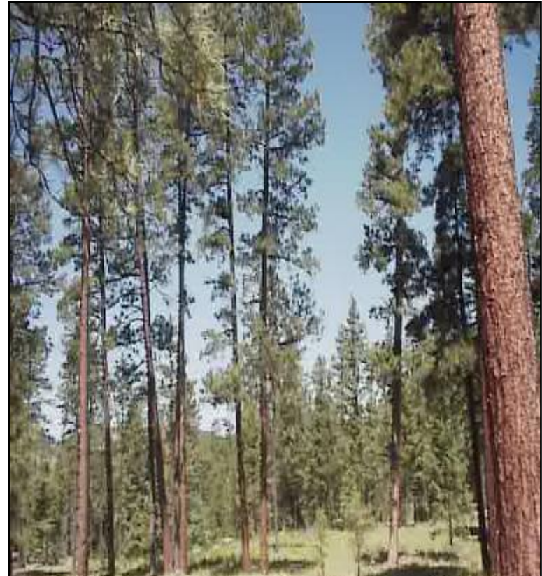
Desired existing condition