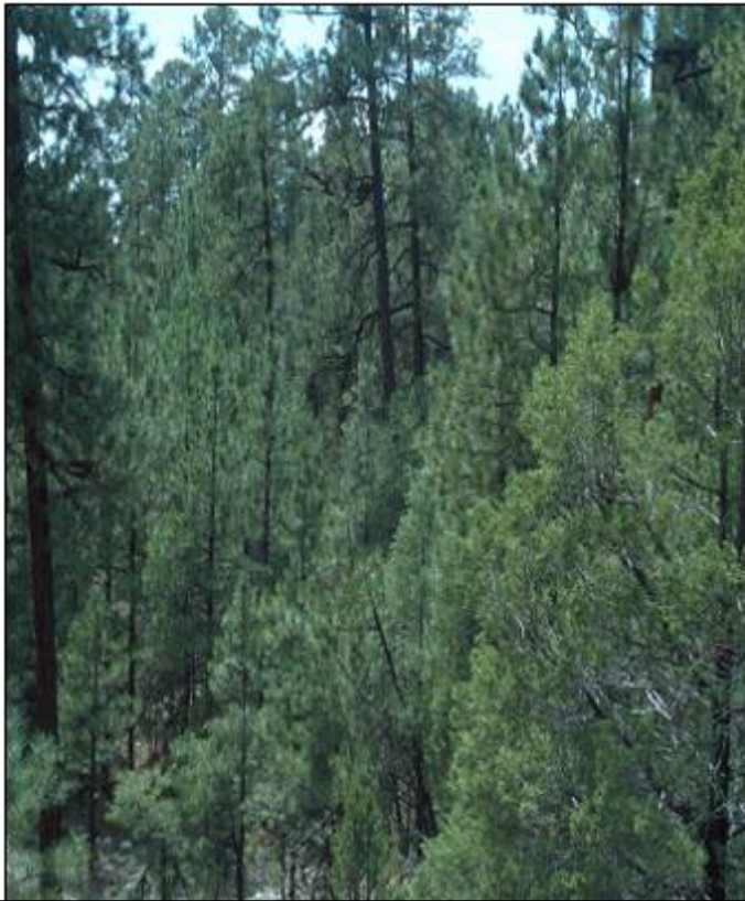
Common existing condition

Easily tolerates mechanical and fire use applications