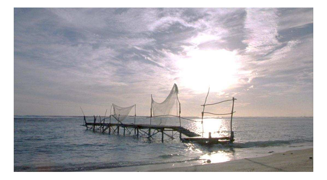
Figure 21: A heavenly shot of the pier and ocean horizon.

audience of the possible, Zionistic lives they may live upon following religious beliefs. One such shot is of the pier basking in the diffused light of a white sun behind wispy clouds (see fig. 21).