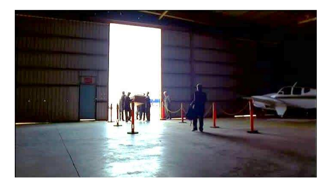
Figure 8: Dalton's coffin exits into the light.

The moment when Dalton's coffin is carried by the missionaries out of the doors of an airport hangar and into the bright light of the sun is the most striking use of daytime and light as a spiritual metaphor in the film. After a rousing monologue by President Beecroft, in which he summarizes the morals and purpose of the film, the male missionaries carry the coffin--and Dalton--towards the light. The hanger is well lit, but it pales in comparison to the brightness of the midday that awaits Dalton and the missionaries outside. They hoist the coffin to their shoulders as they cross the threshold of the hangar, reiterating the visual argument to the audience that he has spiritually ascended. The physical lifting of his body is a metaphor for his figurative spiritual growth. The light consumes Dalton and the other missionaries, reminding the audience of Kinegar's rejection of his faith and his exit into the darkness at the bus station (see fig. 8).