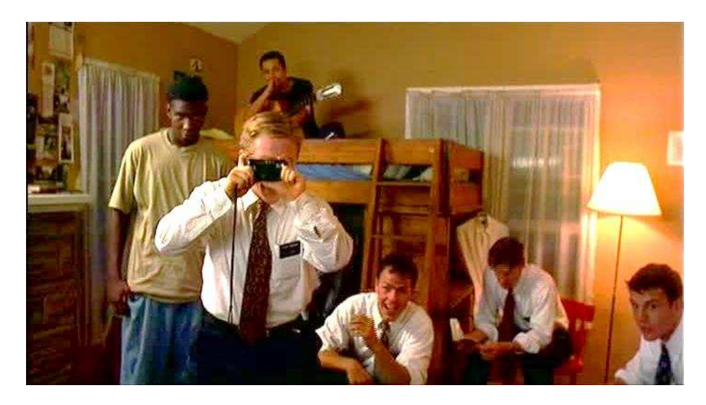
Figure 3: First shot of Kinegar.

Kinegar plays an important role in exemplifying descending spirituality and is often situated opposite of Dalton in the narrative. The first time the audience sees Kinegar is at the conclusion of the prank on Allen, and it is in these moments when we can see how the film introduces Kinegar as unresponsive, dark, and different from the other missionaries. After stumbling into the house and seeing a camera flash, the film visually introduces the rest of the missionaries living there. There is a prolonged shot of six missionaries on one side of a room, and in front of a window sits Kinegar, head turned down as he reads a book (see fig. 3).