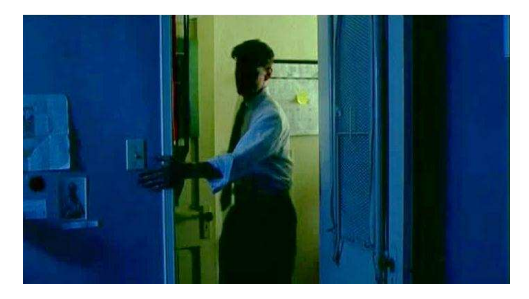
Figure 5: Darkened doorway shot of Kinegar.

station predicts a later scene when Kinegar himself goes to that same bus station to enact his doubts.