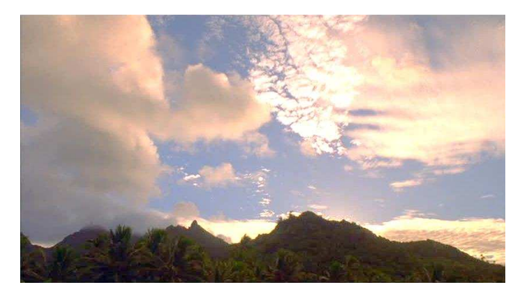
Figure 18: A heavenly shot of the island's mountains and sky.

dimly lit but the clouds in the sky are aflame with bright oranges as they sit beneath a purple and blue sky.