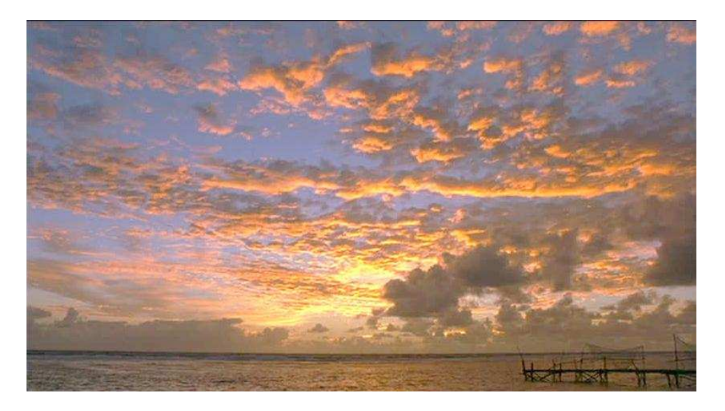
Figure 19: A heavenly shot of the island's sunset and ocean horizon.

The reflection of the orange clouds sits softly on the surface of the ocean. The third shot shows eight palm trees, nearly in silhouette against a light pink background of clouds (fig. 20). The ocean appears grey while the clouds radiate a purplish hue. As I mentioned above, these shot share several characteristics: all three are extreme long shots, they all share a high-contrast color