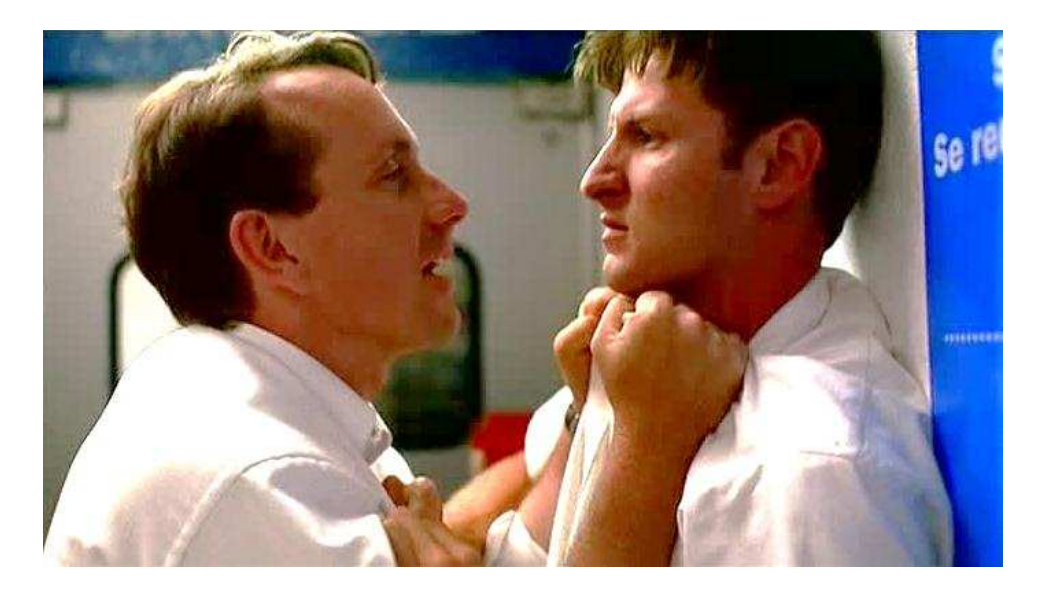
Figure 4: Final confrontation between Dalton and Kinegar.

Dalton made spiritual decisions that led him towards faith and dedication (ascending spirituality) while Kinegar chose to leave his faith and dedication behind (descending spirituality).