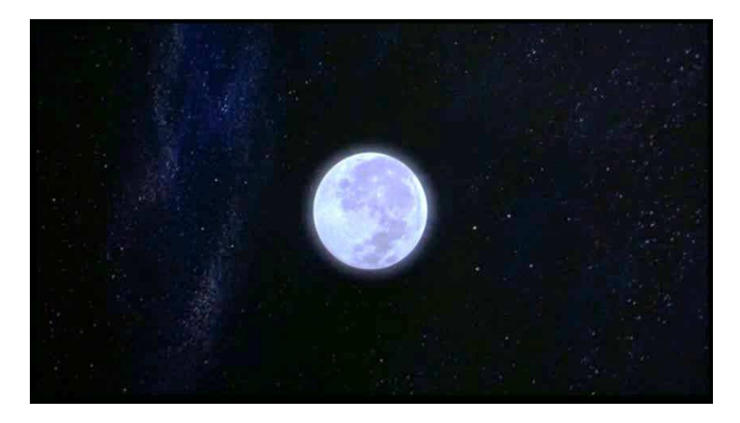
Figure 9: First shot after opening credits.

The film depicts God in a variety of ways. Perhaps the most obvious visual metaphor utilized throughout the film is the moon or sun as God. There are many varied depictions of the moon, some more explicitly related to God's involvement, while others act more as reassurances of God's existence and watchful eye. Beginning with the first shot after the opening credits, the filmmaker sets our visual expectations for depictions of God for the duration of the film. Very tellingly, the first image is a long shot of a full moon in a dark night sky (see fig. 9).