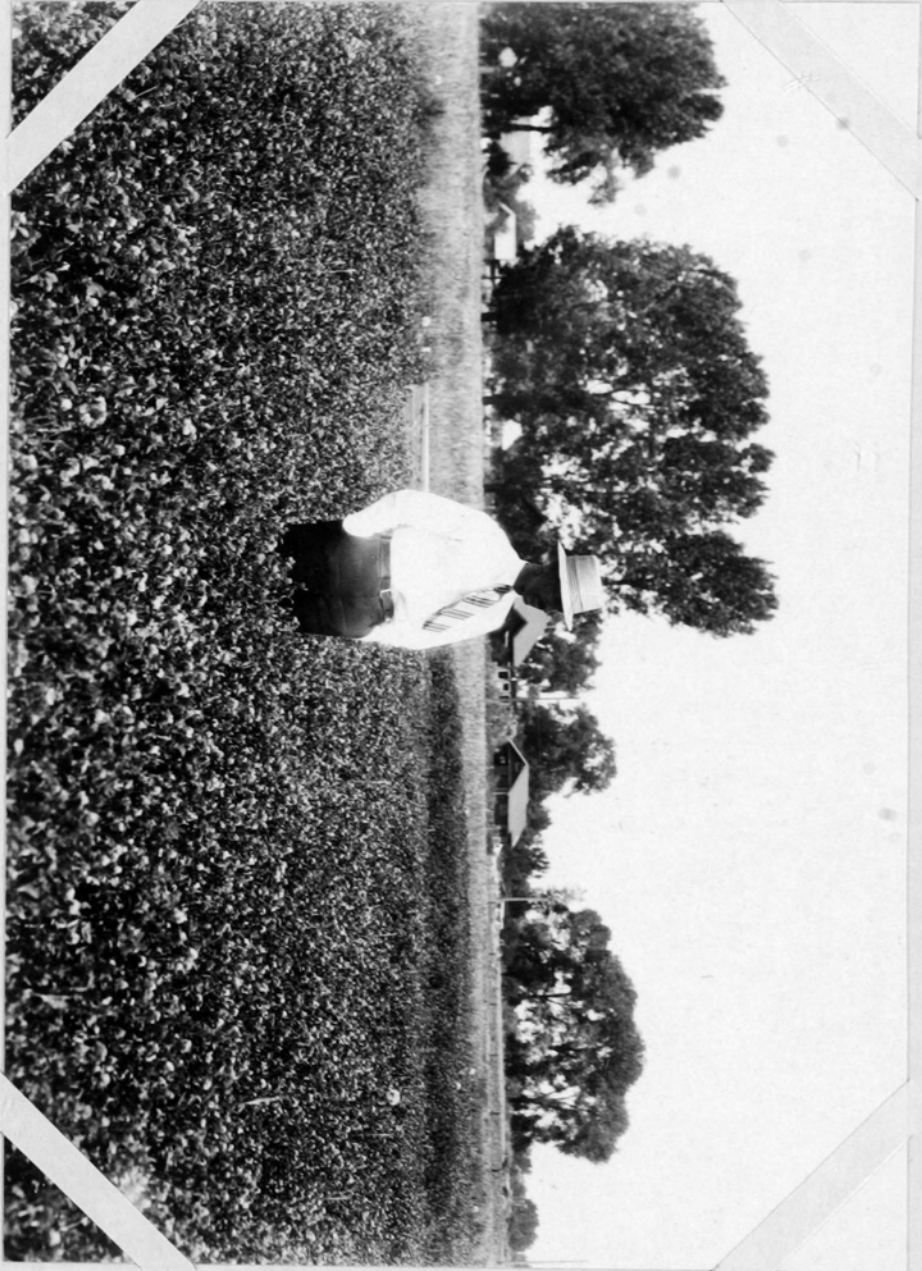
Figure 1. A normal field of Red Clover in Colorado.