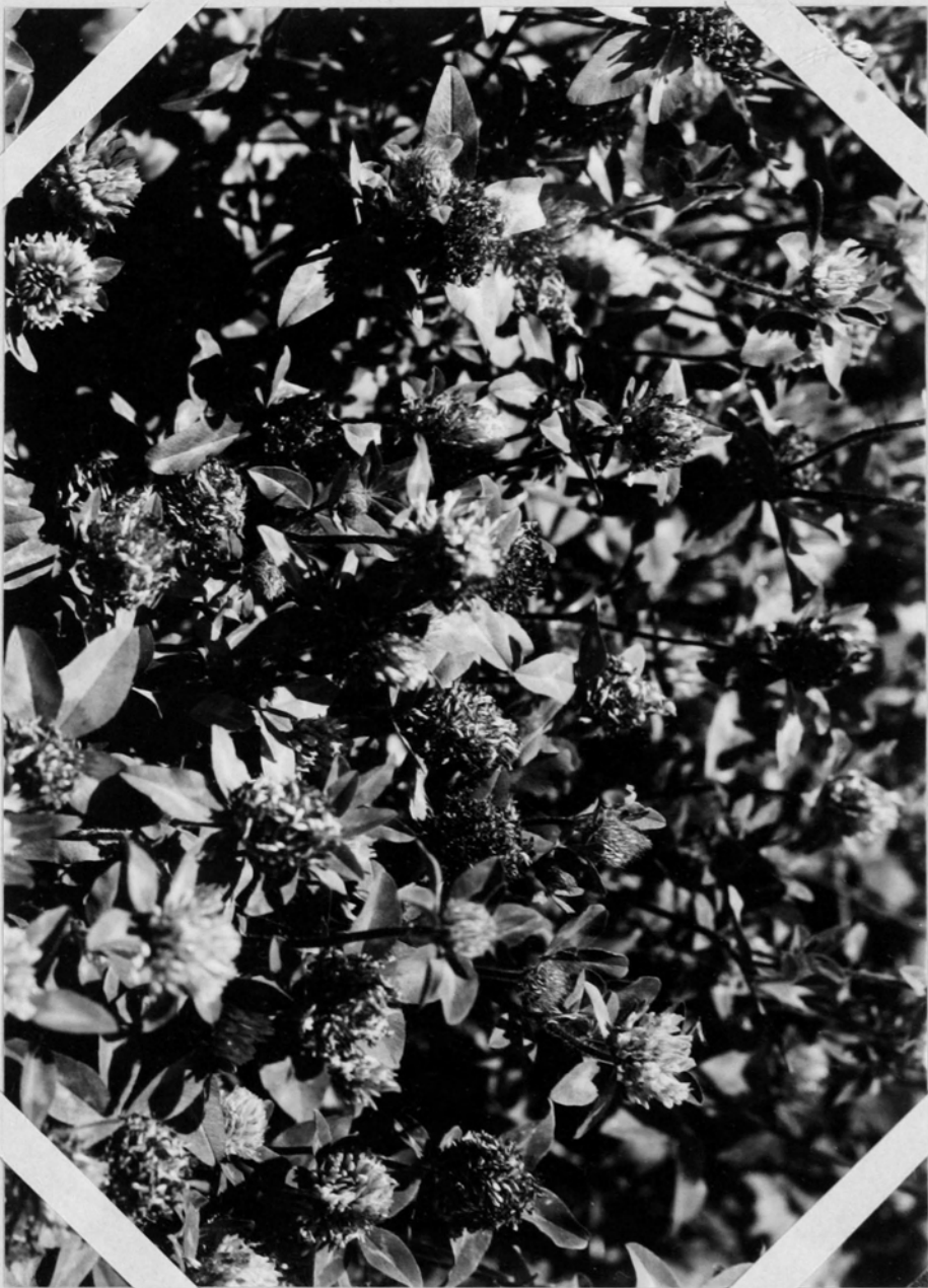
Figure 4. The corollas of pollinated flowers soon wither and die. These flowers are of the same age as those in figure 3, in the same field and side by side.