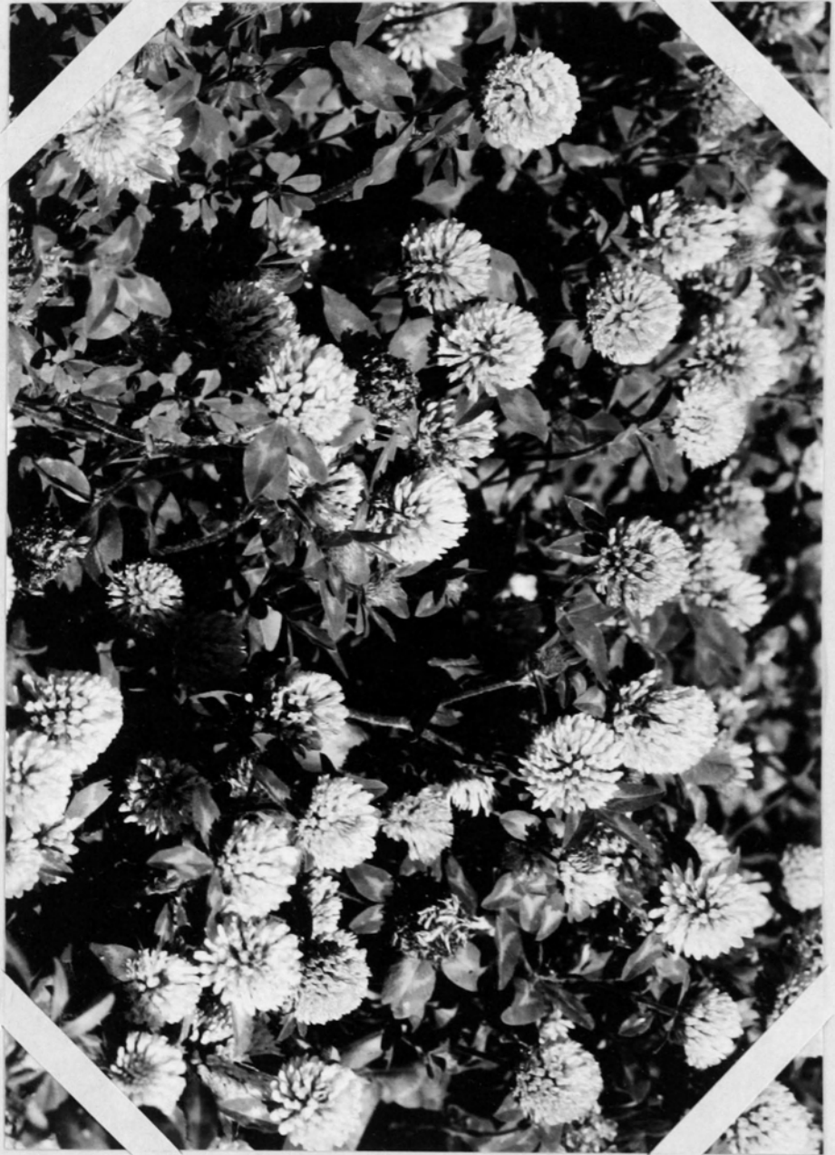
Figure 3. Caged blossoms remain fresh longer than those in the open field.