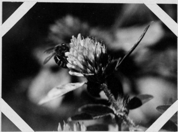
Figure 2. Honey bees at work pollinating red clover. Note the pollen on the legs in the upper picture.