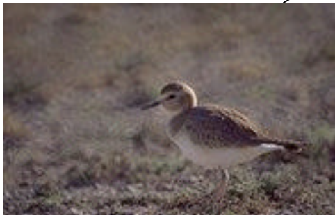
Mountain Plover ( Charadrius montanus )