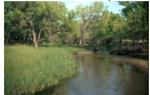
Three-sided bullrush and plains cottonwood / Switchgrass ( Scripus pungens and Populus deltoides spp. monolifera / Panicum virgatum )