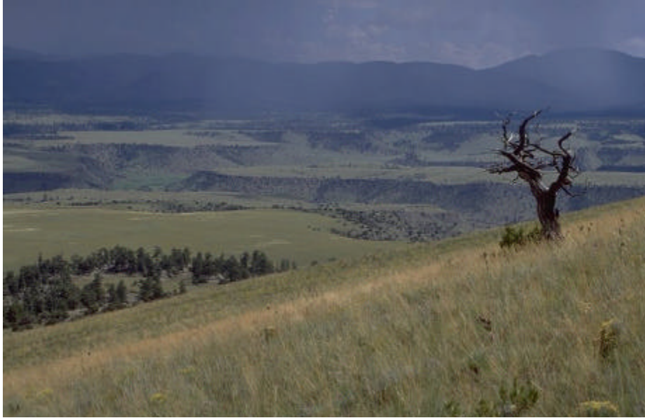
Montane grassland ( Festuca arizonica - Muhlenbergia filiculmis )