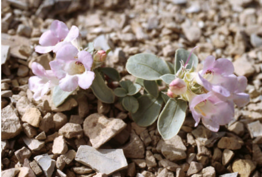
Parachute penstemon ( Penstemon debilis )