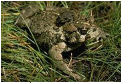
boreal toad Southern Rocky Mtn. population ( Bufo boreas Pop 1)