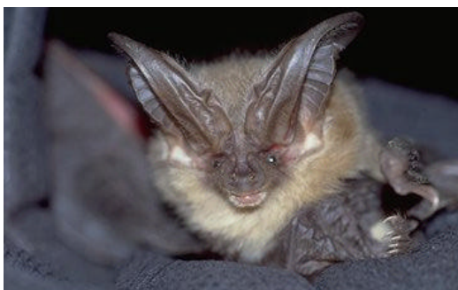
Townsend's big-eared bat Plecotus townsendii