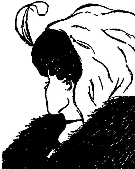
Figure 1.2 Lady-Hag reversible drawing

The operation of paradigms is usefully, but oversimply, illustrated by the young lady-old hag reversible drawing (Figure 1.2). Viewers do not see, except by artificial straining, just black and white lines and patches, hard data, but they see now a young