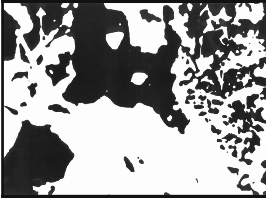
Figure 1.3 The Jesus gestalt

Christ figure here is ambiguous and easily dismissed, but in actual Christian life this hidden presence is often not so easily discounted. It is as though by moral and spiritual experience one's resolving power in the drawing could be sharpened, intense and sharper, so that the believer and unbeliever still could see the same gross shapes but attach different weights and intensities to them. Thus, the believer would find more confirmation, while the unbeliever might remain puzzled before equivocal experience. What one is willing to tolerate as static or noise—the meaningless blotches in the background—depends greatly on developed sensitivities. This points up the participatory nature of religion, increased over that in science, which later we have to examine.