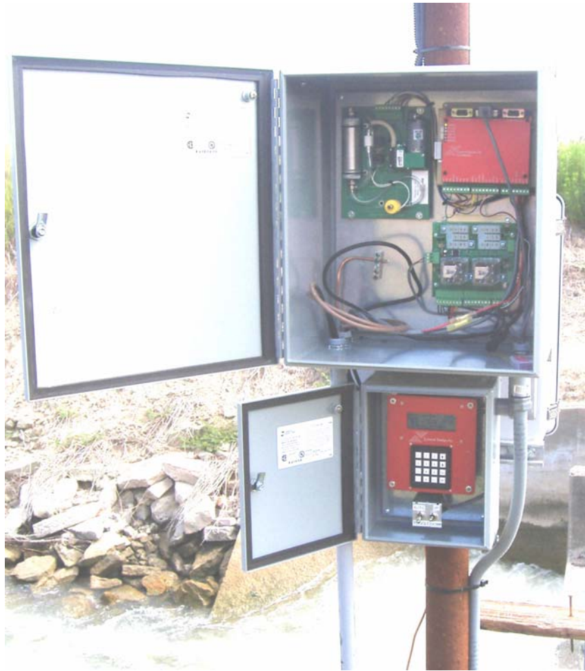
Figure 6. Control Components (upper enclosure) and User-Interface Components (lower enclosure)

A drawback to the on-board display and keypad is that if these user interface components are frequently accessed, there is high potential for the enclosure cover to be insufficiently closed and sealed leading to issues with moisture and/or insects disrupting function of electronic components. For the Nebraska Bostwick project, external display and keypad components are located in a separate electrical enclosure to reduce potential for exposure of sensitive electronic components to the elements. To further isolate sensitive components from potentially corrosive agents, the battery is housed in a separate enclosure on the opposite side of the pole from control equipment.