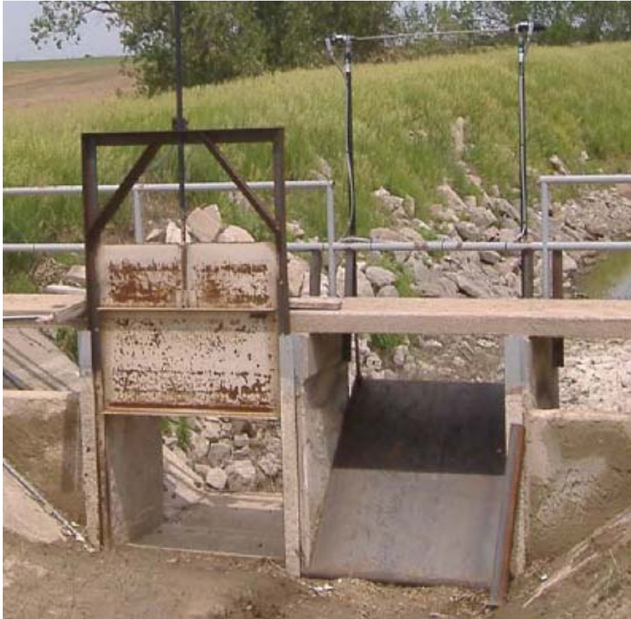
Figure 7. Vertical Slide and Overshot Gates at the 28.6 Check Both Motorized using DC Linear Actuators