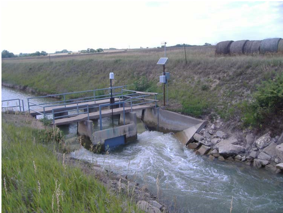
Figure 5. Completed Hardware Installation at the Nebraska Bostwick 20.2 Check