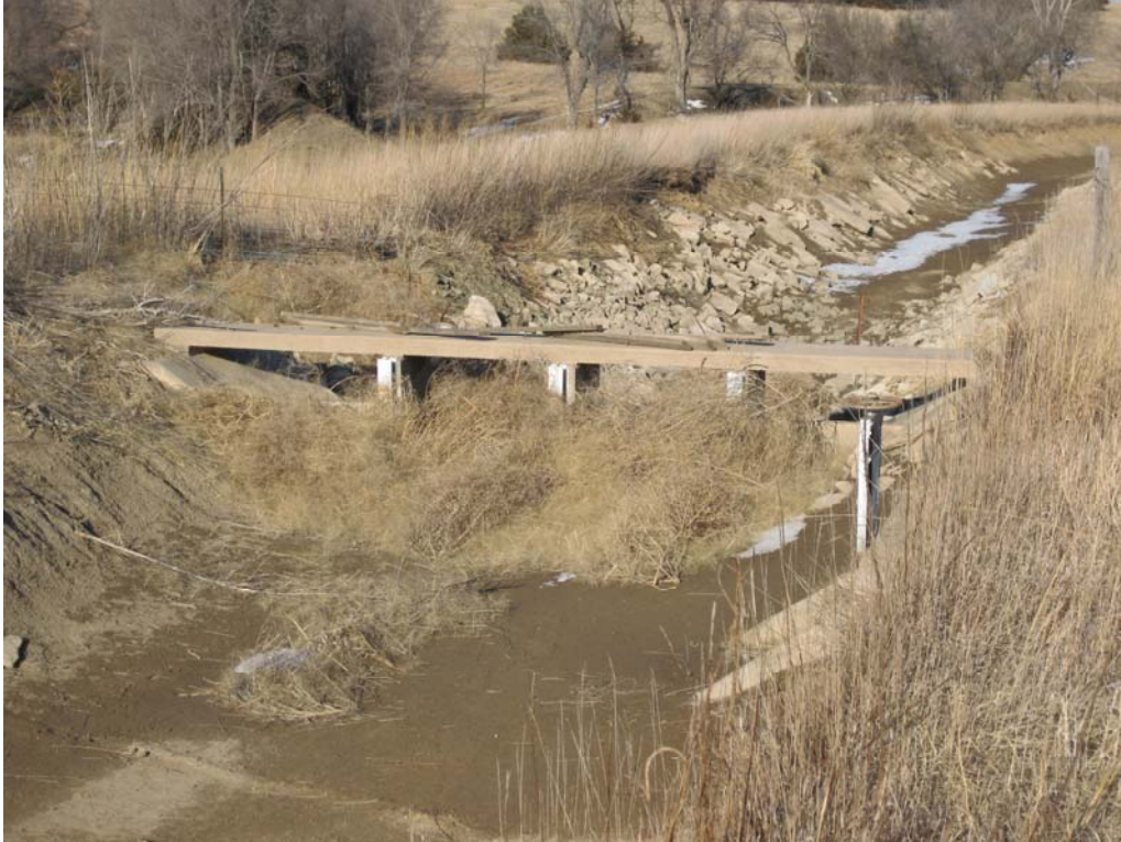
Figure 2. Nebraska Bostwick 34.2 Check in February 2009