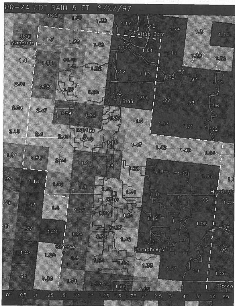
Fig. 2. Example of interactive image showing the 24-hour NEXRAD STAGE III rainfall estimates.