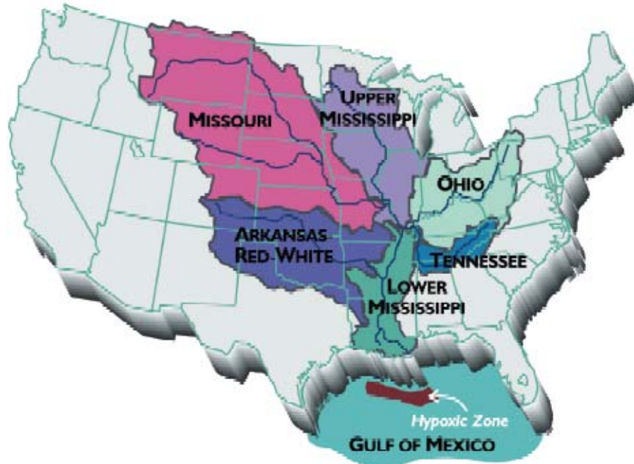
Figure 7. Drained area that contributes to the hypoxic zone in the Gulf of Mexico.