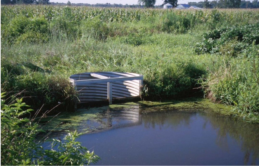
Figure 6. Drainage control structure in humid region.