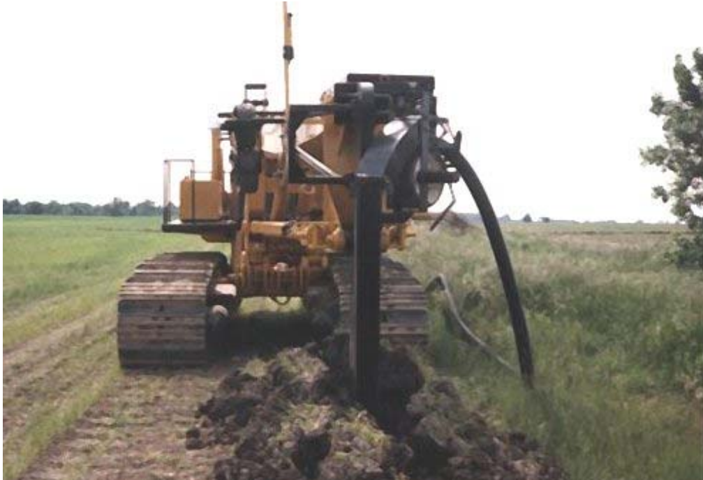
Figure 4. Laser controlled plow installation of plastic drain lateral.