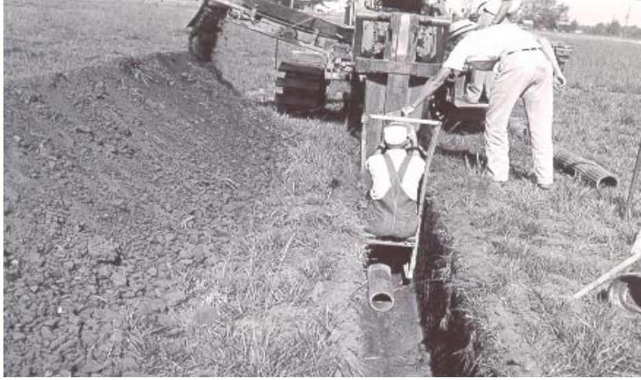
Figure 2. Hand installation of drain tile.