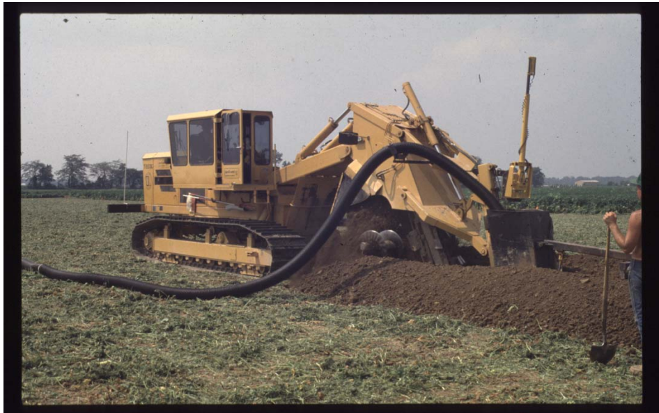
Figure 3. Laser controlled trenching of plastic drainage lateral.