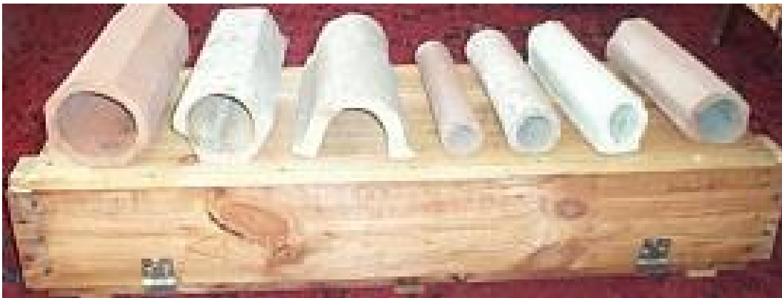
Figure 1. Drain tile shapes.

It appears based on Table 1 that materials and construction are no longer a major component for research. There have been significant improvements over the years in the construction of drainage systems and the drain “tile”. The drain tile has progressed from individual pieces of pipe made of wood, clay, or cement (Figure 1) to a continuous pipe of plastic. The installation process has evolved from a machine dug trench with hand laid tiles (Figure 2) to a continuous pipe that is trenched (Figure 3) or installed into the ground using a laser controlled plow (Figure 4). Envelope materials have progressed from graded sand or soils to fabric “socks” that enclose the drain pipe.