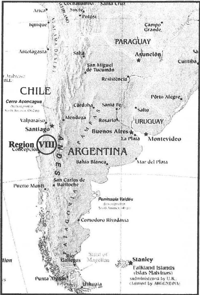
Fig. 1. Region VIII of Chile