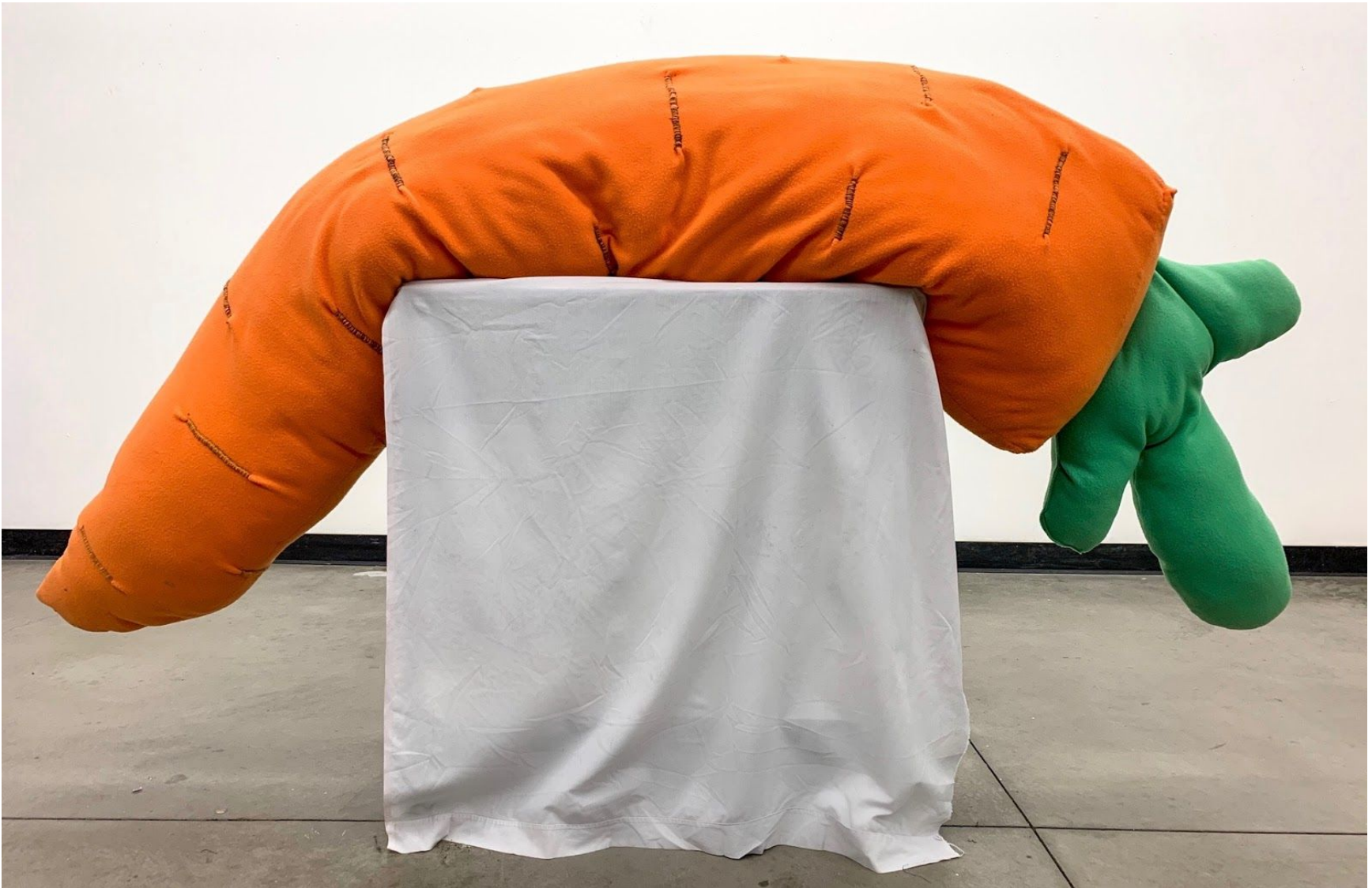
Figure 3: Carrot