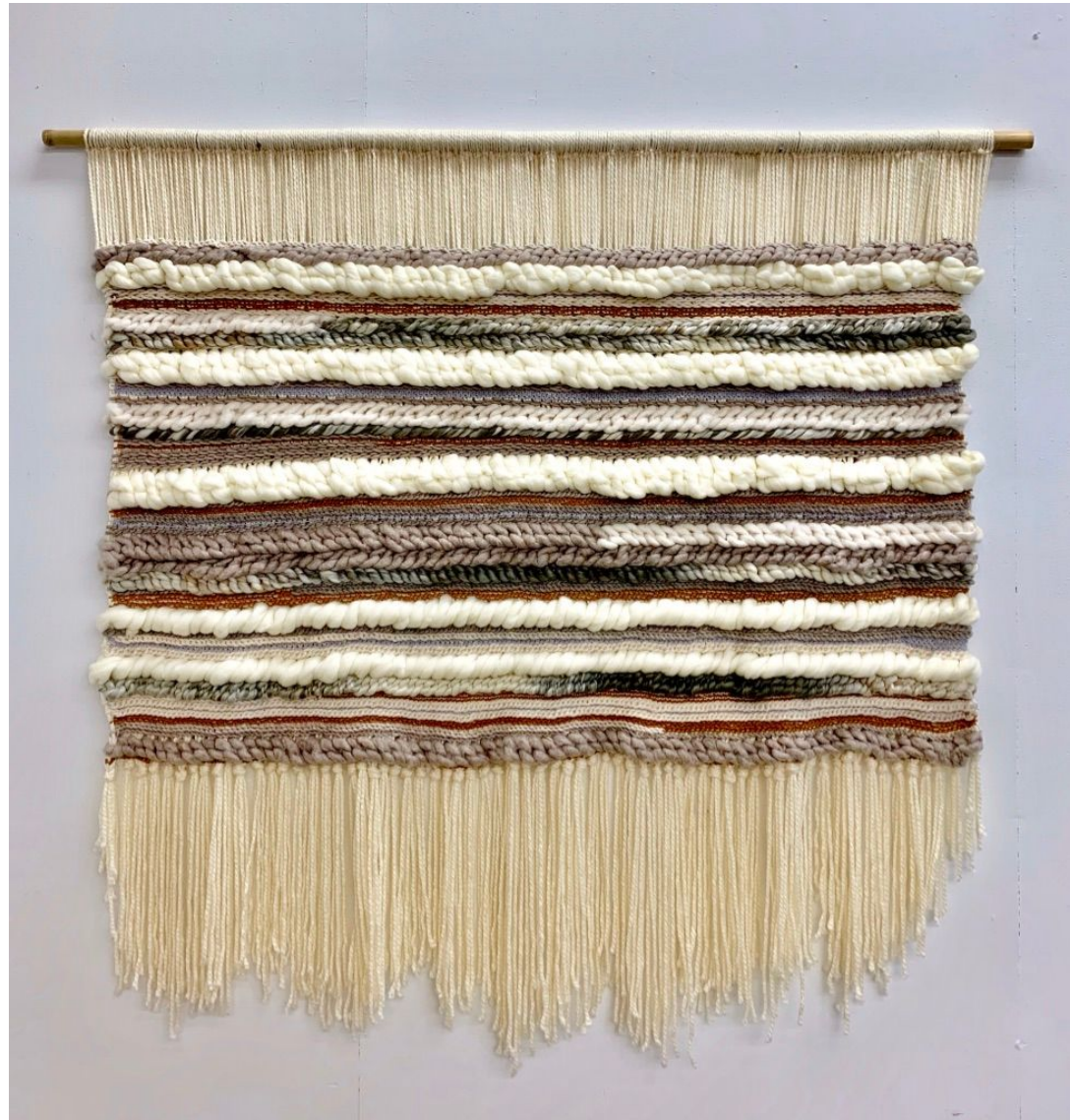
Figure 1: 604 Dexter st.