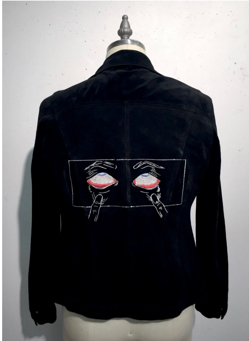
Figure 4: Suede Jacket