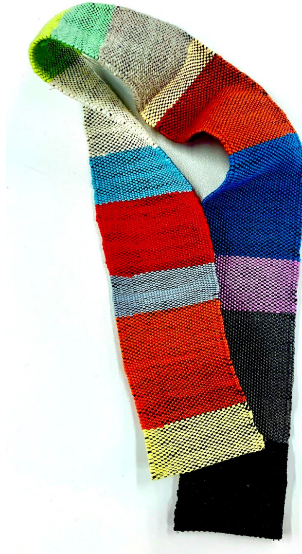
Figure 6: Sad Robot: Color Gradation