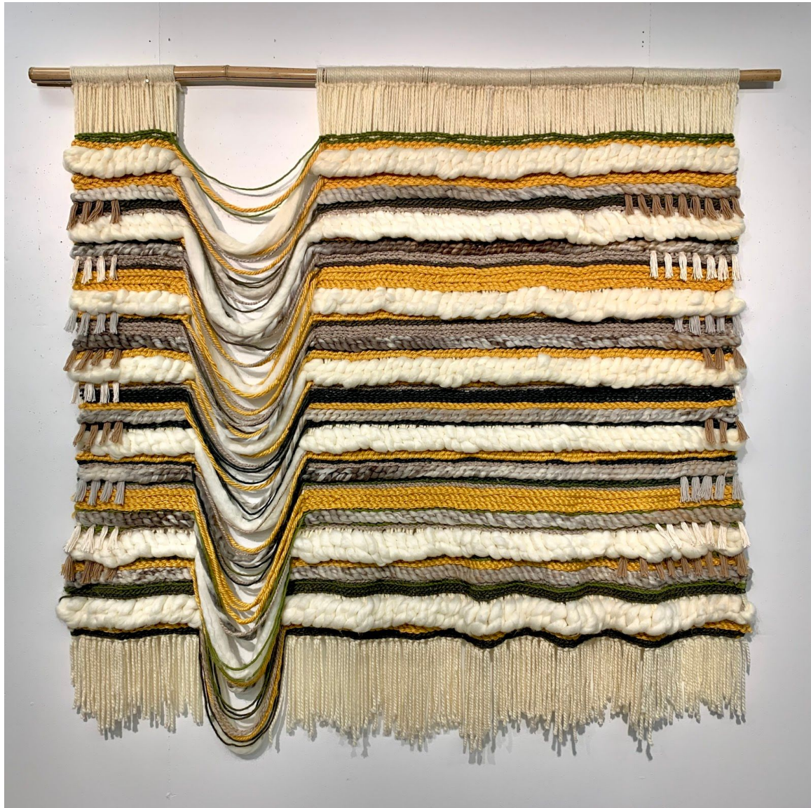
Figure 2: Thompsonville, MI