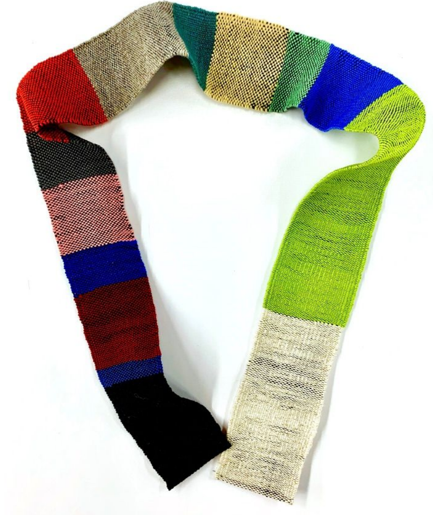
Figure 7: Laughing Skulls: Color Gradation