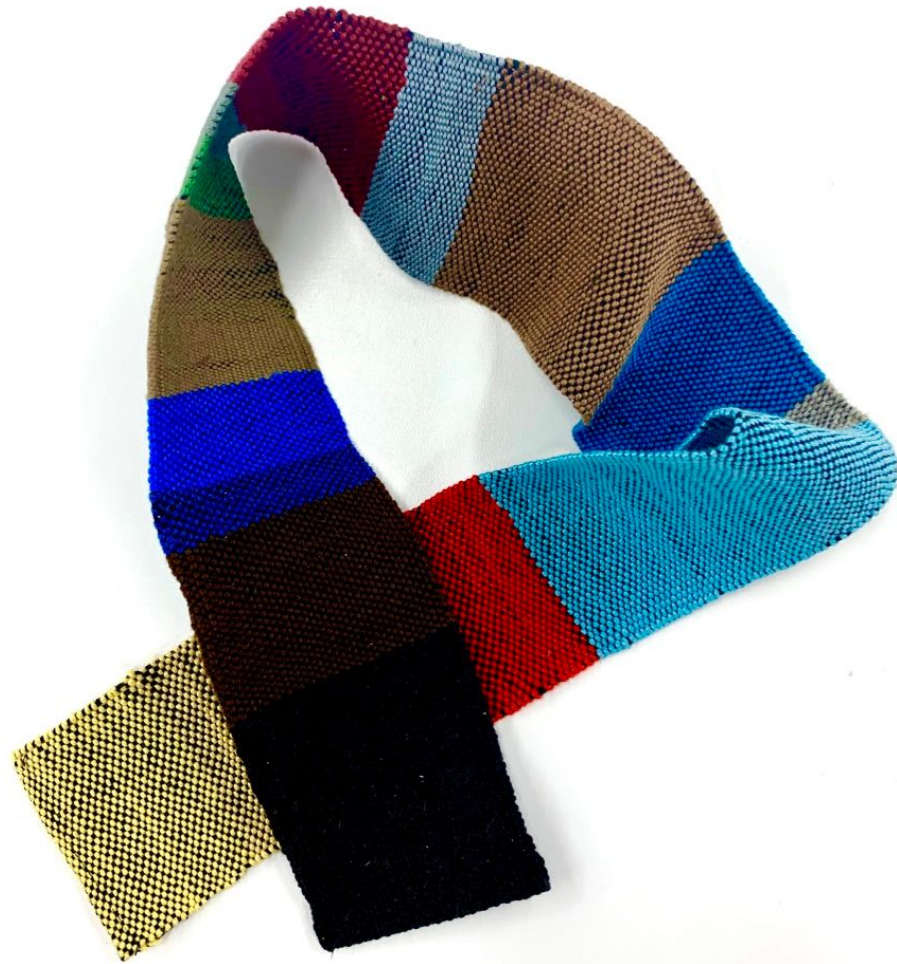
Figure 5: Ka-Pow: Color Gradation