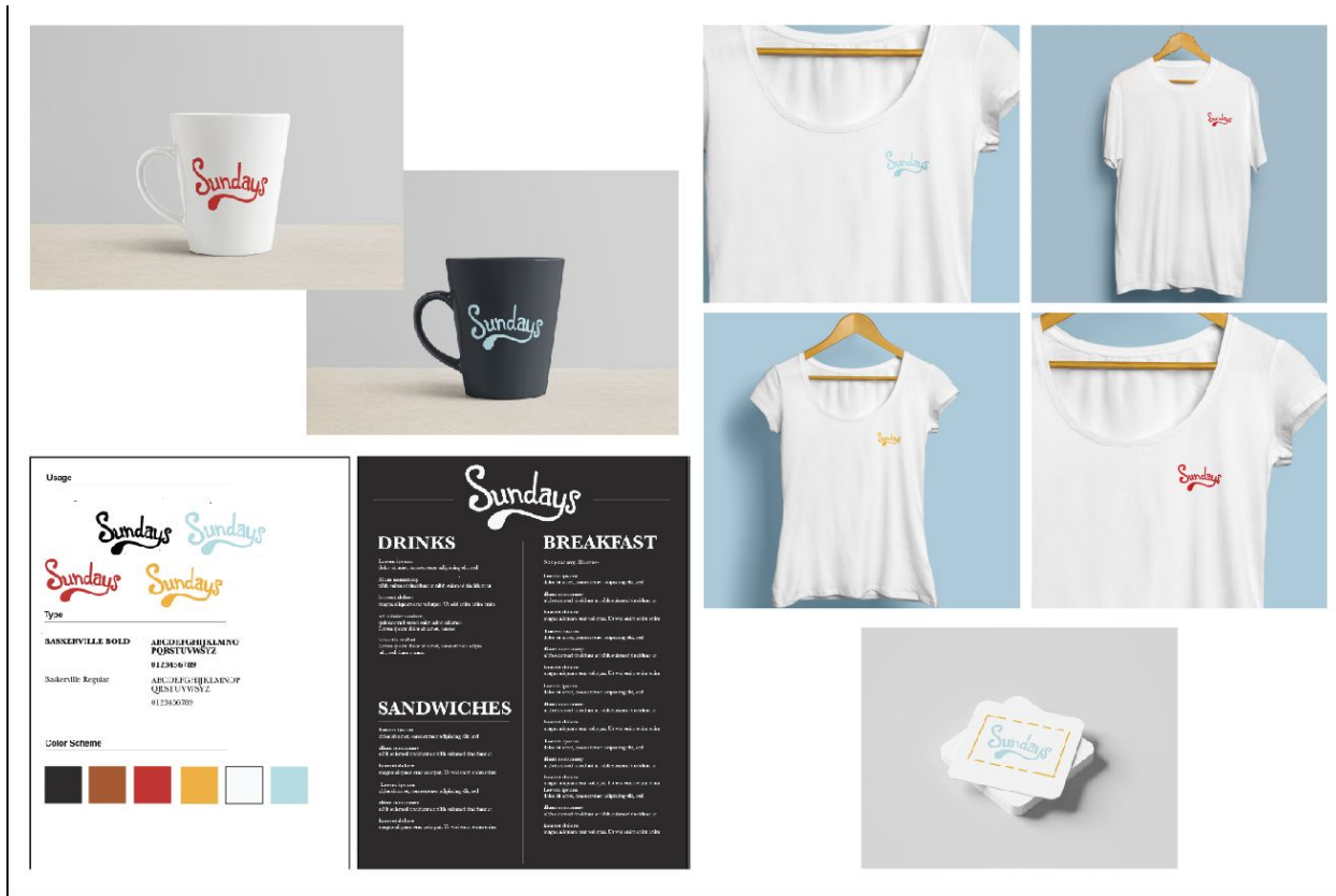
Figure 5: Sunday's Brunch Restaurant