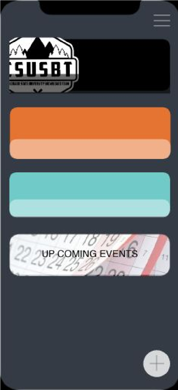
Figure 2: Core Connect