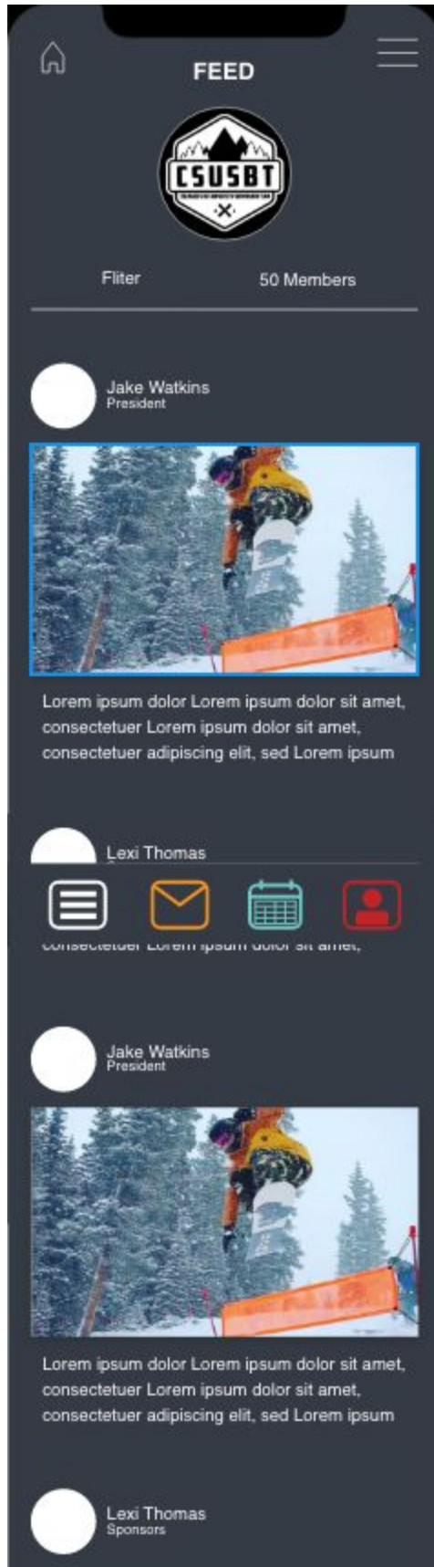
Figure 3: Core Connect