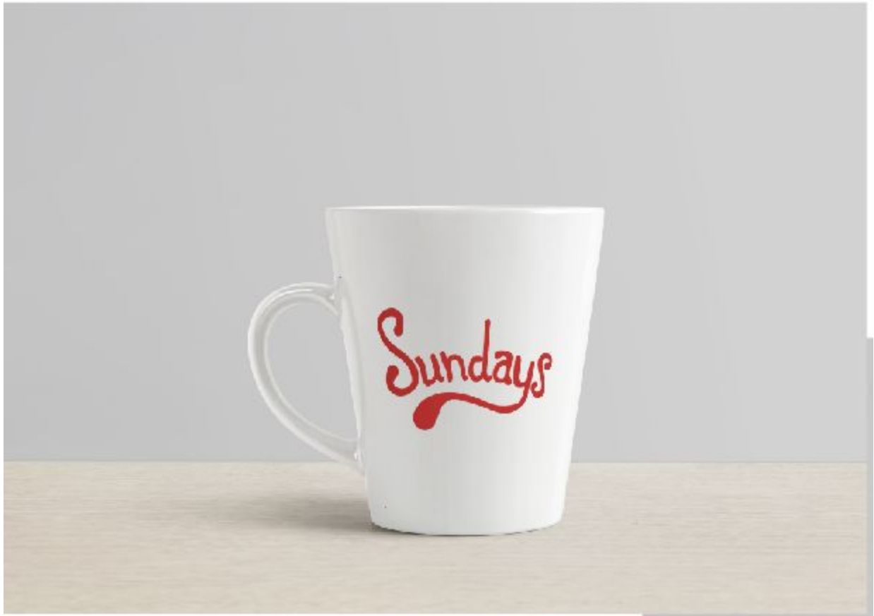
Figure 6: Sunday's Brunch Restaurant (Detail)