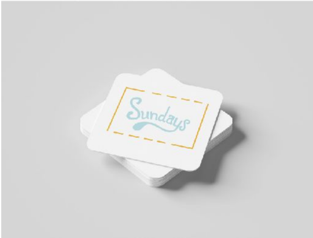
Figure 7: Sunday's Brunch Restaurant (Detail)