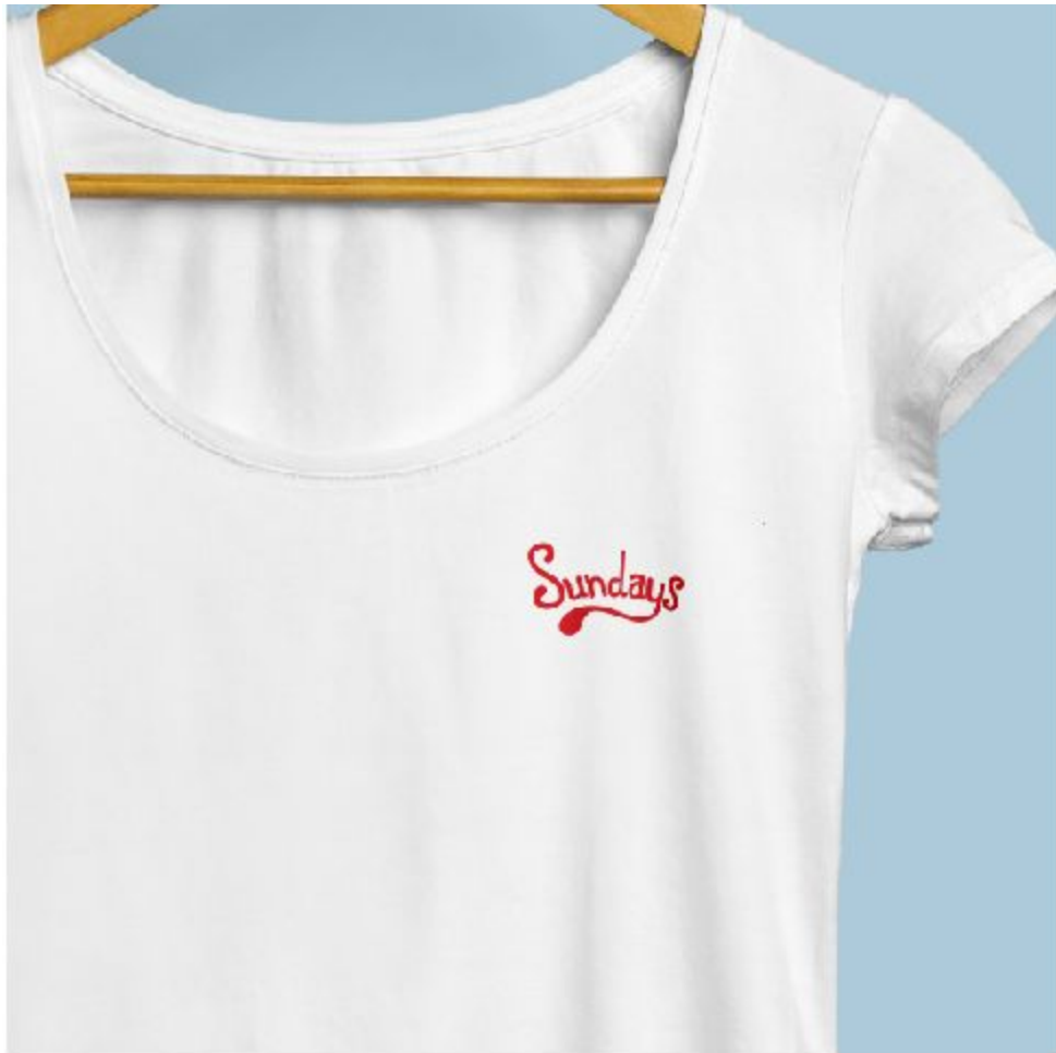
Figure 8: Sunday's Brunch Restaurant (Detail)