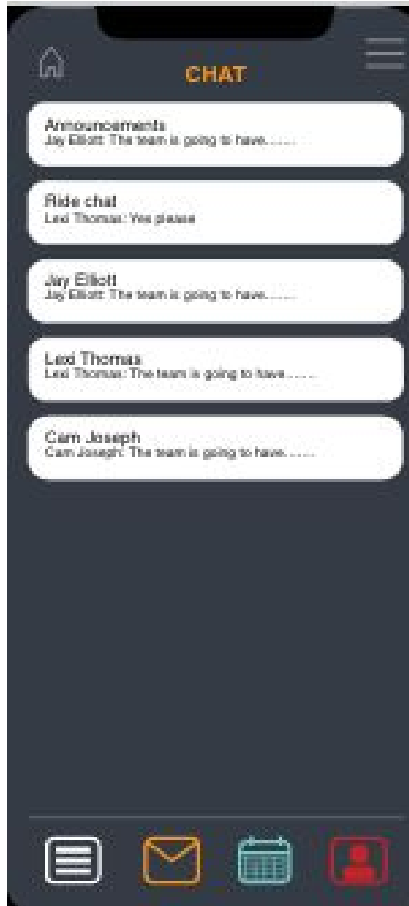
Figure 4: Core Connect