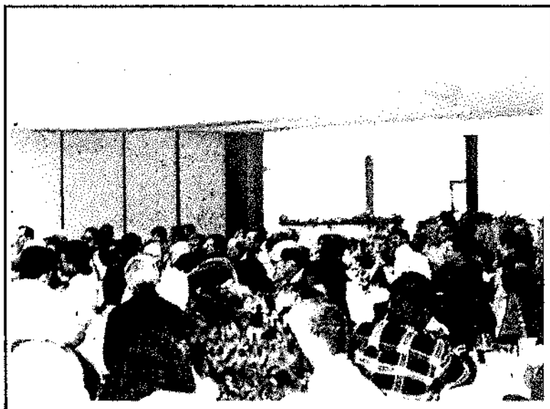
A lot of people are interested in the "River of Dreams and Realities"!

This year's Arkansas River Basin Water Forum, held January 17 and 18, attracted approximately 200 interested participants. Attendees included water users, recreational interests, local, state, and federal agency staff, business interests and members of the general public. After months of organizational effort, the planning committee realized their goal of pulling together diverse interests to address the basin's complex water resource management issues.