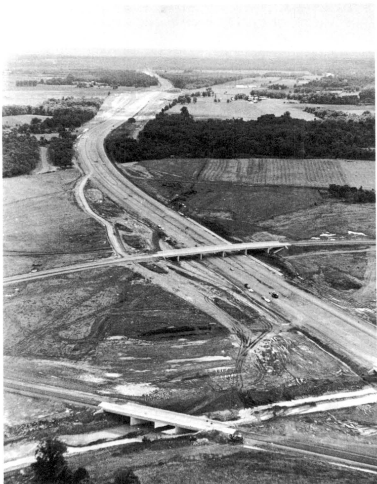
FIG. 1.—AN AERIAL VIEW OF PARTIALLY COMPLETED HIGHWAY FROM DULLES INTERNATIONAL AIRPORT LOOKING EAST TOWARD WASHINGTON, D. C., JUNE, 1961

Sediment moving in storm runoff from a 58-acre drainage area at Kensington, Md., has been measured at a drop spillway by the senior writer since