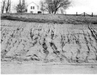
FIG. 2.—EROSION ON A CUT BANK AS A RESULT OF EXPOSURE DURING THE WINTER OF 1960-61 FOR HIGHWAY SHOWN IN FIG. 1

was begun in a new area. A sufficient number of storm events was sampled to show the trend of sediment discharge with progression of the construction cycles. The concentration of sediment in nearly 100 such samples ranges from 680 ppm, after most construction was completed and during a slow steady rain, to 105,000 ppm during an intense thunderstorm when approximately 15% of the 58 acres was exposed. Visual examination of changes in the condition of the