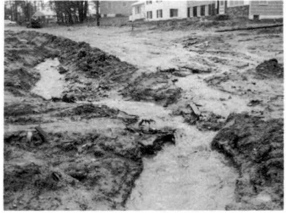
FIG. 3.—SHEET AND RILL FLOW FROM RAINFALL EXCESS ON AN UNPROTECTED AREA DURING RESIDENTIAL CONSTRUCTION