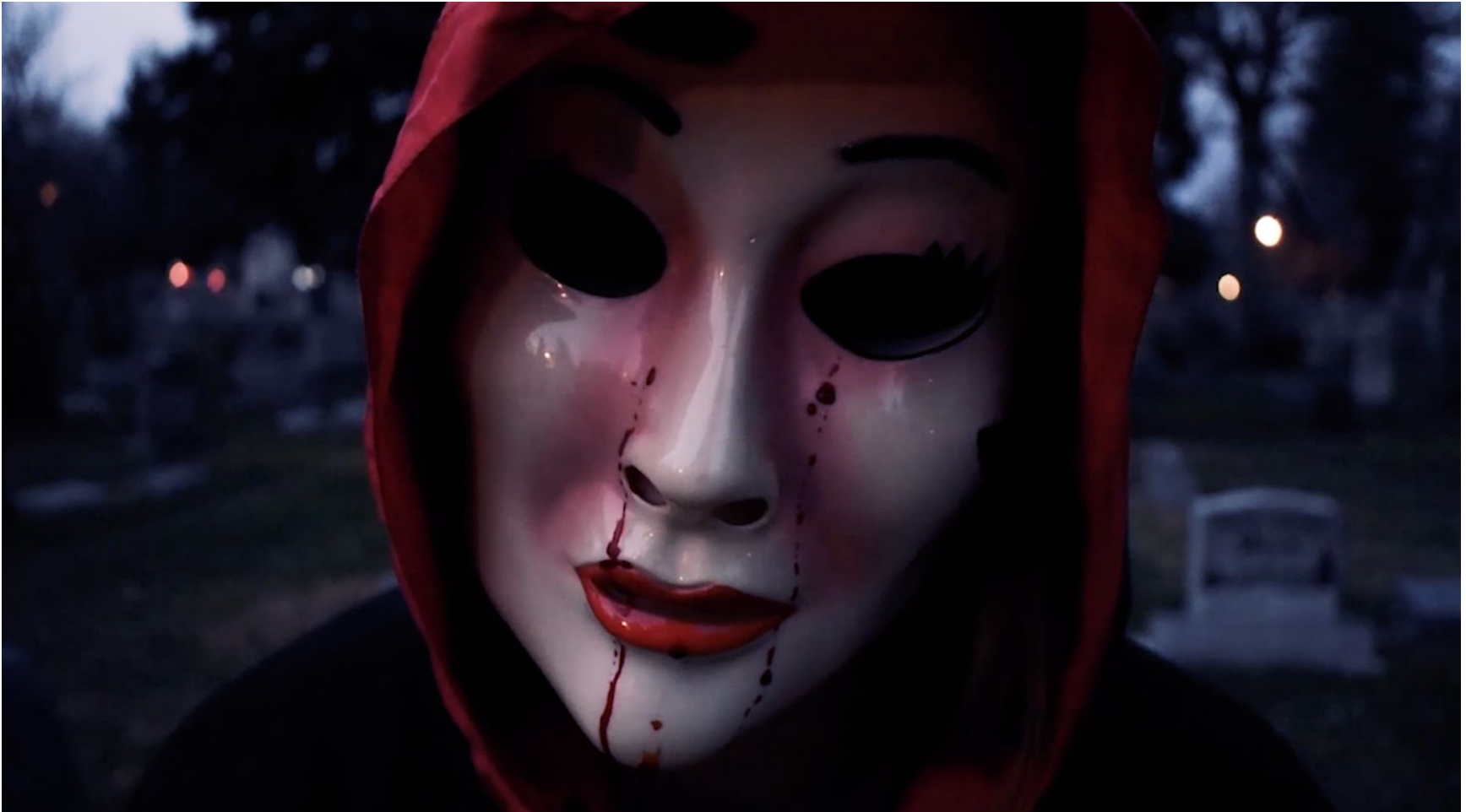
Figure 3: Daemonium