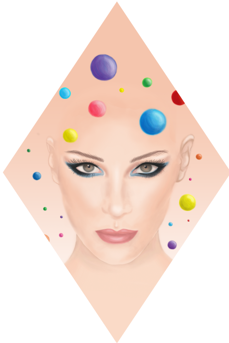
Figure 4: Bella