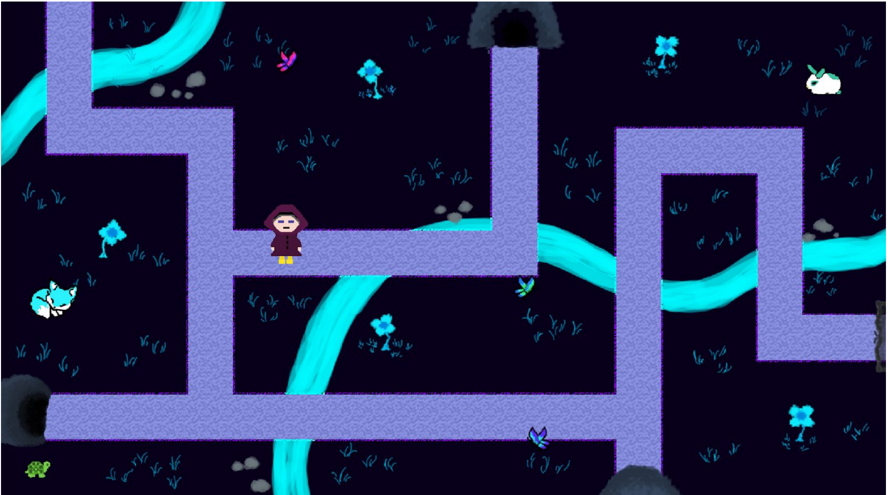
Figure 5: Dotoku