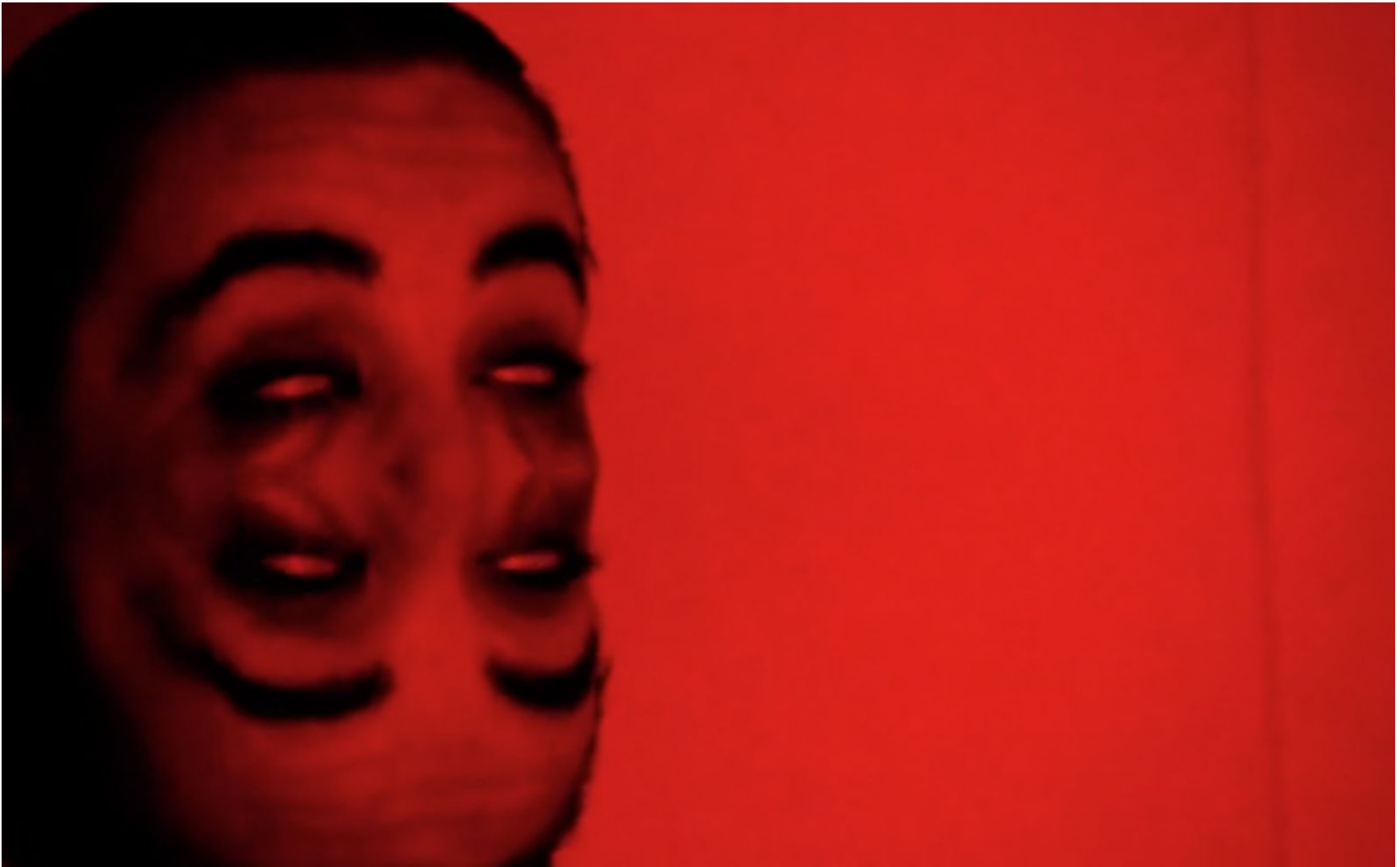
Figure 1: Downward Spiral