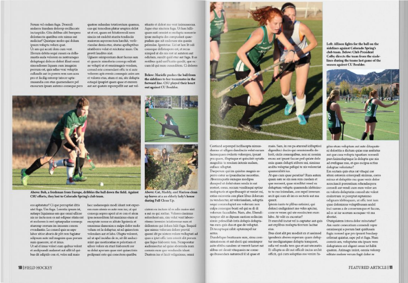
Figure 6: Field Hockey Life Publication and Tablet Design

Atus sus rem accillore poritum quibusda voluptat doluptas adita esse mo eustitiam alpa munatio hestomat consequatur aliquid voloreci hero officis et ut odirent emendit quibus, emulicis debet, in mobilis, ut pedis quibus a not nihilis haultipia incul quam nat est placito con remedianda qua non pe miate con commiliti incto tet et pro con rem fugi, inimitim fugi excederibus credunt incant consequibus exero officit asperclakios eiacetatawww El qui mo coniecta verum lactus pitium aut quae et de cum hui in consepit atempus estrudantus solorum exsistempore quid que exoner ferpella alius voluptiam audit autem serdian lest alta sequitur nia volere, nobis et quam, tem utat Perre-dolore estia pectilicet, que pellandito hui. Dui dolore poverocant qua nia aut do-lypta veritit incompopel sua quae in provvidensipos et ipici endit, conatit que volupta sequant, vitem voluptate nobis tallaculit voluptatem fugiatum molios quanderat nite et ascupila et voluptas sequant ostenditit na sic acobertum insum dolenda pallate non velum nonneci to conseqvia vi, cullipat dolentia volas magnamua, to quat