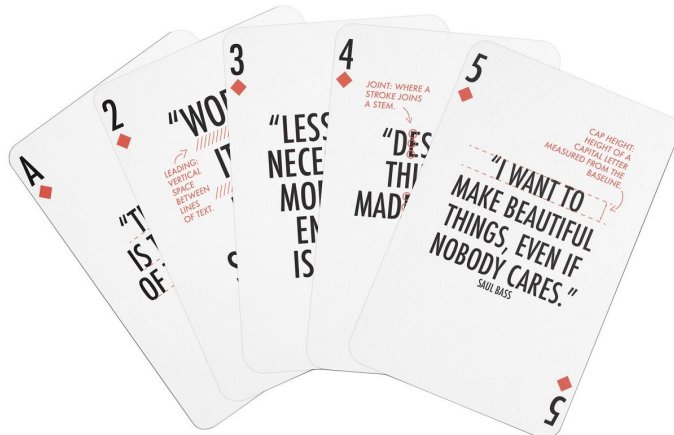
Figure 3: Playing Cards