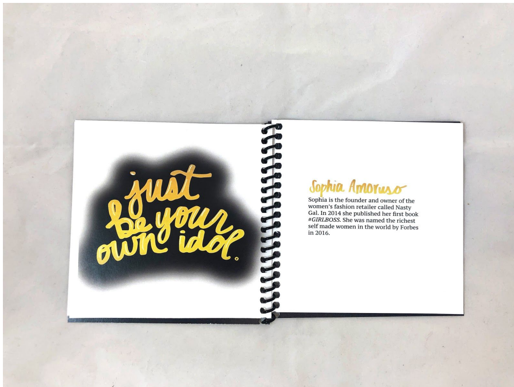
Figure 1: Words of Wisdom by Women Authors Illustrated Book