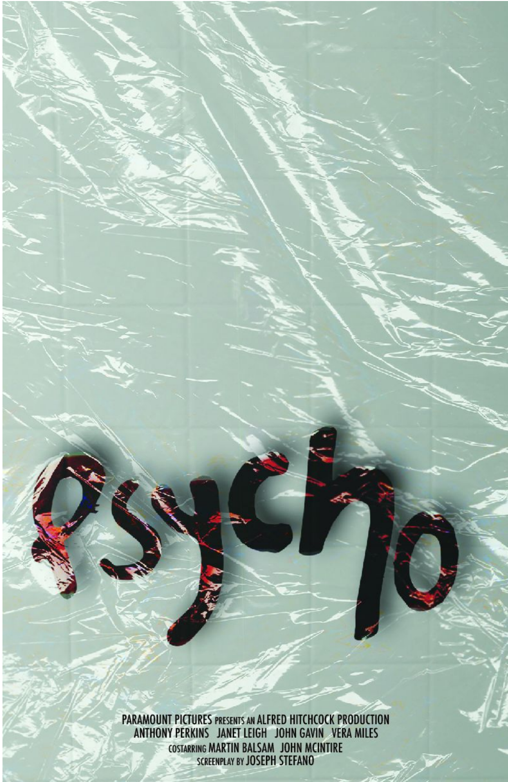
Figure 2: Psycho Poster