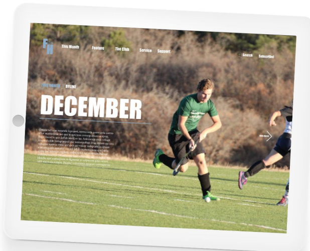
Figure 6: Publication and Tablet Design