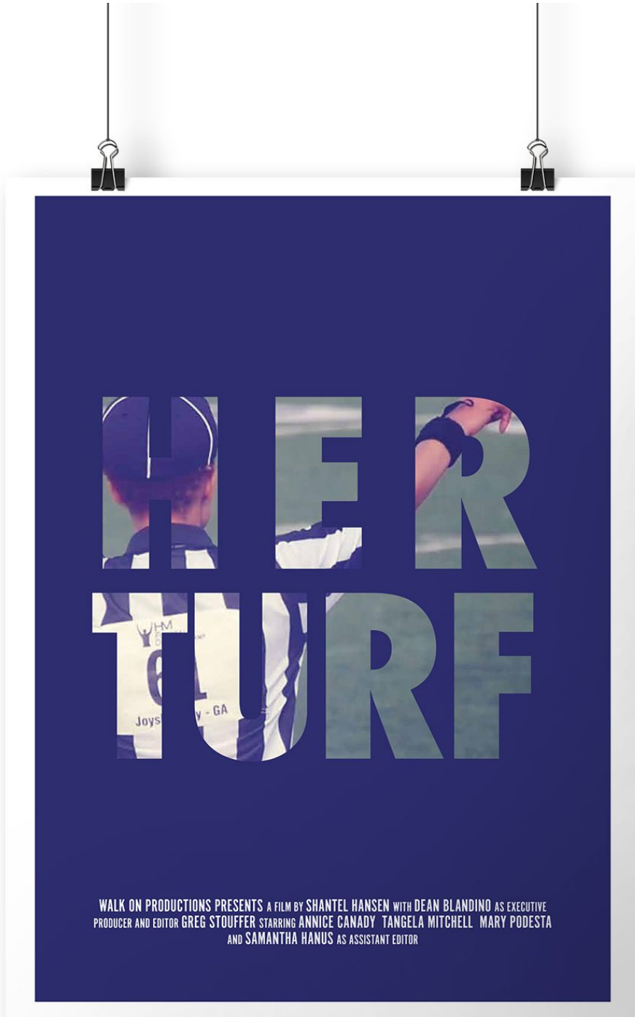
Figure 4: Her Turf Poster