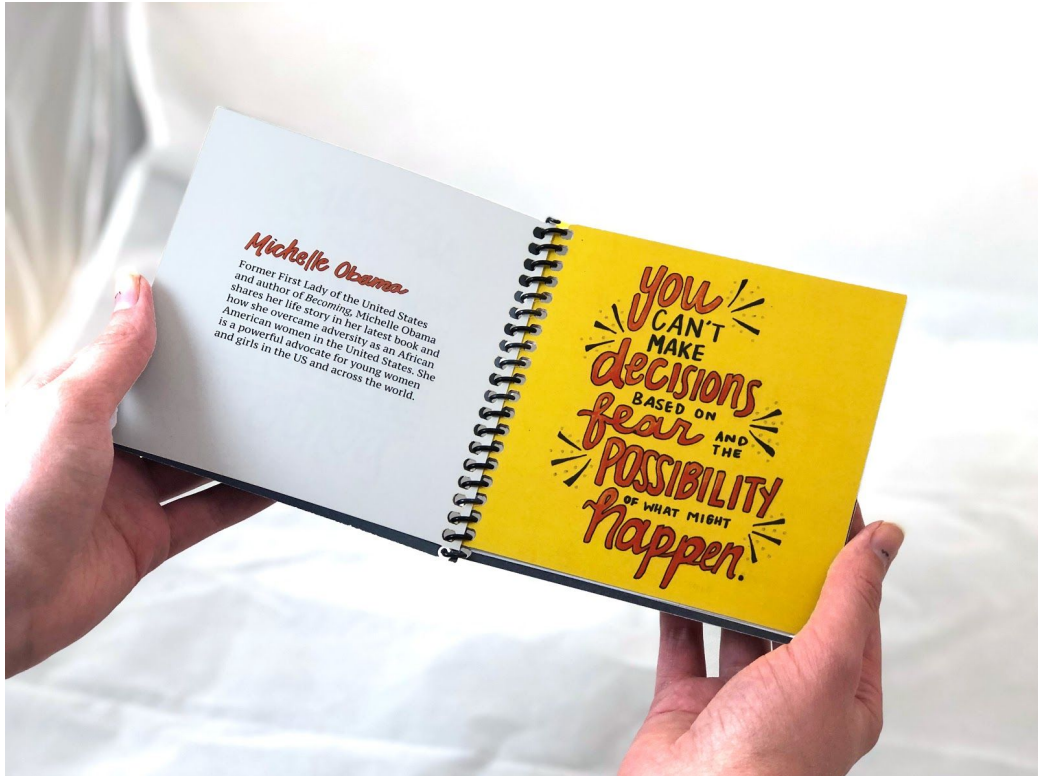
Figure 1: Words of Wisdom by Women Authors Illustrated Book