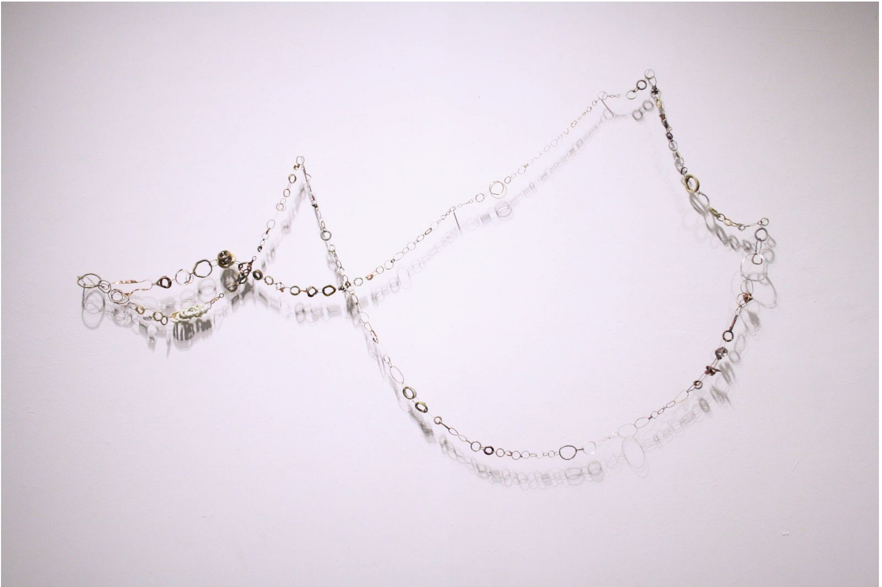
Figure 3: Links