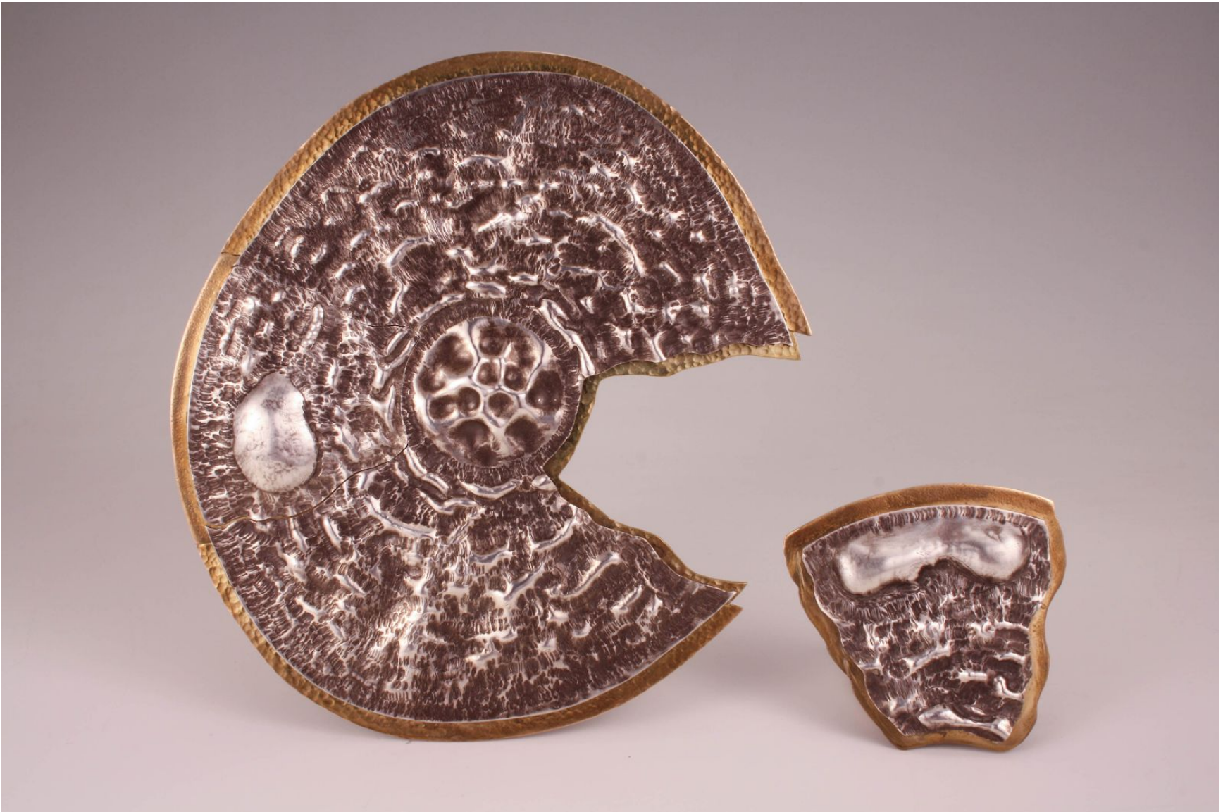
Figure 2: Disperse (brooch)