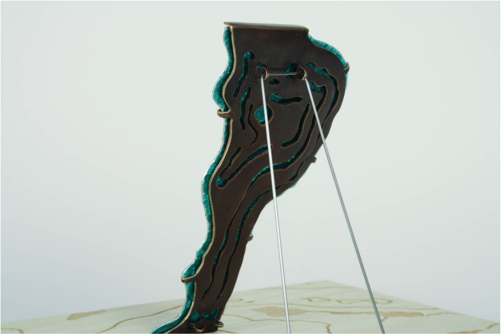
Figure 7: Siblings I (back)