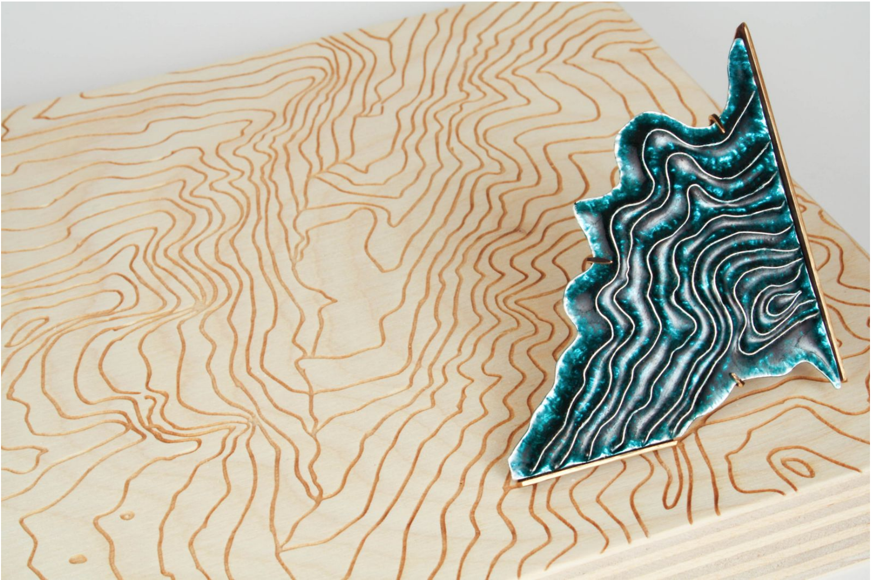
Figure 10: Siblings IV