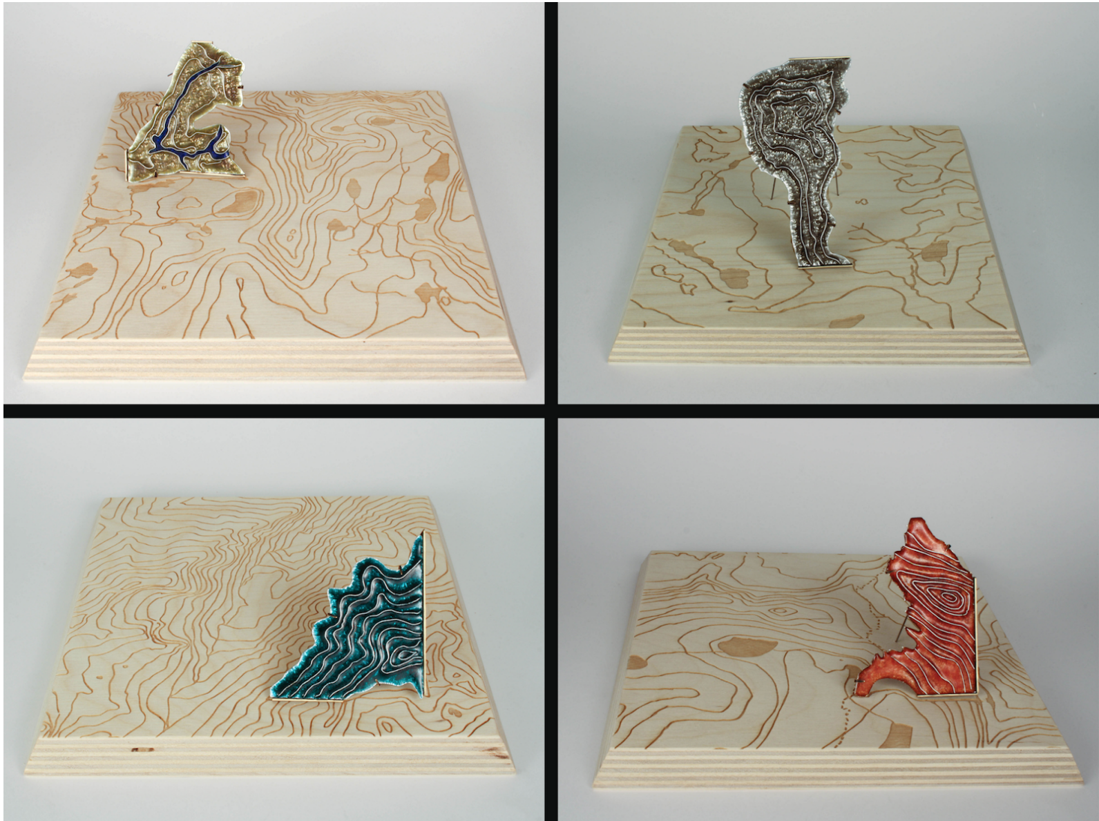
Figure 5: Siblings Series