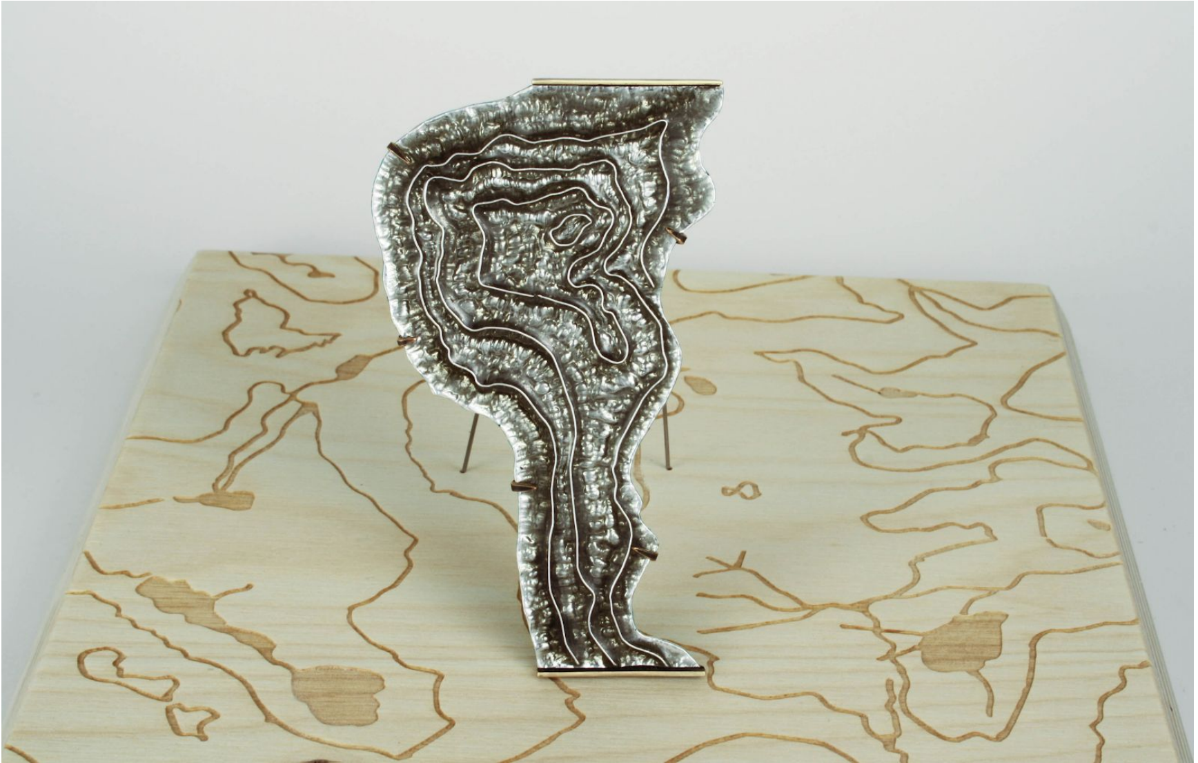
Figure 6: Siblings I