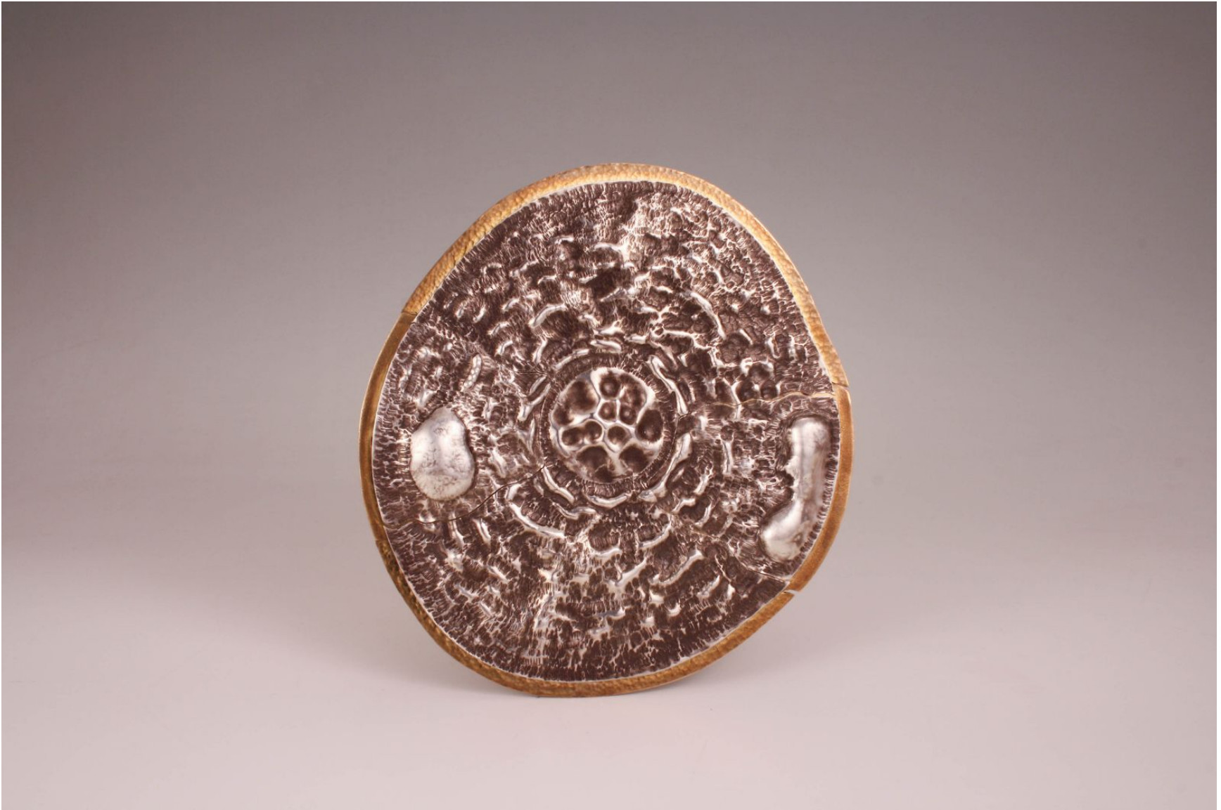
Figure 1: Disperse