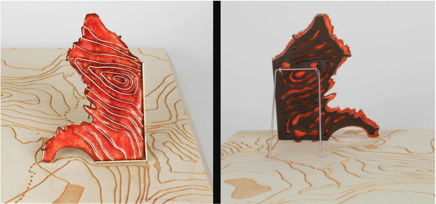
Figure 8: Siblings II