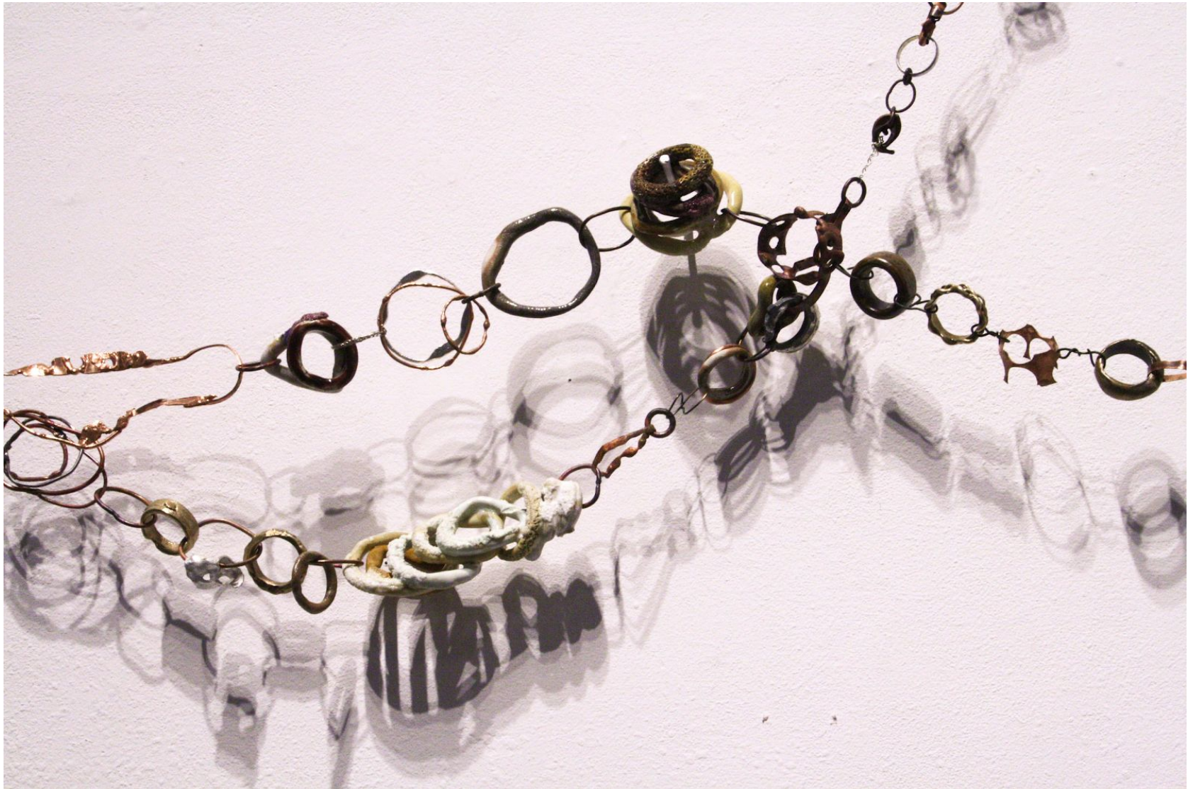
Figure 4: Links (detail)