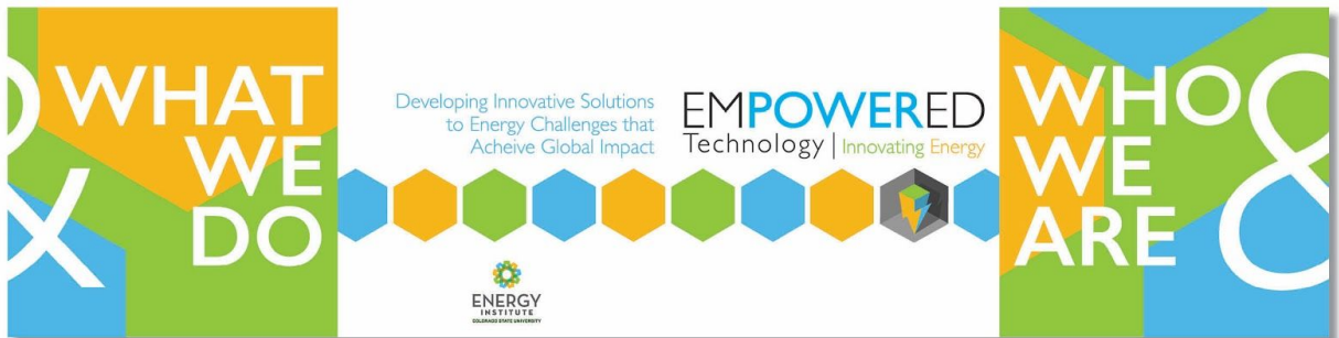
Figure 8: Empowered Technology Brochure