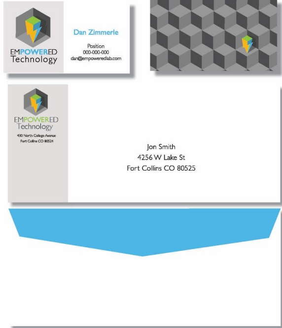
Figure 9: Empowered Technology Branding