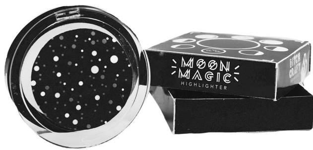
Figure 4: Bitchcraft Cosmetics