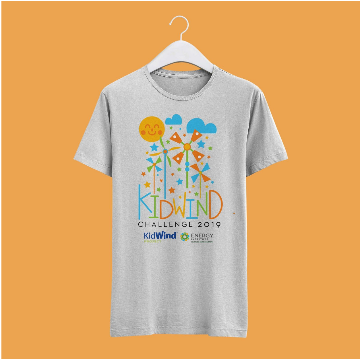
Figure 7: Kid Wind T-shirt