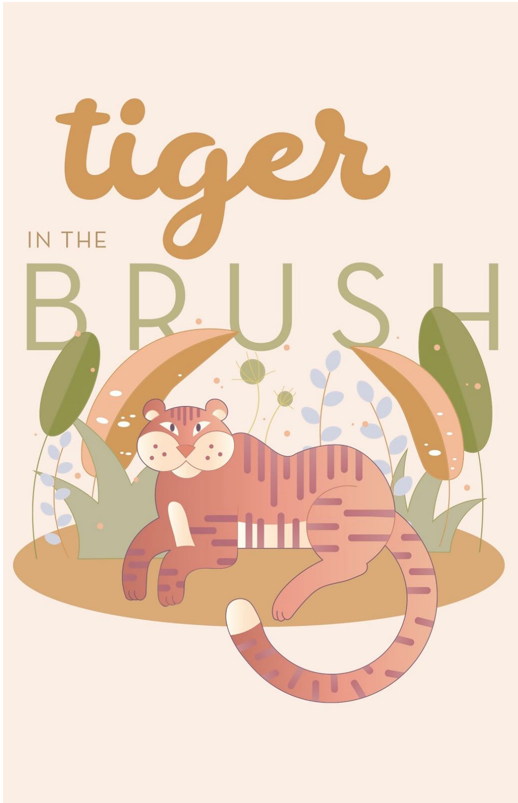
Figure 5: Tiger in the Brush