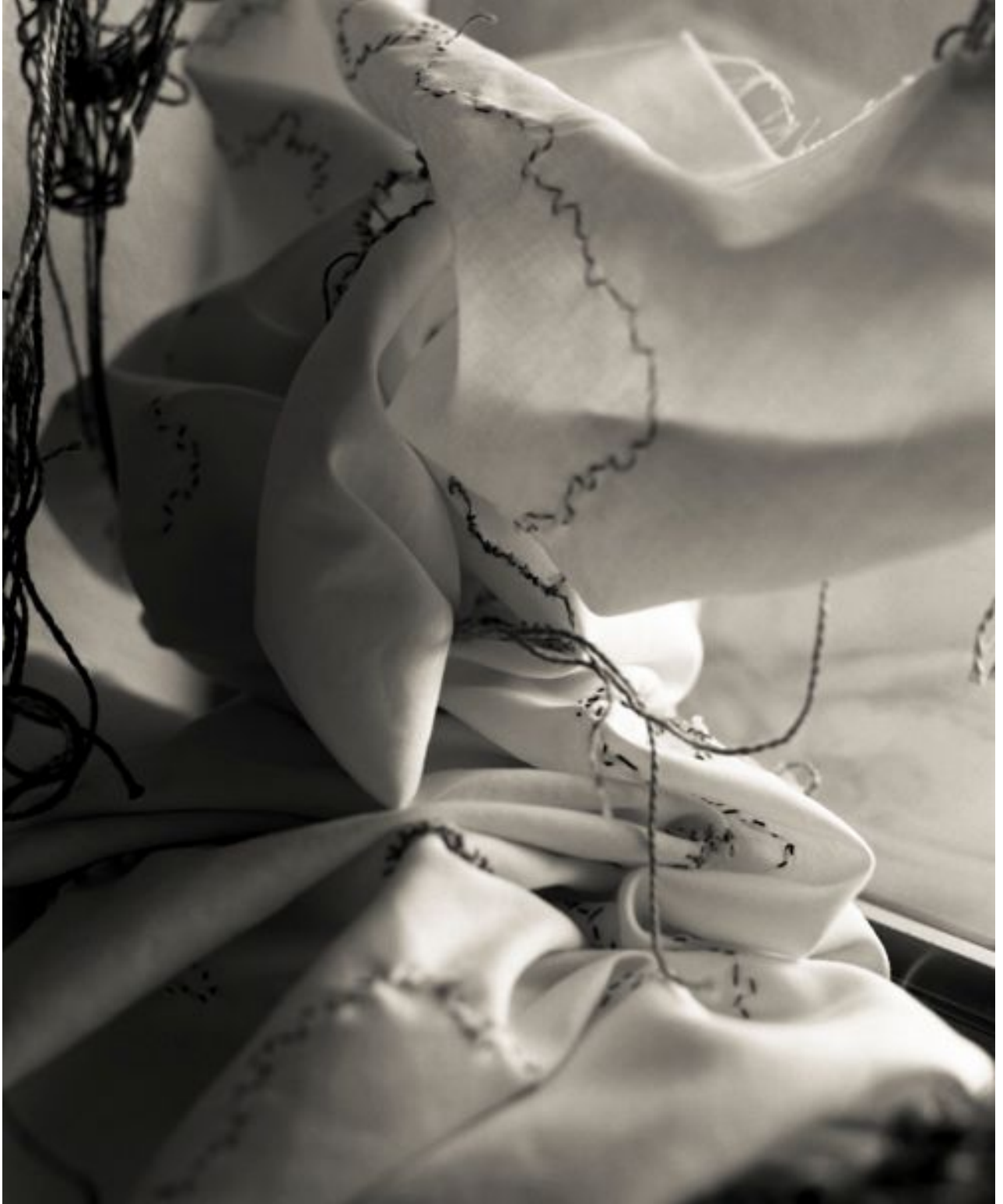
Figure 9 Untitled