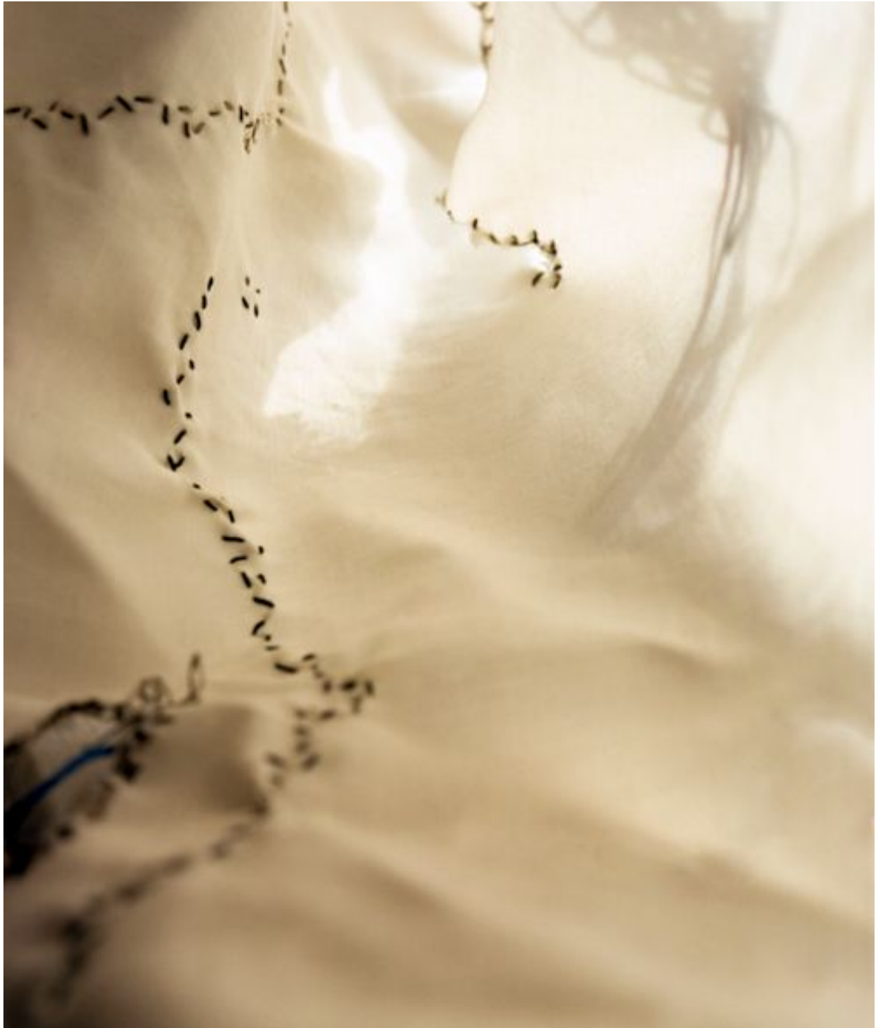
Figure 12 Untitled