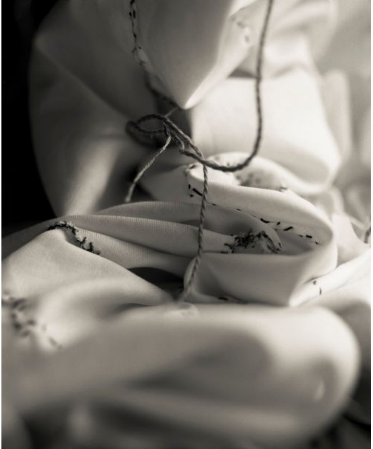
Figure 11 Untitled