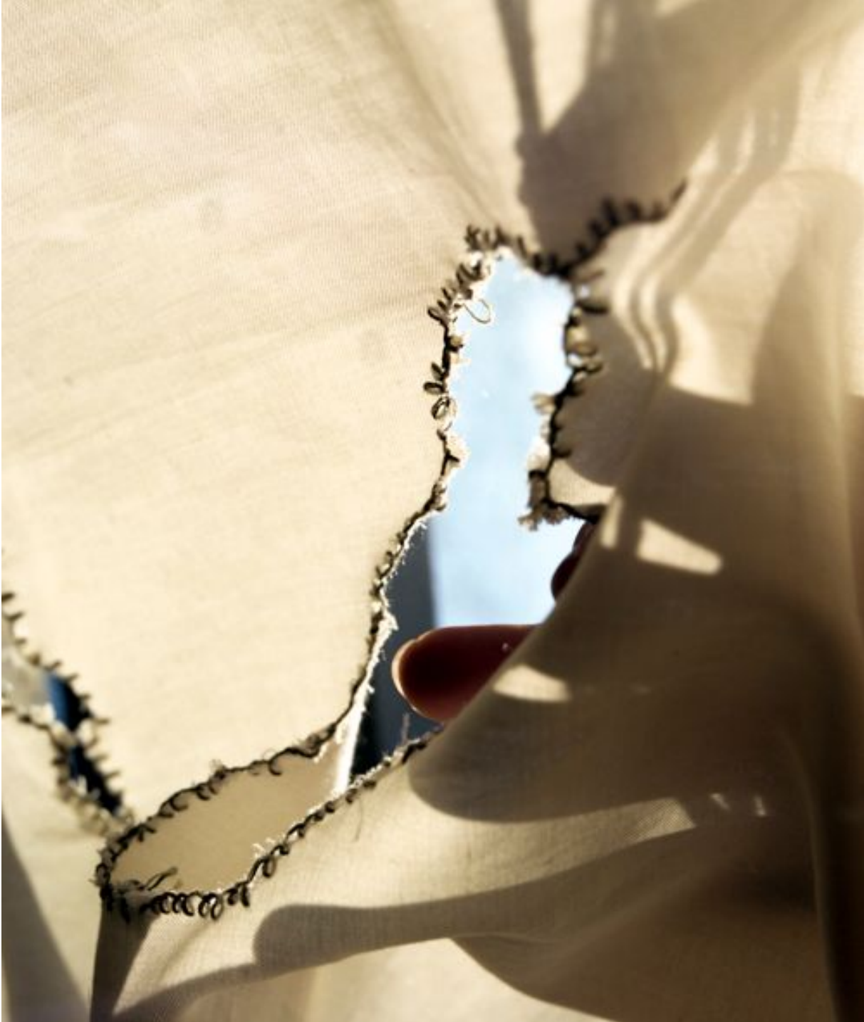
Figure 15 Untitled