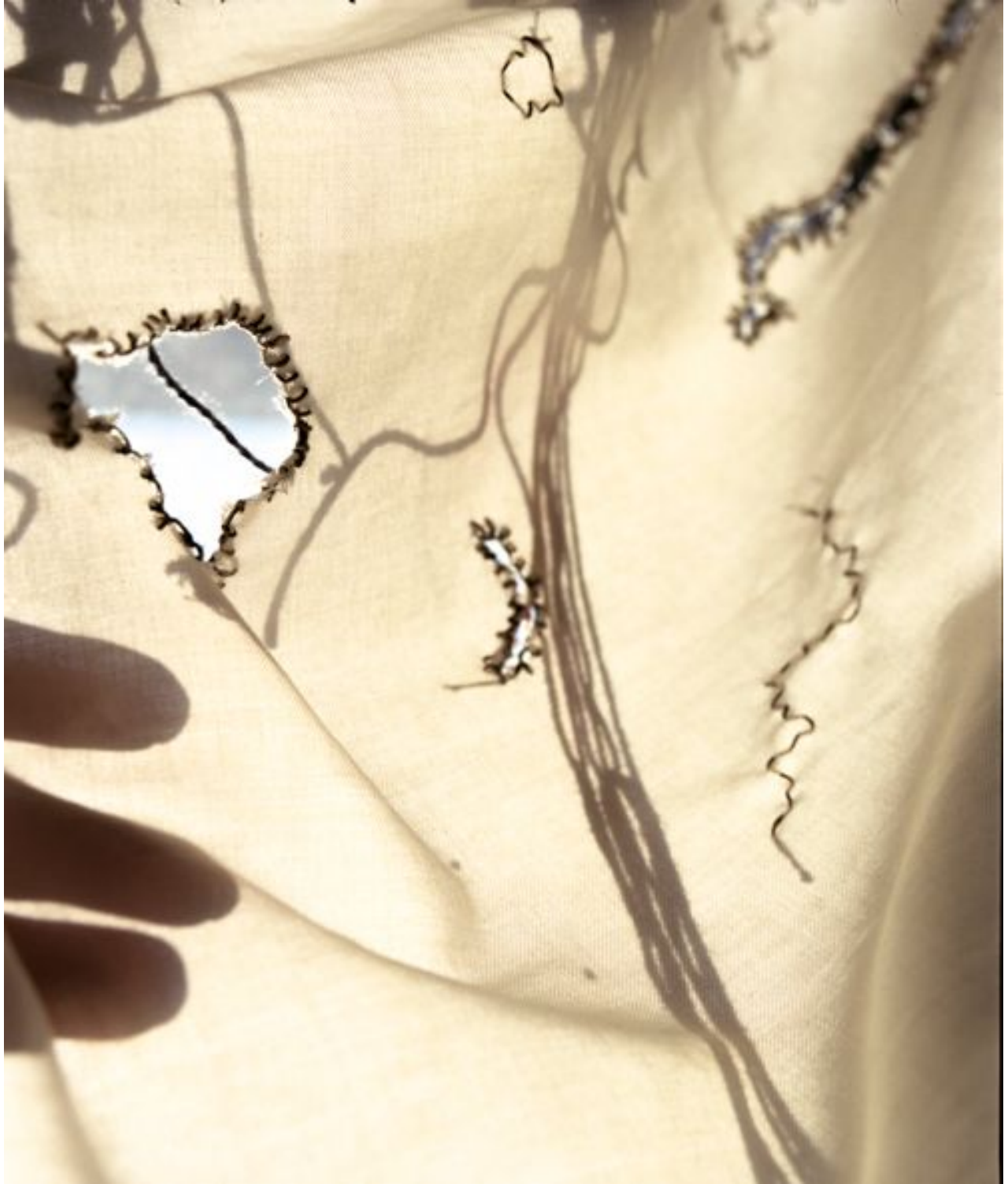
Figure 14 Untitled