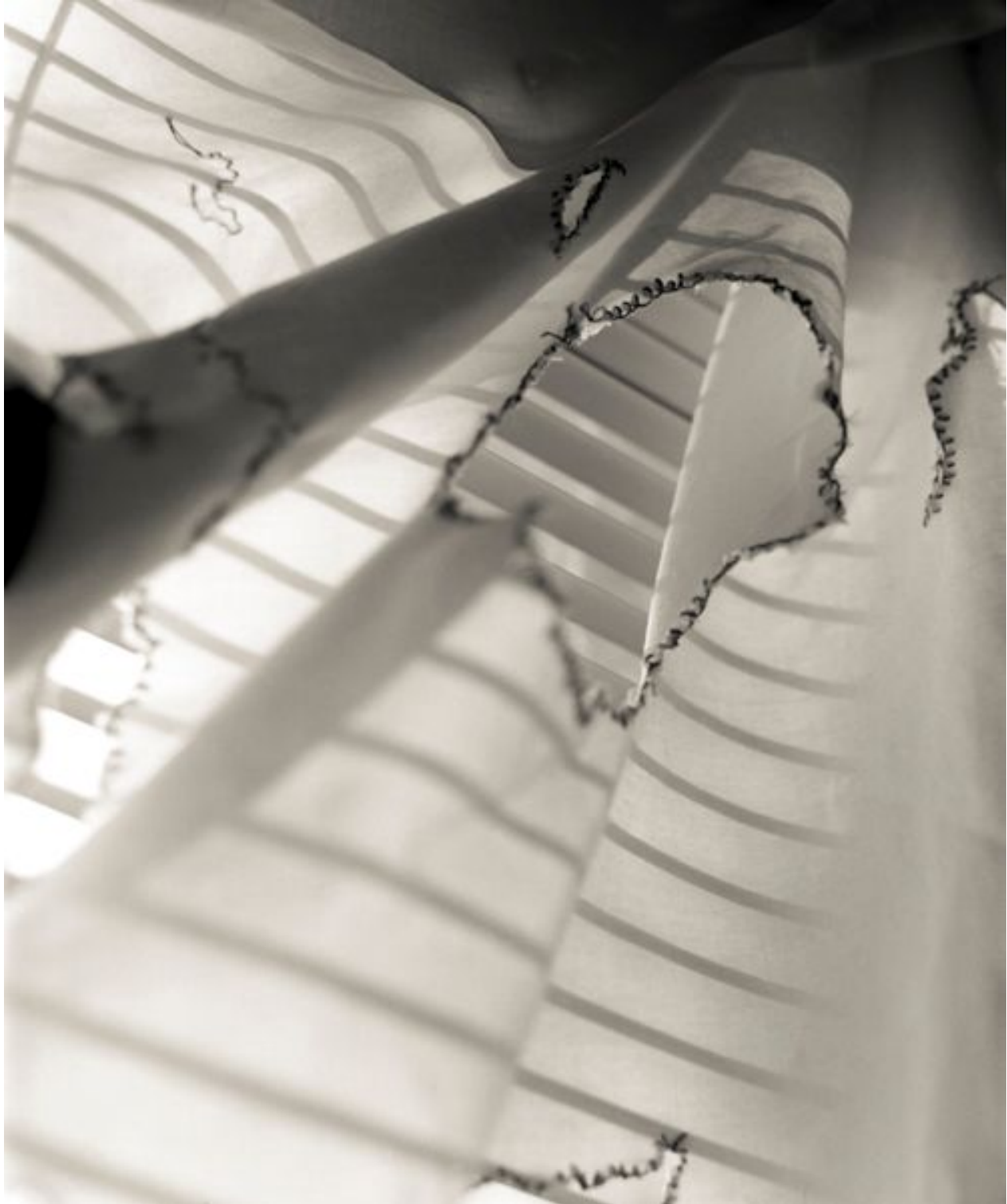
Figure 6 Untitled