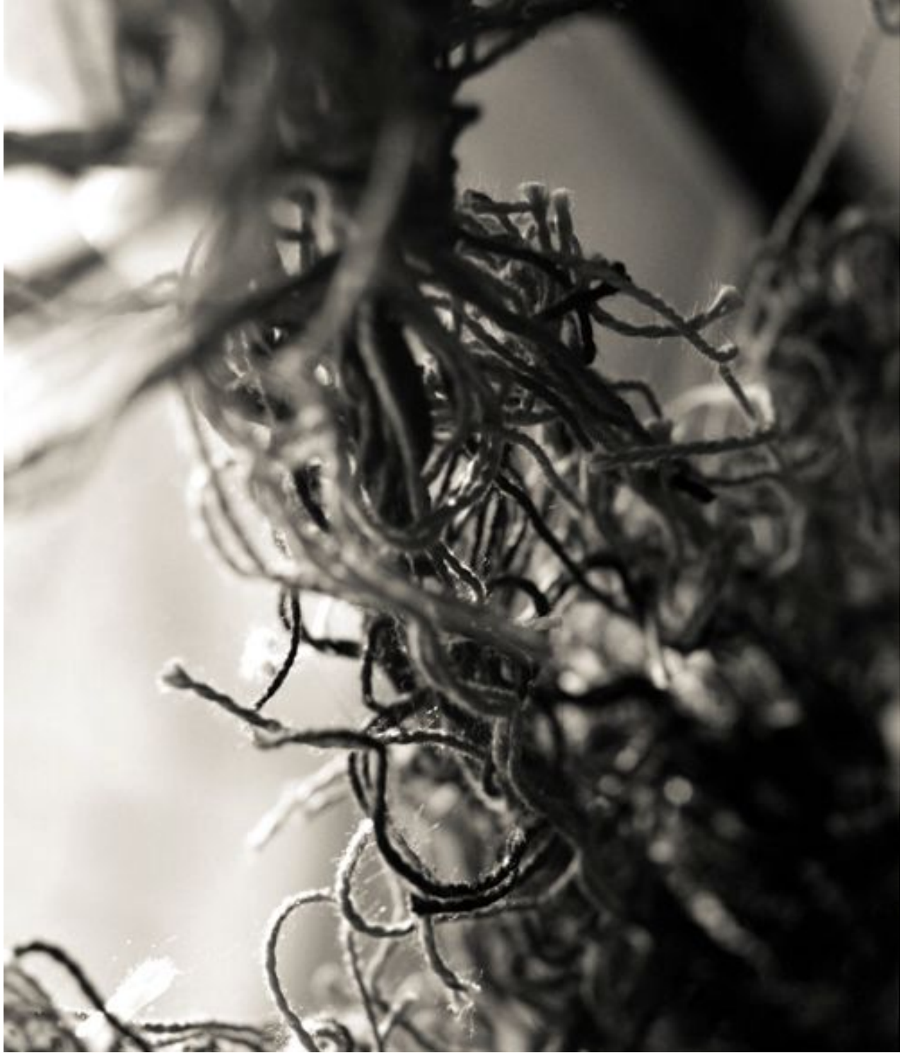
Figure 1 Untitled