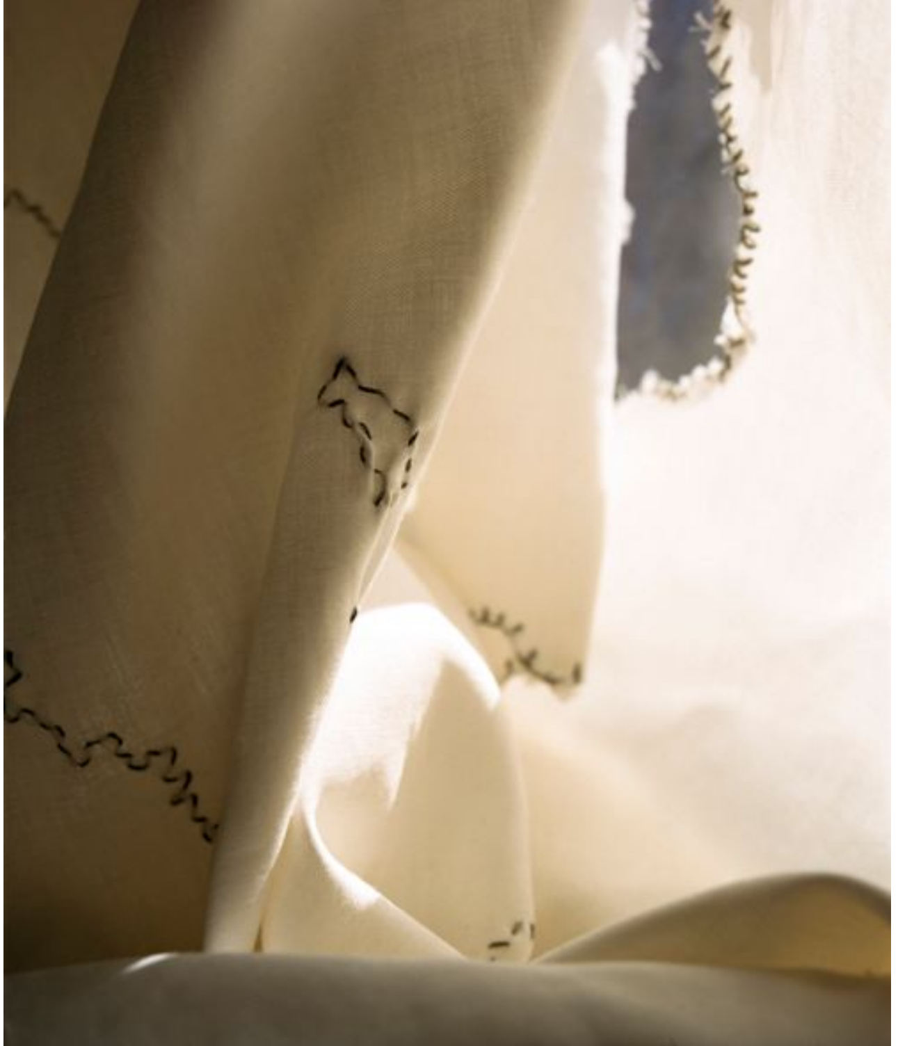
Figure 7 Untitled