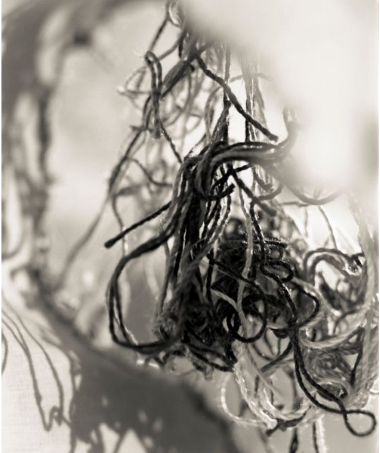
Figure 3 Untitled