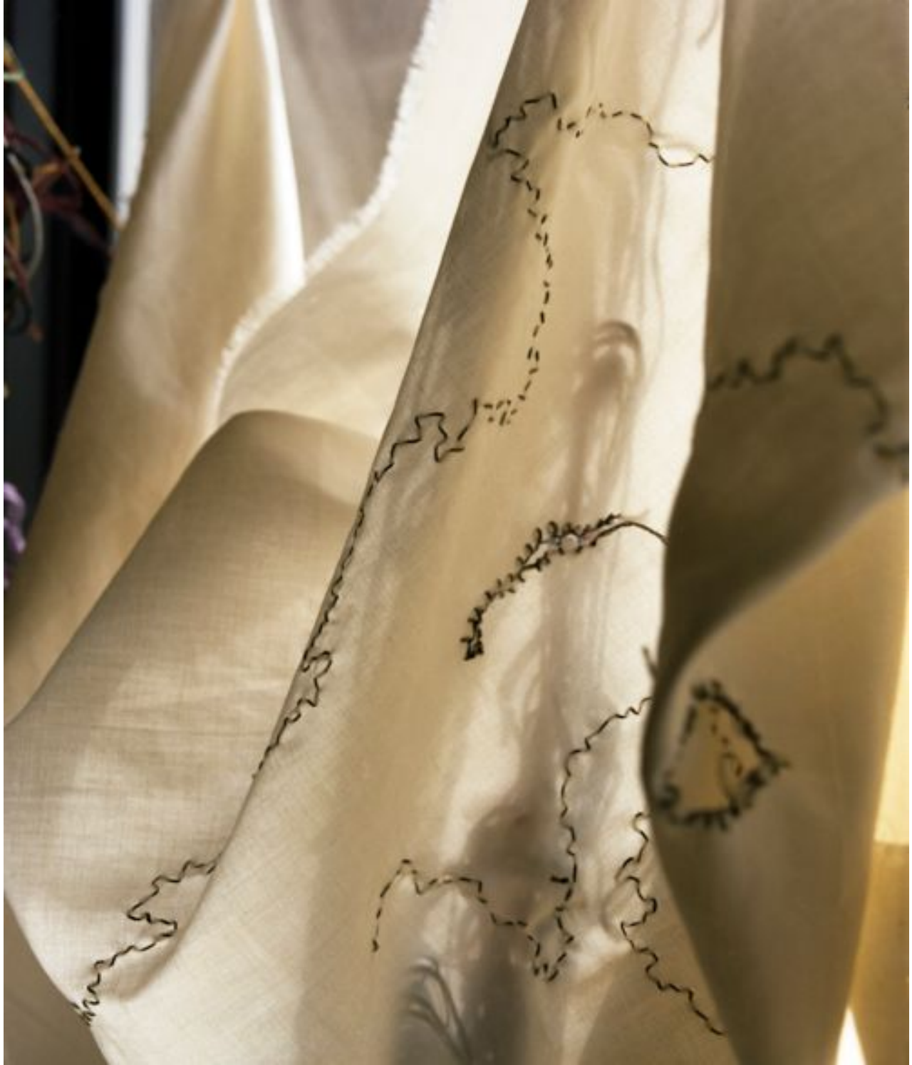
Figure 8 Untitled