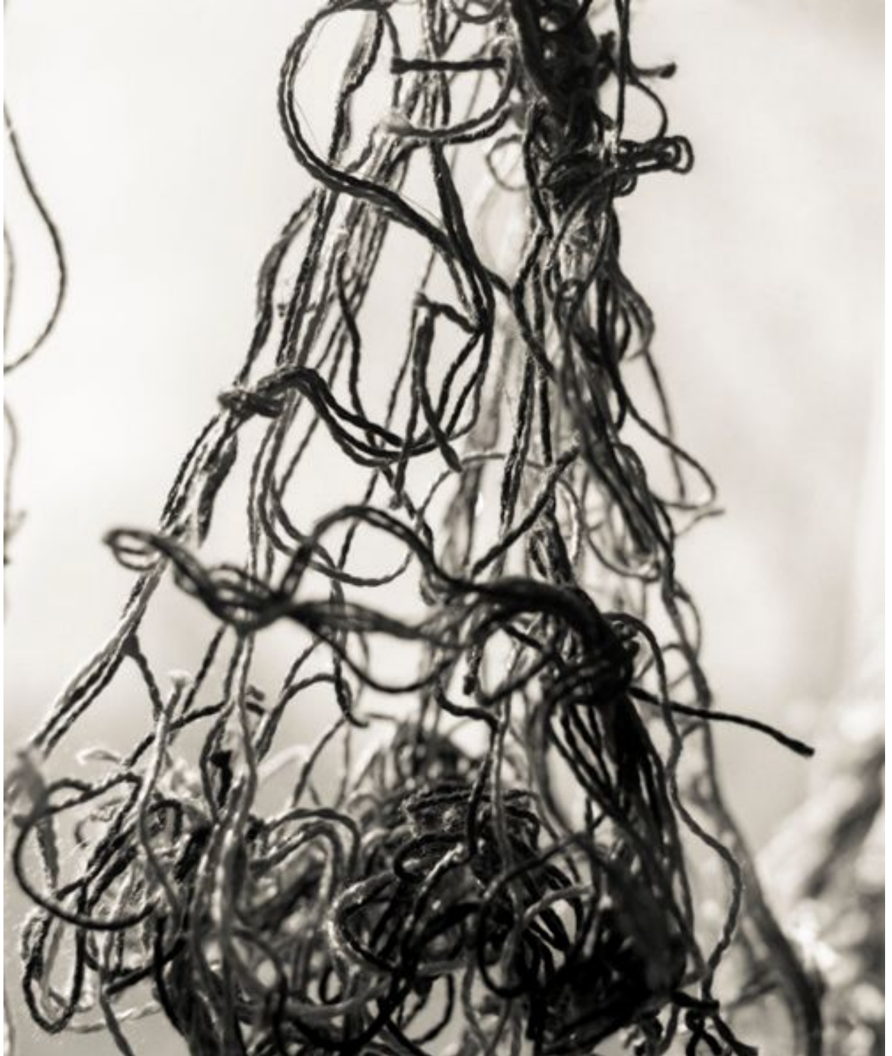
Figure 2 Untitled