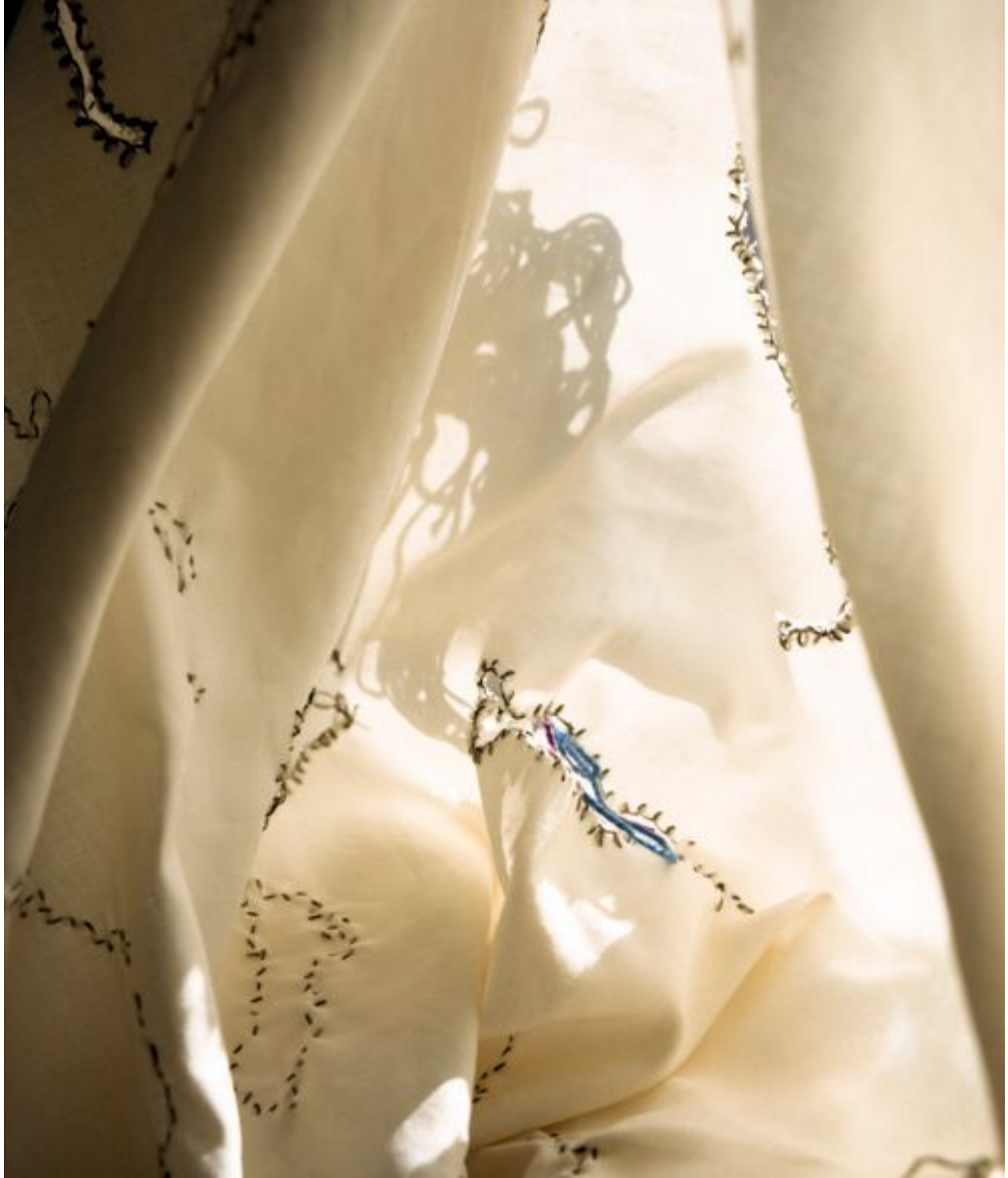
Figure 4 Untitled