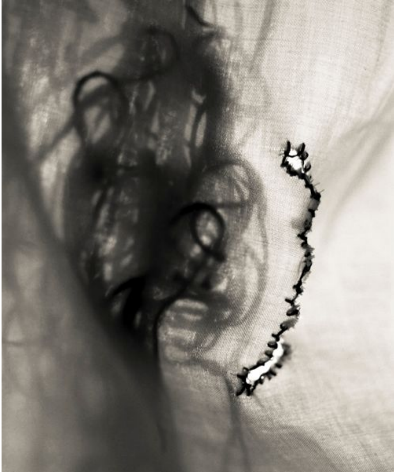
Figure 13 Untitled