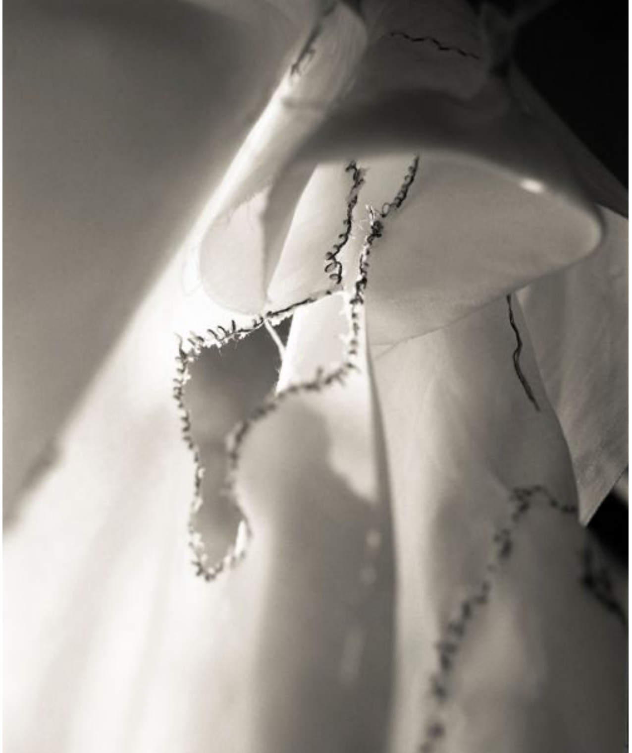
Figure 5 Untitled