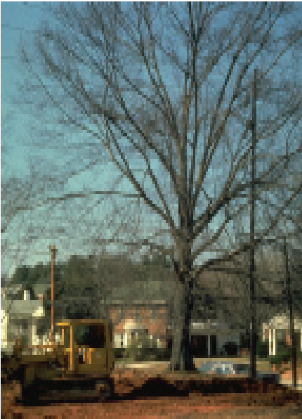
Figure 3: Root destruction, soil removal and soil compaction from construction equipment.