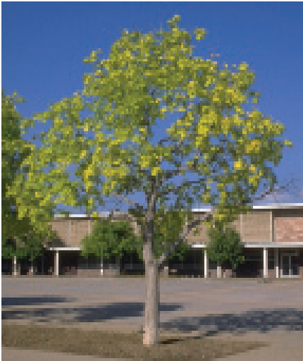
Figure 5: Yellow, chlorotic foliage from root disease.