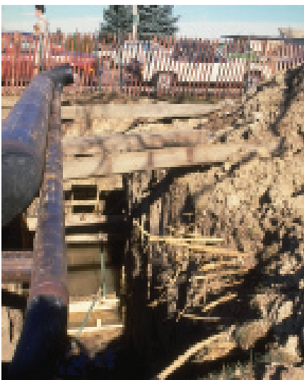
Figure 4: Trenching can severely injure a tree. Instead, auger under roots.

and soil temperature all decrease. In some instances, hard, compacted soil (hardpans) can occur near the surface, which restricts root growth.