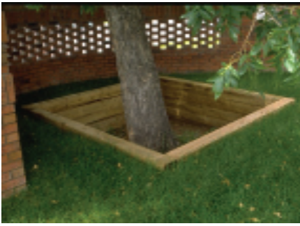
Figure 2: Tree wells cannot compensate for the addition of soil over tree roots.