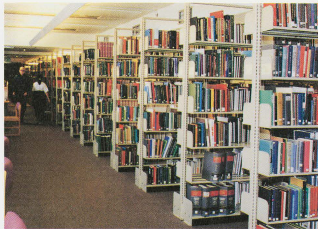
Gifts to replace books lost in the July disaster are already beginning to fill the shelves.

Donations will never completely replace the damaged collections, yet a definite legacy will be in place for library users. Because of these donations, a large number of damaged books and journals will never have to be restored, having been replaced by gifts. Since many materials received as gifts have never been owned by the Library, the collections will be enriched. Most important to the University is the goodwill of thousands of donors who have contributed