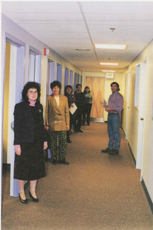
Reference staff look forward to meeting with you in their new offices.