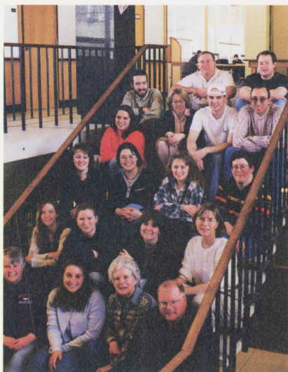
ILL staff at the top