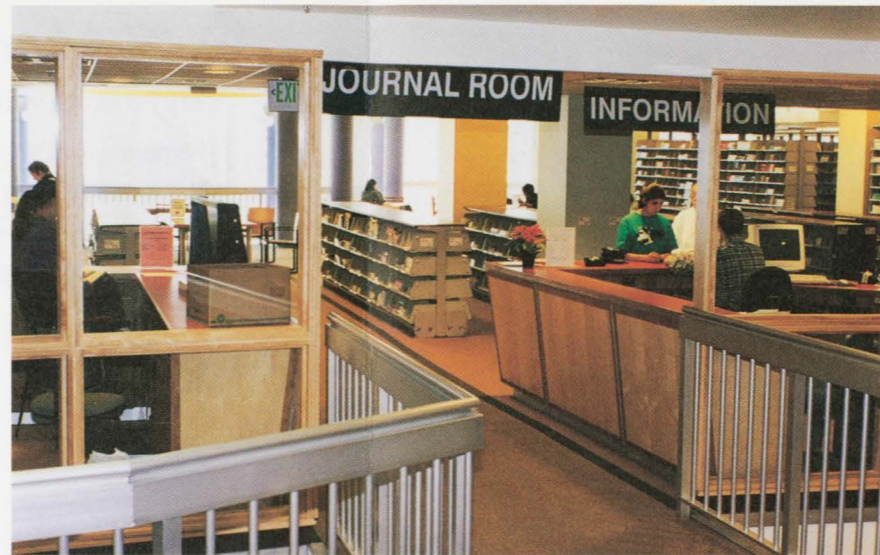
Warmth, light, and helpful assistance are all features of the new Journal Reading Room.