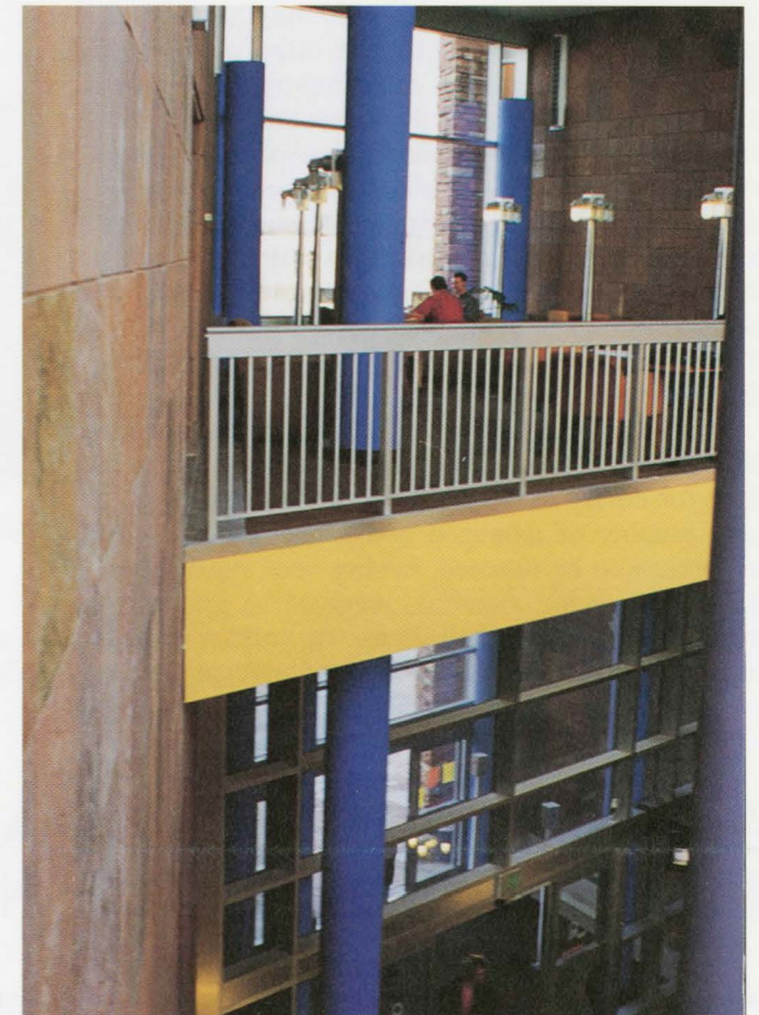
The new building provides more space for study and quiet reflection.