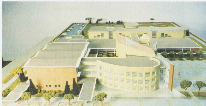
Photo of scale model of renovated Morgan Library with new additions. View is from the east. The model is on display inside the entrance of Morgan Library.

The William E. Morgan Library is celebrating its 30th anniversary. It was dedicated on April 22, 1965. A special exhibit, "Morgan Library – 30 years," in honor of the occasion will open April 10, 1995 and run through April 30 in the library exhibit galleries. A special celebration is being planned to take place on the library plaza on Friday, April 21.