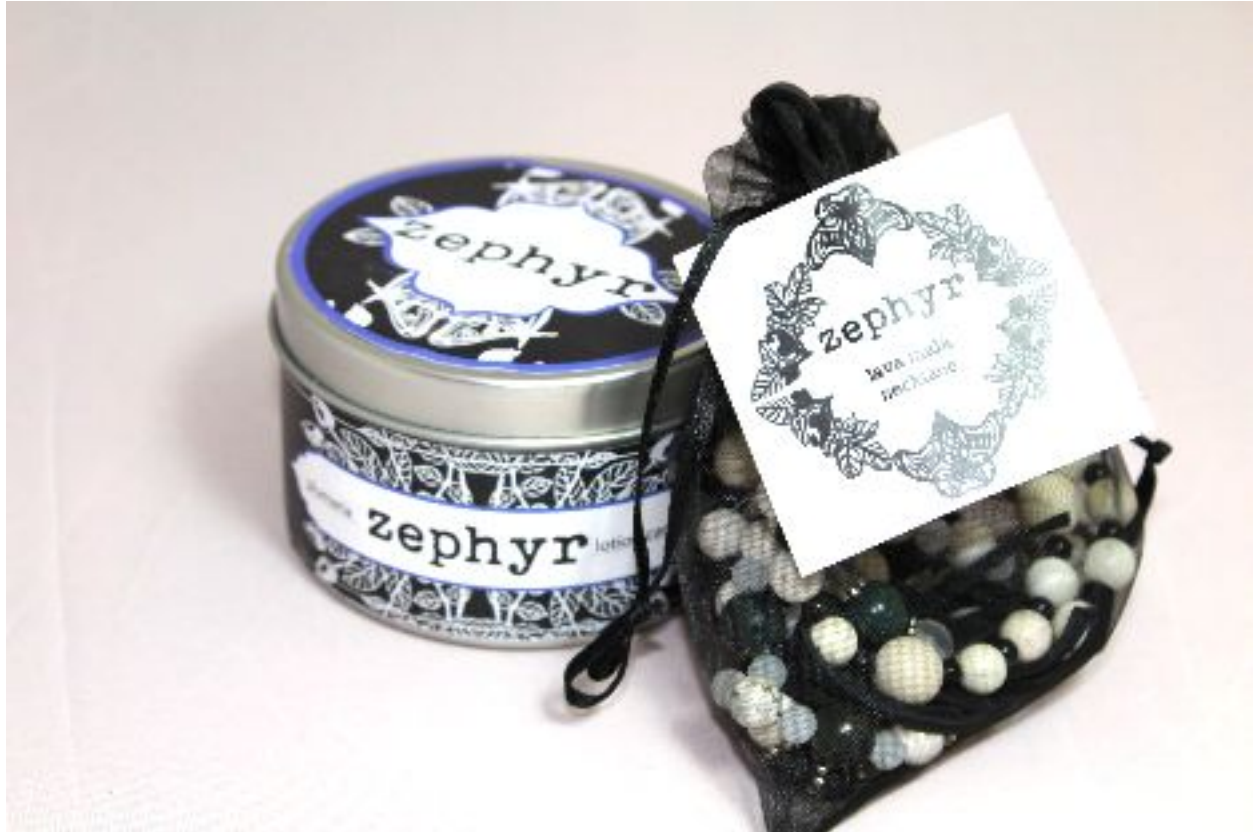
Figure 2: Zephyr Apothecary Packaging