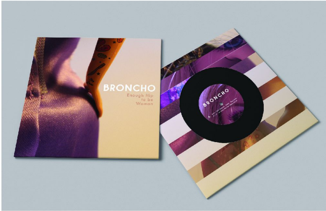
Figure 1: Broncho Album Redesign (Detail 2)