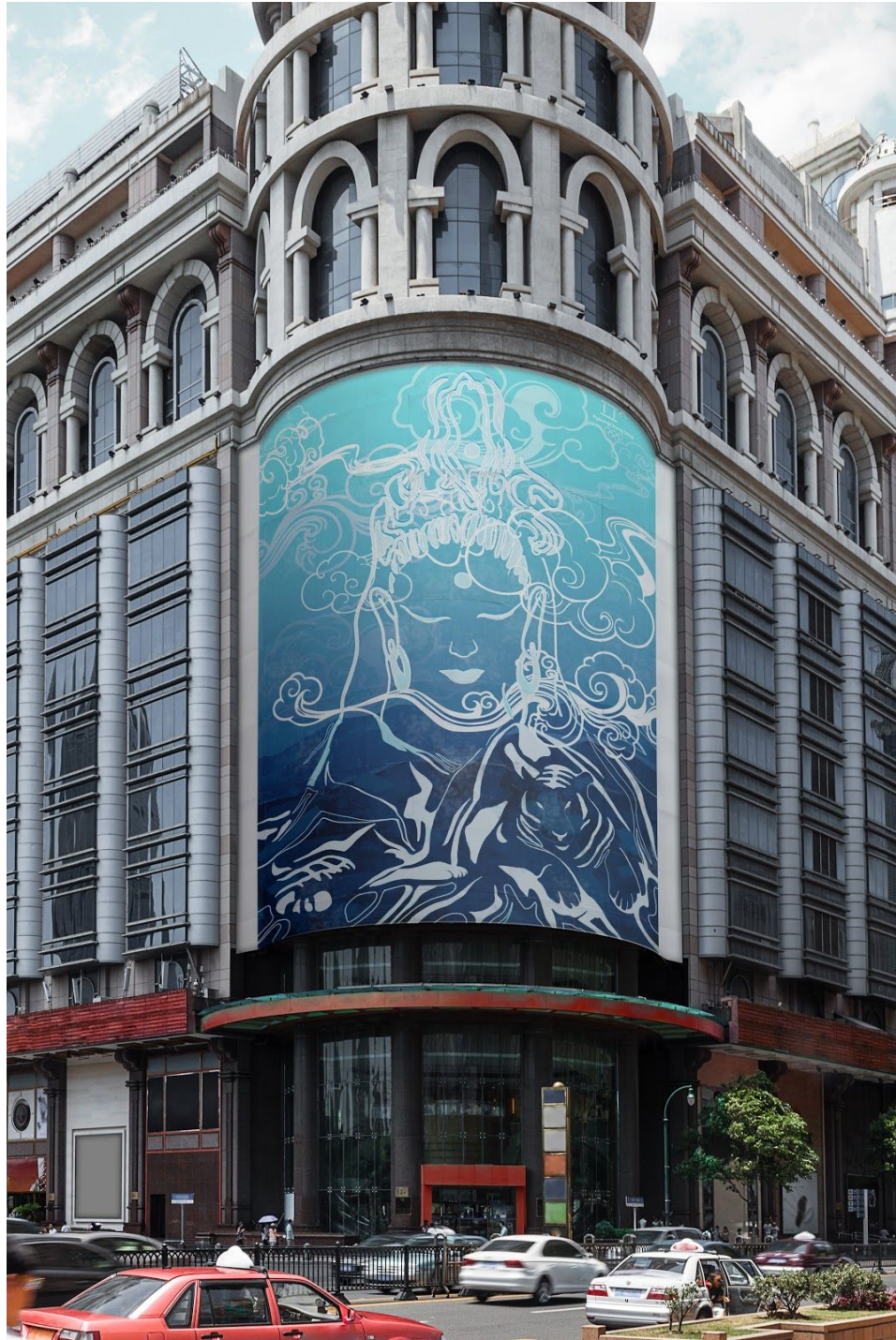
Figure 7: Olympic Mural