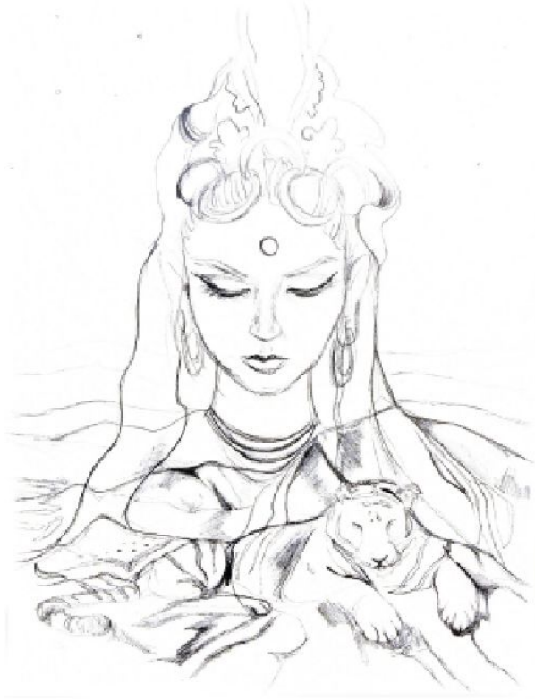
Figure 8: Olympic Mural Sketches