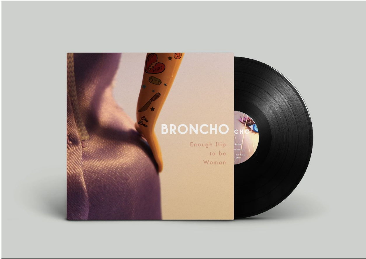
Figure 1: Broncho Album Redesign (Detail 1)