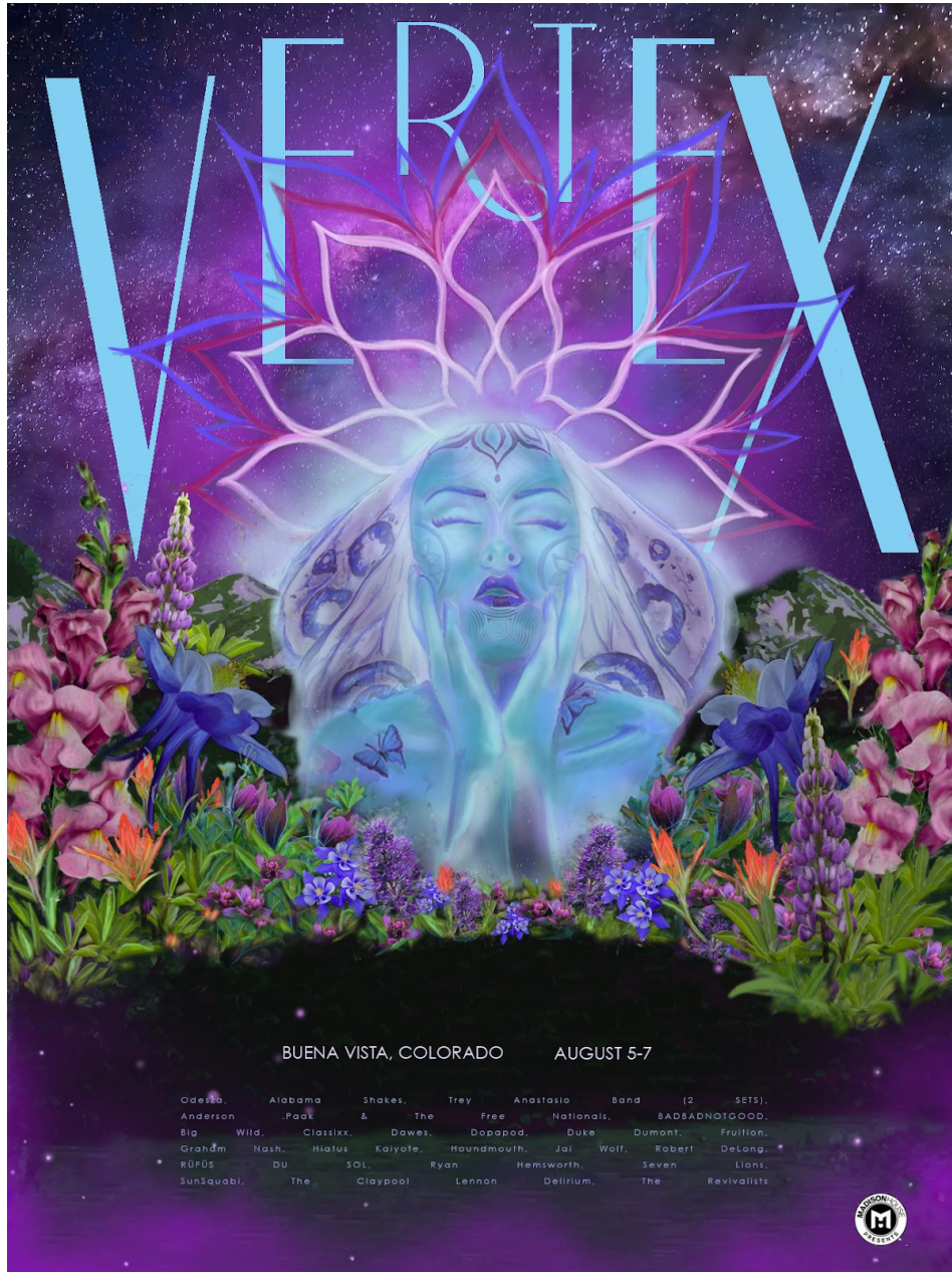
Figure 3: Vertex Music Festival Poster