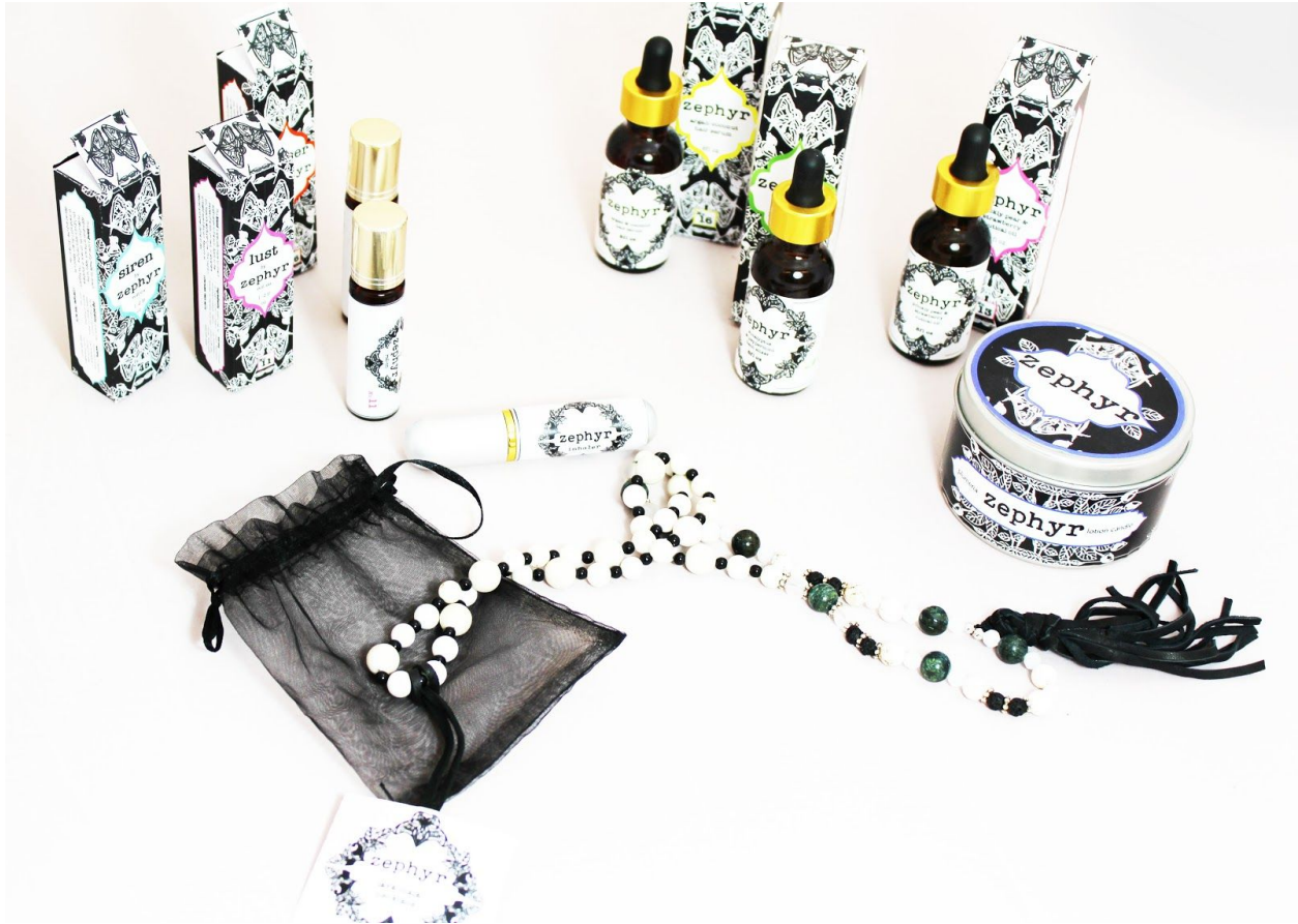
Figure 3: Zephyr Apothecary Full Product Line