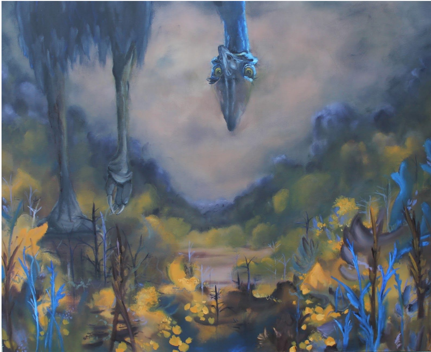
Figure 10: 7/17/17