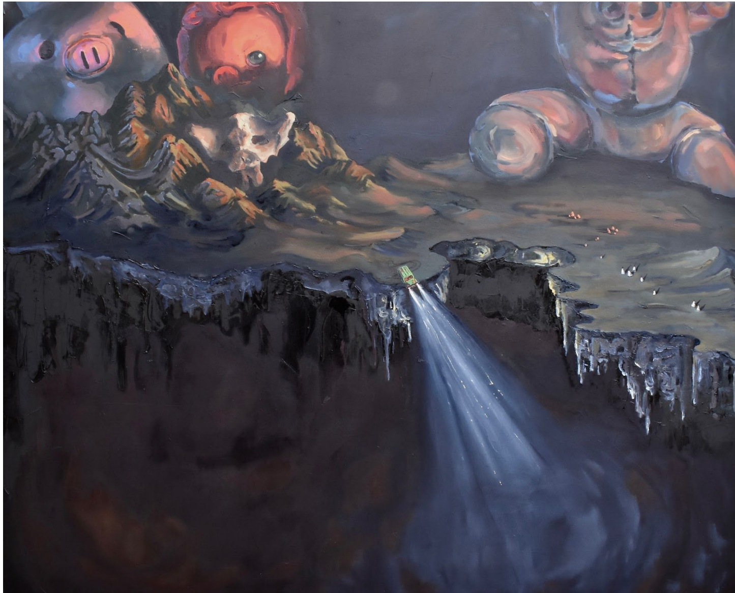
Figure 4: Mom's reoccurring dream, dates unknown