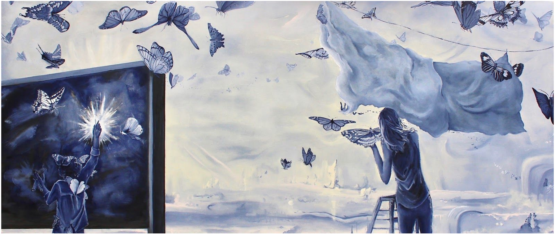
Figure 1: 9/2/17 and 11/26/18