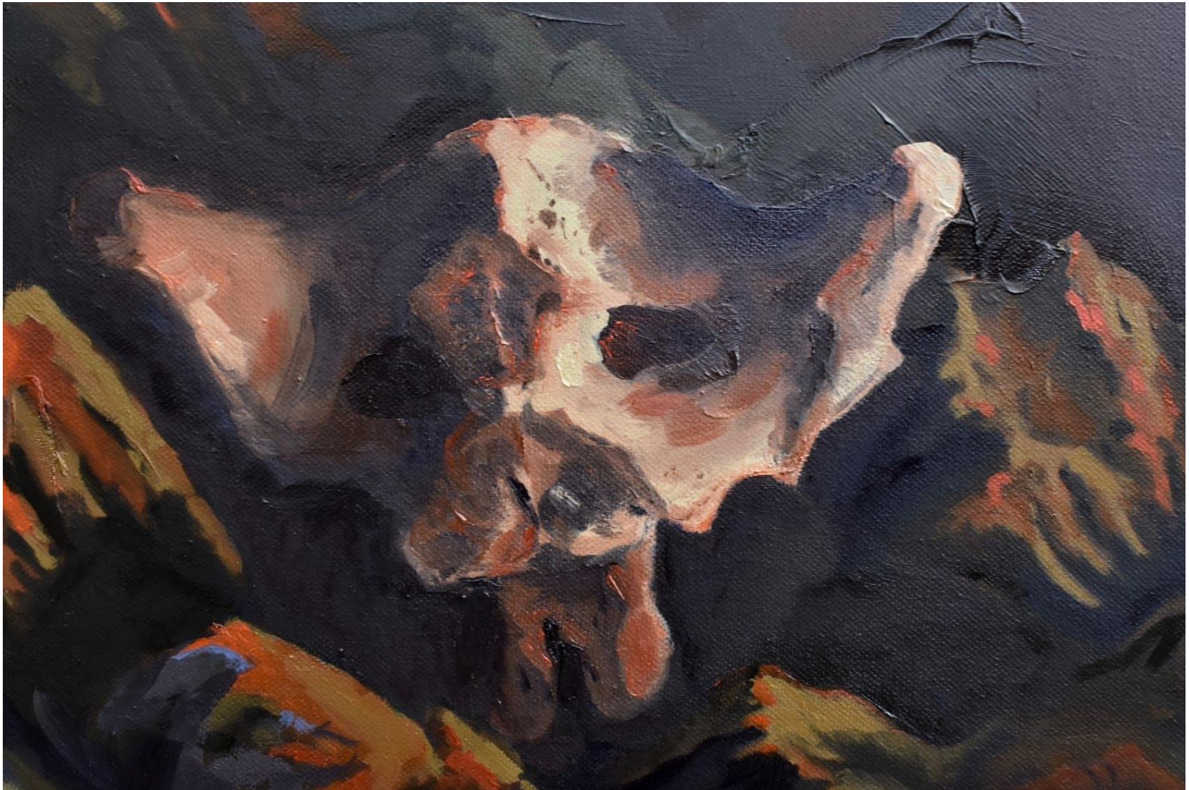
Figure 6: Mom detail 2