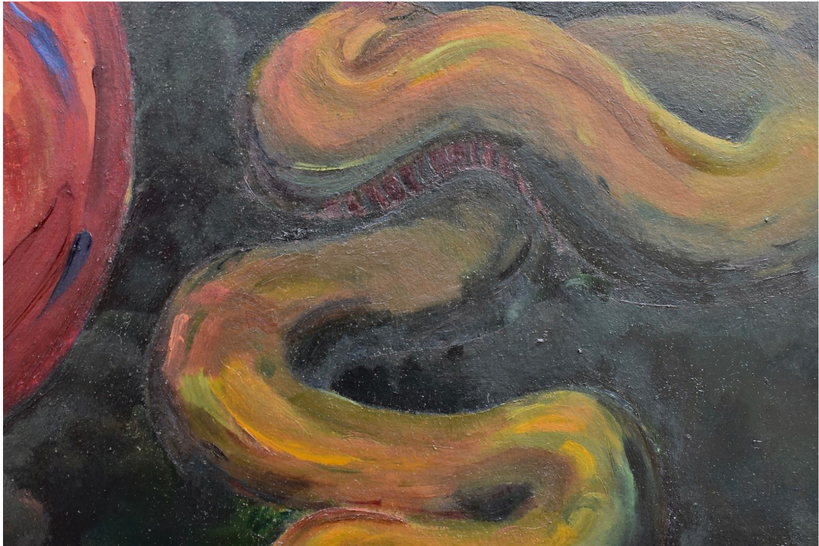
Figure 8: 4/12/18 and 9/3/18 detail 1