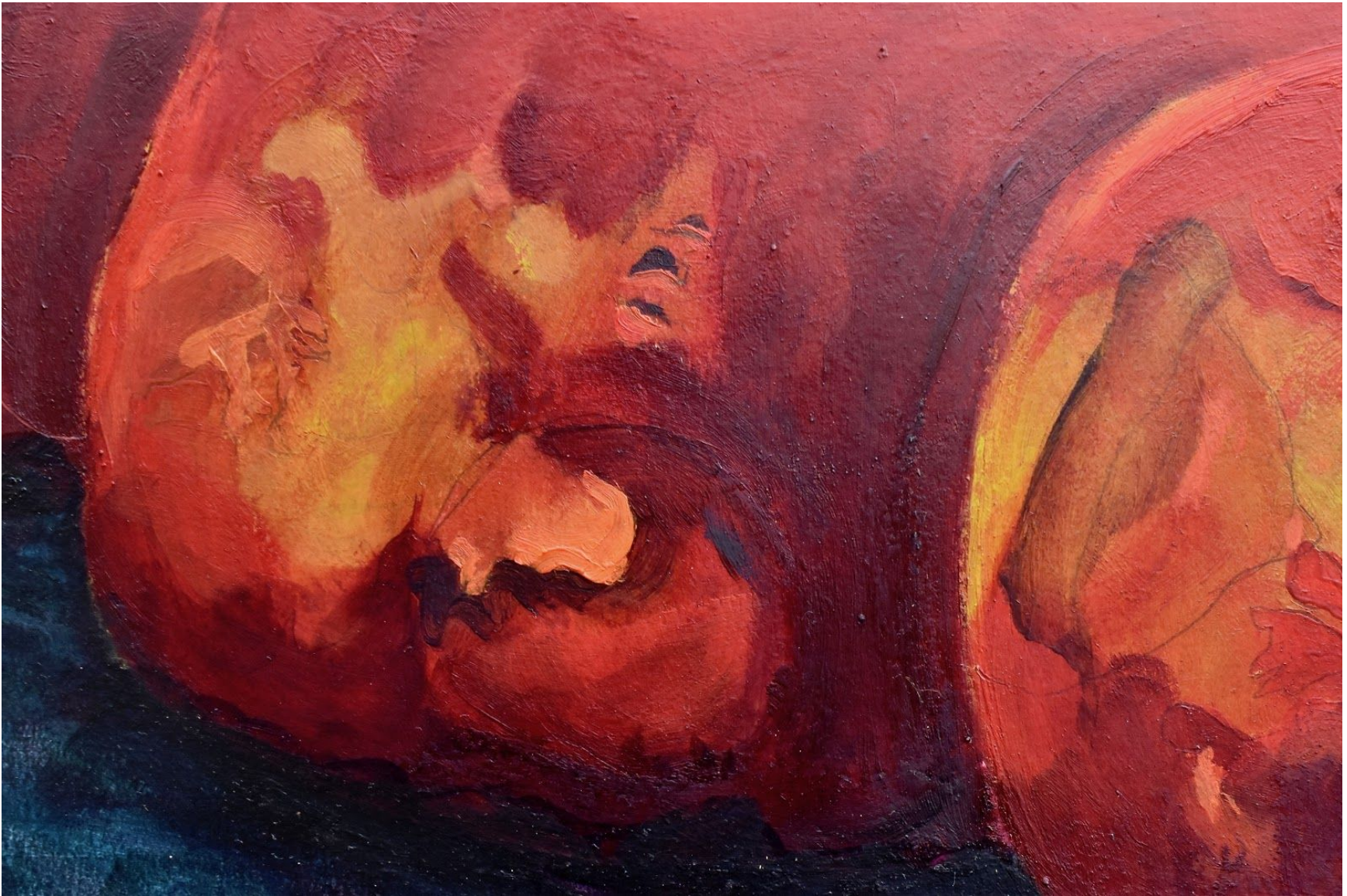
Figure 9: 4/12/18 and 9/3/18 detail 2