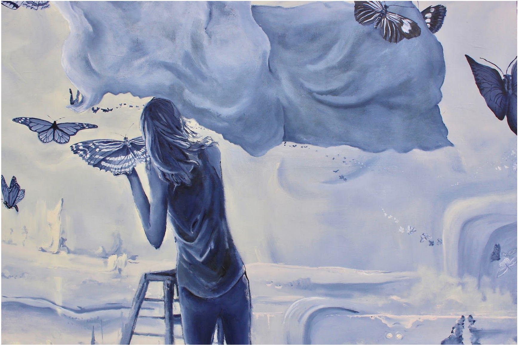
Figure 3: 9/2/17 and 11/26/18 detail 2