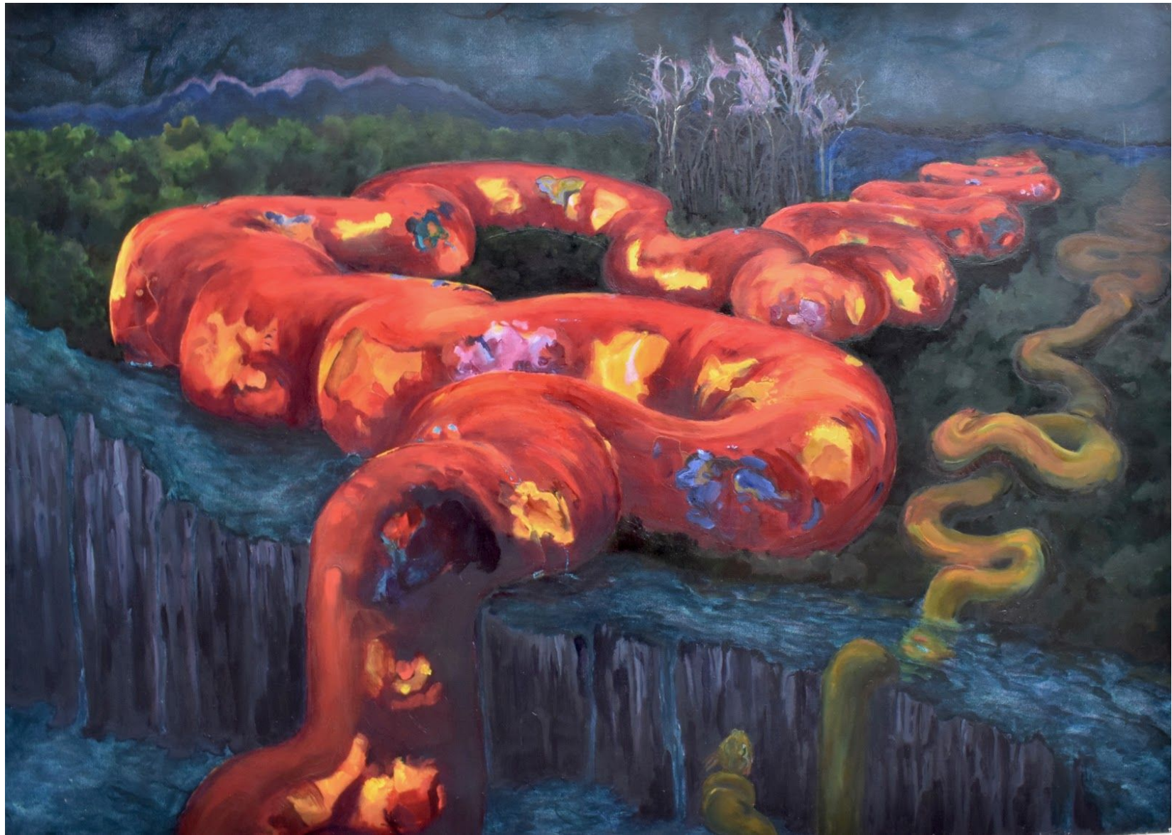
Figure 7: 4/12/18 and 9/3/18