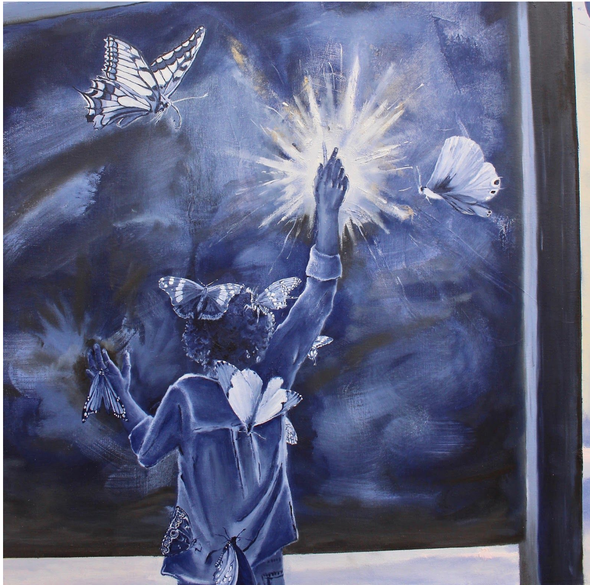
Figure 2: 9/2/17 and 11/26/18 detail 1