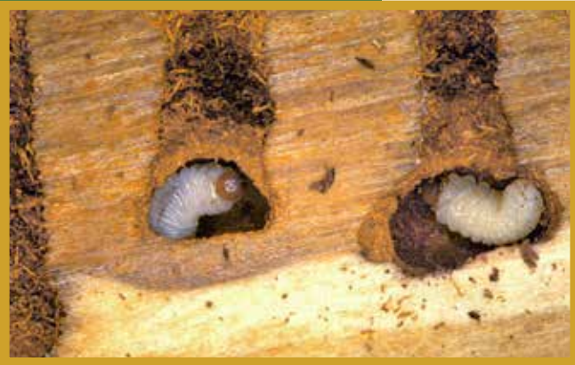
Figure 3. Douglas-fir beetle larvae underneath the bark.