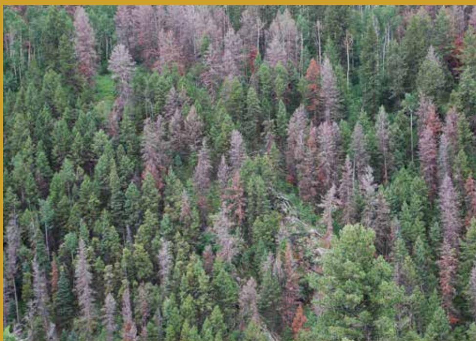
Figure 14. Beetle-killed trees in the Black Canyon of the Gunnison.

Douglas-fir beetle is a native insect, playing an integral part in Colorado's mixed-conifer ecosystems. But the beetle is capable of killing many trees over large areas, and adverse effects may result: