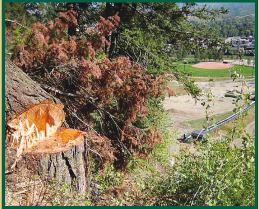
Figure 15. Beetle-killed trees can be hazardous, especially in recreation areas or places that people frequent, and often need to be removed.

Colorado's forests provide clean air and water, wildlife habitat, world-class recreational opportunities, wood products and unparalleled scenery. These benefits contribute to quality of life and are vital to state and local economies. Without careful management of forest resources, these assets and community safety are at risk. It is critical to proactively manage forests, and for landowners and communities to remain informed about related threats, to ensure healthy, resilient forests for present and future generations.