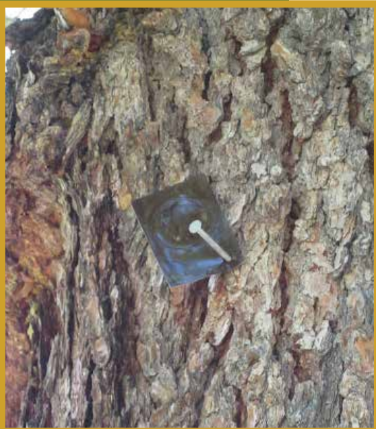
Figure 10. An MCH pheromone packet.

Packets containing the pheromone Methylcyclohexanone (MCH) disrupt the attraction of incoming beetles and can be used to reduce attacks on Douglas-fir trees. Packets are attached to un-infested trees and should be applied to trees before adult beetles begin to emerge, which in Colorado is typically April or May. These packets can be purchased through retail vendors, but it is recommended to work with a local forester to assist in designing the layout for pheromone application.