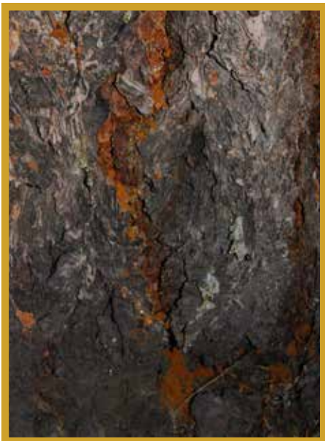
Figure 6. Boring dust from beetles entering a tree.