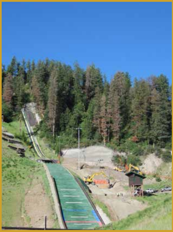
Figure 13. Douglas-fir beetle-killed trees at the Howelsen Hill Ski Area in Steamboat Springs.

under the bark must reach a minimum of 110 degrees F for this treatment to effectively reduce beetle populations, and turning the logs periodically is essential for all of the bark to reach this temperature. Solar treatments can be challenging, because forests with Douglas-fir often are cool, moist and shady, without ample sunlight. Talk to your local CSFS forester to determine if this is an appropriate treatment for your area.