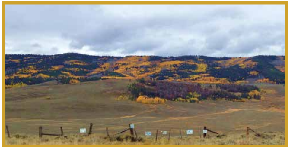
Figure 17. Among aspen stands are forested areas with Douglas-fir beetle-kill in the West Elk Mountains near the West Elk Wilderness.