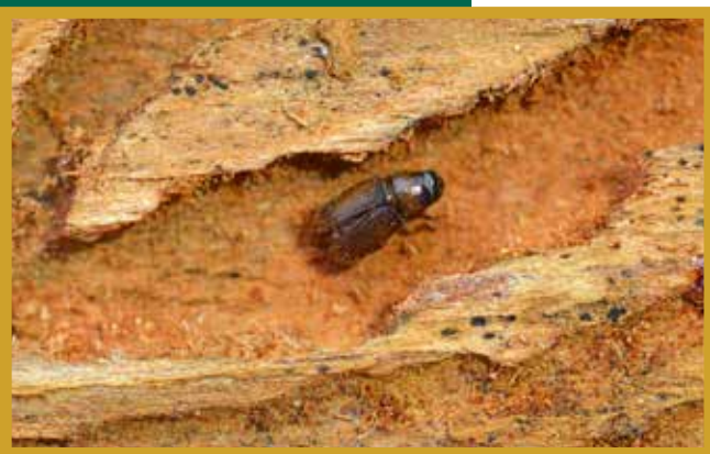
Figure 4. An adult Douglas-fir beetle.