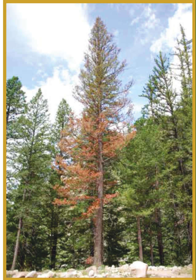
Figure 1. A tree killed by Douglas-fir beetle.

In Colorado, outbreaks typically occur in the southern part of the state, especially in portions of the Rampart Range, Wet Mountains, Sangre de Cristo/Culebra ranges, La Garita Range, West Elk and Elk mountains, and the southern slopes of the San Juan Mountains.