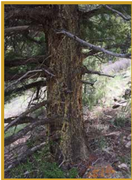
Figure 7. Resin streaming from a Douglas-fir tree.