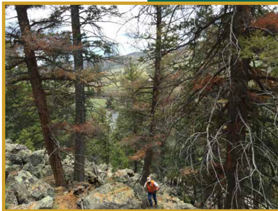
Figure 8. Douglas-fir trees often grow on steep terrain, creating management challenges.

Natural enemies of Douglas-fir beetle include a variety of parasitic wasps, flies and predatory beetles. Some mites and nematodes also parasitize various life stages of the beetle, and woodpeckers will strip bark from infested trees in search of developing insects. However, natural enemies tend to have little or no real effect on beetle populations during major outbreaks.