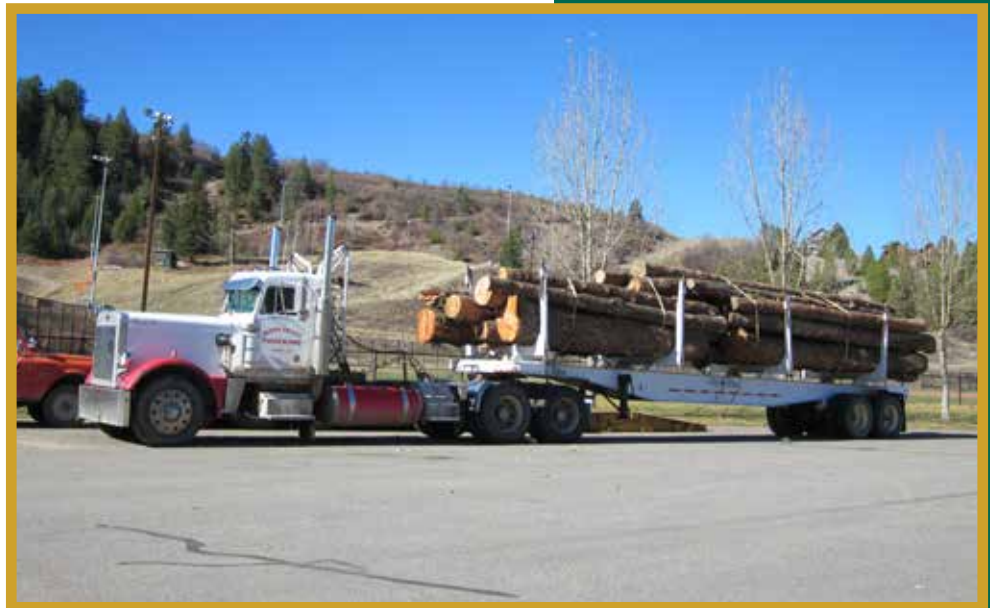
Figure 12. Trees removed due to Douglas-fir beetle attacks often can be processed into wood products.