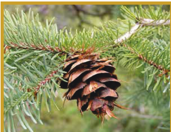
Figure 2. Douglas-fir tree cones are characterized by three-pronged "tails" jutting from between the scales.

This Quick Guide was produced by the Colorado State Forest Service to promote knowledge transfer.