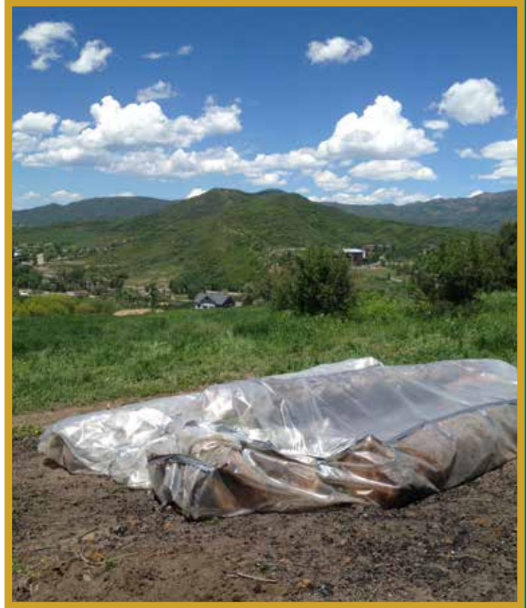
Figure 11. Solar treatments are a possible management option for beetle-killed trees, in areas with ample sunlight.

Solar treatments can be used to reduce Douglas-fir beetle populations in infested stands. These treatments involve felling infested trees and stacking cut logs in an area with full sun before covering them with clear plastic. The solar treatment of infested trees creates conditions unsuitable for survival of Douglas-fir beetles, forcing them to either relocate or die. The temperature